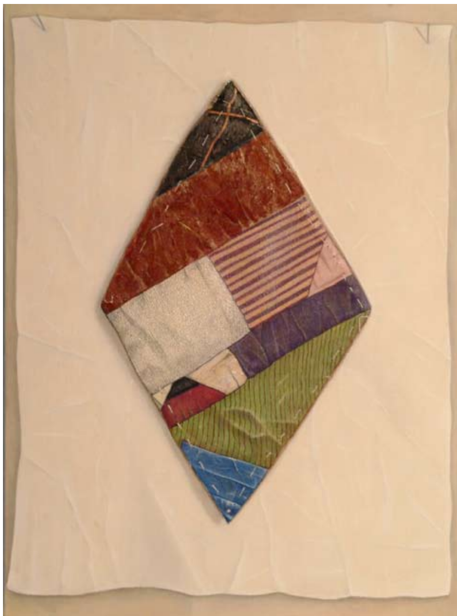
GRAPHITE DIAMOND, 2008 collage with oil, silk threads and gouache 16 x 12 inches