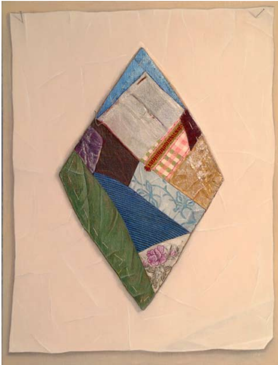
JADE DIAMOND, 2008 collage with oil, silk threads and gouache 16 x 12 inches