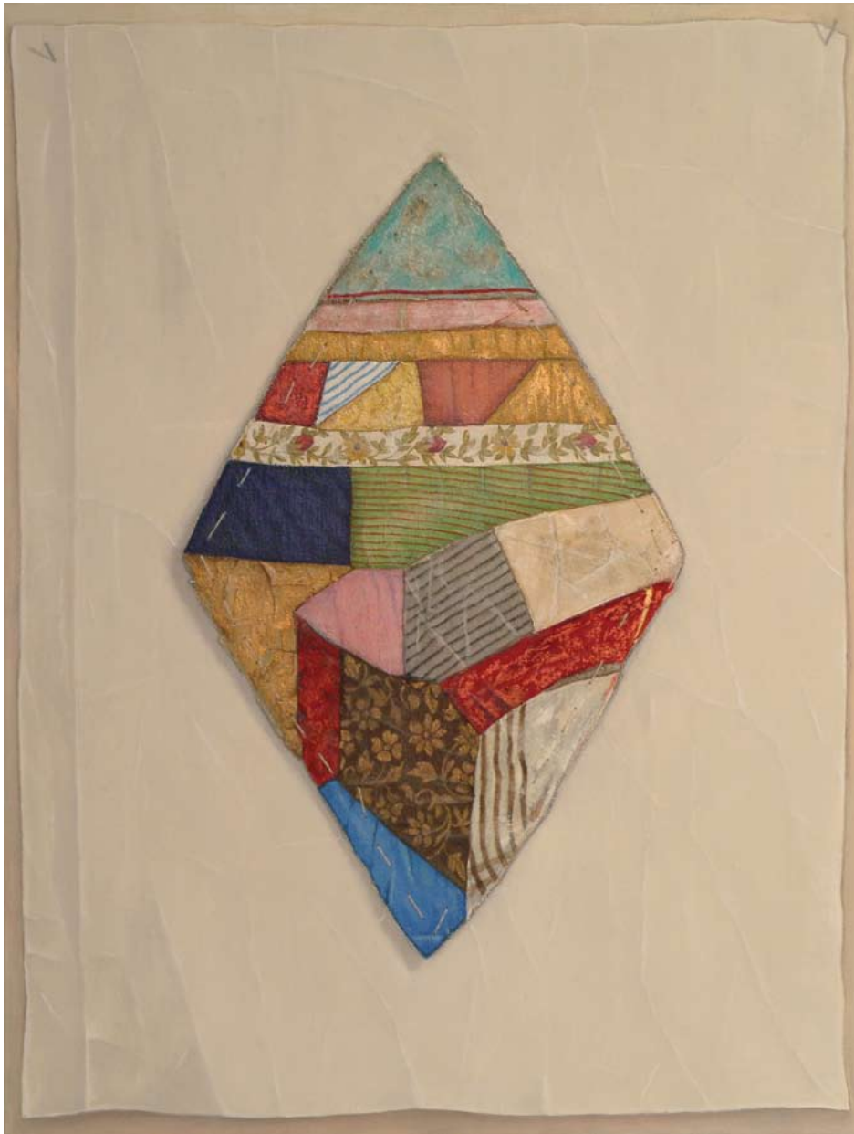
INDIGO DIAMOND, 2008 collage with oil, silk threads and gouache 16 x 12 inches