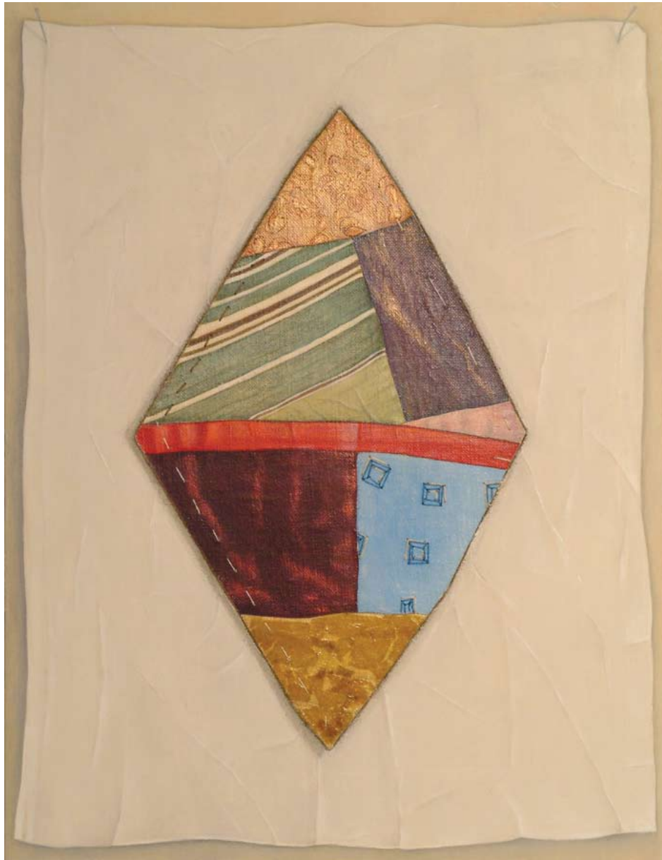
VERMILLION DIAMOND, 2008 collage with oil, silk threads and gouache 16 x 12 inches