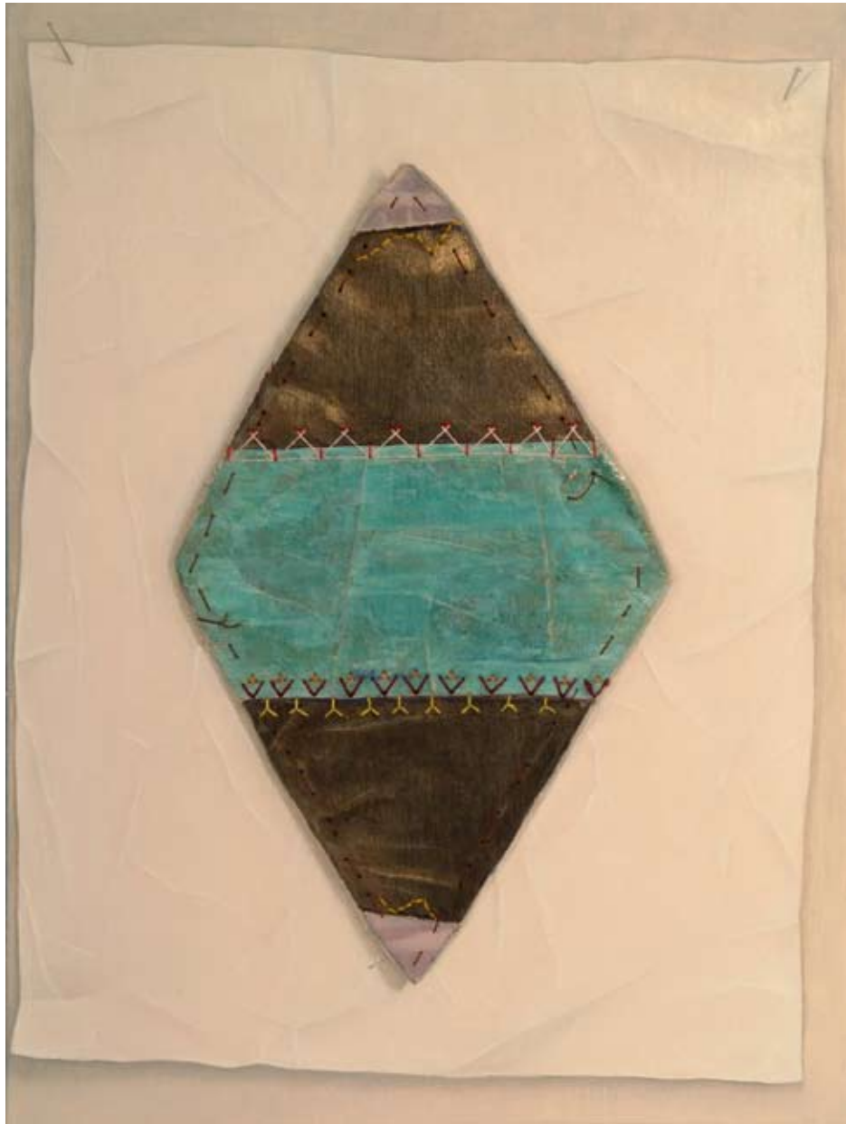
TURQUOISE DIAMOND, 2008 collage with oil, silk threads and gouache 16 x 12 inches