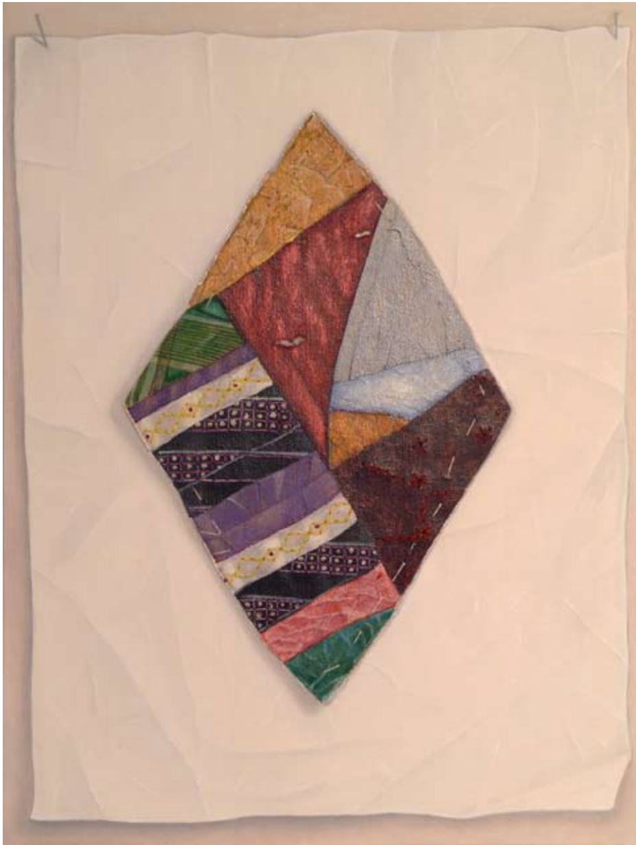
CINNABAR DIAMOND, 2008 collage with oil, silk threads and gouache 16 x 12 inches