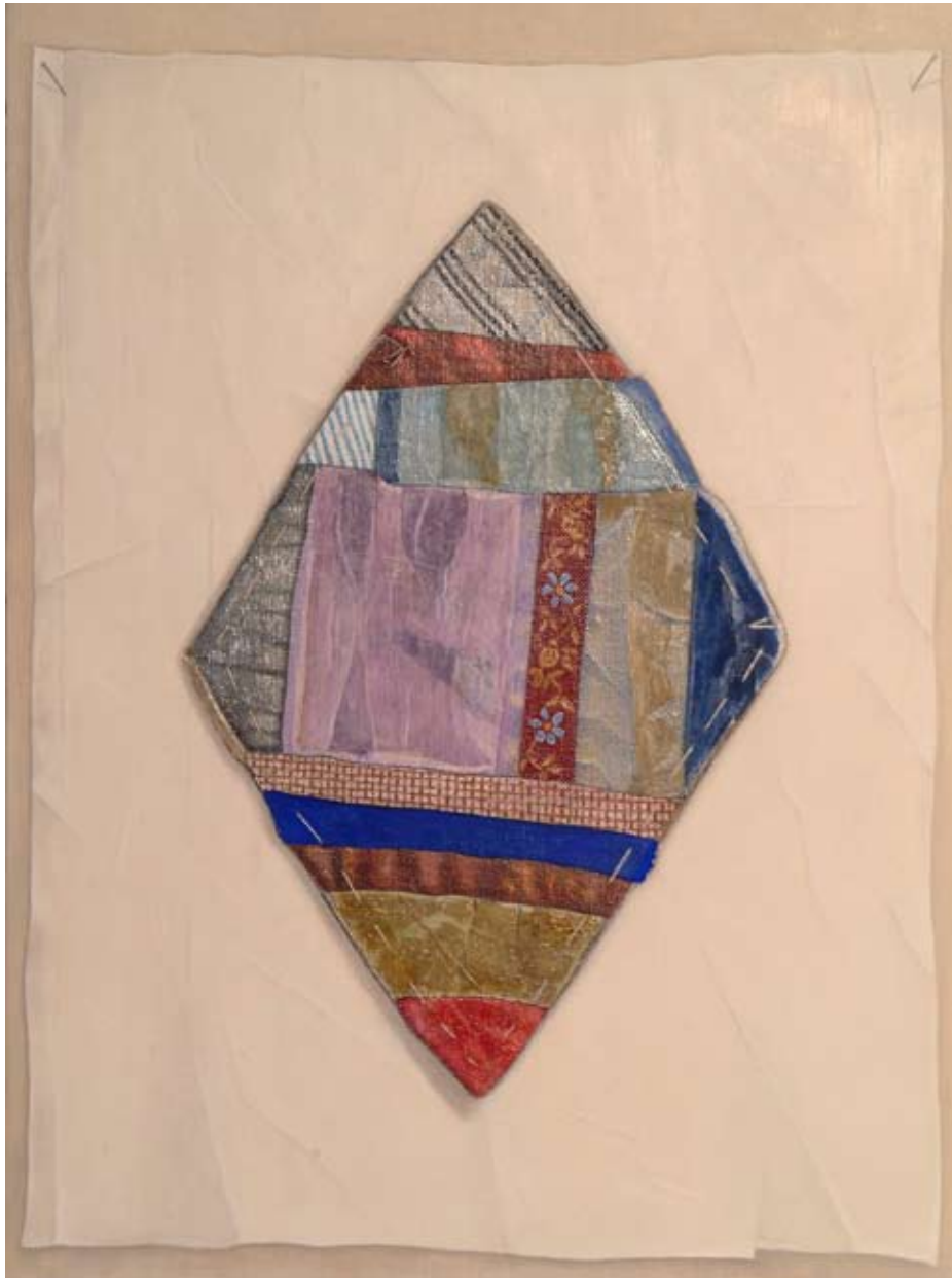
COBALT DIAMOND, 2008 collage with oil, silk threads and gouache 16 x 12 inches