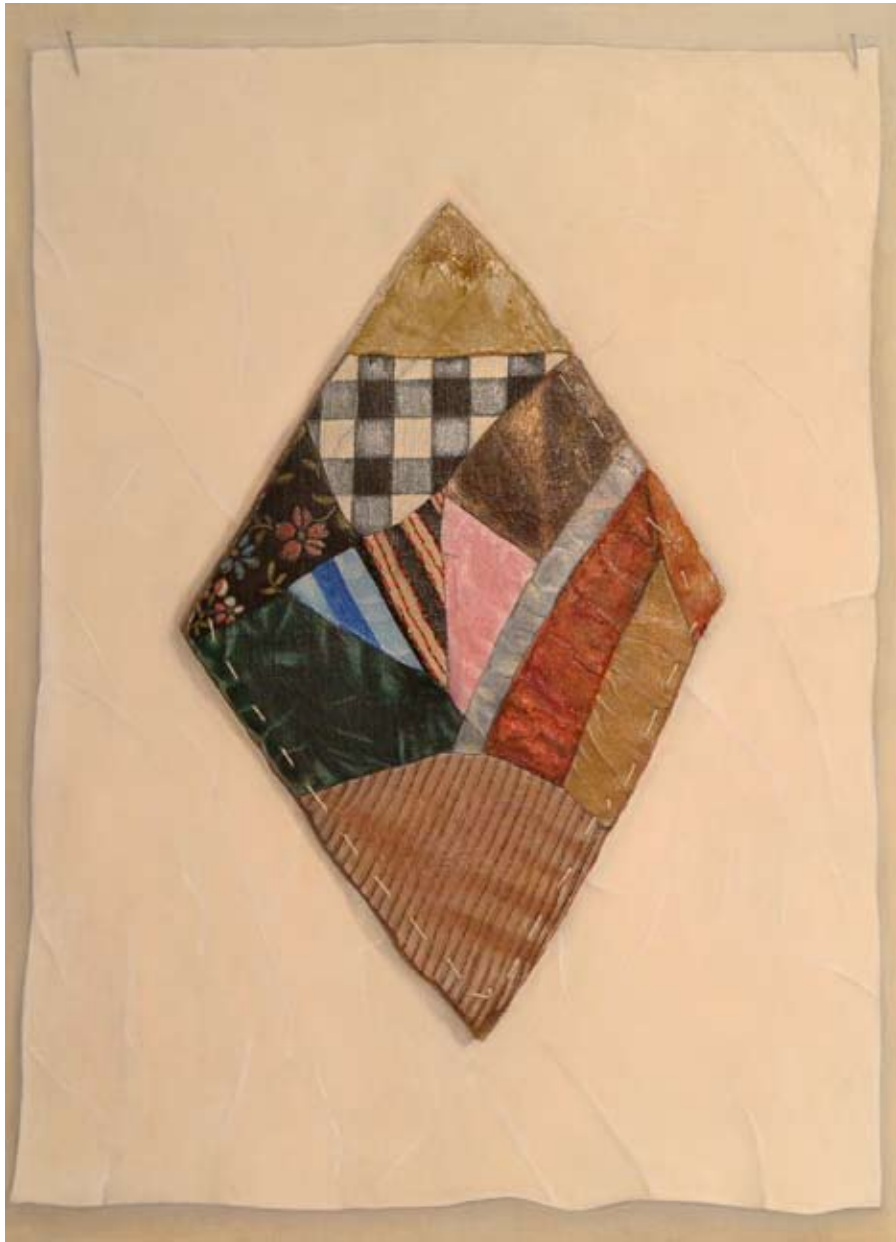
RUST DIAMOND, 2008 collage with oil, silk threads and gouache 16 x 12 inches