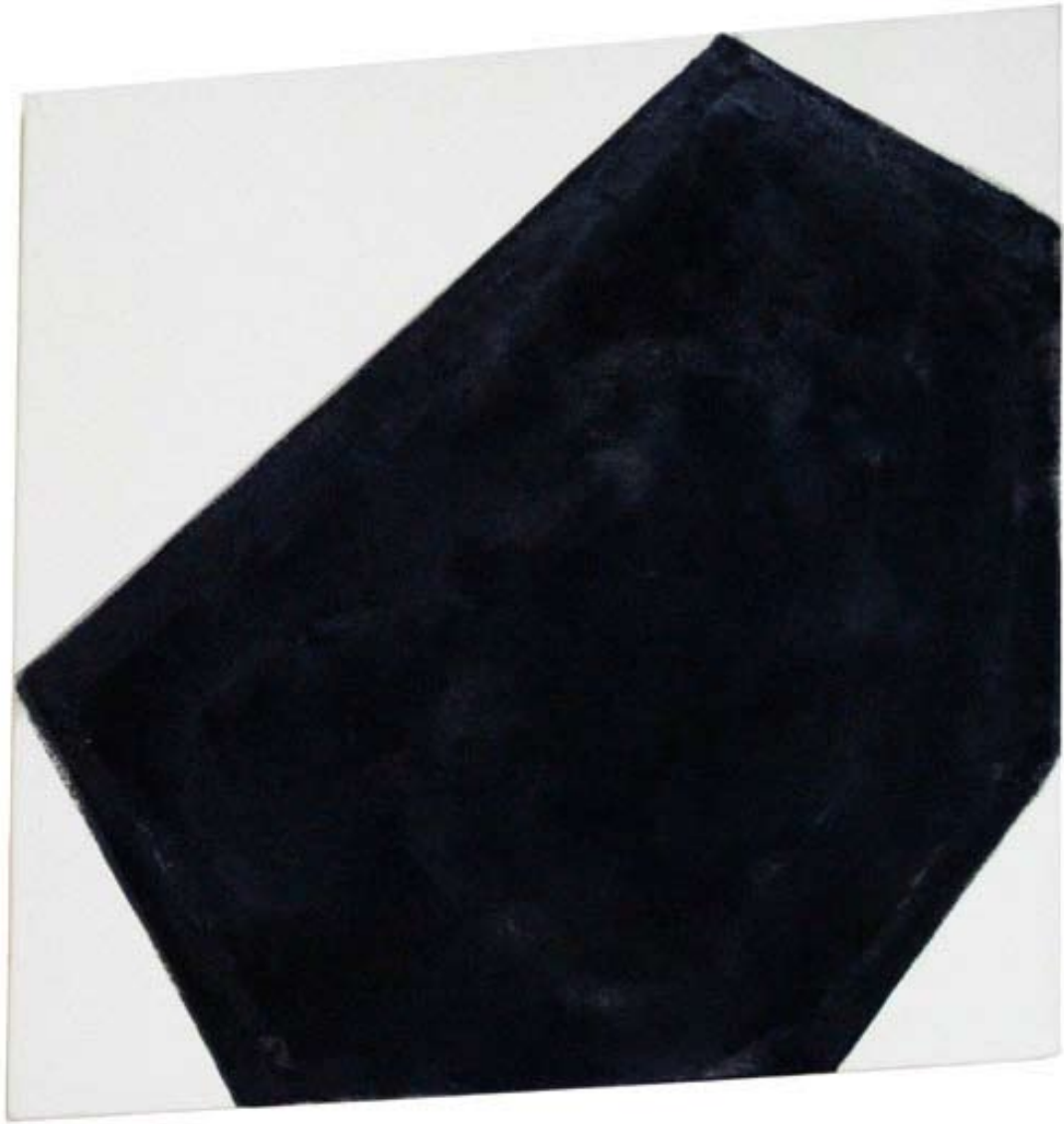
EDGE SPACE, 2010 acrylic on raw canvas on shaped support 18 x 19 inches