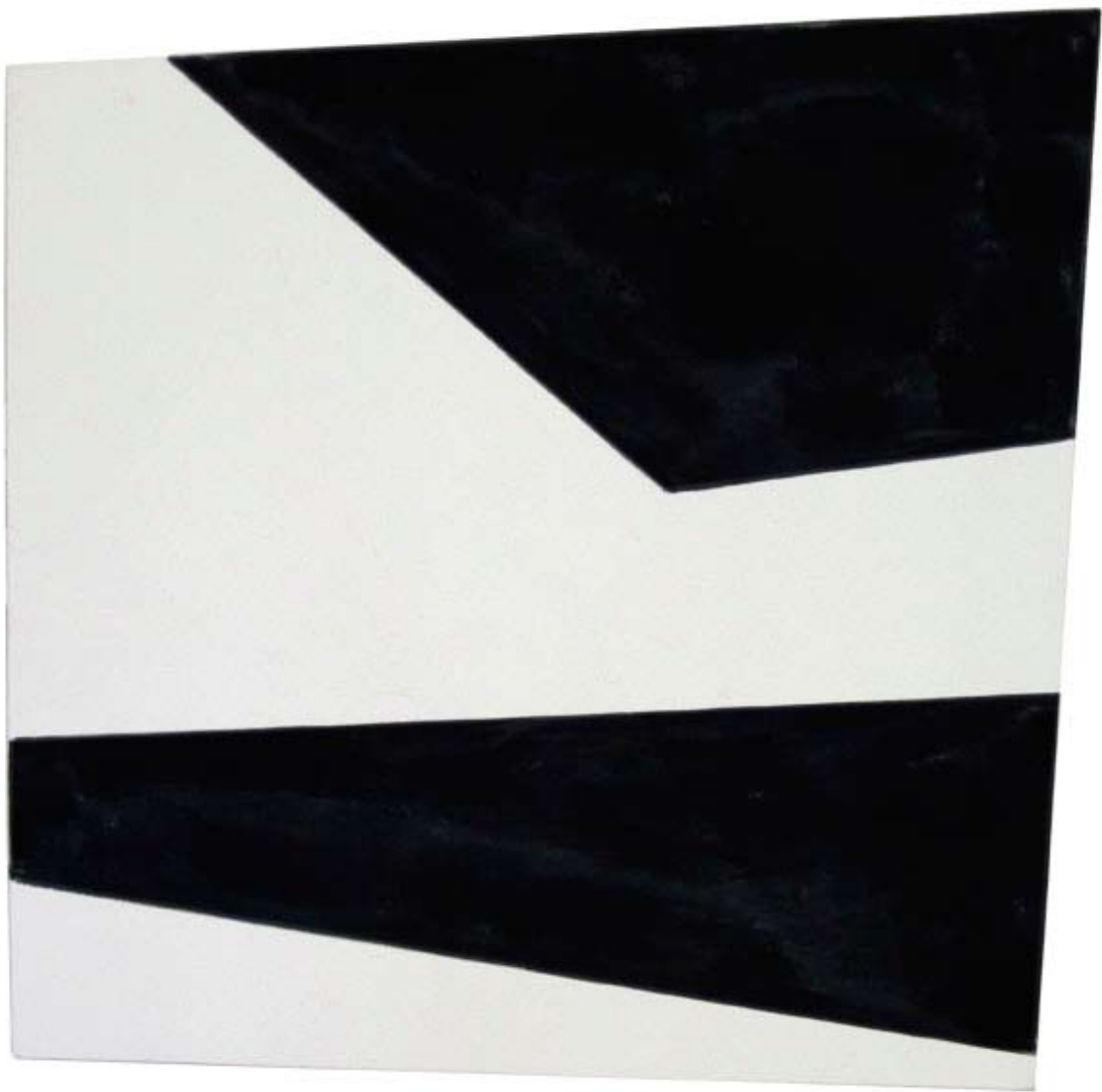
SIGHTLINE, 2010 acrylic on raw canvas on shaped support 24 x 24 inches