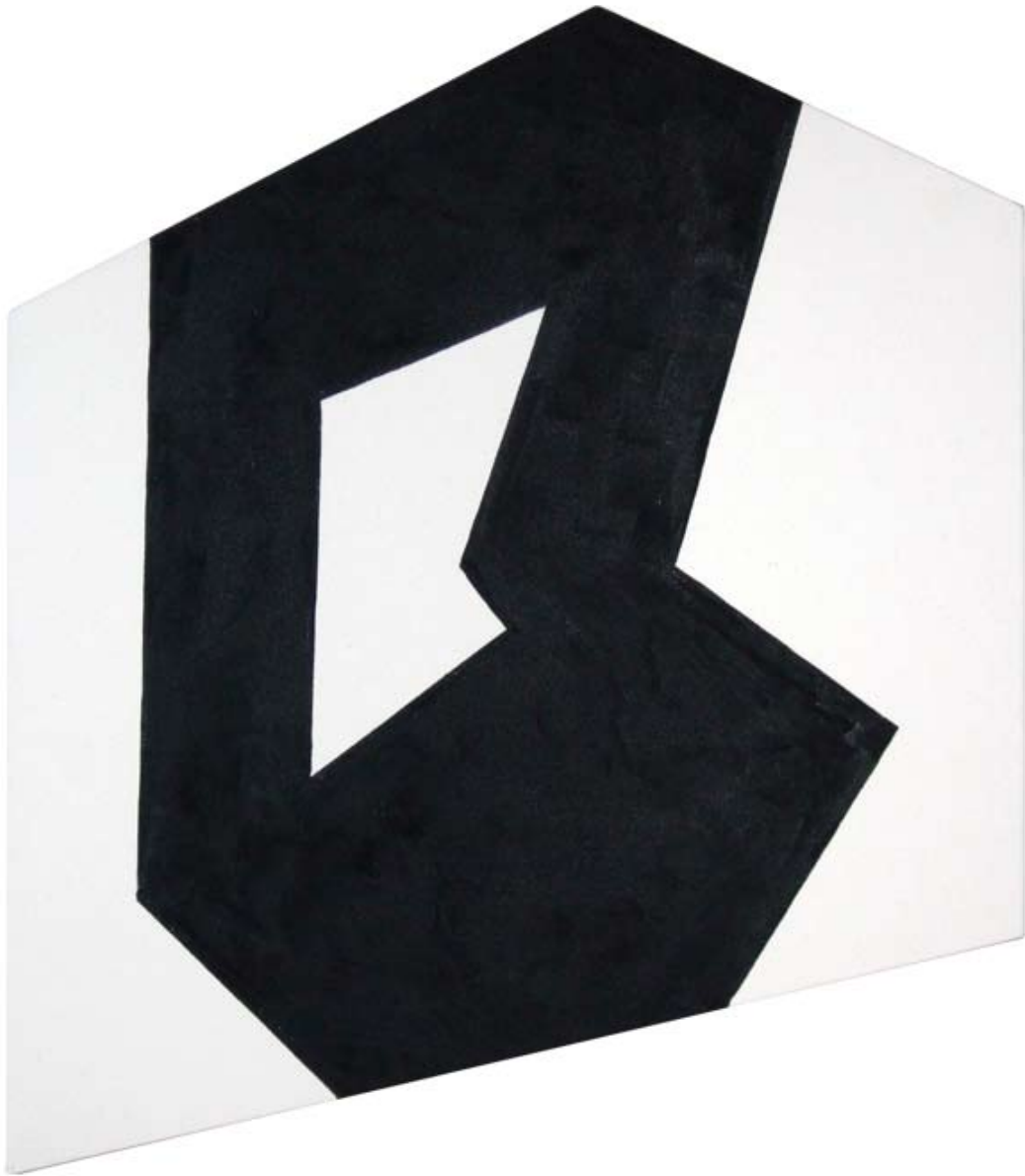
PORT, 2010 acrylic on raw canvas on shaped support 24 x 23 1/2 inches