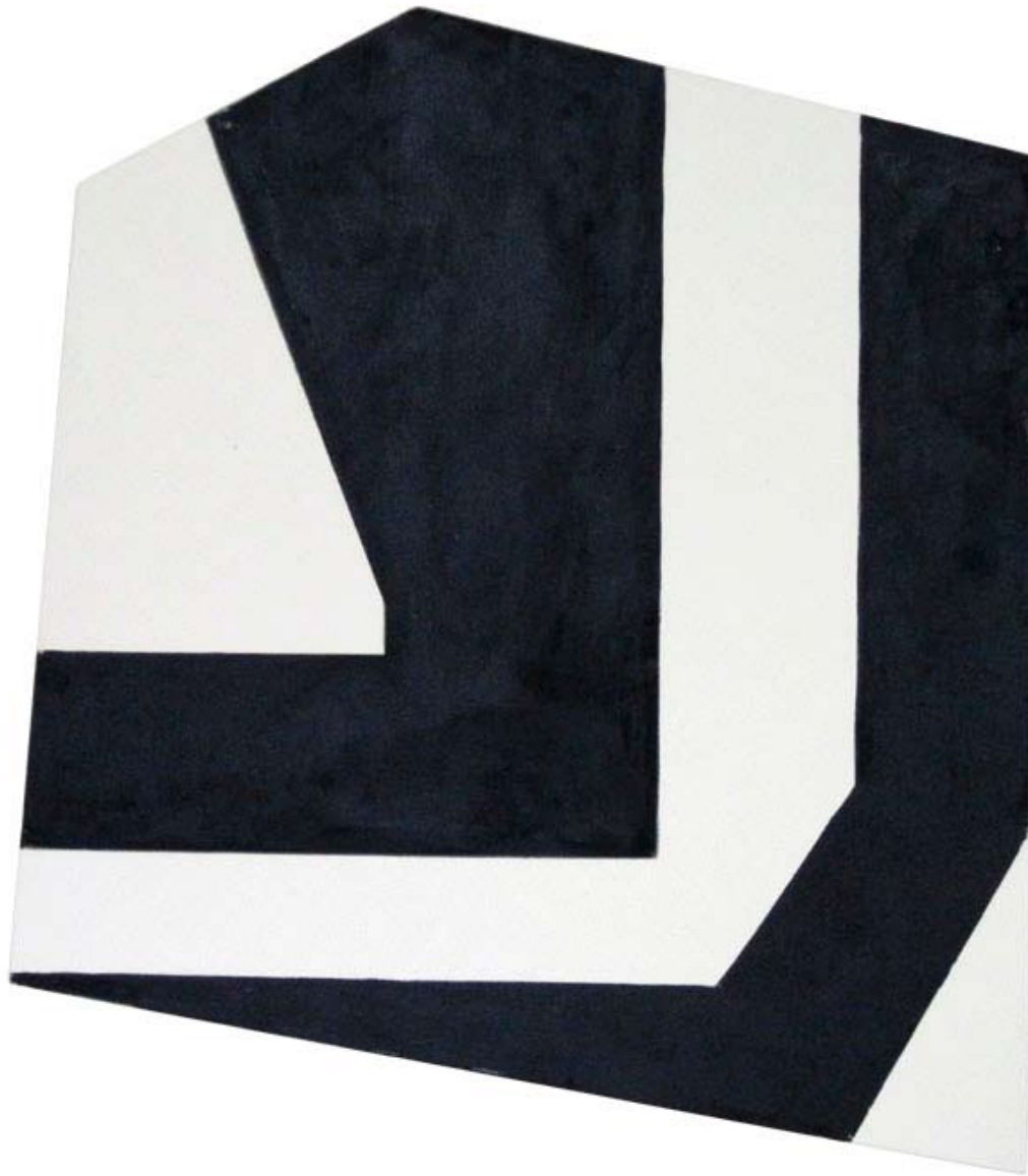
ALEA, 2010 acrylic on raw canvas on shaped support 24 x 23 inches