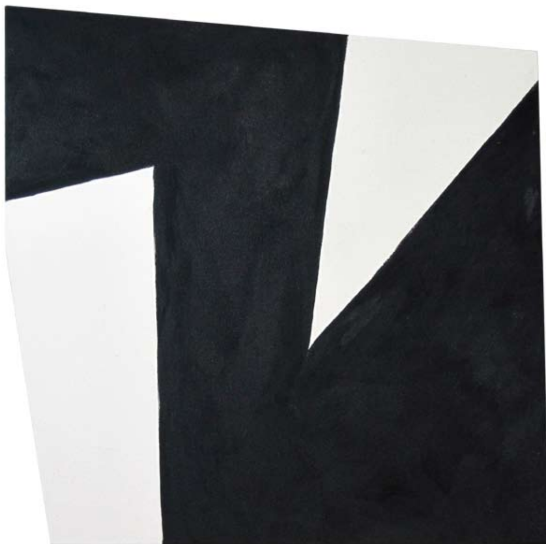
SAGARIS, 2010 acrylic on raw canvas on shaped support 24 x 23 1/2 inches