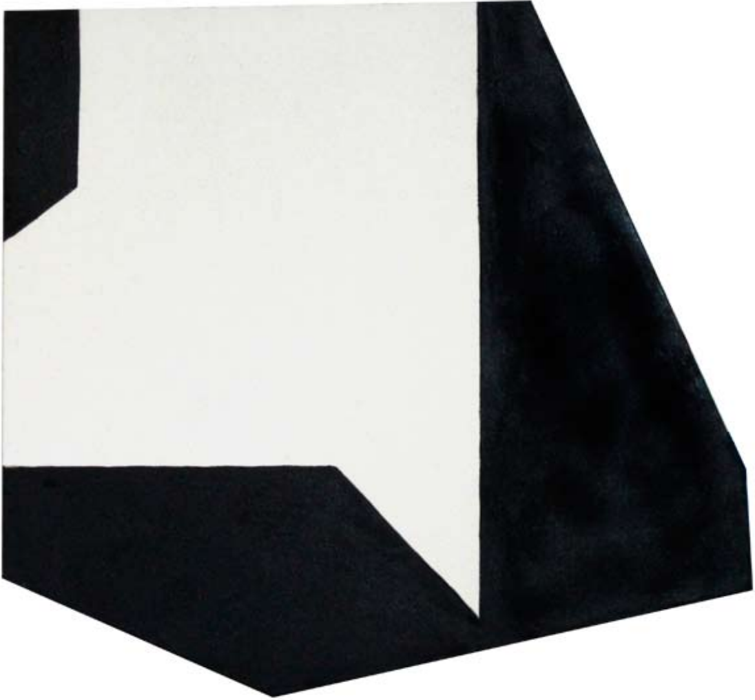
SALIENT, 2010 acrylic on raw canvas on shaped support 23 x 25 inches