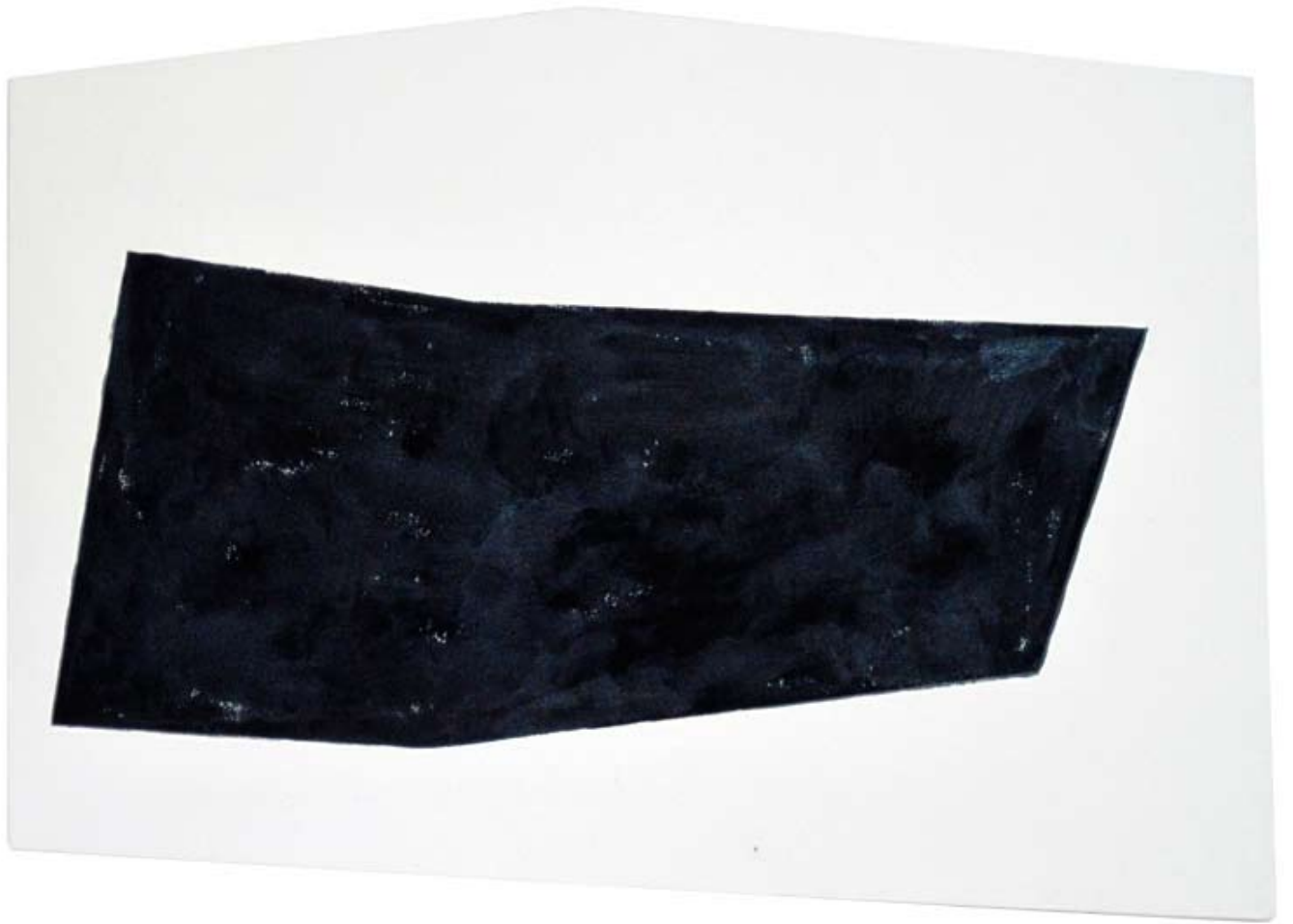
EMPIRIC, 2010 acrylic on raw canvas on shaped support 22 x 32 inches