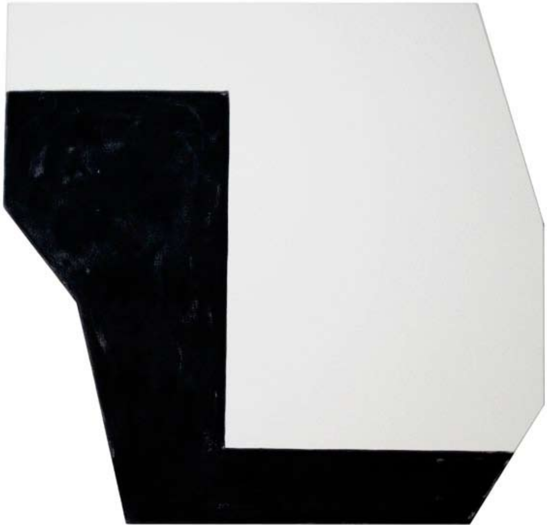
GLUON, 2010 acrylic on raw canvas on shaped support 23 1/2 x 24 inches