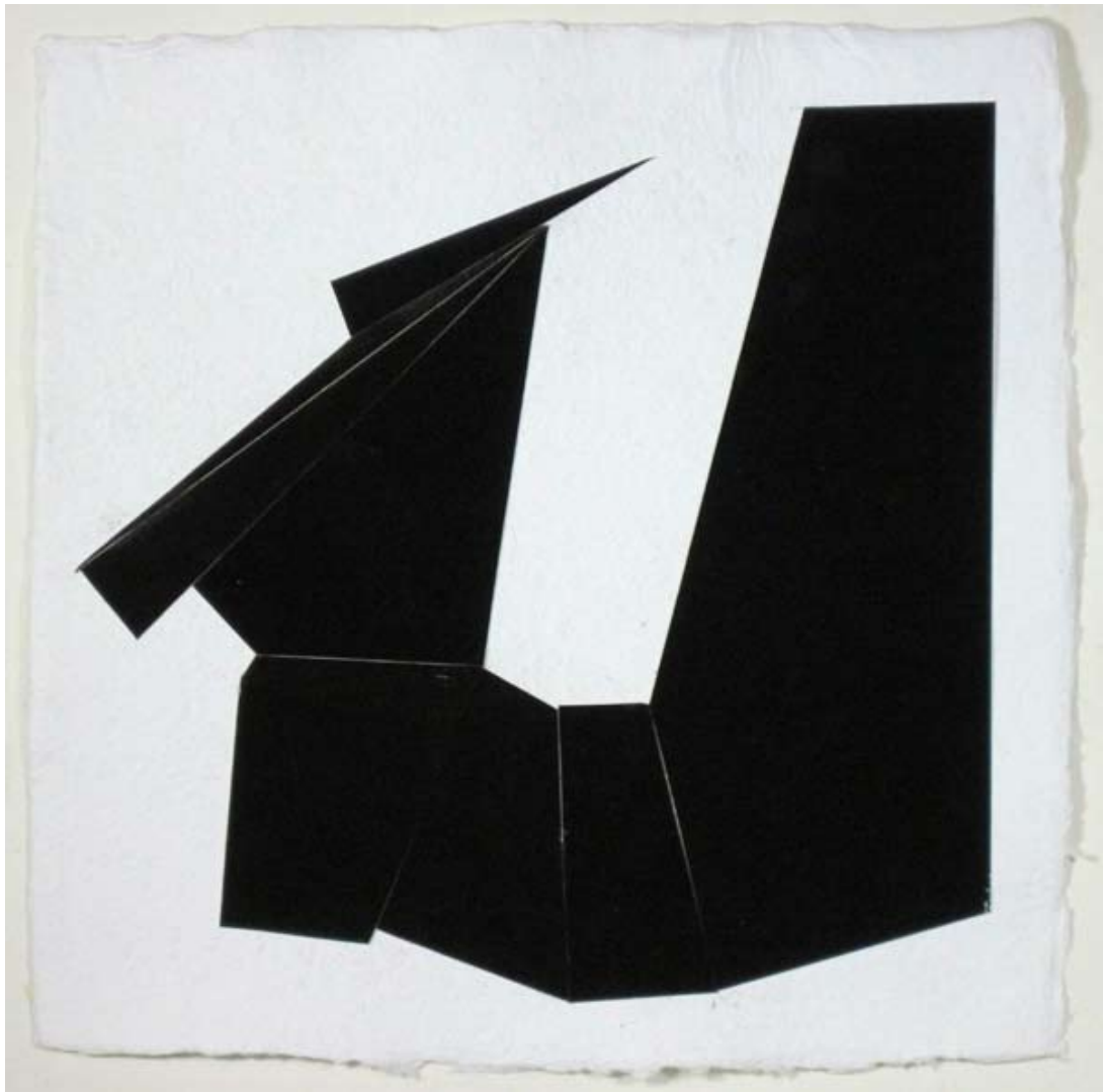
UNTITLED COLLAGE 4, 2010 gouache on Fabriano paper, collaged on Calcutta watercolor paper 12 x 12 inches