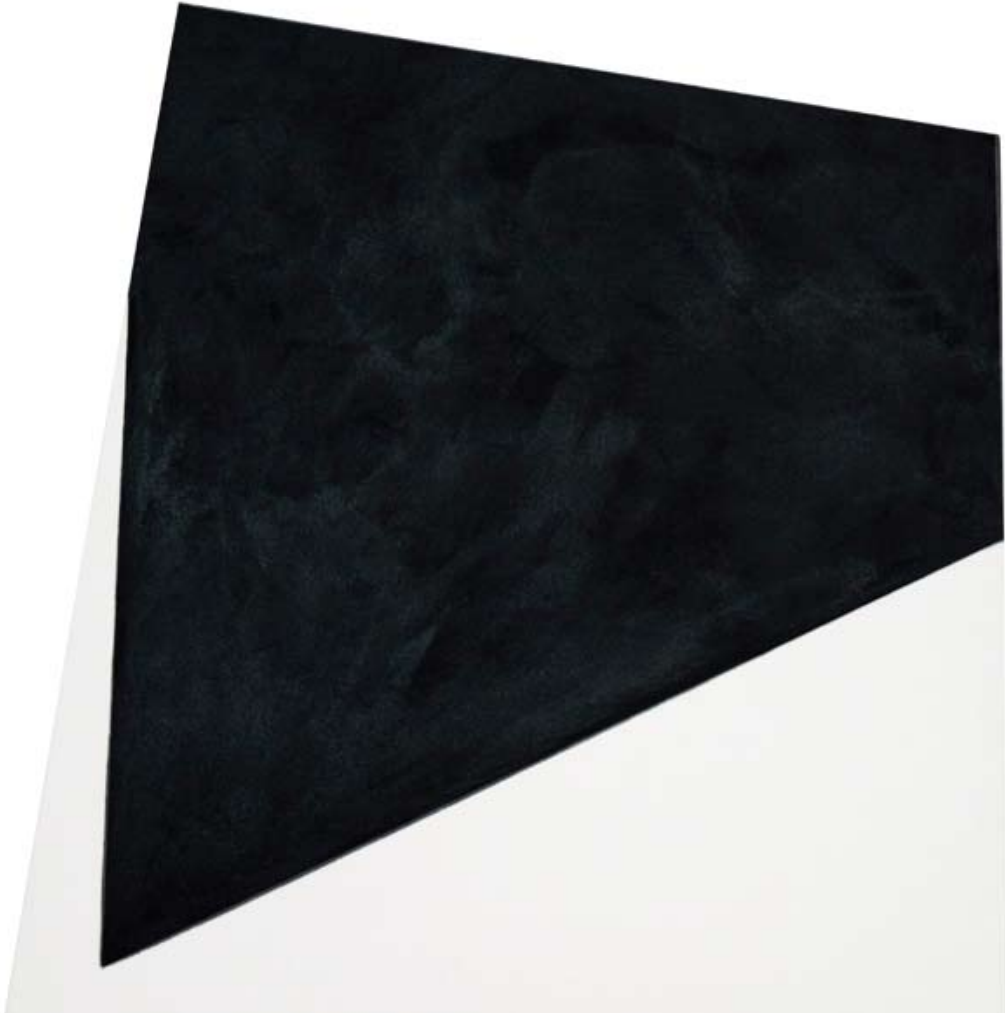
SECTION, 2010 acrylic on raw canvas on shaped support 25 x 24 inches