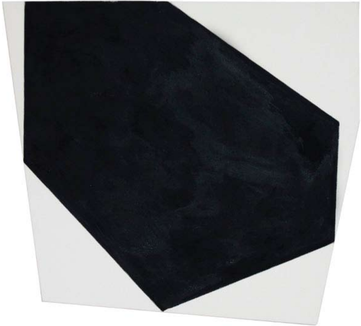
SCHEMA, 2010 acrylic on raw canvas on shaped support 22 x 24 inches