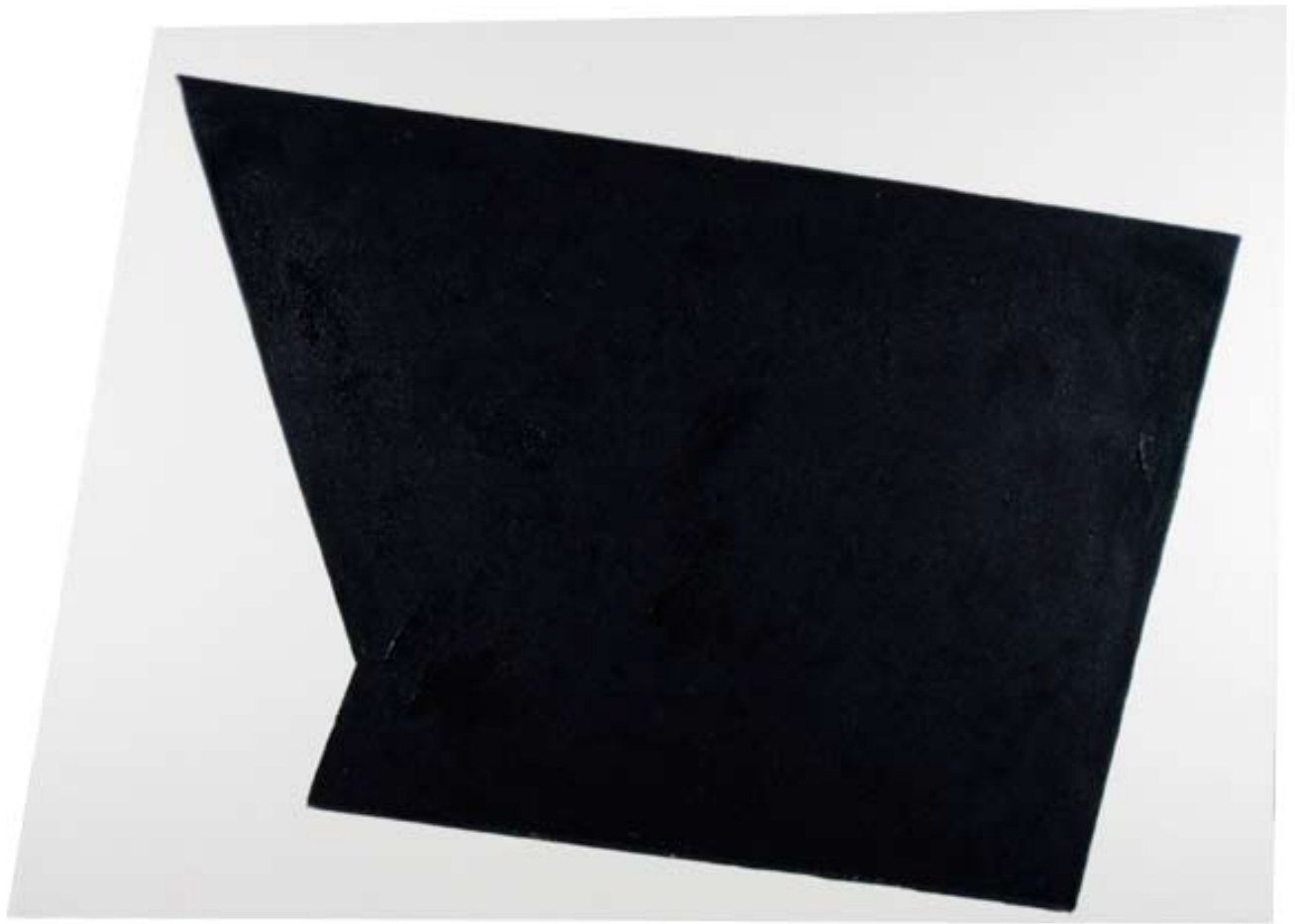
BUCKLE, 2010 acrylic on raw canvas on shaped support 23 x 32 inches