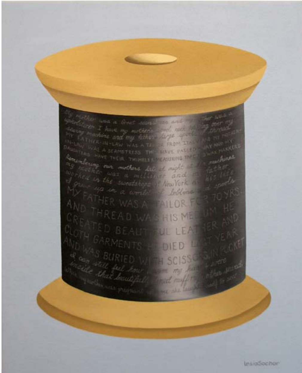
STORIES, 2010 oil on canvas 24 x 19 inches