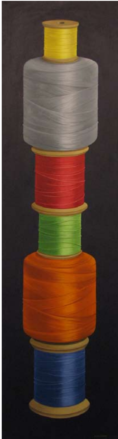
TOTEM; FOR THE MILL WORKERS, 2009 oil on canvas 60 x 16 inches