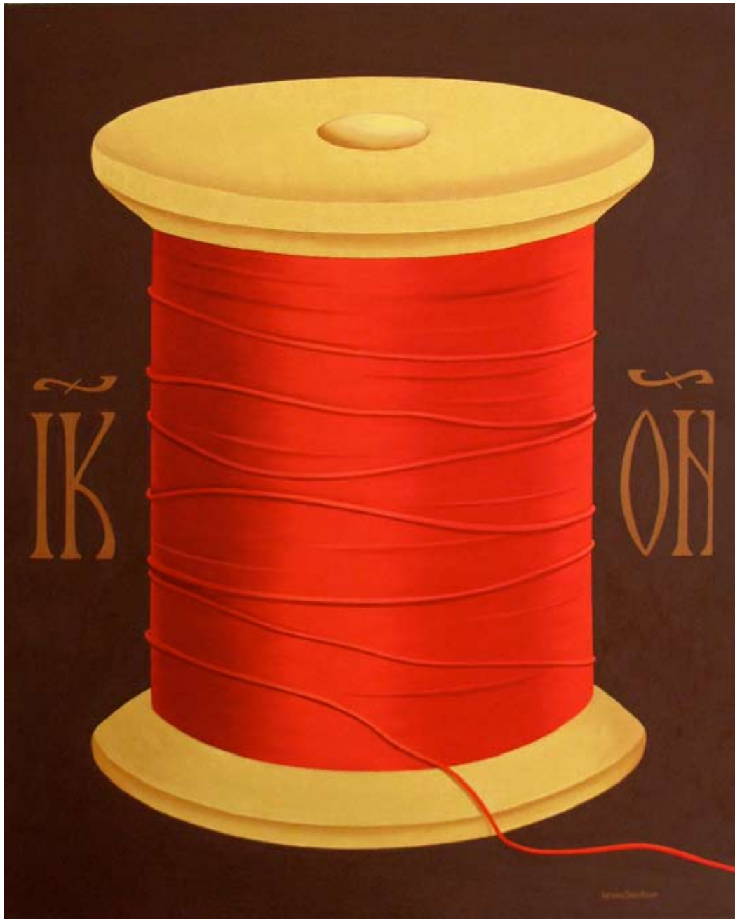
ICON, 2009 oil on canvas 32 x 27 inches