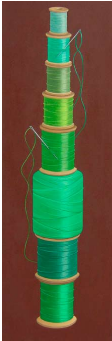
SEWING GREEN, 2009 oil on canvas 42 x 13 inches