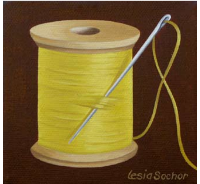
HOME EC' I, 2009 oil on canvas 4 x 4 inches HOME EC' II, 2009 oil on canvas 4 x 4 inches