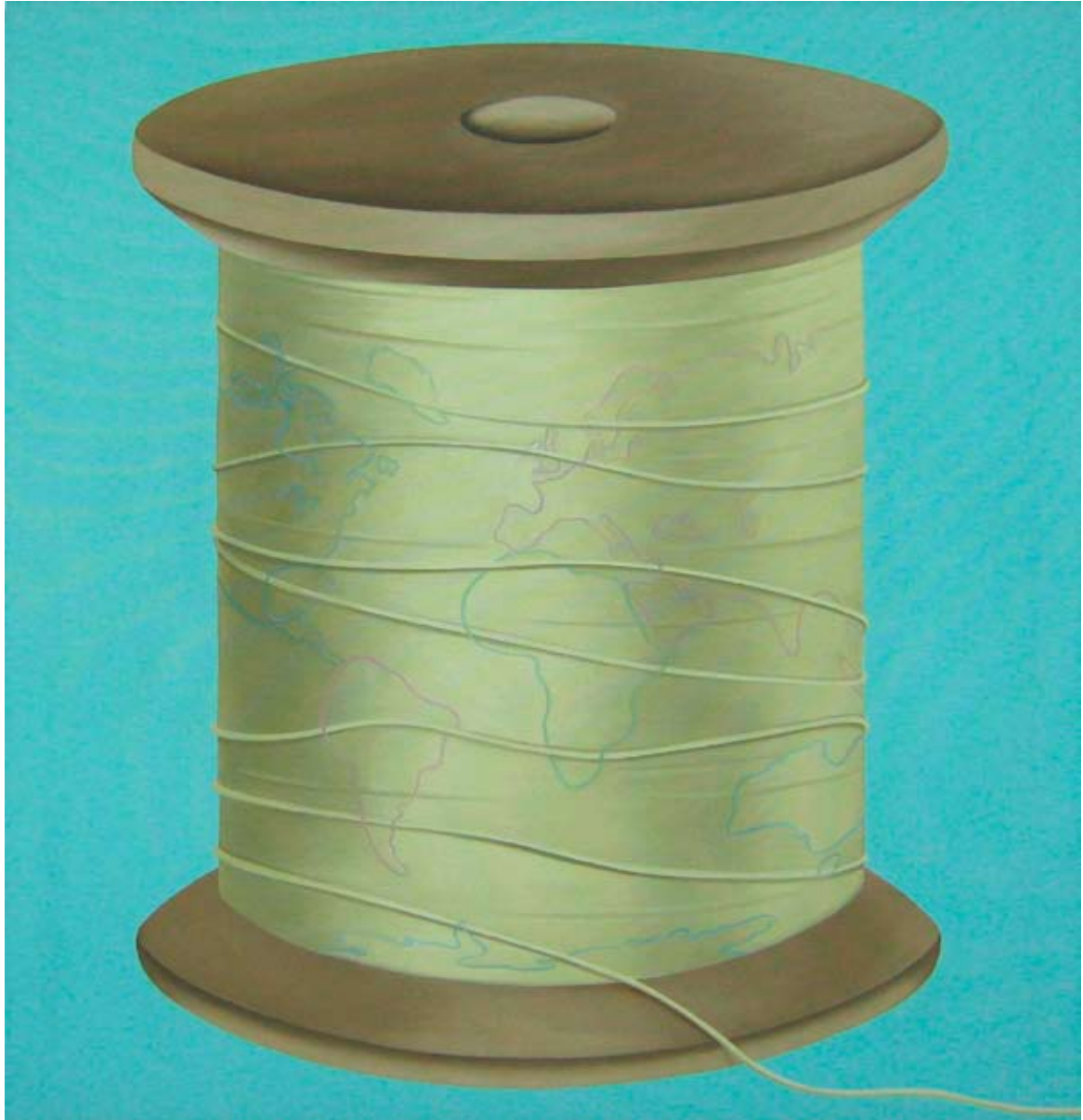
COMMON THREAD, 2008 oil on canvas 32 x 27 inches