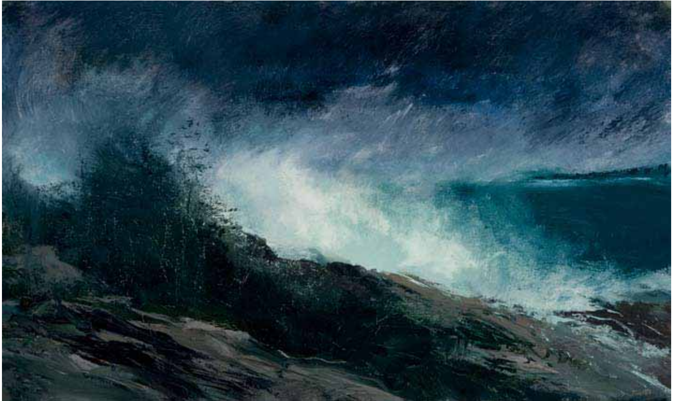
DARK ISLAND SURF, 2008 oil on gessoed rag 18 x 30 inches