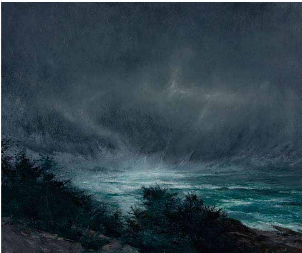
DARK ISLAND LIGHTNING, 2008 oil on panel 40 x 48 inches