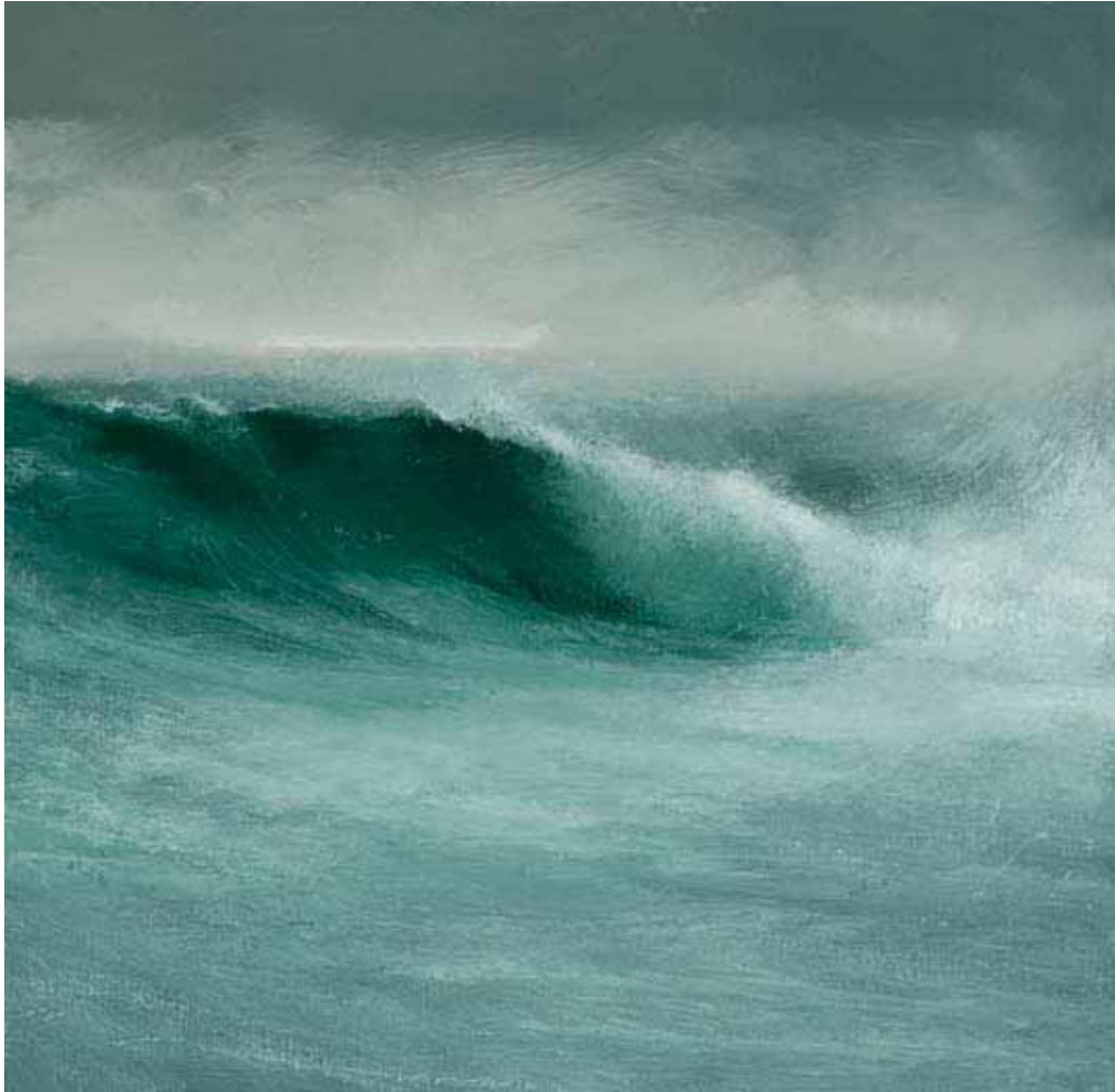
GREEN SEA, 2008 oil on panel 18 x 18 inches