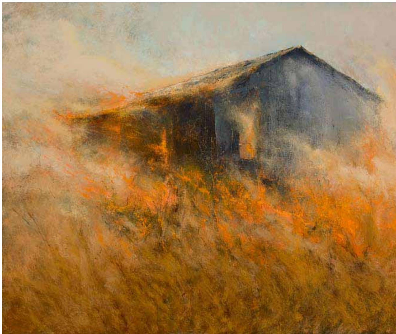
BURNING FIELD;STRUCTURE FIRE, 2008 oil on panel 40 x 48 inches