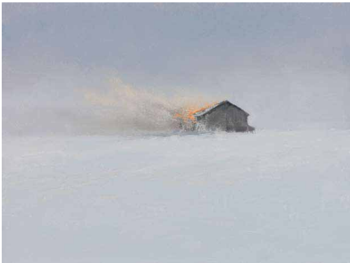
WINTER FIELD;BARN ON FIRE, 2008 oil on panel 18 x 24 inches