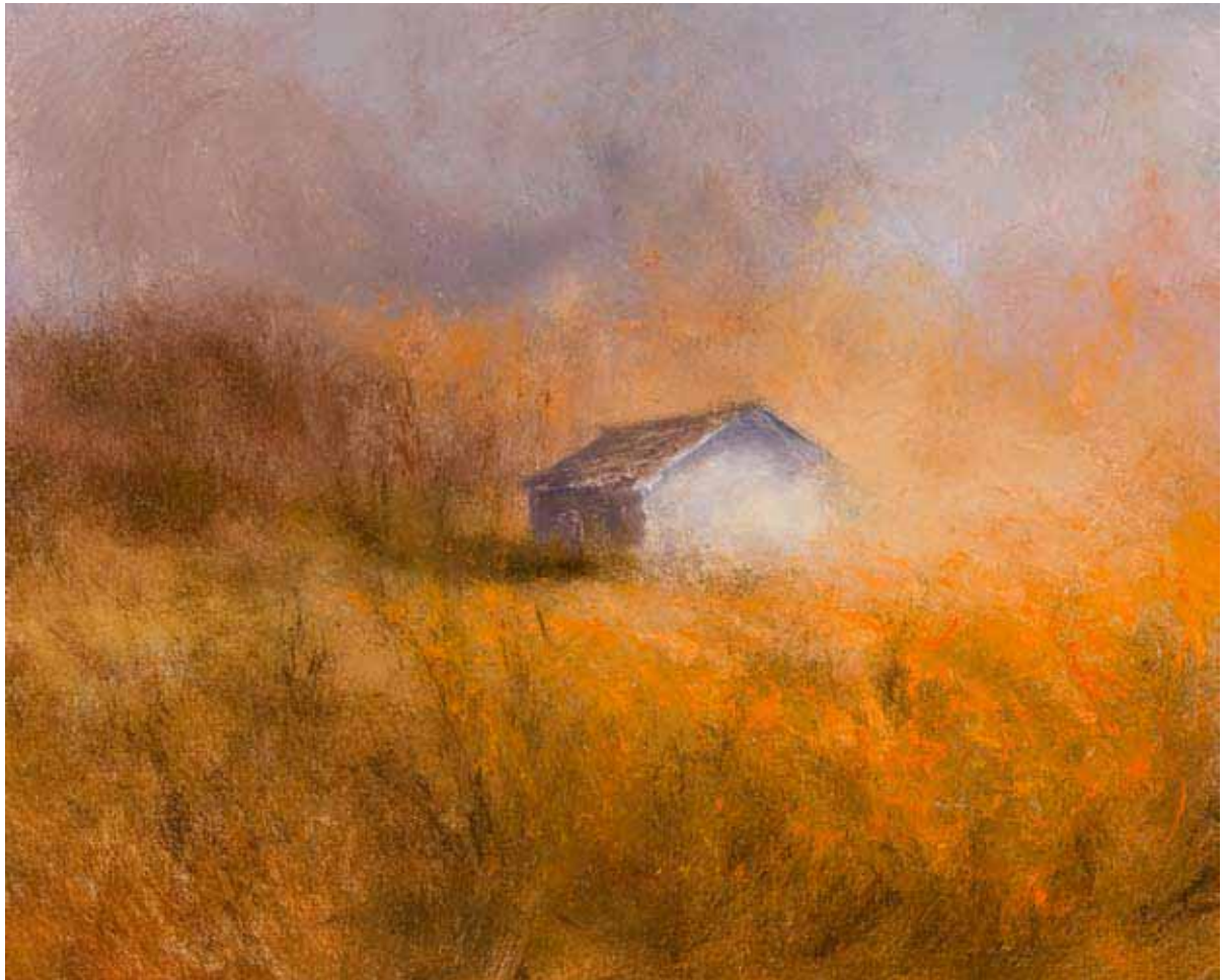
SHED IN BURNING FIELD, 2008 oil on panel 18 x 22 inches