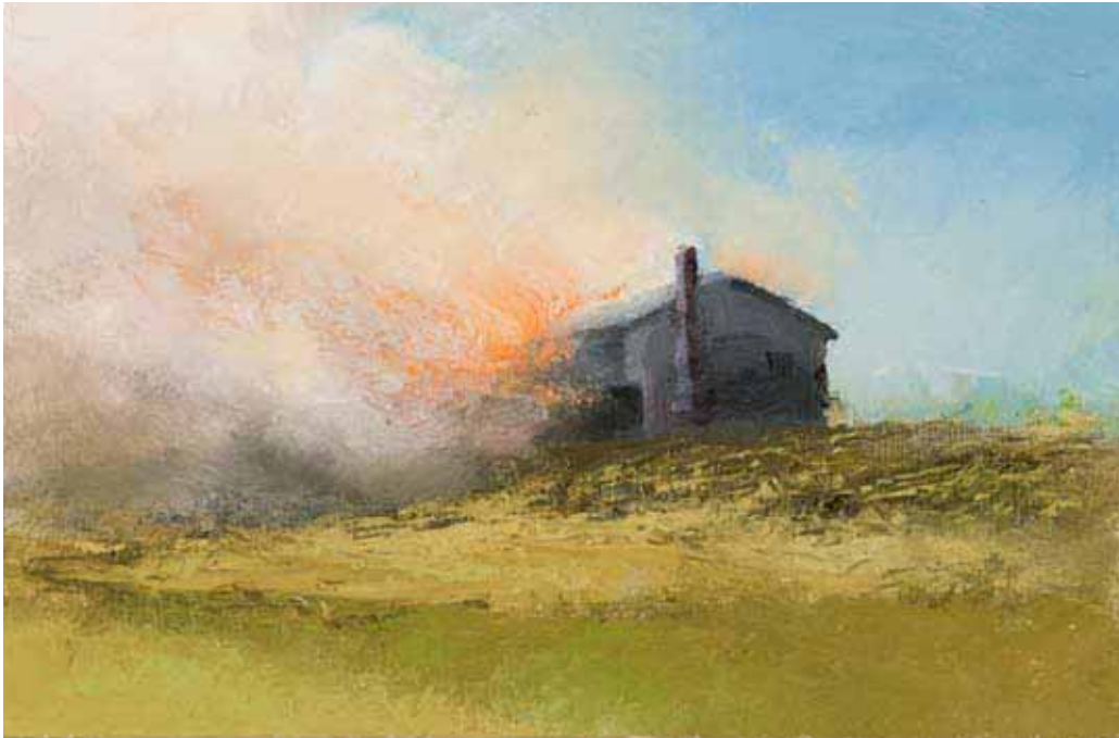
BURNING RANCH #1, 2007 oil on panel 9 x 14 inches