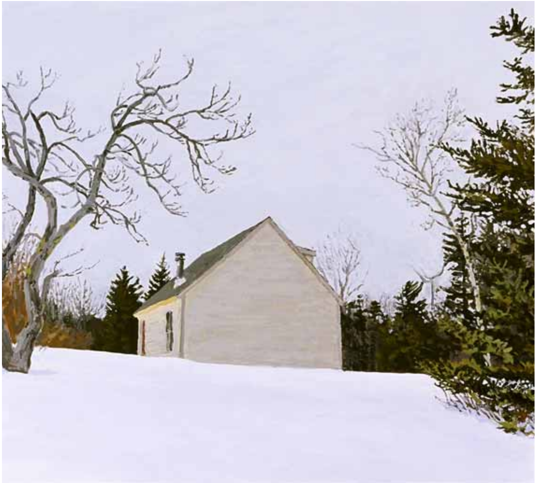
JANUARY THAW, 2007 oil on canvas 20 x 22 inches