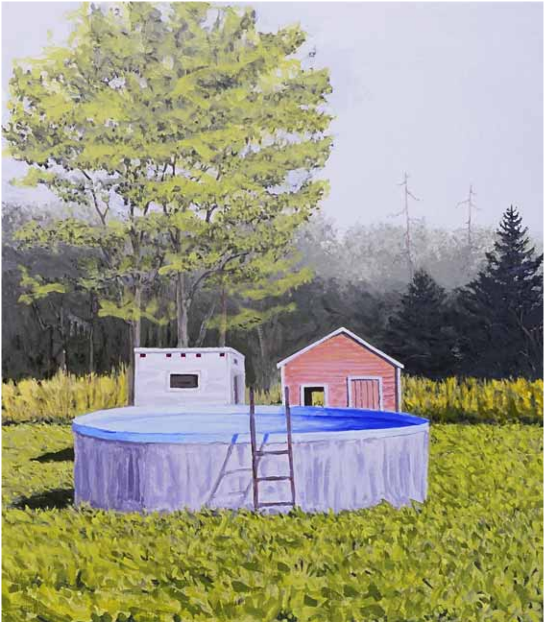
SHE HAD IT ALL, 2007 oil on canvas 40 x 35 inches