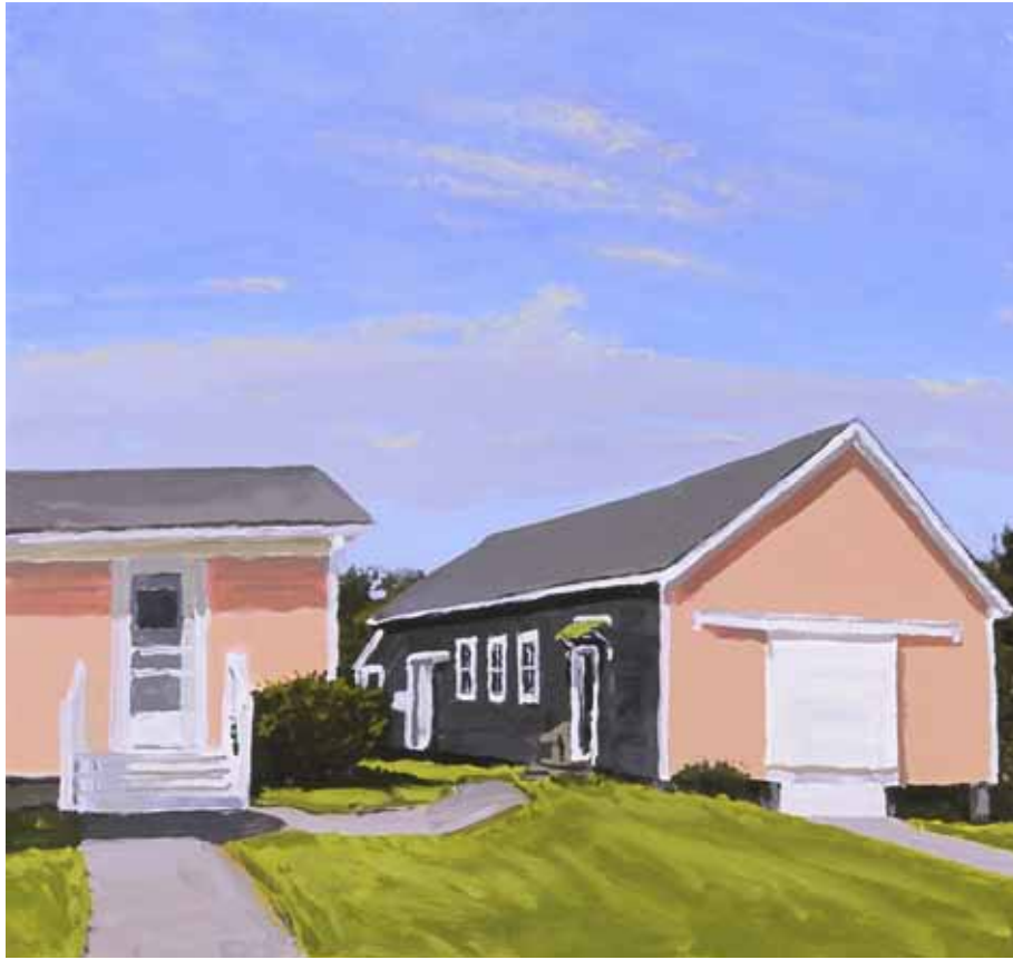
SALMON PINK, 2006 oil on canvas 18 x 19 inches