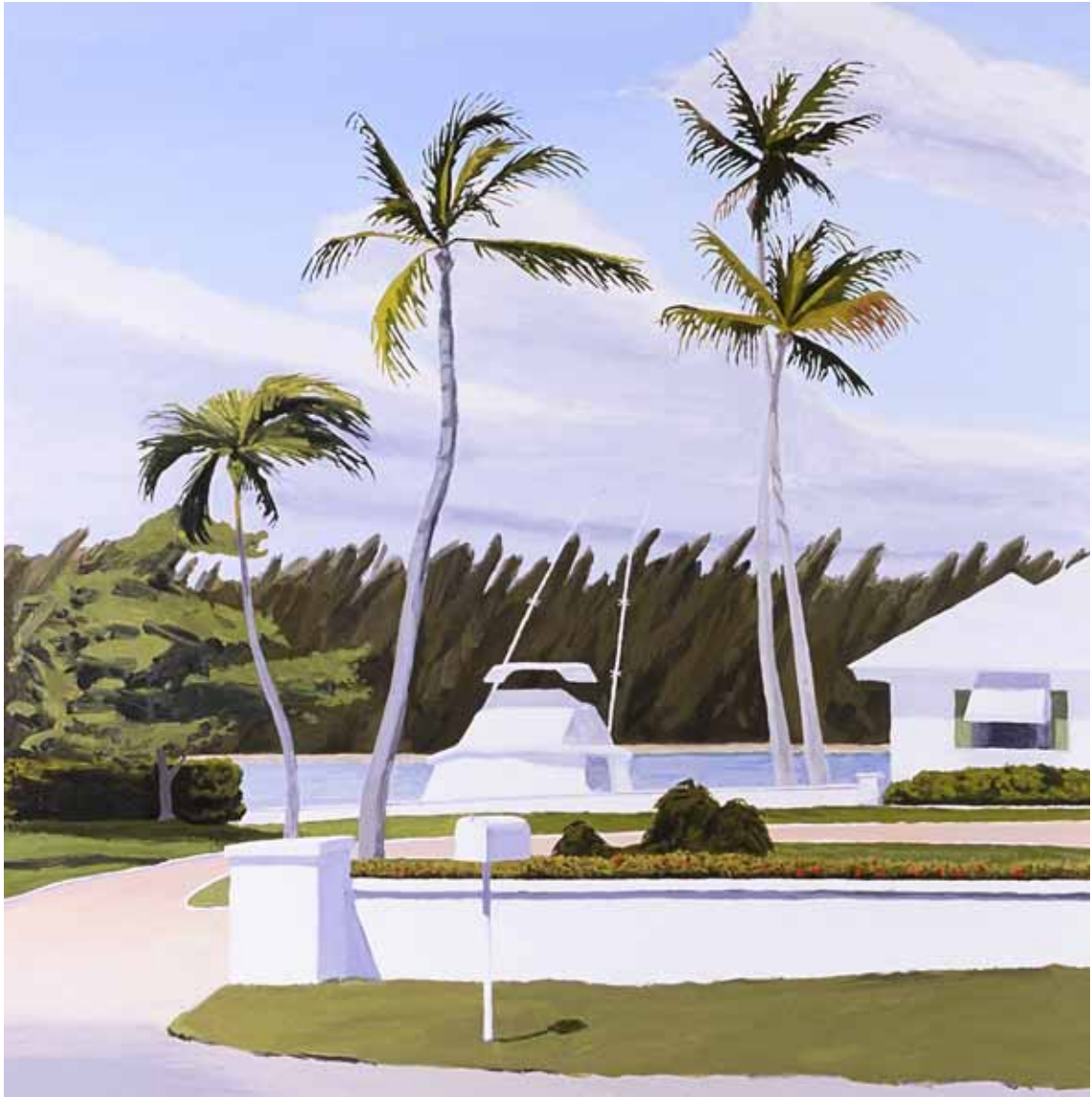
SINGER ISLAND, 2007 oil on canvas 45 x 45 inches