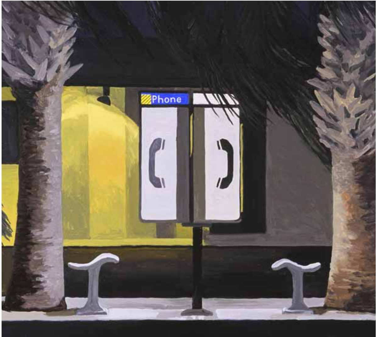
ISLAND, 2007 oil on canvas 32 x 36 inches