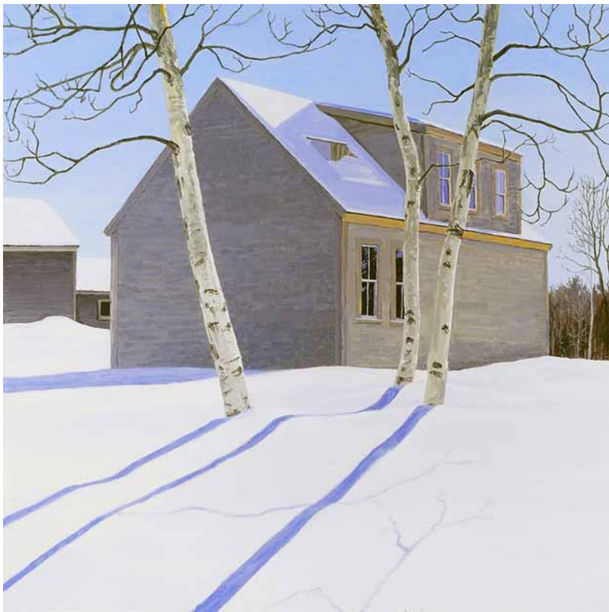
WINTER BIRCH, 2007 oil on canvas 54 x 54 inches