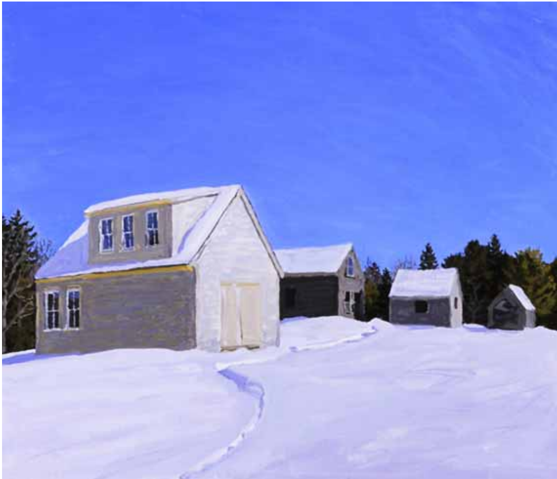
DEEP BLUE WINTER SKY, 2007 oil on canvas 19 x 22 inches