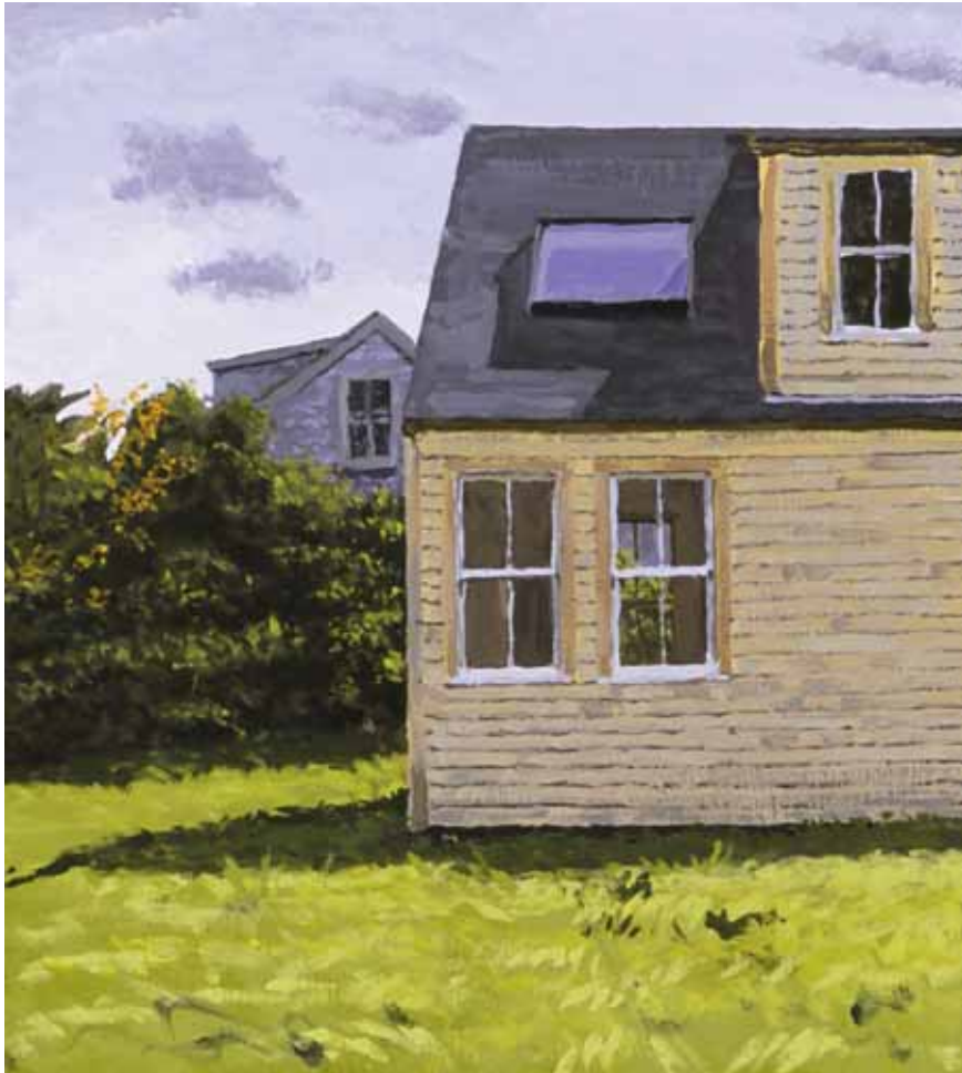
DORMERS I, 2006 oil on canvas 21 x 19 inches