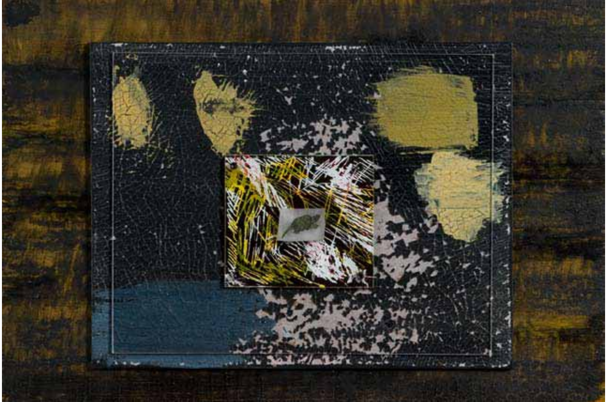
EMERGING, 2008 mixed medium 9 1/2 x 14 inches