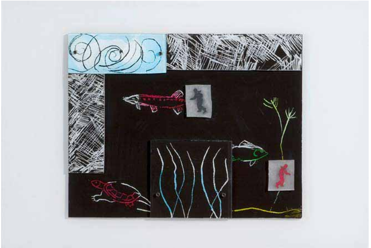
BLACK ICE, 2008 mixed medium 9 1/2 x 14 inches