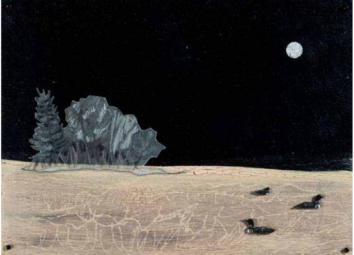
FULL MOON, COLEMAN POND, 2009 mixed medium 9 1/2 x 13 inches