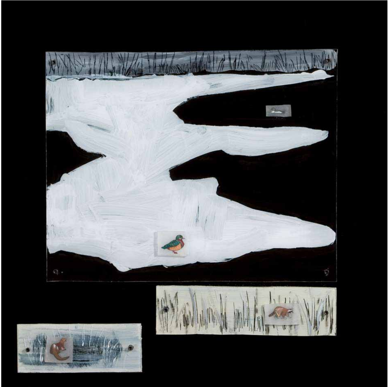
SPRING THAW, 2008 mixed medium 12 x12 inches