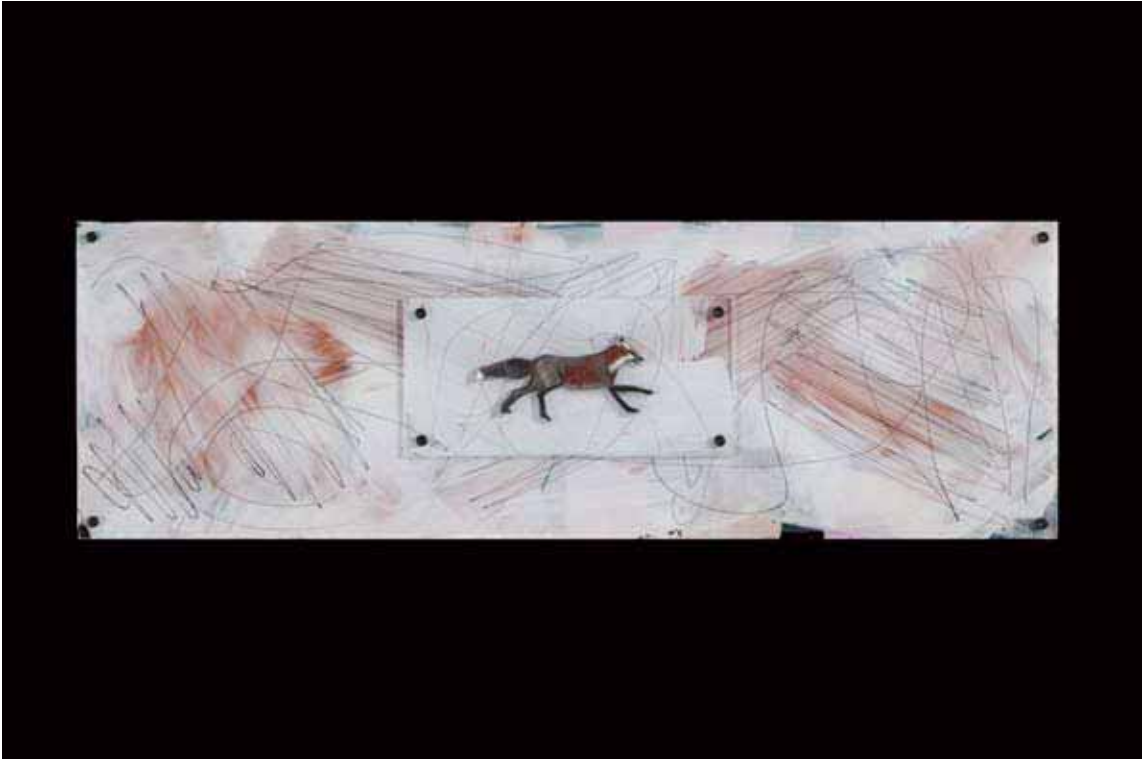
RUNNING FOX, 2009 mixed medium 9 1/2 x 14 inches