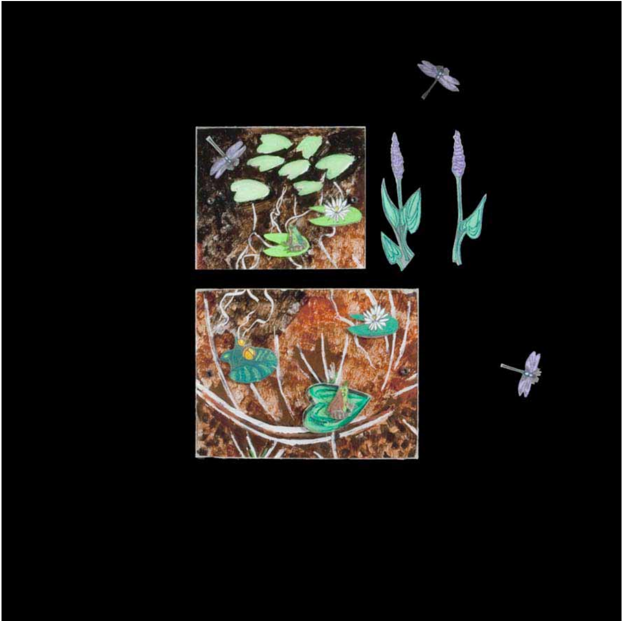
POND BARITONE, 2009 mixed medium 12 x 12 inches