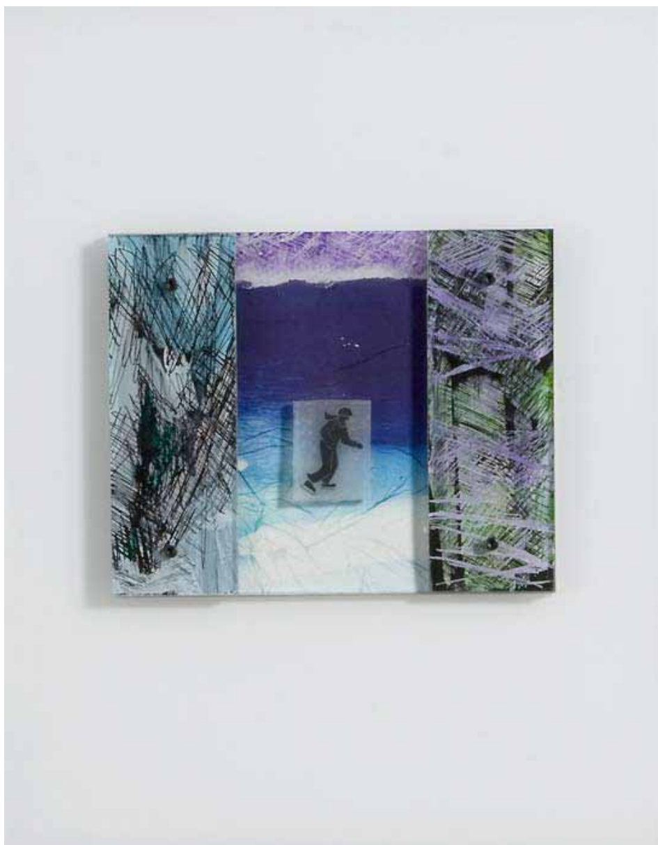
SKATING AT DUSK, 2008 mixed medium 12 x 12 inches