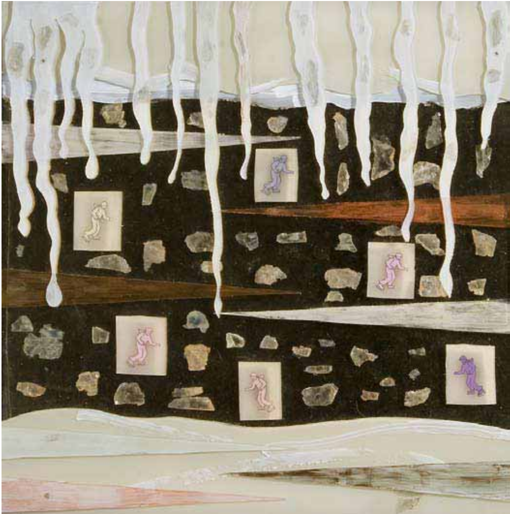
ICICLES, 2008 mixed medium 12 x 12 inches