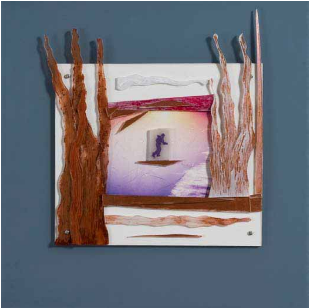
THROUGH THE TREES, 2008 mixed medium 12 x 12 inches