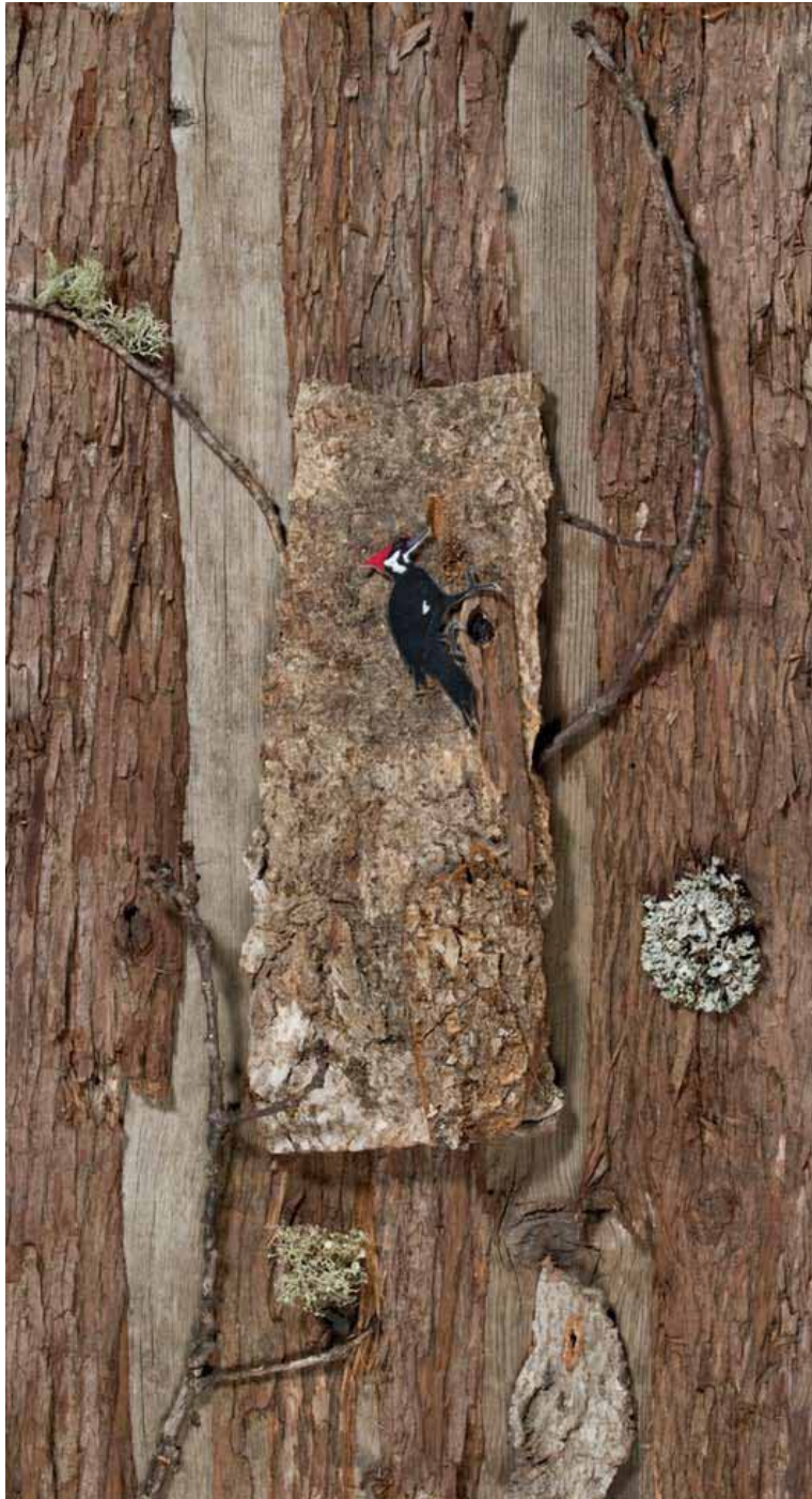
DUET, 2009 mixed medium 19 1/4 x 11 inches