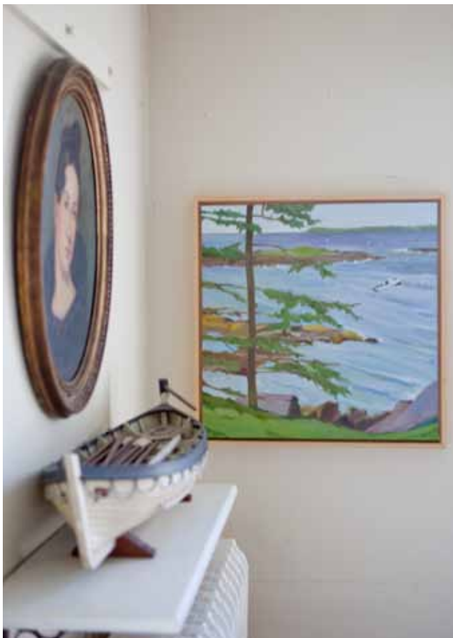
From McGee Island (above, top), which portrays the area around Port Clyde, hangs near an heirloom family portrait and model lifeboat in the dining room.

The pages in some of Kellogg's sketchbooks (above, bottom) are only three-by-four inches, a size that allows him to "capture something in five, ten minutes." Kellogg teaches a painting workshop in Thomaston each July.