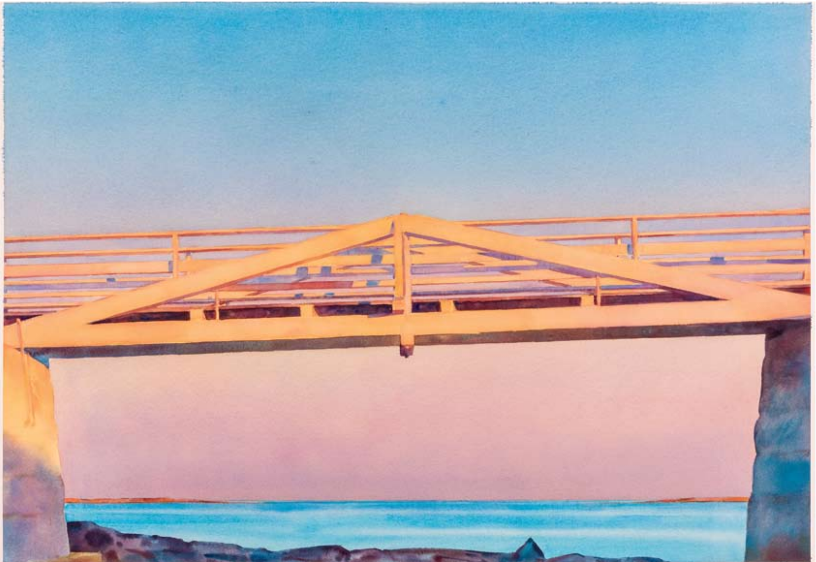
Marshall Point: Setting Sun 2014 watercolor 27 x 39 1/8 inches