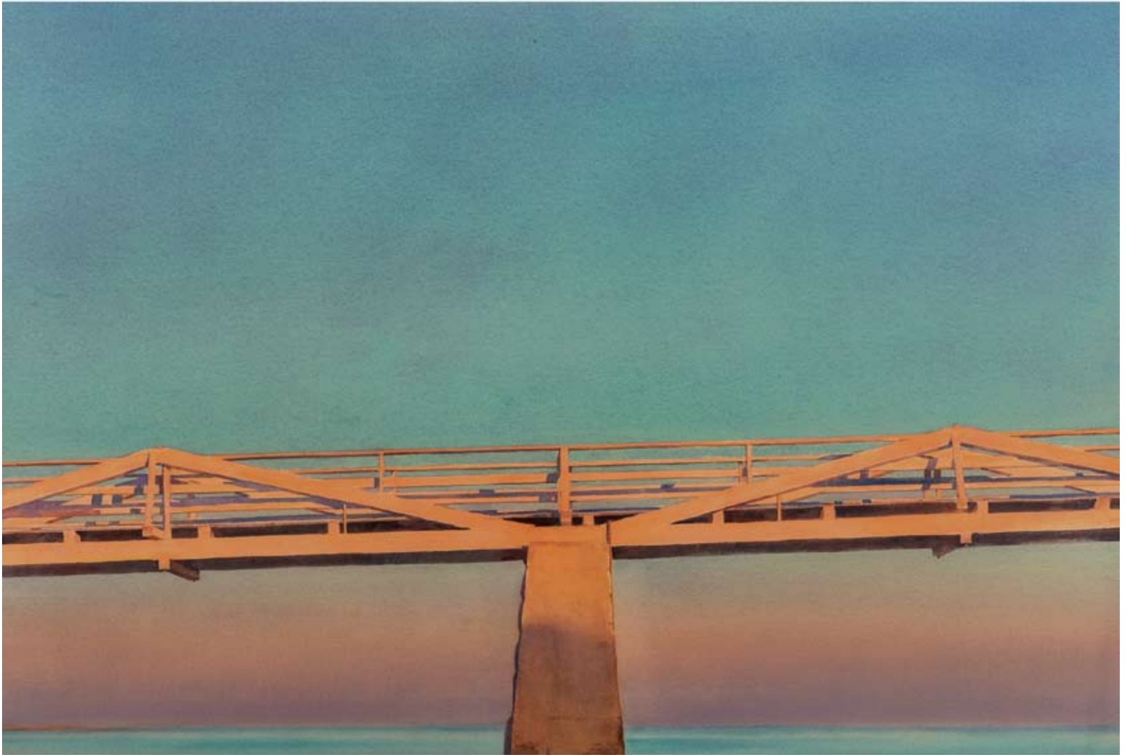
Marshall Point 2014 watercolor 31 x 46 inches