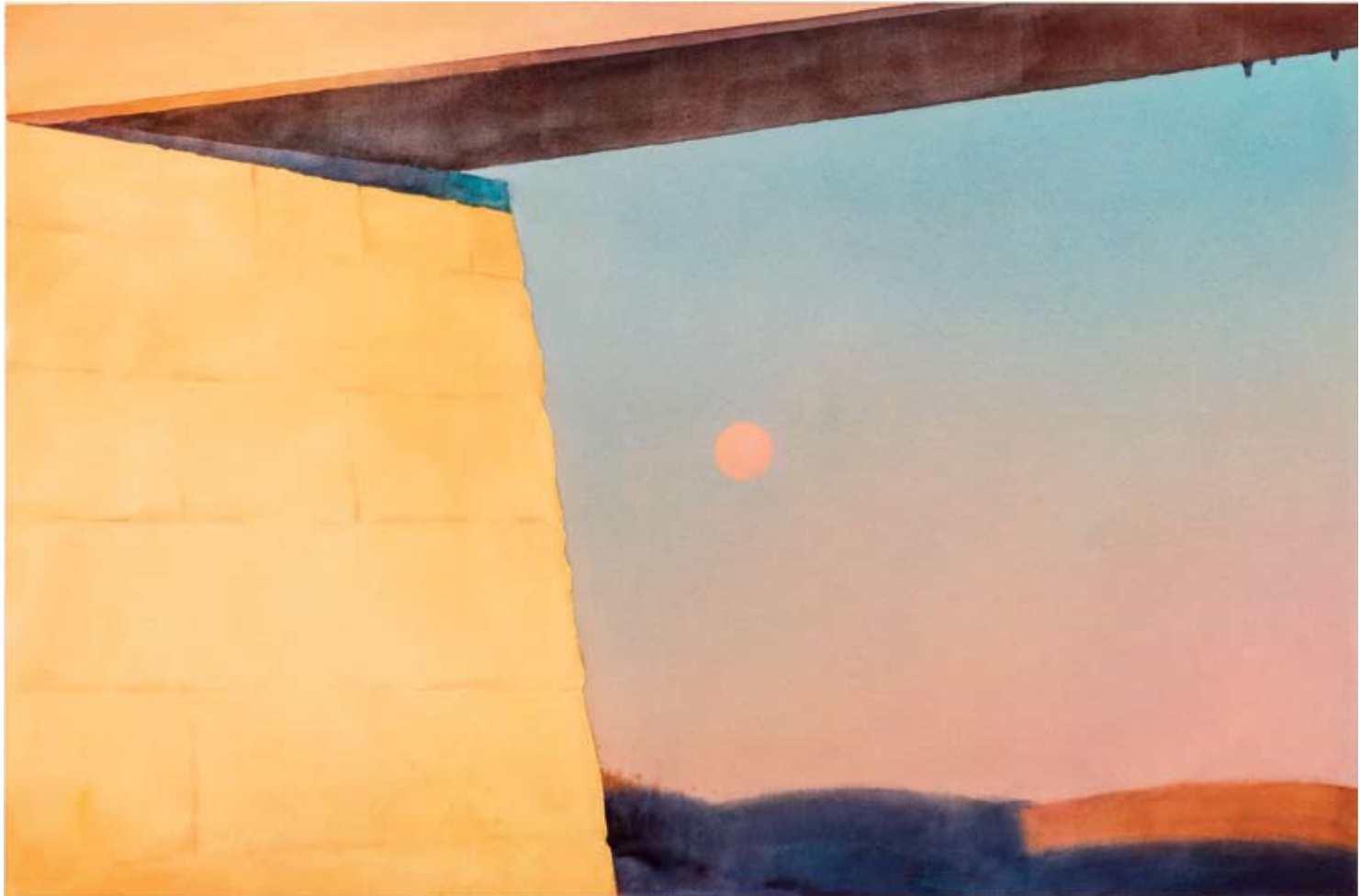
Marshall Point: Full Center 2014 watercolor 26 1/2 x 40 inches Private Collection