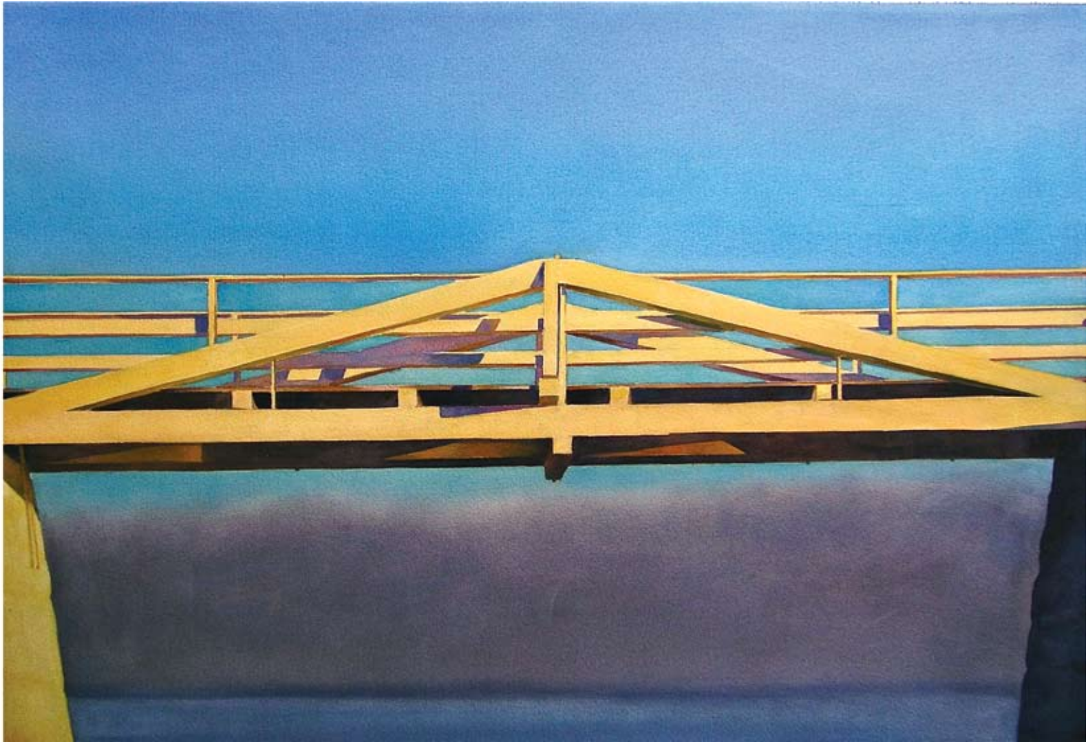
Marshall Point: Approaching Fog 2014 watercolor 27 1/2 x 39 inches