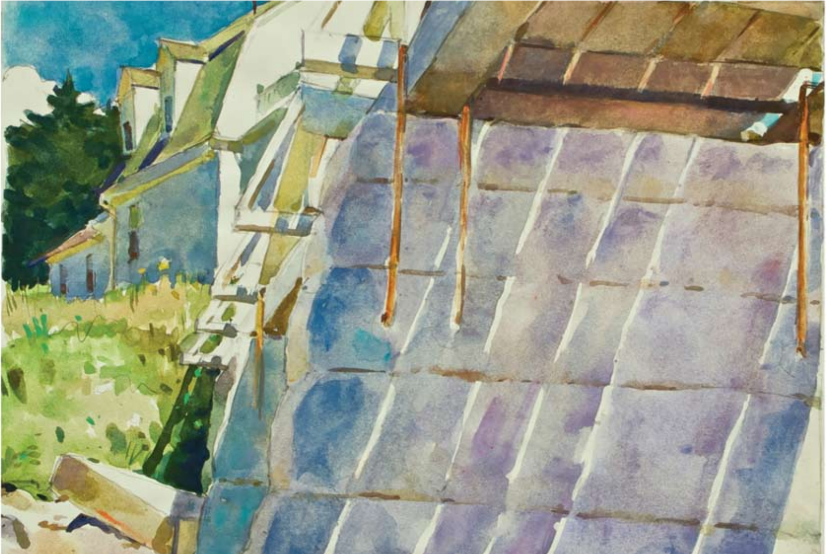
Marshall Point: Diagonal Light 2012 watercolor 7 x 9 1/4 inches