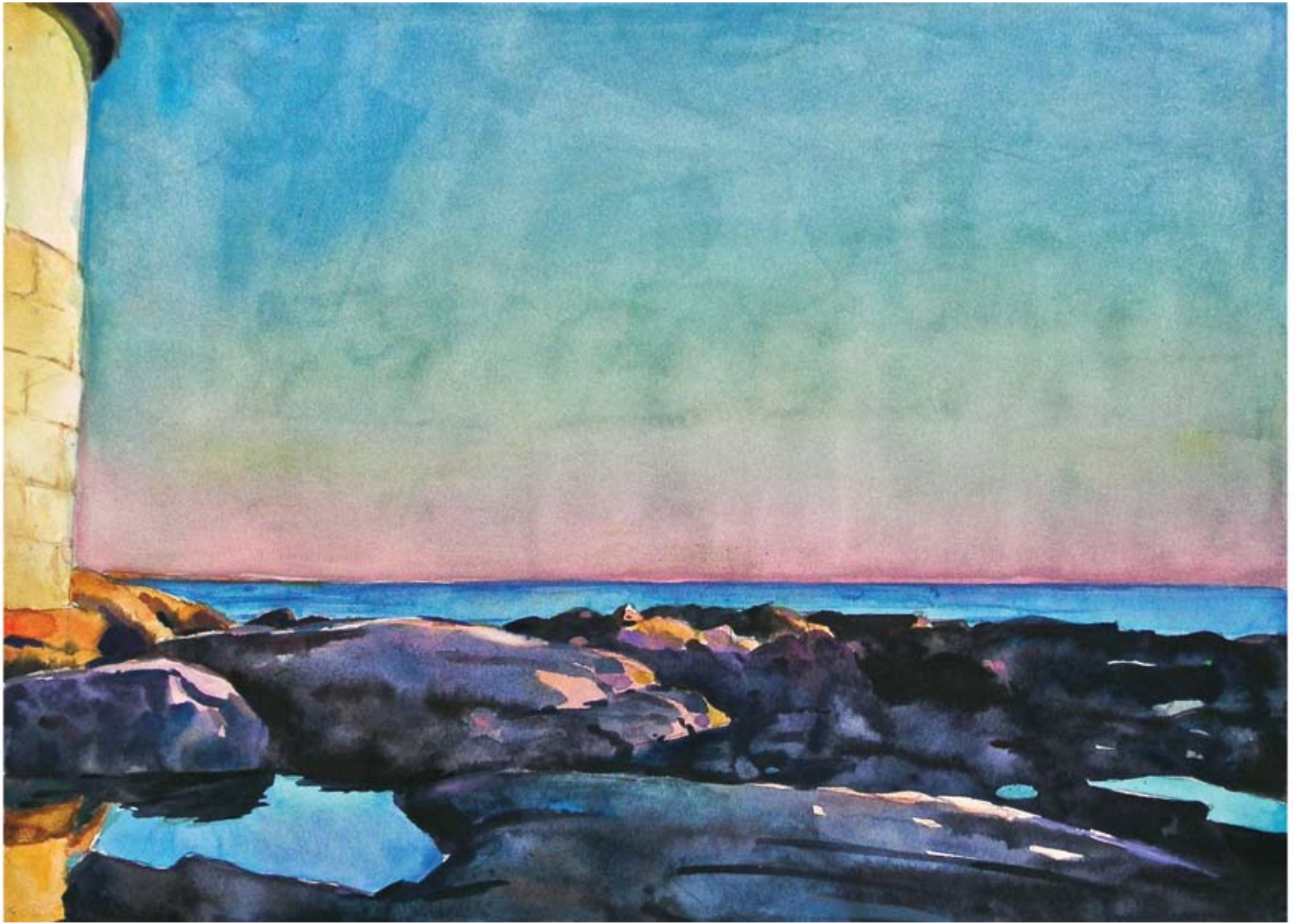
Marshall Point: Tidal Pools 2014 watercolor on Strathmore 8 1/2 x 12 inches