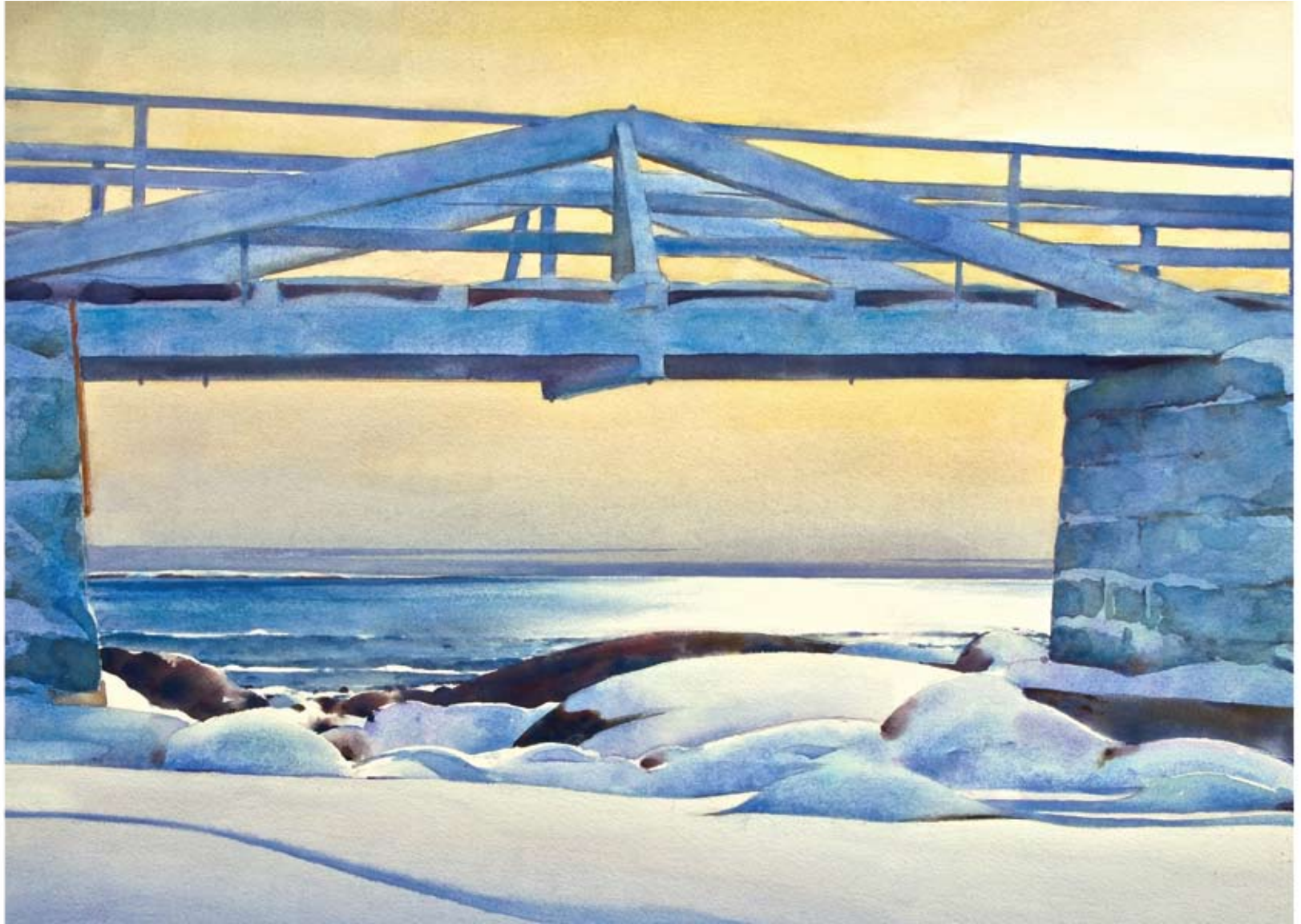
Marshall Point: Winter White #3 2014 watercolor 20 1/4 x 28 inches Private Collection