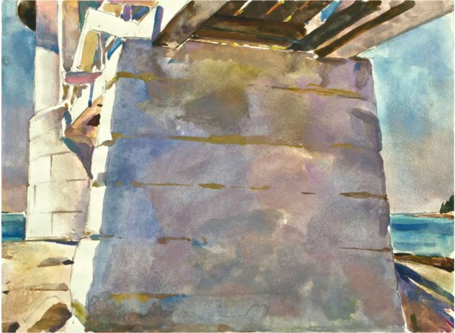
Marshall Point: Underneath the Bridge 2012 watercolor 6 3/4 x 9 1/4 inches