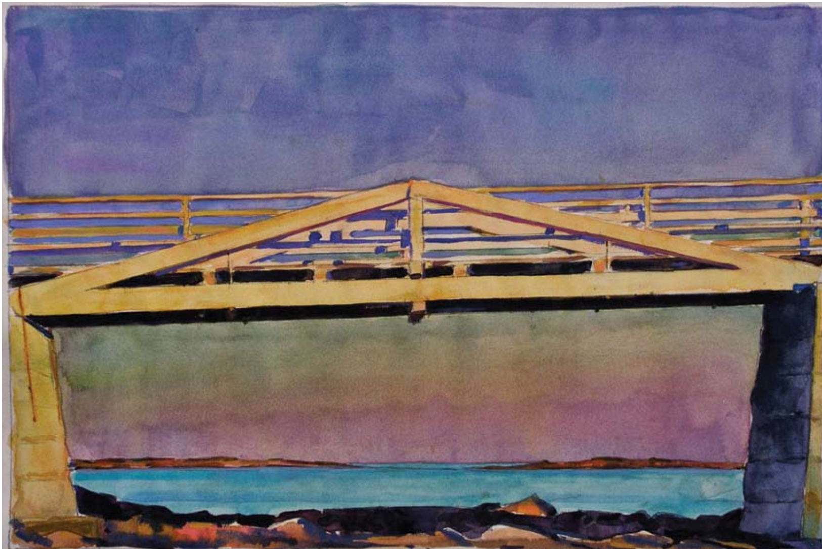
Marshall Point: Bridge to Light #2 2013 watercolor 8 1/4 x 12 1/2 inches