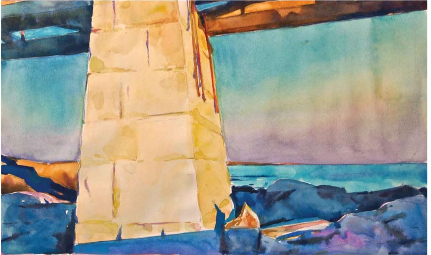
Marshall Point: Supporting Light 2013 watercolor 7 1/2 x 12 inches