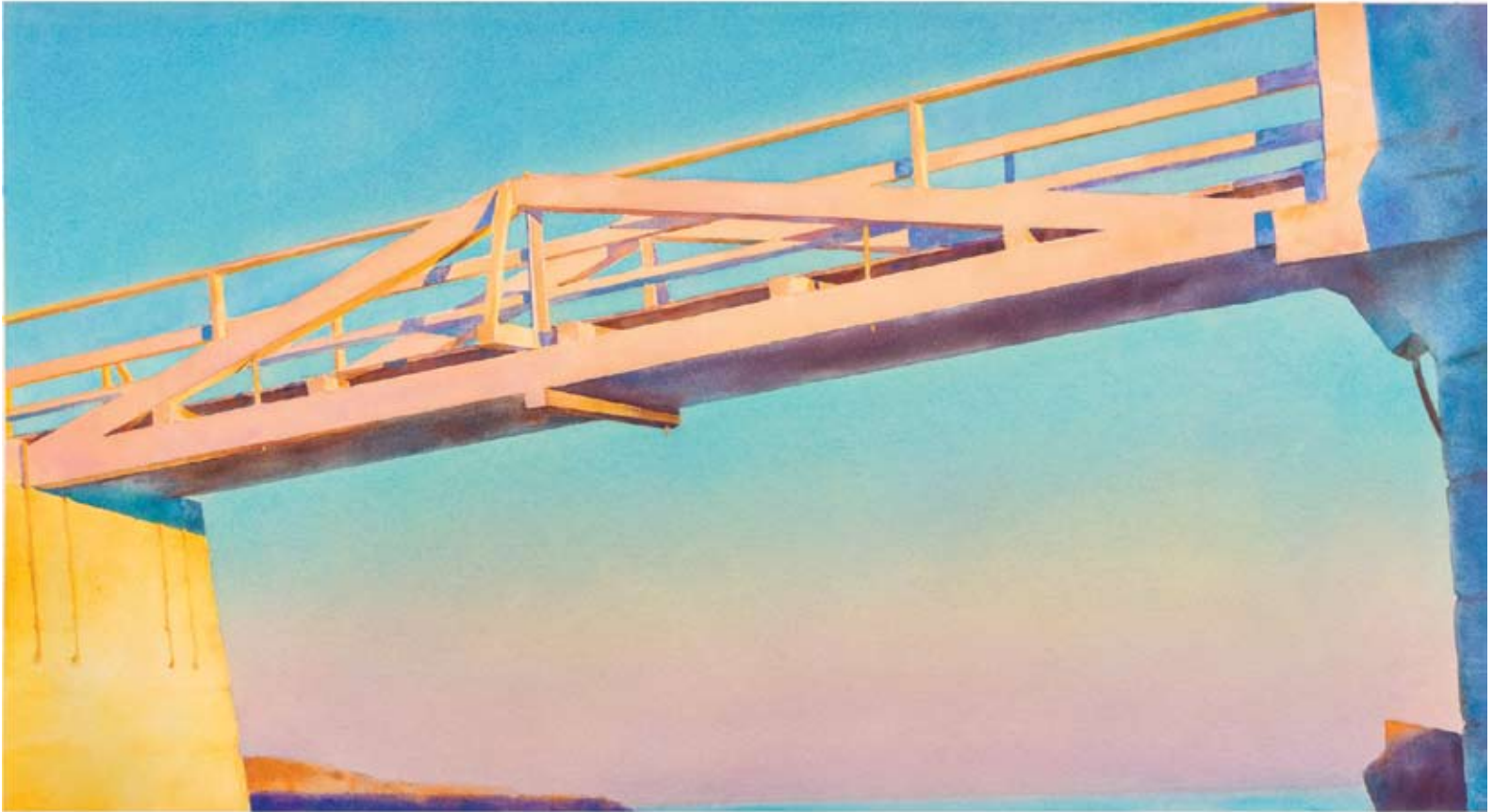
Marshall Point: Bridge to Light 2014 watercolor 26 1/2 x 40 inches