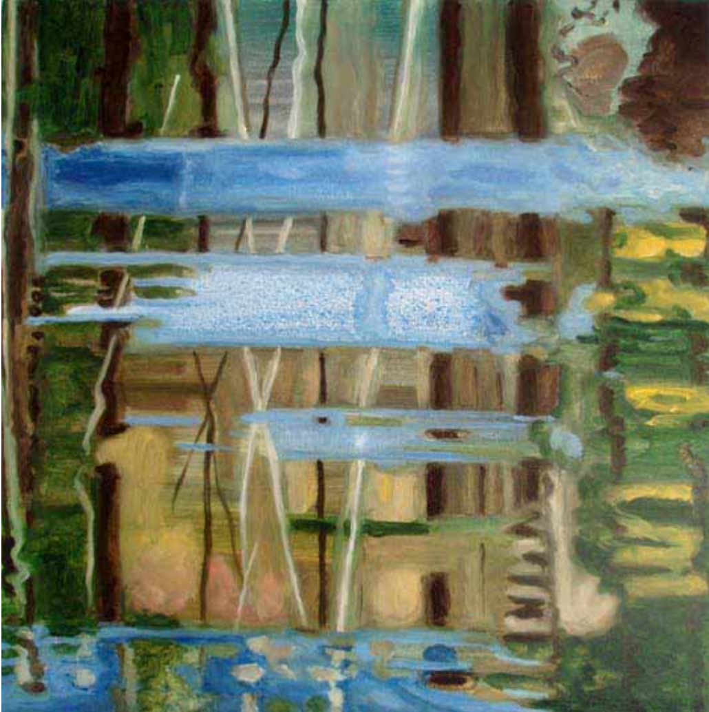
SURFACE: WIND AND THE REFLECTION, 2008 oil on canvas 16 x 16 inches