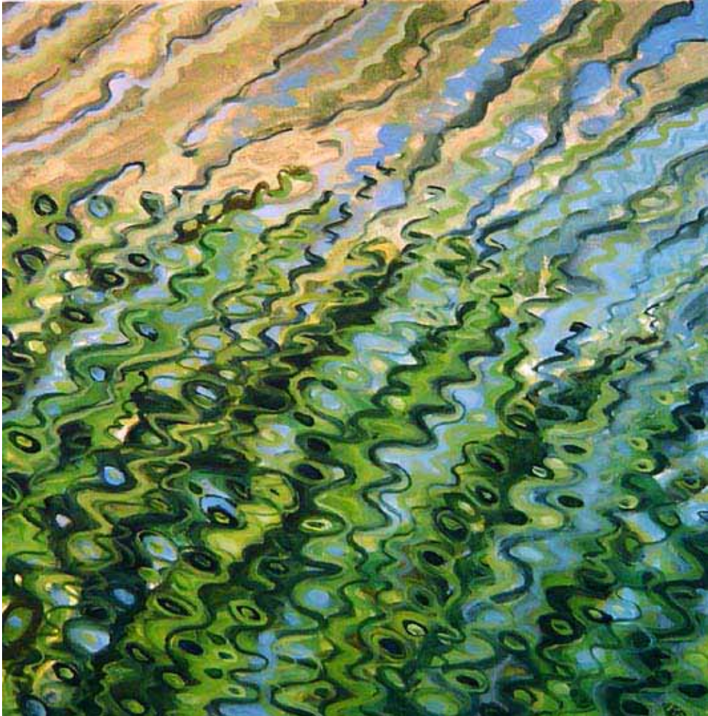
SURFACE: COVE, JUNE, 2008 oil on canvas 16 x 16 inches