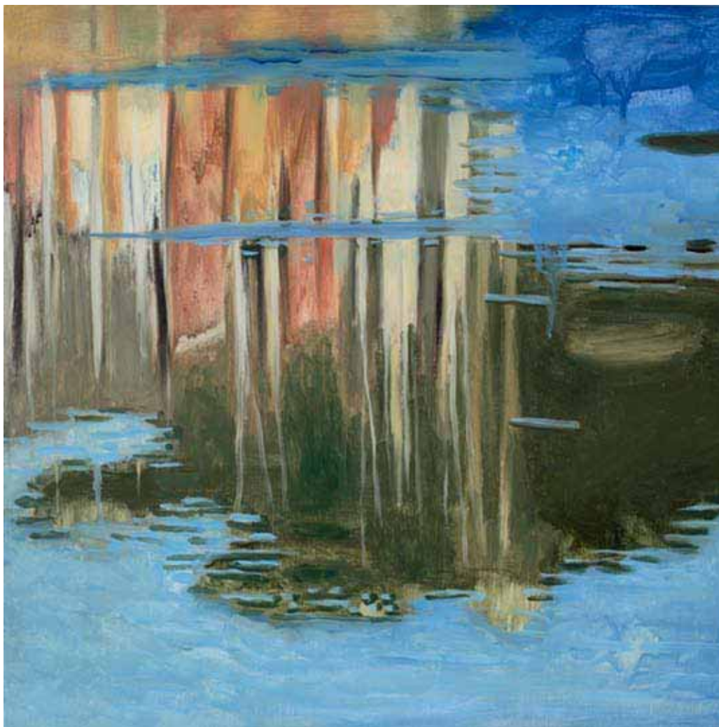
SURFACE: REFLECTION INTERRUPTED BY THE WIND, 2008 oil on panel 16 x 16 inches