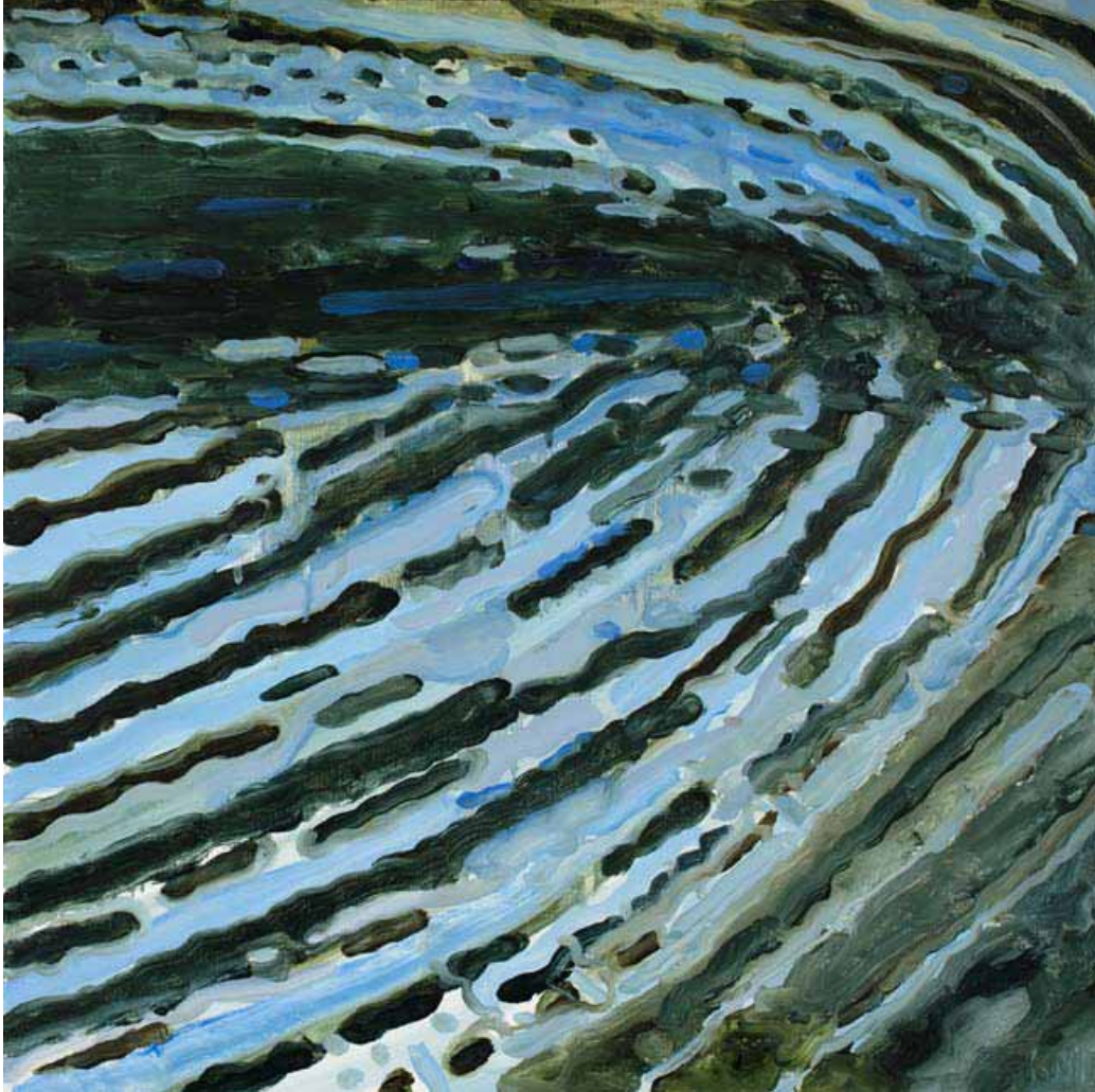
SURFACE: COVE, MARCH 18, INCOMING TIDE, 2008 oil on panel 15 1/2 x 15 1/2 inches