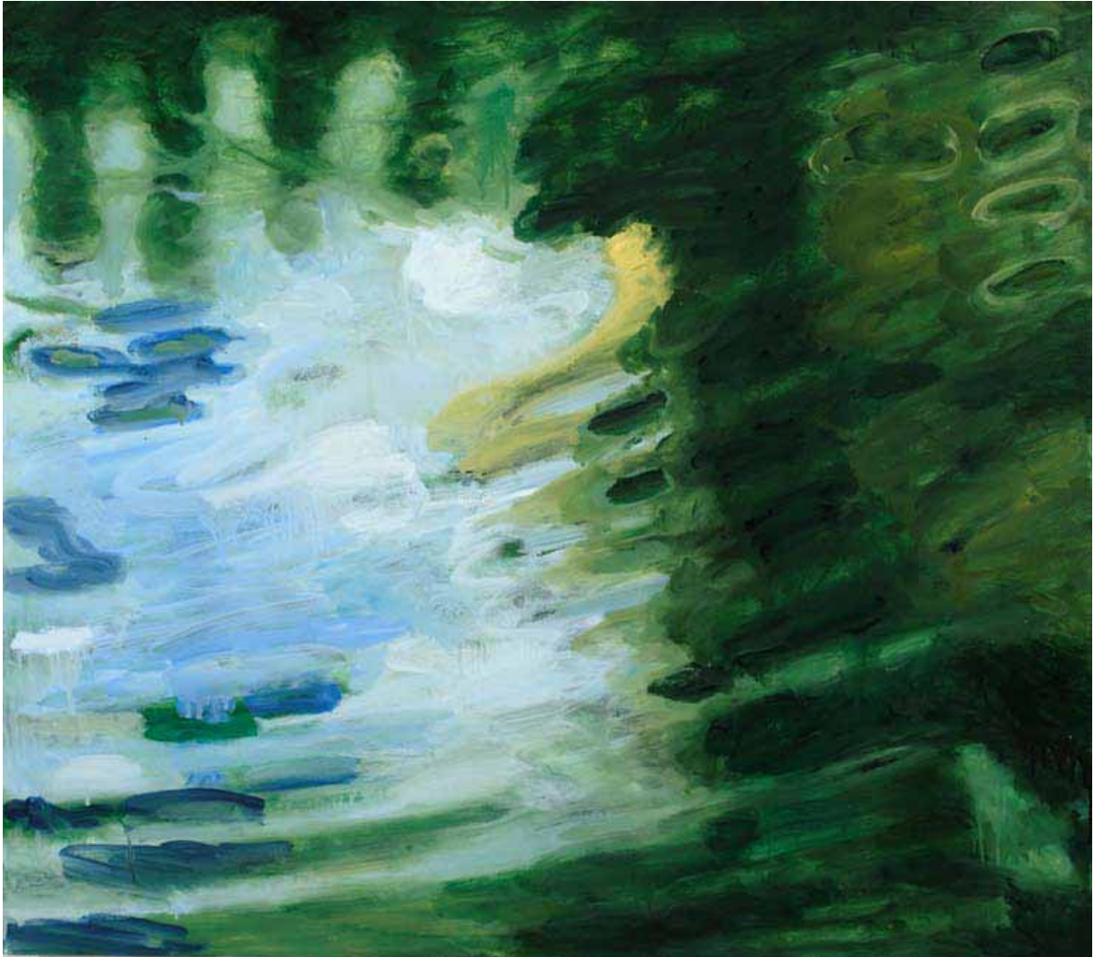
ROBINHOOD COVE, AUTUMN, 2007 oil on canvas 32 x 36 inches