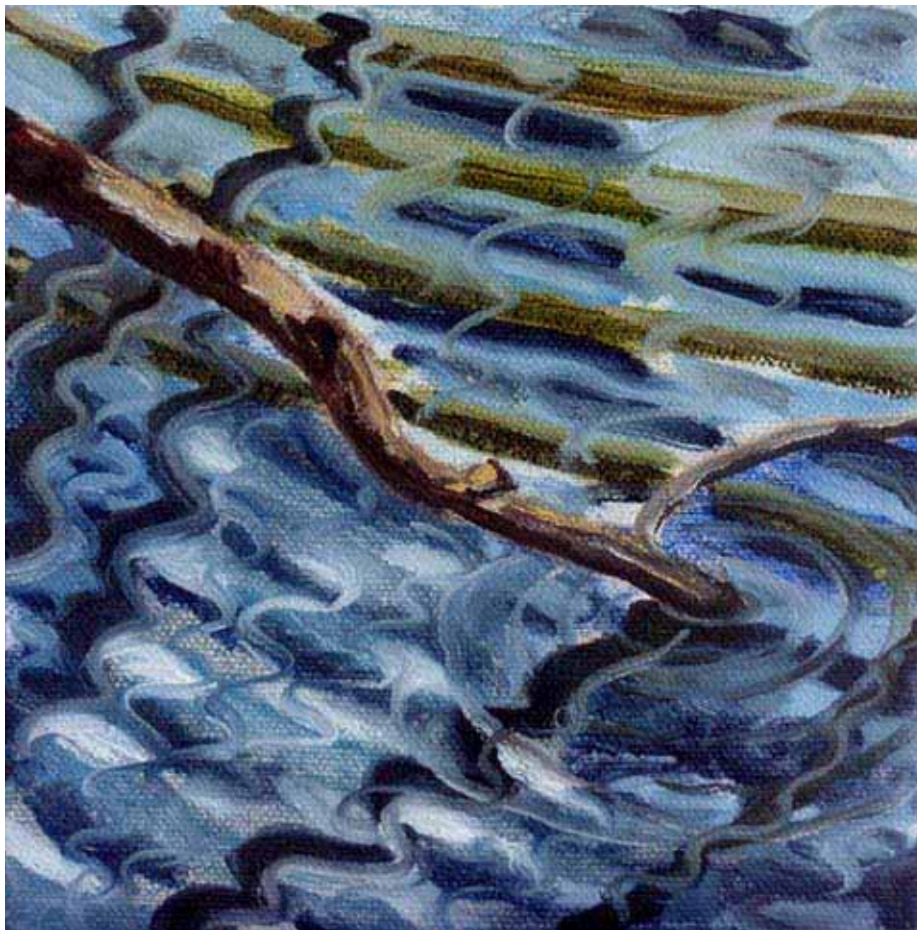
SURFACE: BRANCH AND REFLECTIONS, 2008 oil on canvas 6 x 6 inches