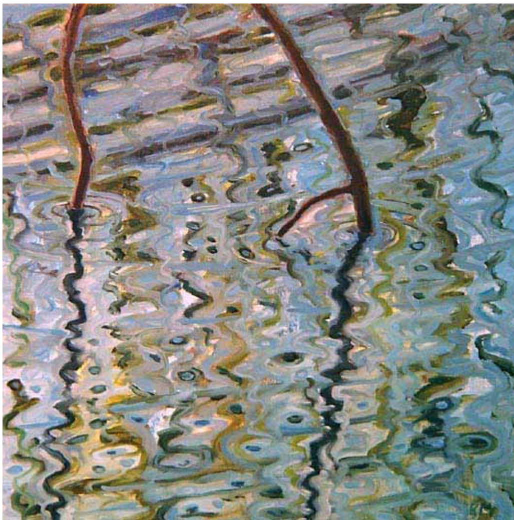
SURFACE: COVE AND TWO BRNACHES, 2008 oil on canvas 16 x 16 inches