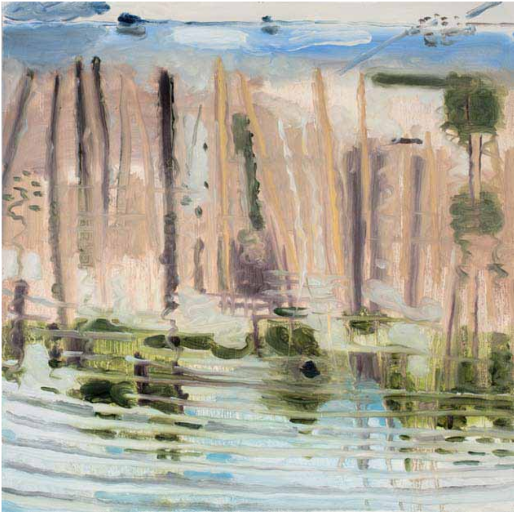
SURFACE: COVE, DEC 8, HIGH TIDE, 2007 oil on panel 15 1/2 x 15 1/2 inches