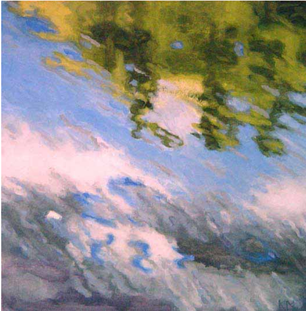
SURFACE: COVE, SKY ON THE WATER, 2008 oil on canvas 16 x 16 inches