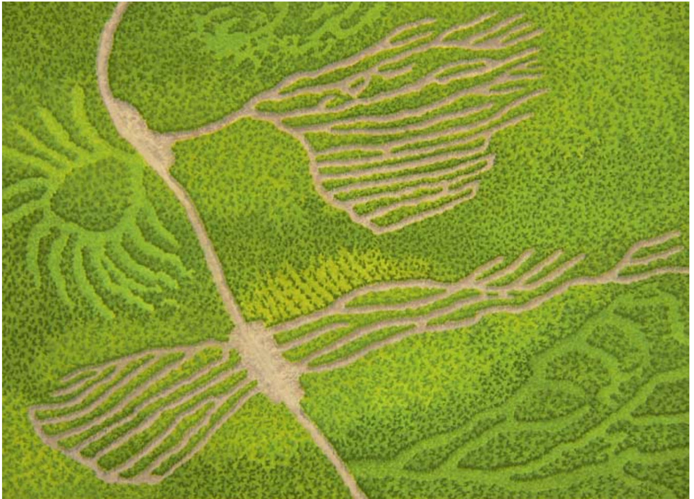
THE INDUSTRIAL FOREST 2015 casein on panel 22 x 16 inches