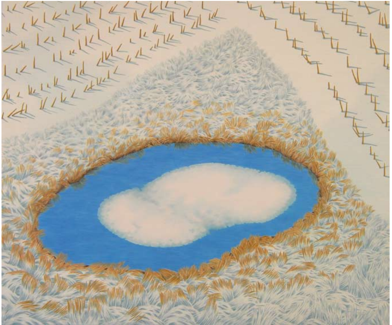
WINTER'S FALSE START 2014 casein on panel 20 x 24 inches