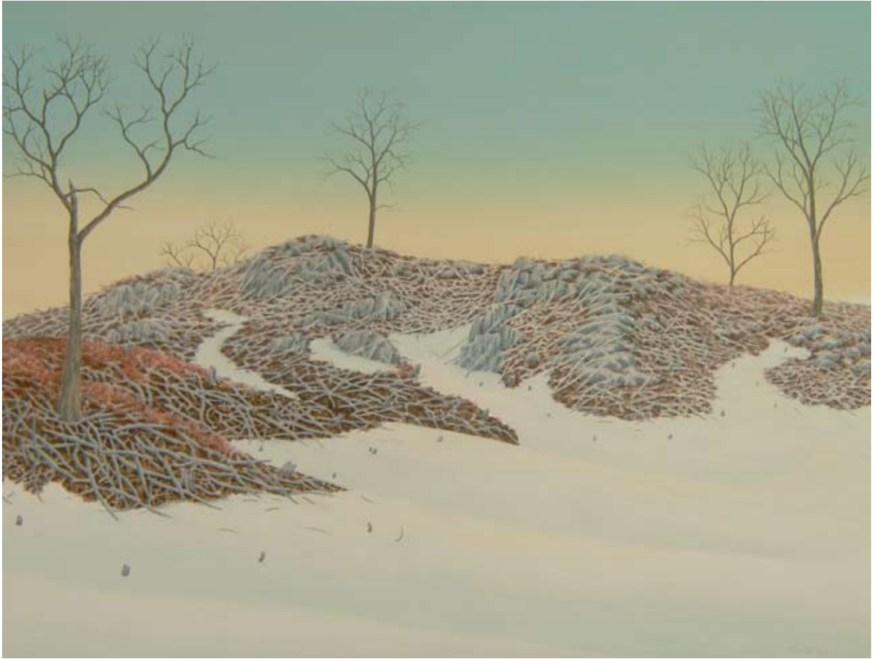
CLEARCUT WITH WILDLIFE TREES 2015 casein on panel 18 X 24 inches