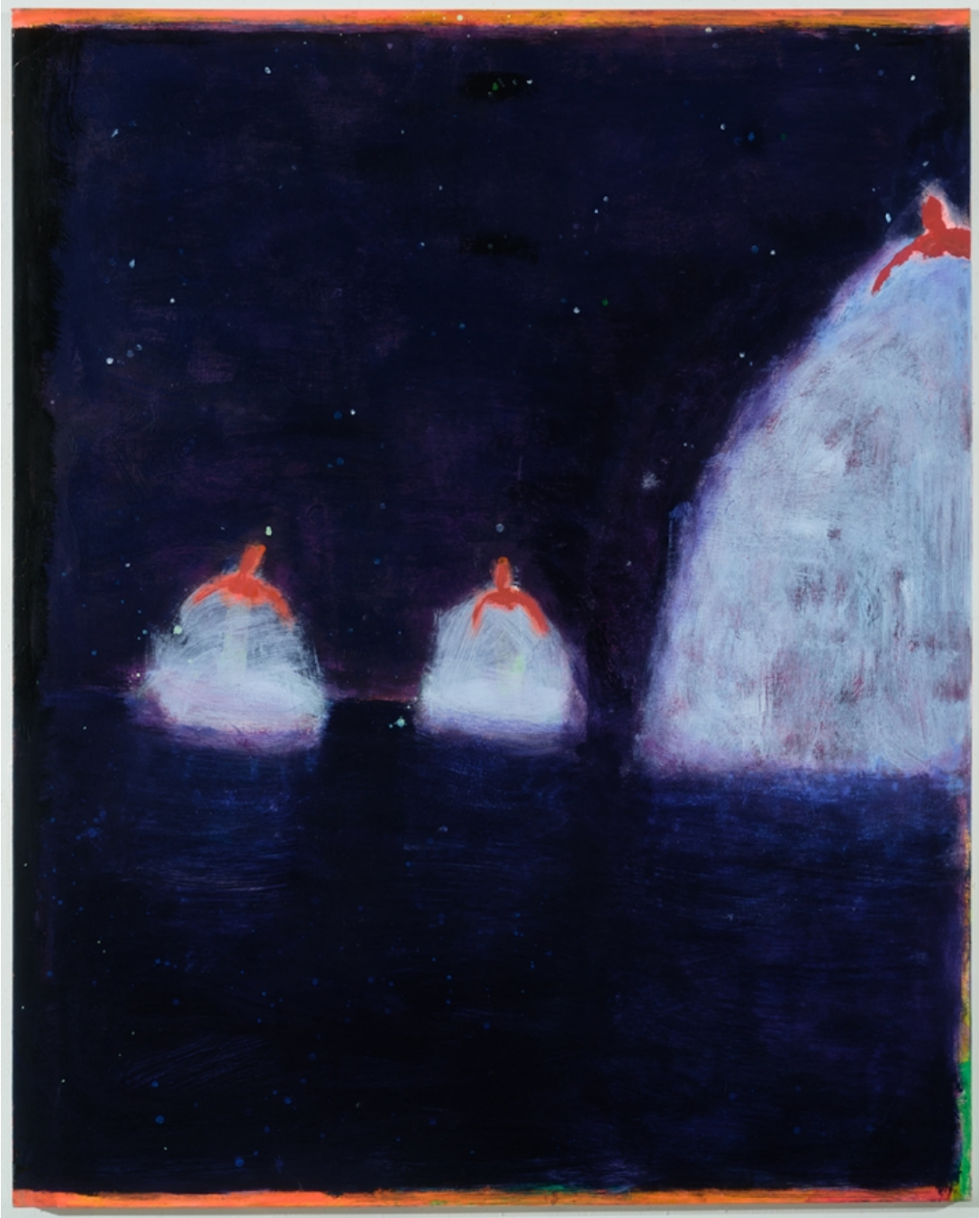
Katherine Bradford, "Geyser Gowns" (2016), acrylic on canvas, 60 x 48 inches