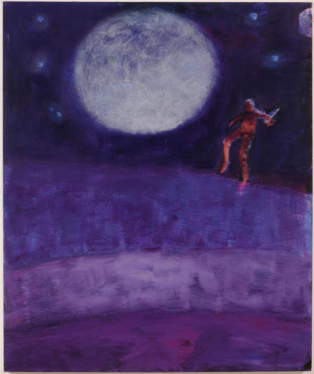
Katherine Bradford, "Moon Jumper" (2016), acrylic on canvas, 72 x 60 inches

In "Moon Jumper" (2016) a figure seems about to leap free of three wide, brushy bands in different hues of violet stacked on top of each other. A full moon floats above and to the left of the long-legged, featureless figure, who is holding what could be a wand or a giant pencil. Again, Bradford adds nothing to explain the painting, or even tries to give it a context. We feel as unmoored as the jumper.