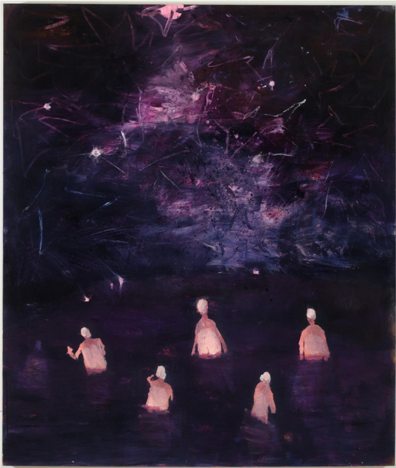
Katherine Bradford, "Storm at Sea" (2016), acrylic on canvas, 80 x 68 inches

In "Storm at Sea" (2016), five dowdy, white-haired figures (or are they wearing bathing caps?) in flesh-colored bathing suits are standing in the bottom half of the composition.