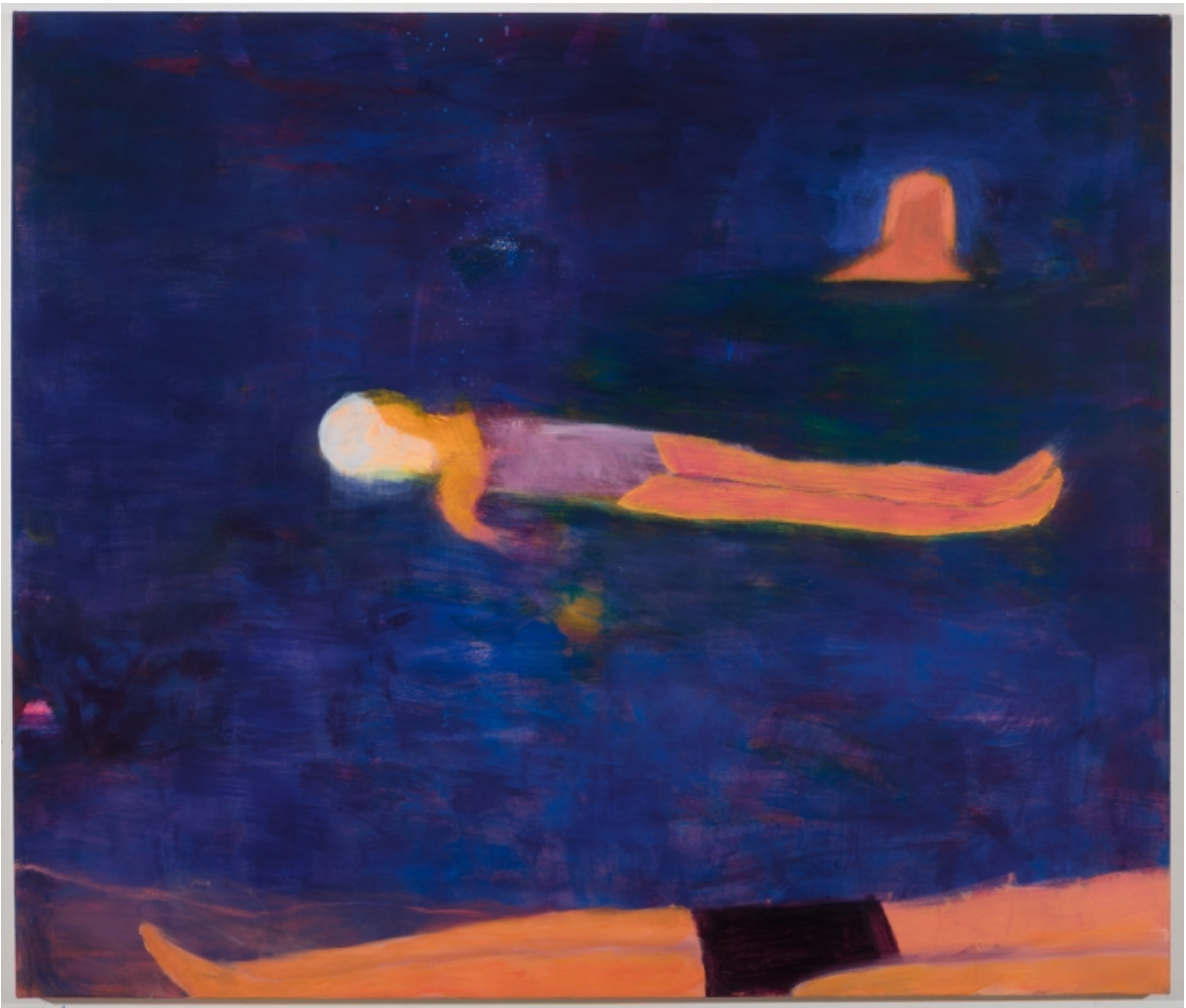
Katherine Bradford, "Pond Swimmers" (2016), acrylic on canvas. 68 x 80 inches

In each of the three paintings I have described, Bradford has depicted figures and abstract elements, giving each equal weight. Is the figure jumping toward the moon the artist's expression of a desire for freedom, or an awareness of how the individual can achieve such leaps only through magic (the wand)? By inviting viewers to complete a story that cannot be completed, she suspends us in a pictorial never-never land, between arrival and falling. The moon jumper inverts the story of Daedalus and Icarus. There is no sun to fly too close to. Wings did not lift this figure through layers of clouds to the cold air above the earth — a wand seems to have done it. Where does one find such a thing? Perhaps it can only be found in a painting.