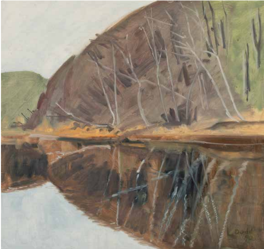
MINK BROOK NEAR THE RIVER, HANOVER, NH, FALL 1990 oil on panel 17 x 17 3/4 inches