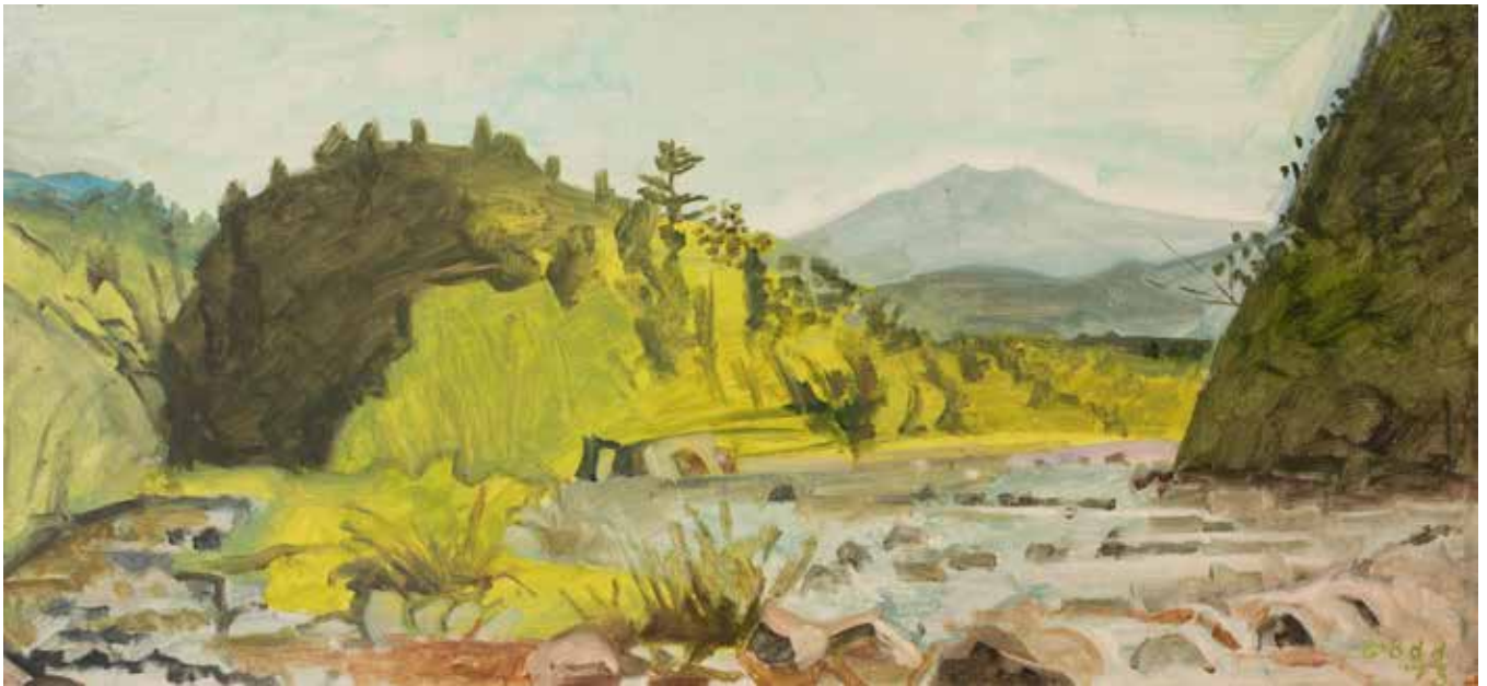
WHITE MOUNTAINS, NH 1978 oil on masonite 12 x 25 3/4 inches