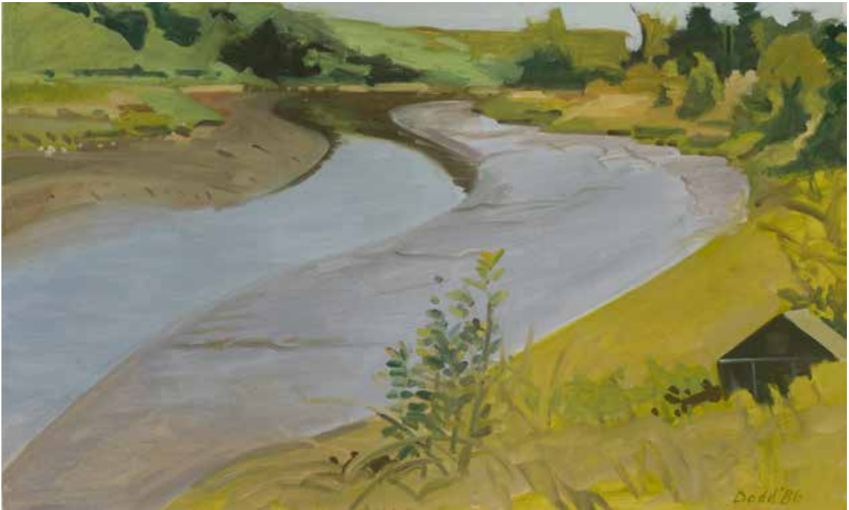
LOWTIDE INLET, THOMASTON 1986 oil on masonite 12 x 20 inches