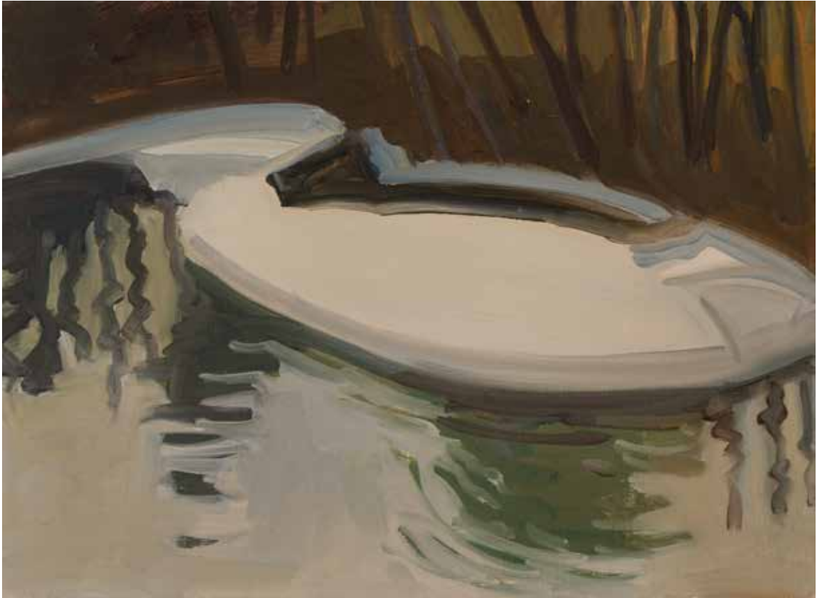
ICE AT POND EDGE 2005 oil on masonite 8 x 11 inches