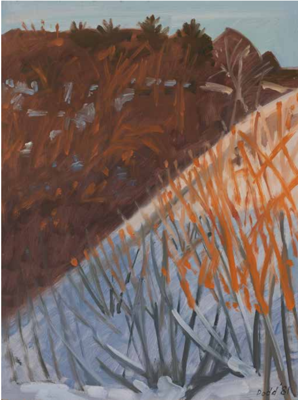
WINTER DIAGONAL 1981 oil on masonite 16 x 12 inches