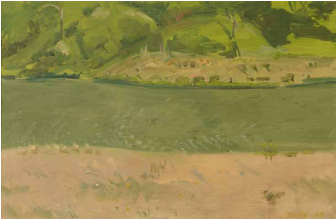
INLET, THOMASTON 1986 oil on masonite 11 x 17 inches