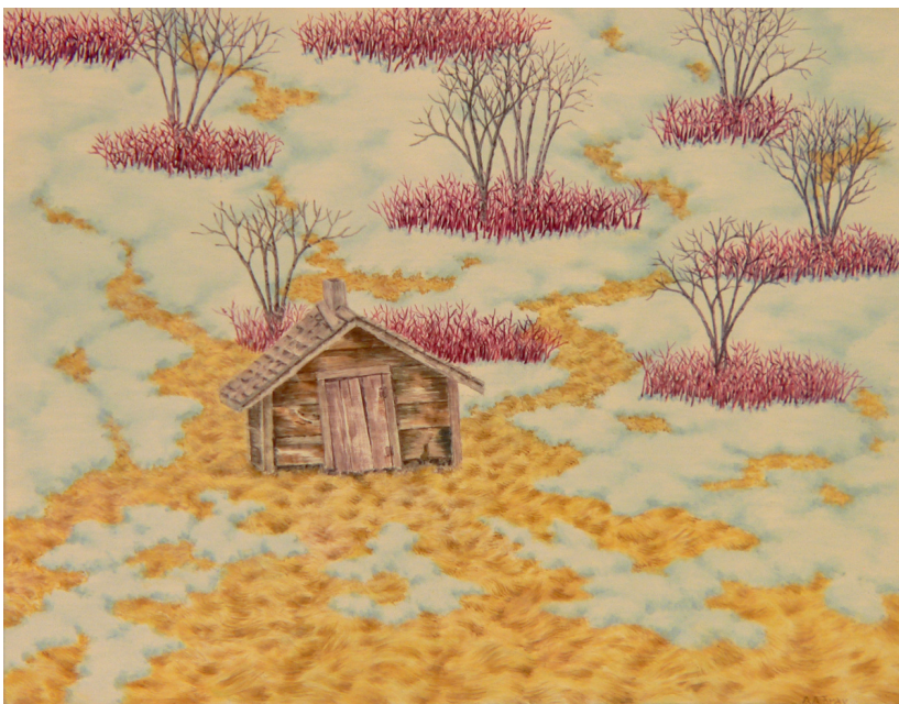
Alan Bray, "Spring House," 2018, casein on panel, 8 by 11 inches, at Caldbeck Gallery.

From a curatorial standpoint, I have to give Caldbeck a big thumbs up for this move. Watts is a challenge for me, as I imagine he's going to be for many. And that's a good thing.