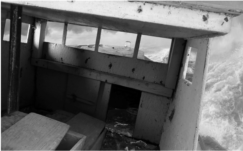
Jeffery Becton, "Caught Out," digital montage, 20.4 by 33 inches, at Courthouse Gallery.

enough. And from that perspective, contemporary photography was born.