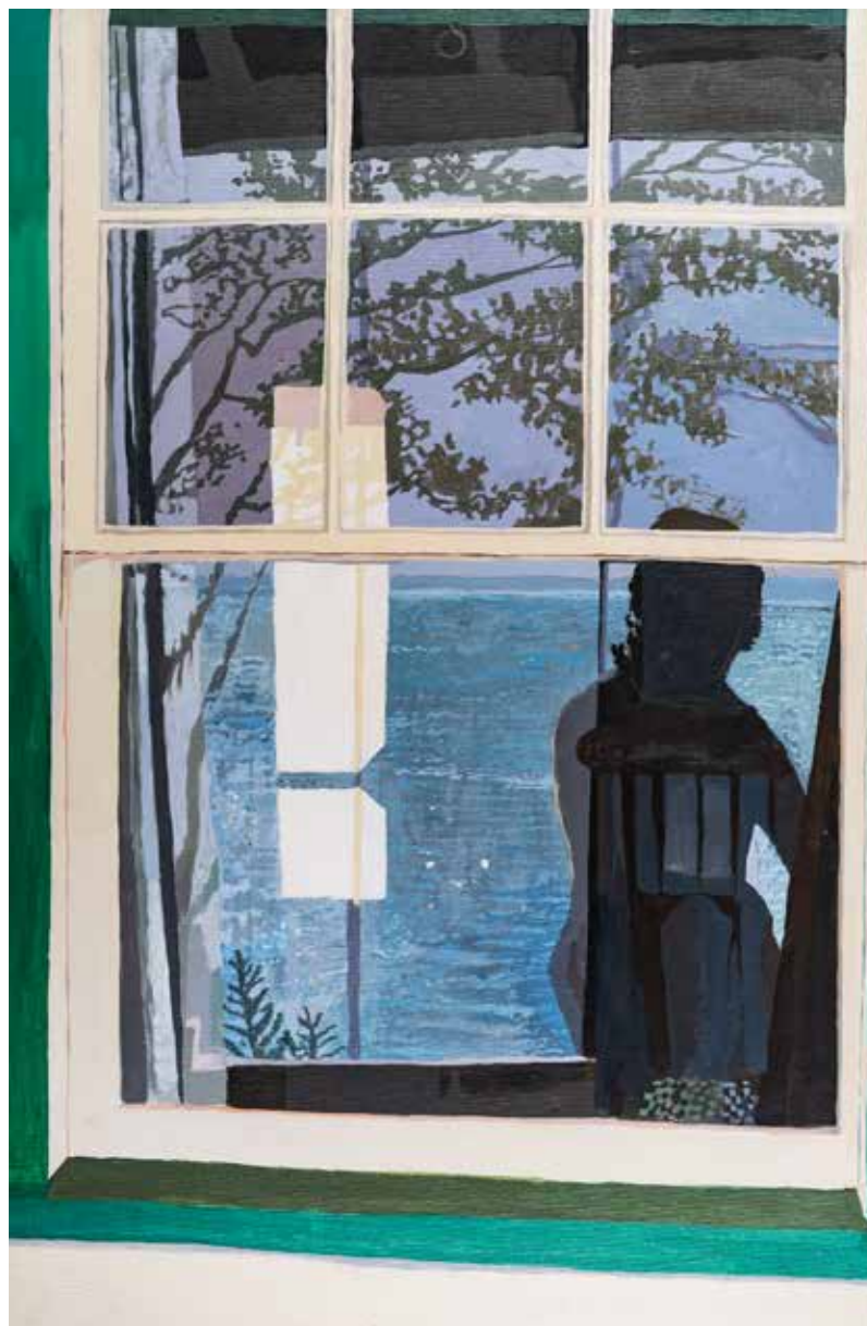
ON REFLECTION 1970 oil on canvas 38 x 24 inches