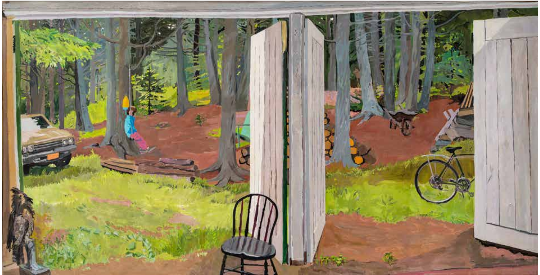
SUMMER STUDIO 1975 acrylic on canvas 46 x 90 inches