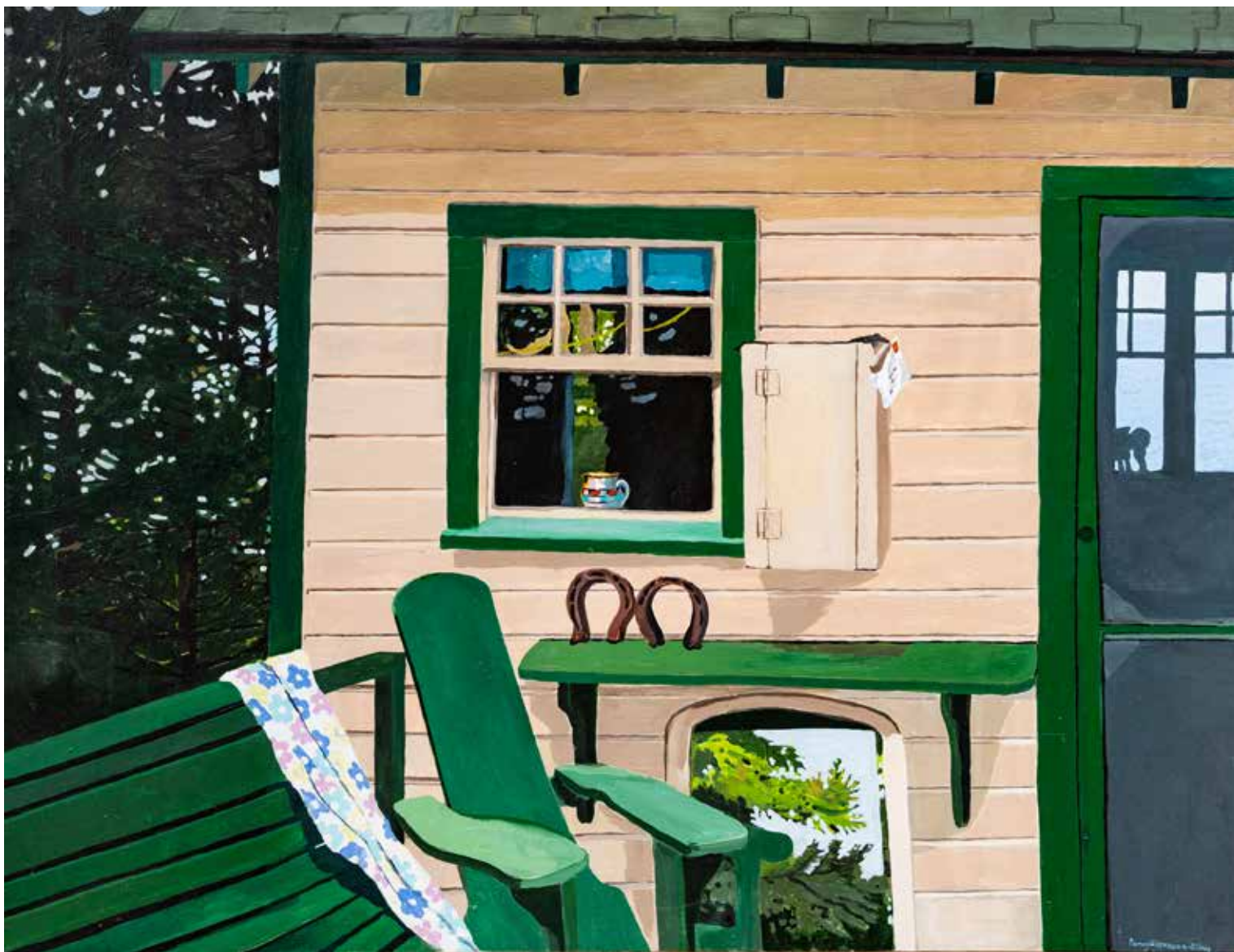
A PLACE ON THE WATER 1975 acrylic on canvas 46 x 60 inches