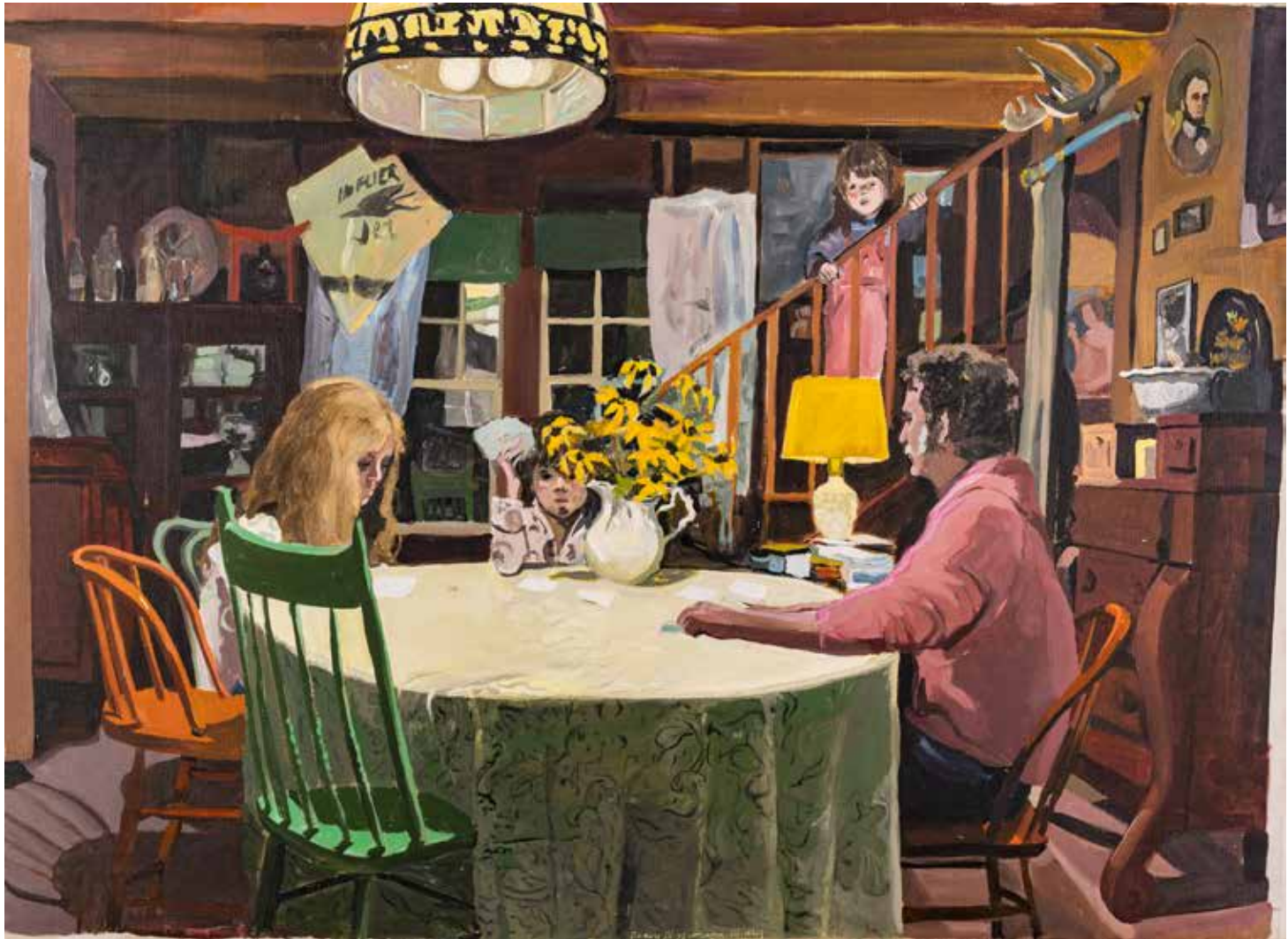
CARD PLAYERS 1968 acrylic on canvas 30 x 42 inches