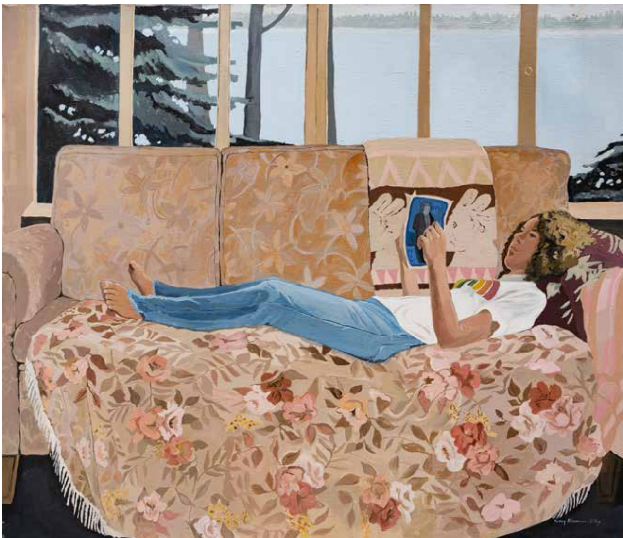
SUMMER READING 1972 oil on canvas 42 x 50 inches