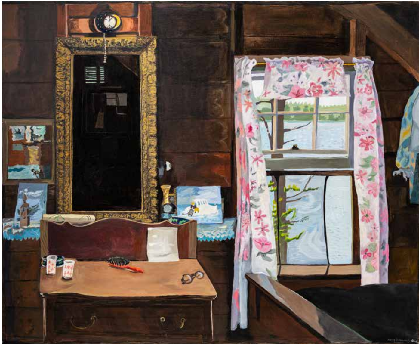
CUSHING ATTIC 1970 acrylic on canvas 40 x 50 inches