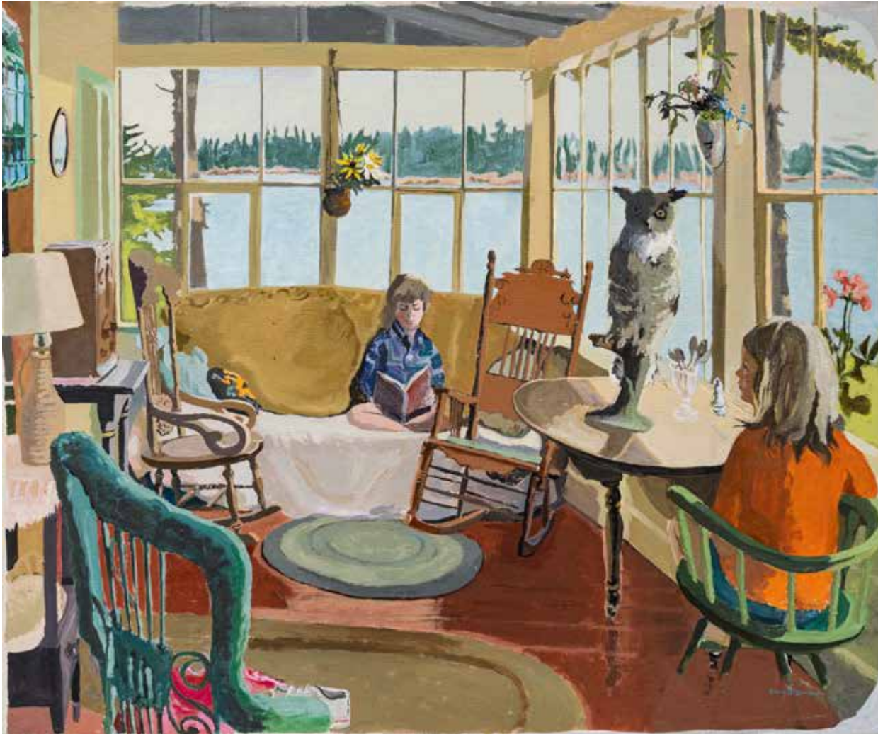
SUMMER IN MAINE 1968 acrylic on canvas 37 x 43 inches