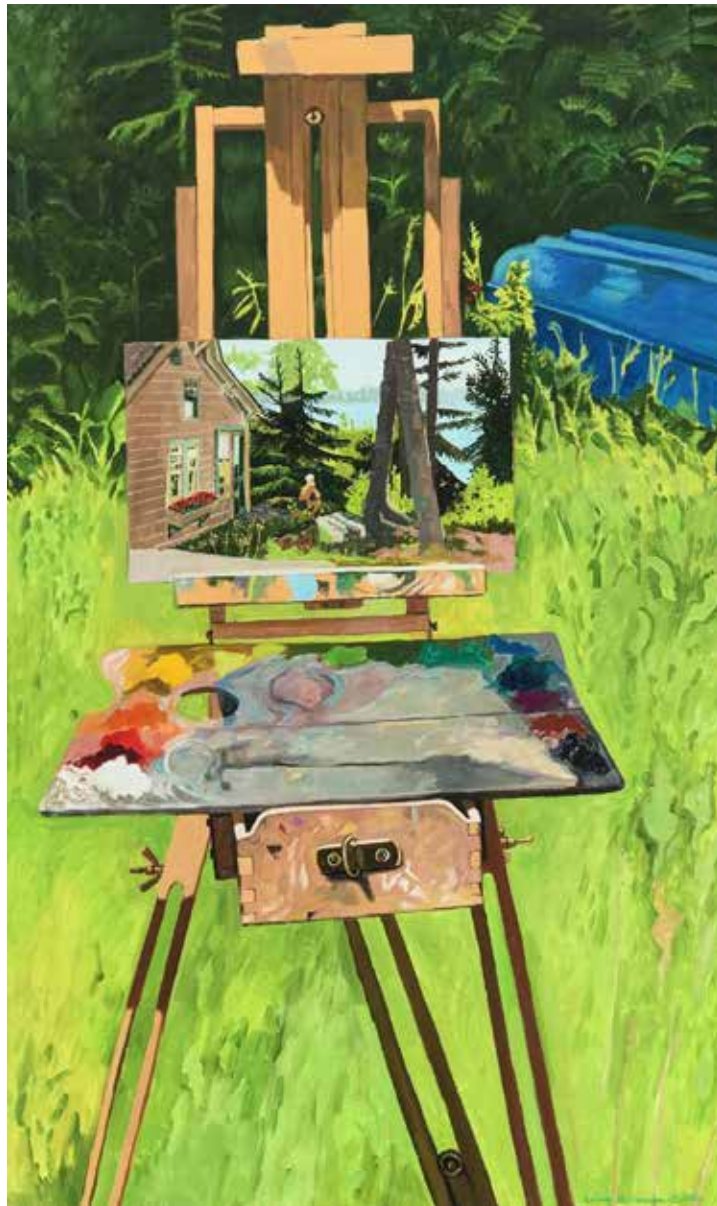
AS YOU LIKE IT 1981 oil on canvas 50 x 30 inches