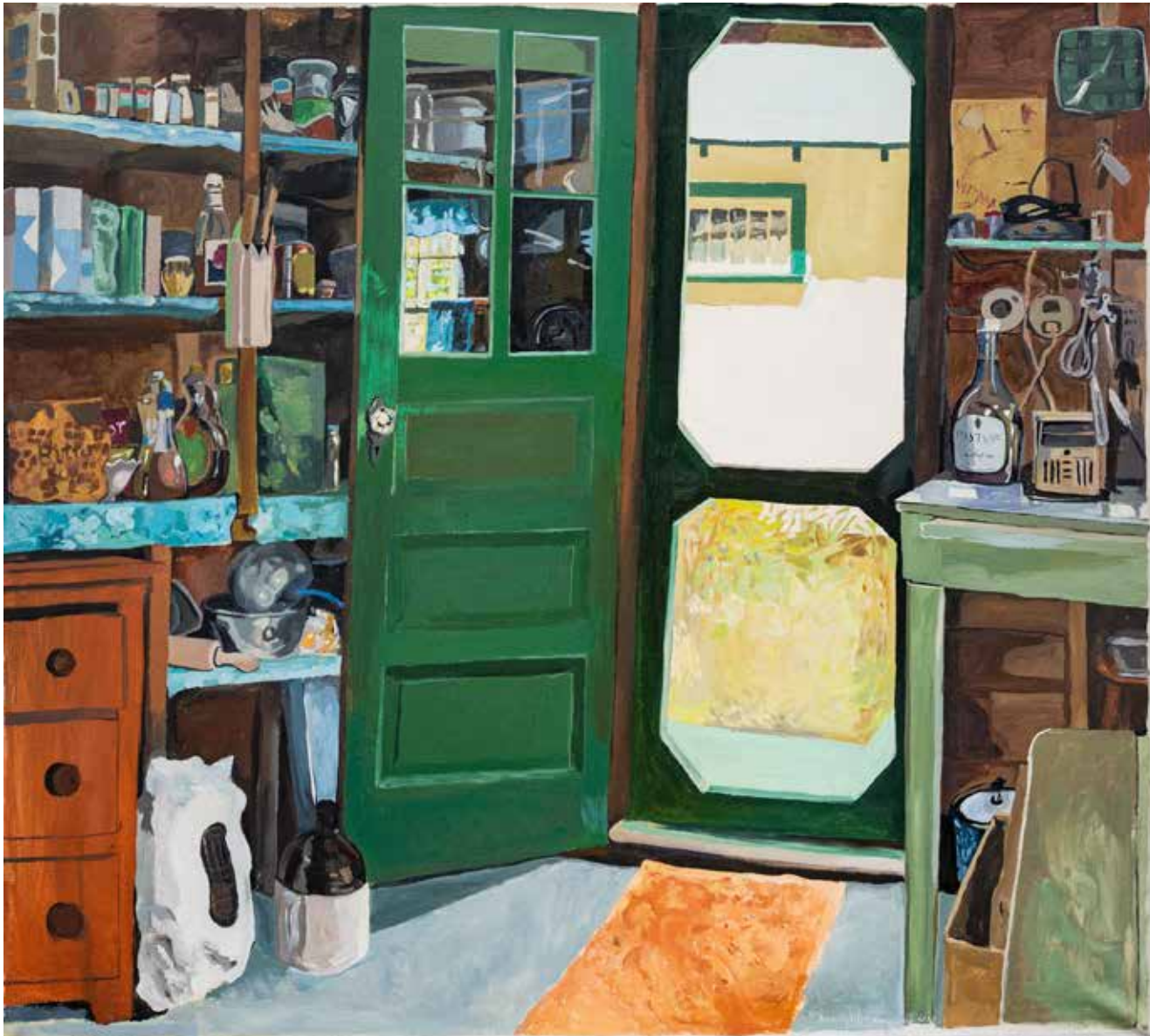
MAINE COUNTRY KITCHEN 1971 acrylic on canvas 37 x 43 inches