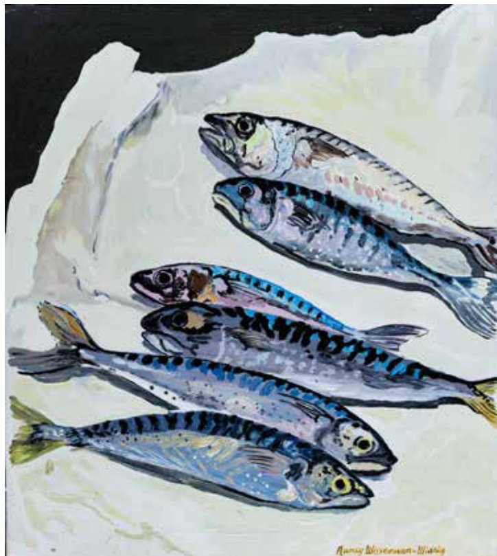
MACKERAL ON PAPER 1974 acrylic on canvas 16 x 18 inches