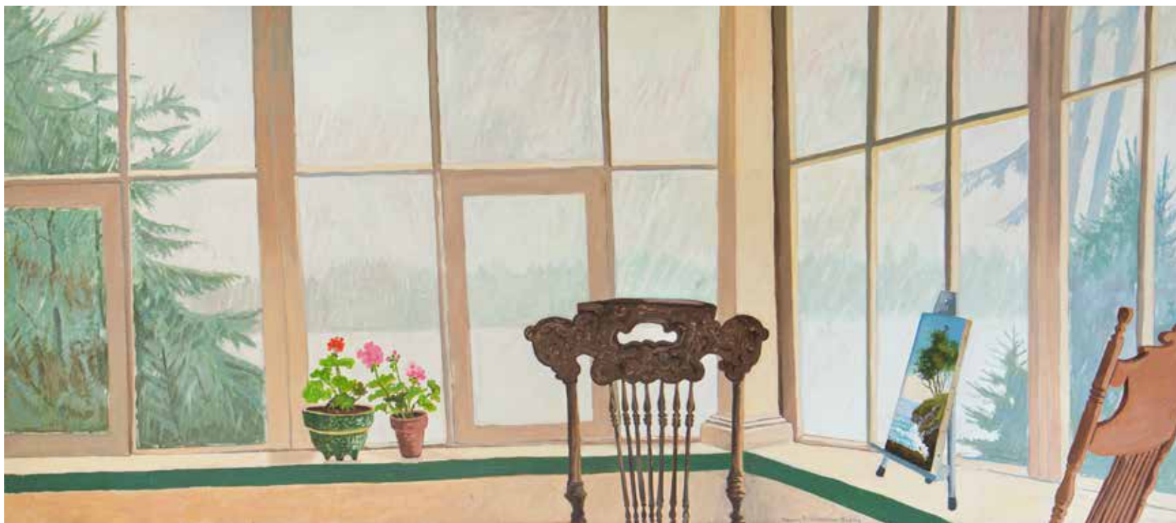
JUNE RAIN oil on canvas 26 x 56 inches