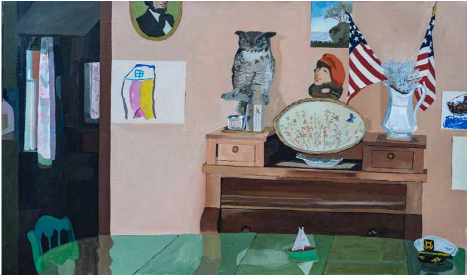
CUSHING INTERIOR 1970 acrylic on canvas 50 x 30 inches