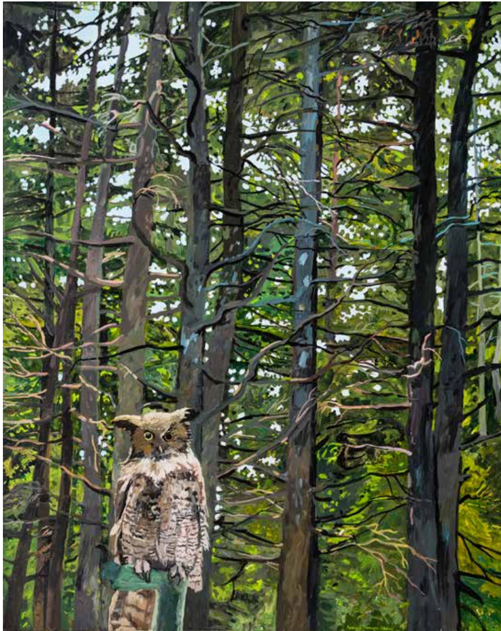
OWL IN THE FOREST 1975 acrylic on canvas 60 x 48 inches