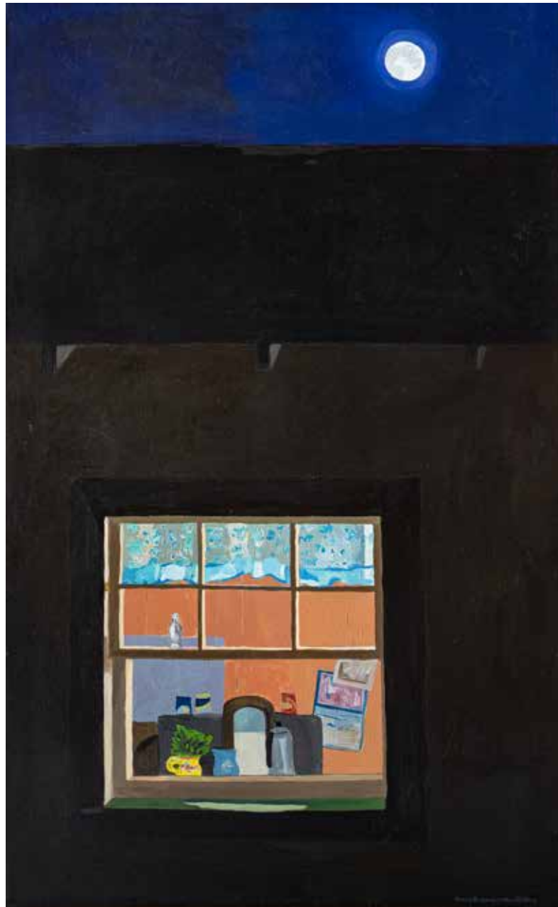
NOCTURNE 1975 oil on canvas 48 x 30 inches