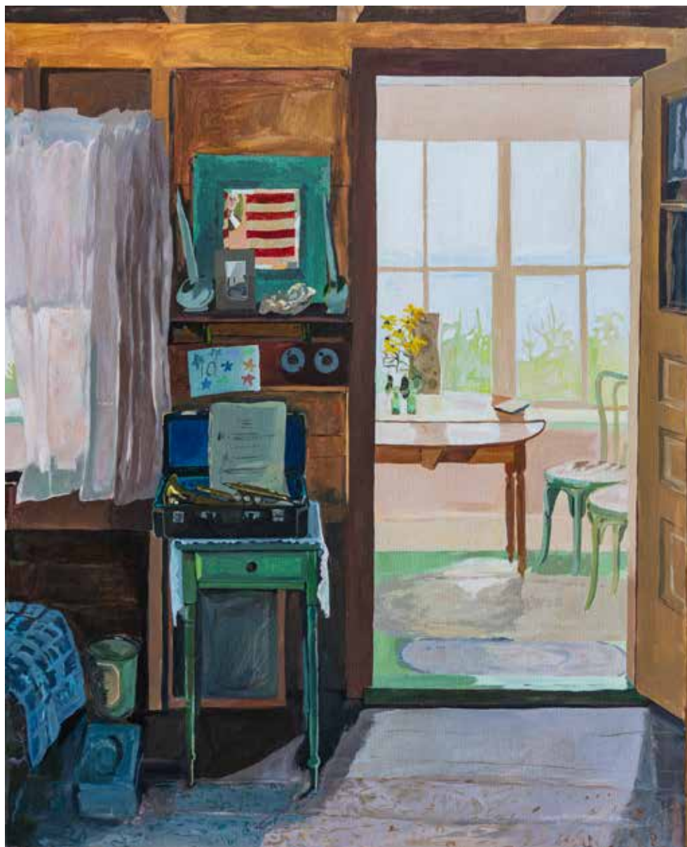
FOURTH OF JULY 1970 acrylic on canvas 50 x 40 inches