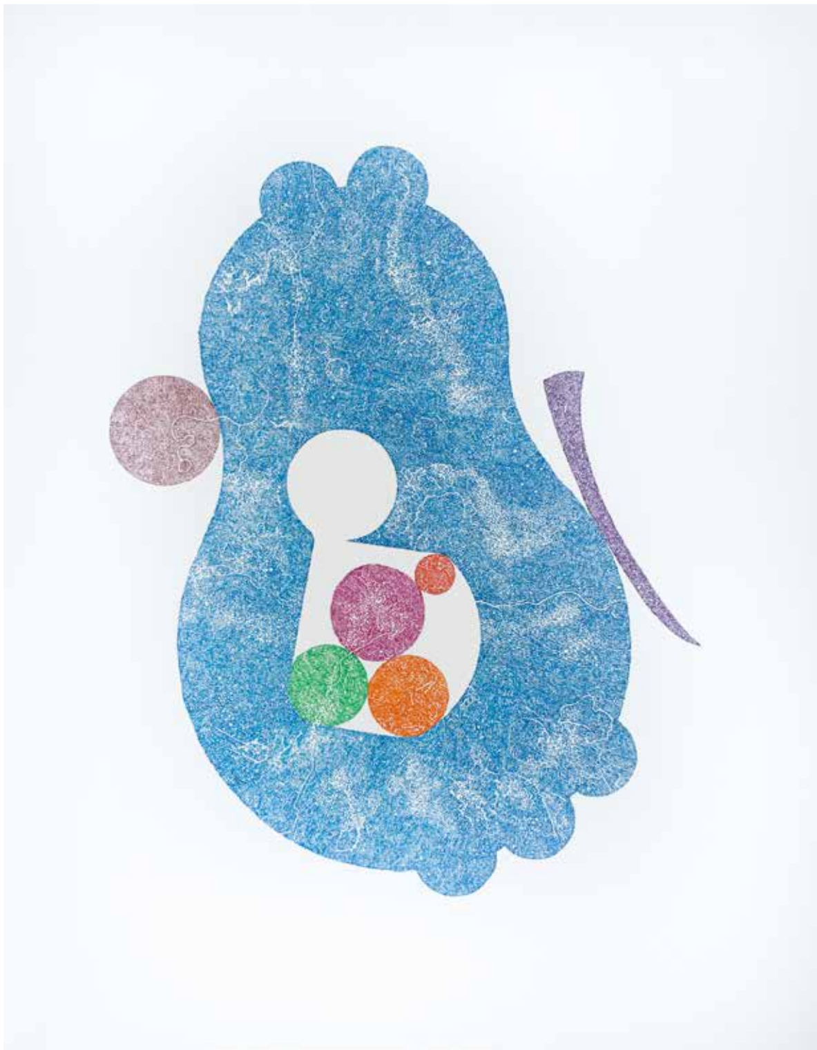
MUSIC HOUSE 2020 ink on paper 30 x 22 inches David Raymond