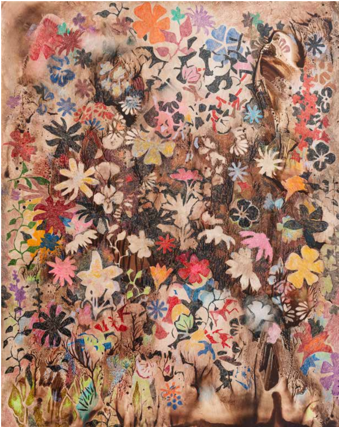
IN LL'S GARDEN #3 2020 colored pencils and watercolor 29 x 22 inches John Wissemann