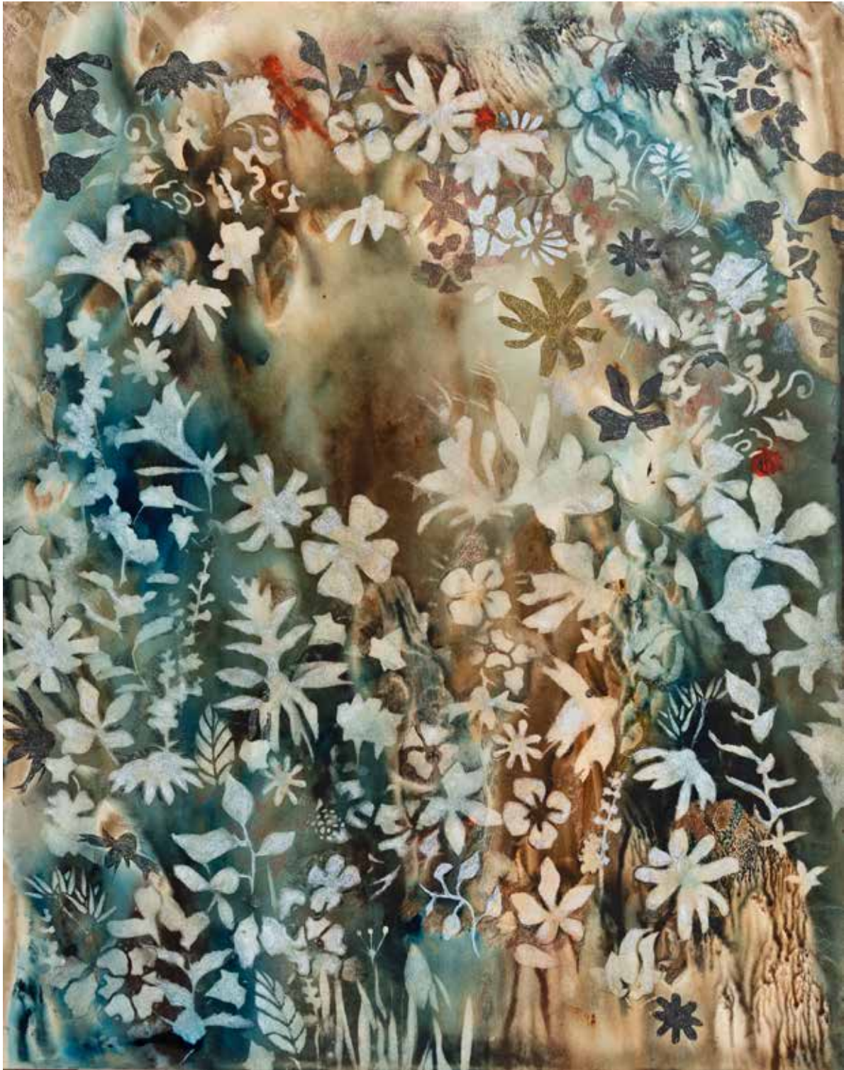
IN LL'S GARDEN #1 2020 colored pencils and watercolor 29 x 22 inches John Wissemann