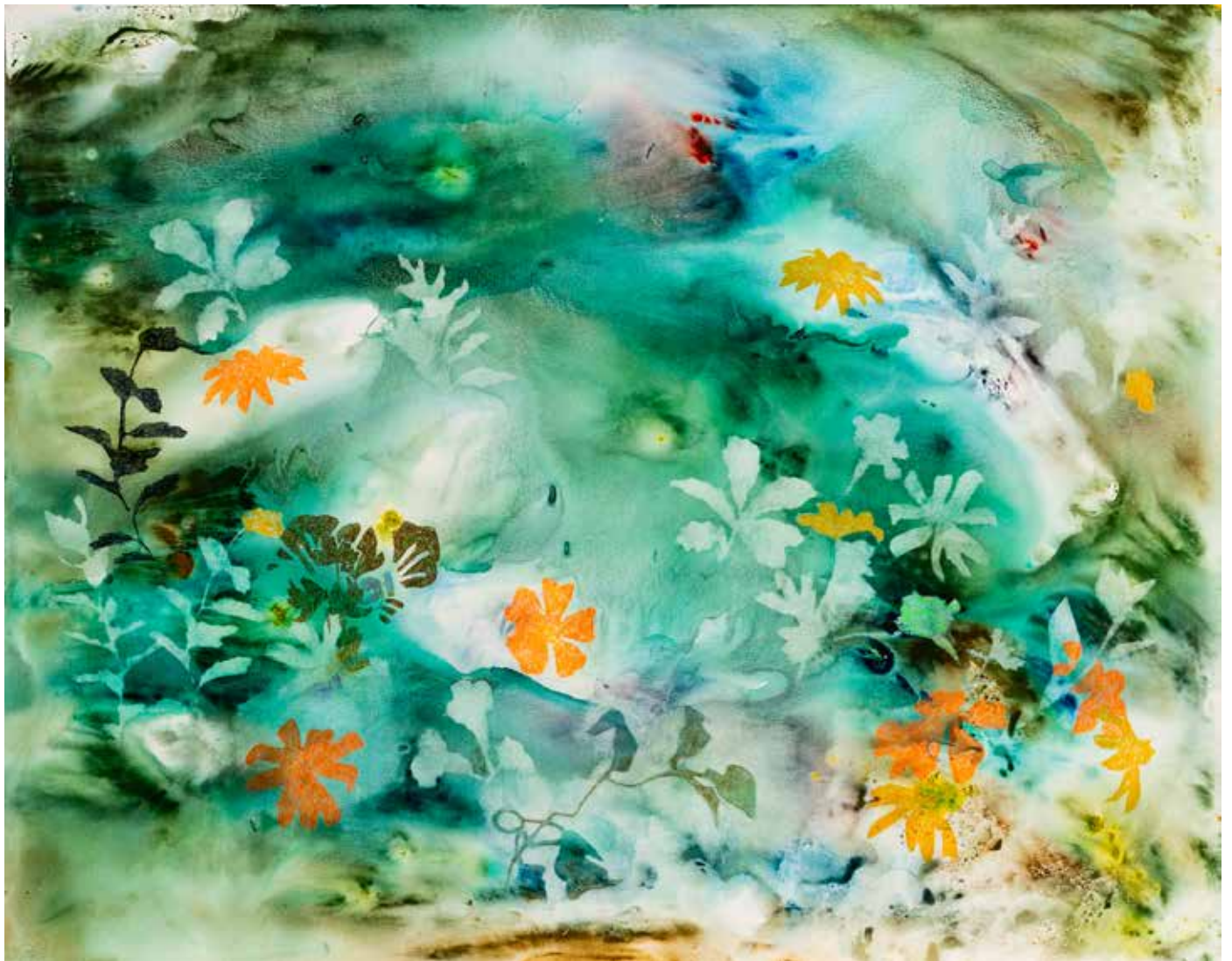
IN LL'S GARDEN #6 2020 colored pencils and watercolor 22 x 29 inches John Wissemann