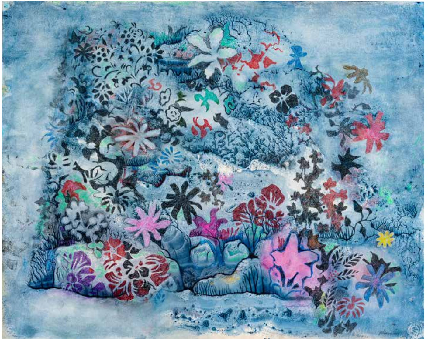
IN LL'S GARDEN #5 2020 colored pencils and watercolor 22 x 29 inches John Wissemann