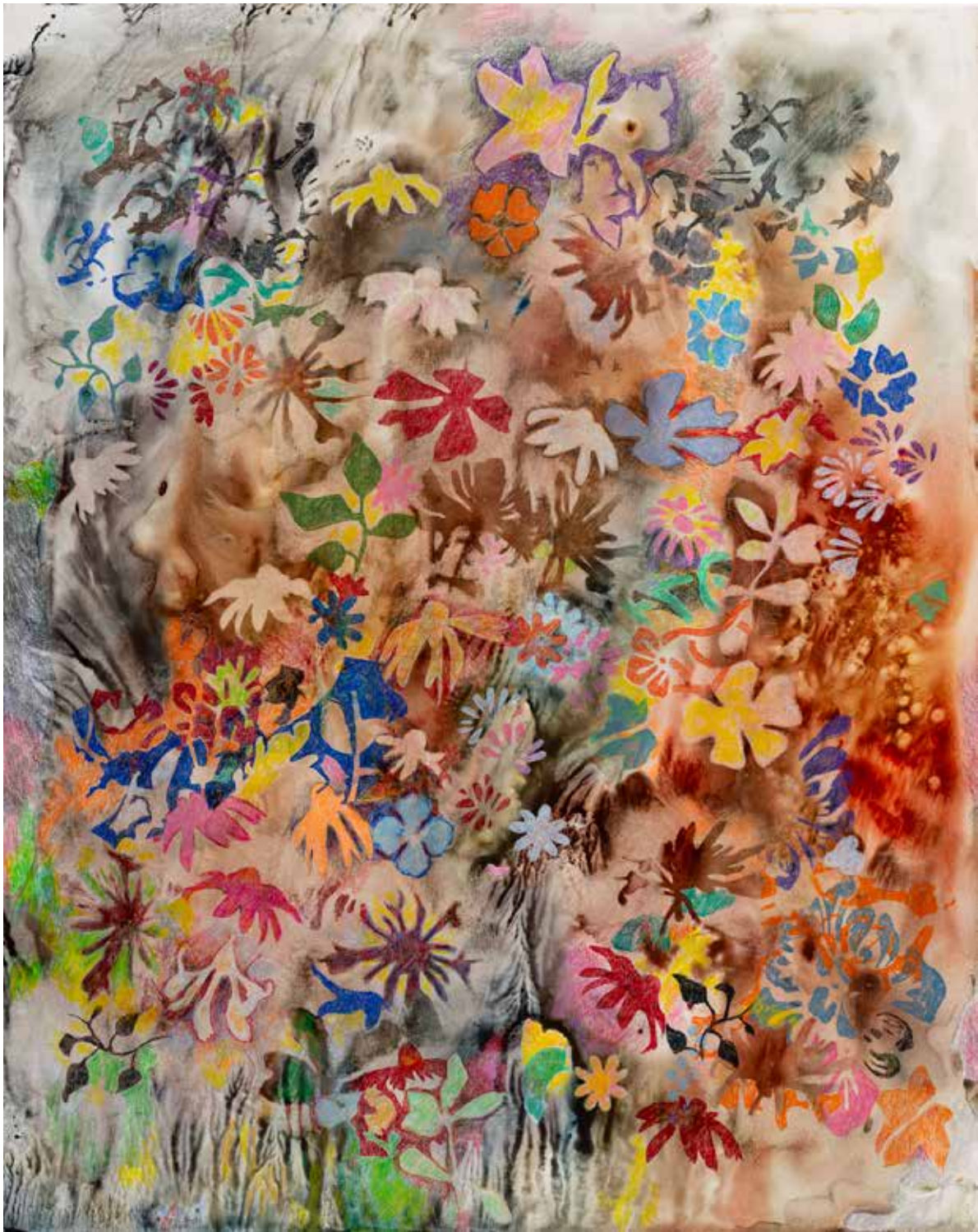
IN LL'S GARDEN #2 2020 colored pencils and watercolor 29 x 22 inches John Wissemann