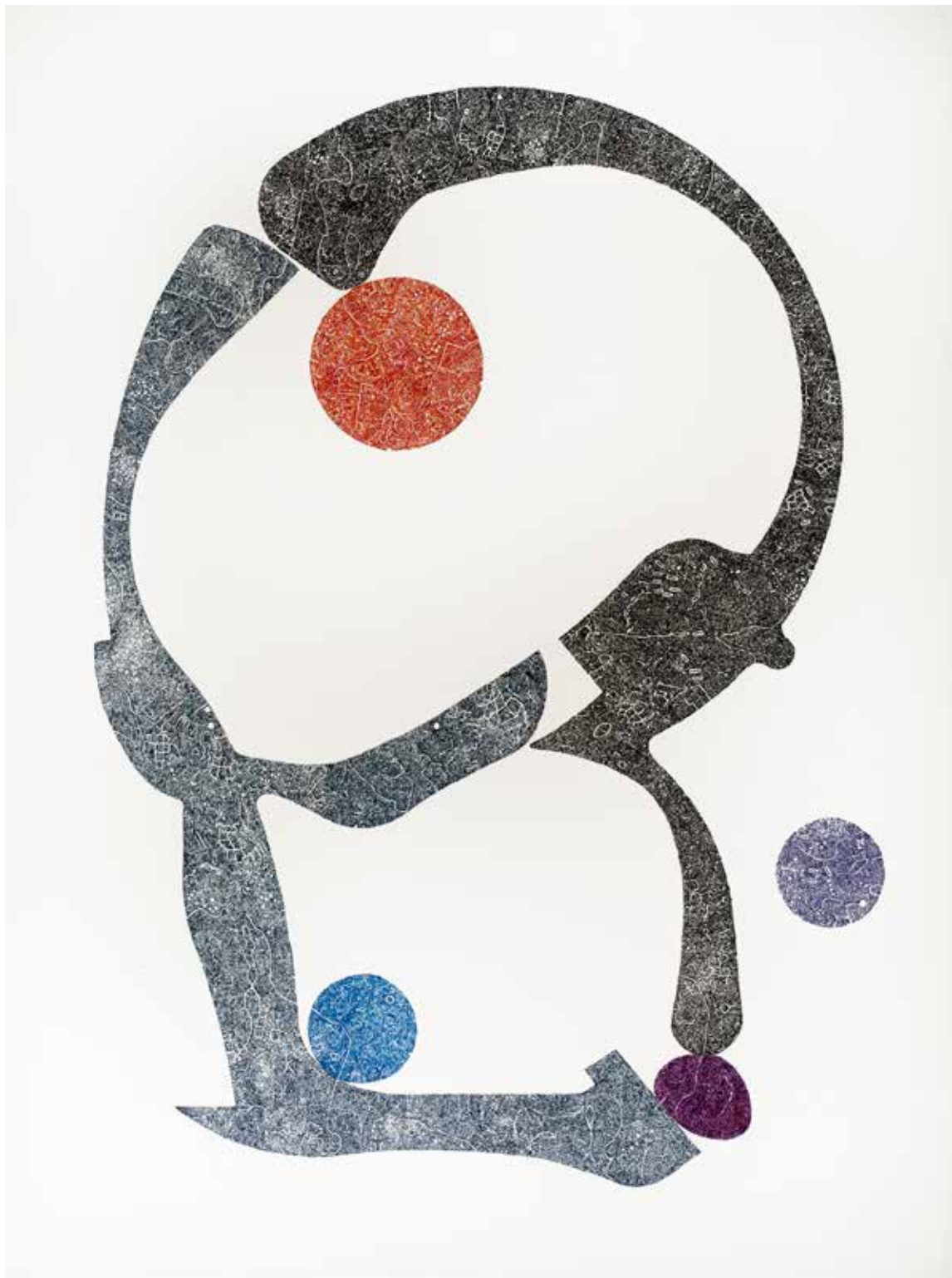
MATERIAL CULTURE 2020 ink on paper 30 x 22 inches David Raymond