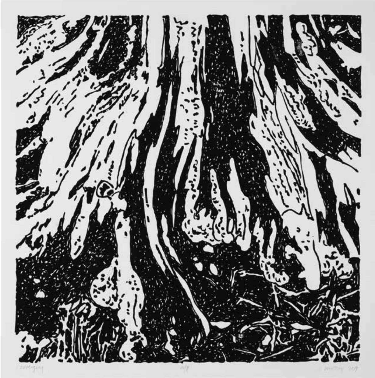
CONVERGING 2019 woodcut 18 x 18 inches John Woolsey