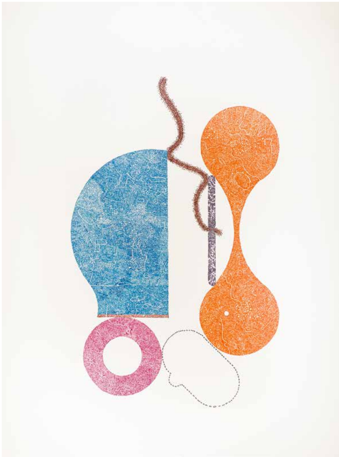
CAKEWALK 2020 ink on paper 30 x 22 inches David Raymond