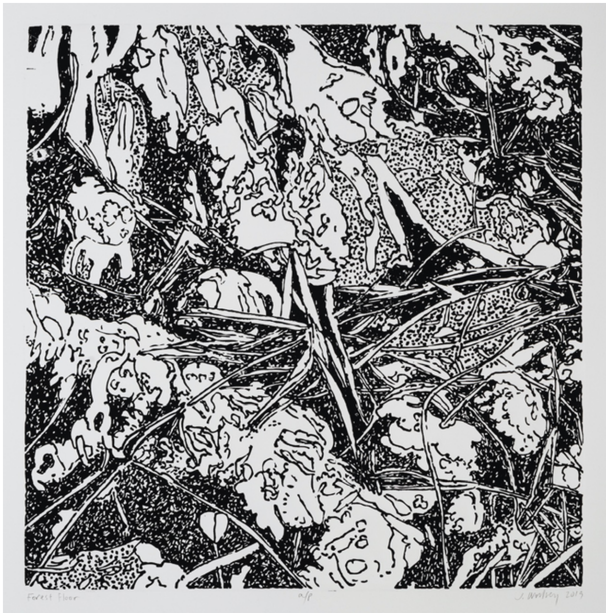
FOREST FLOOR 2019 woodcut 18 x 18 inches John Woolsey