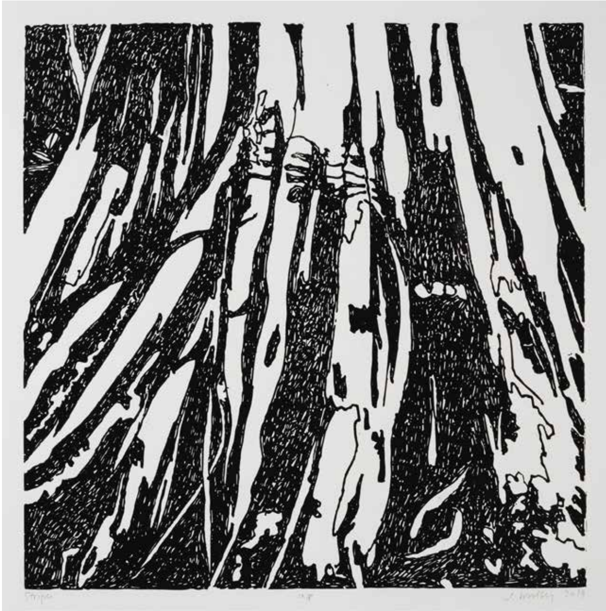
STRIPES 2019 woodcut 18 x 18 inches John Woolsey