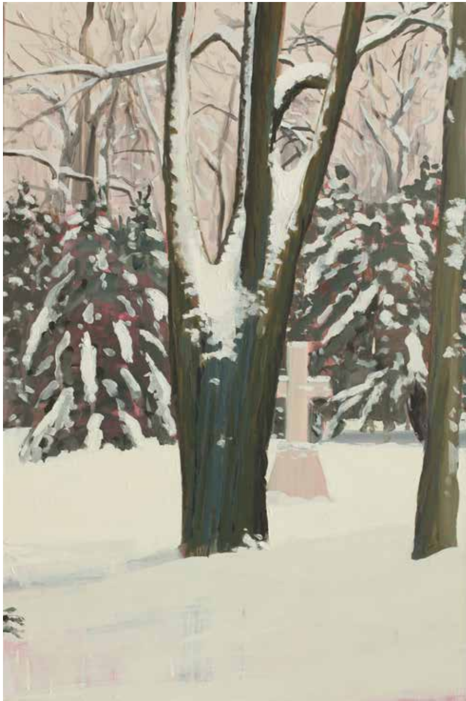
WINTER 2021 oil on canvas 23 1/2 x 35 1/4 inches