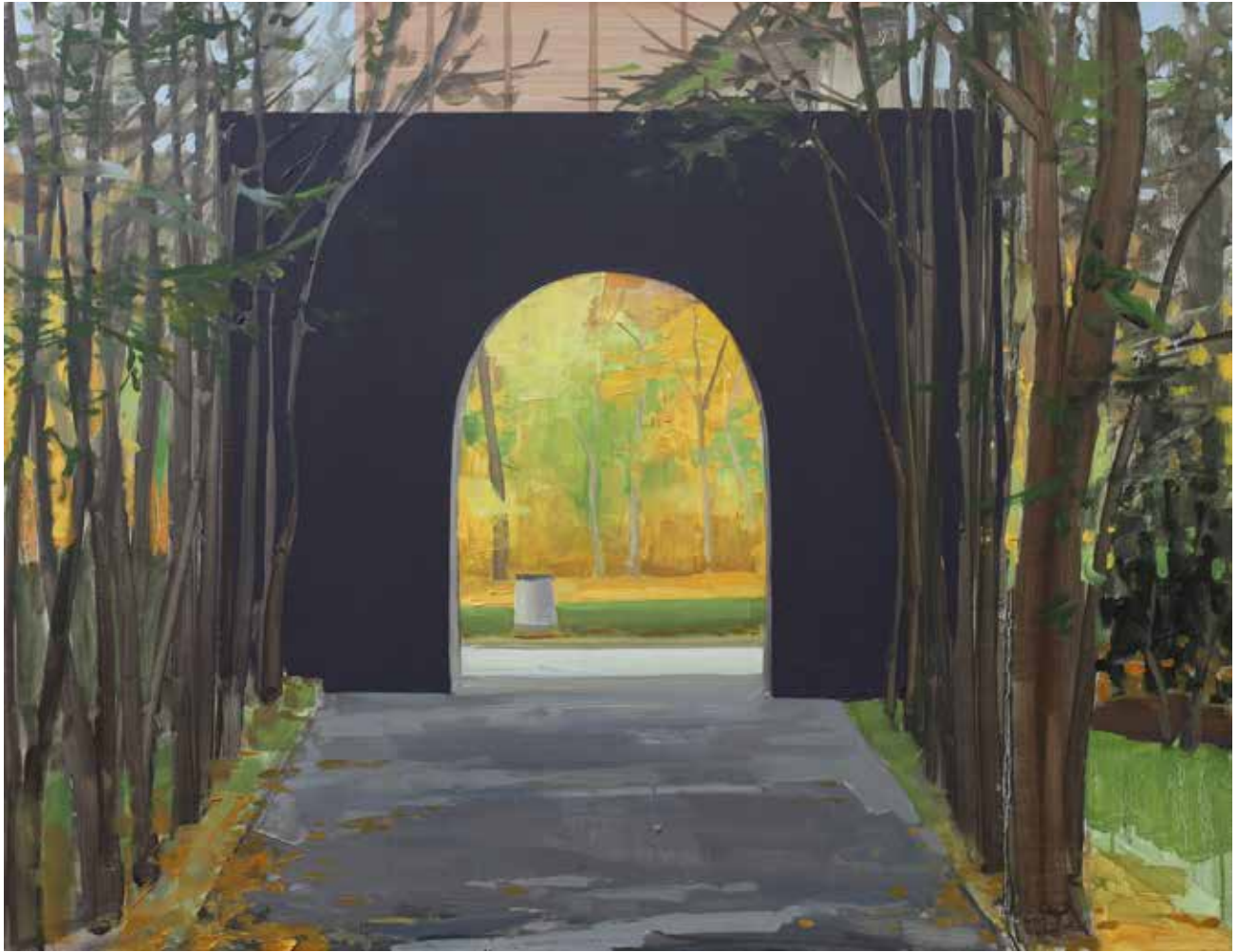
ARCH 2020 oil on canvas 27 1/2 x 35 1/2 inches