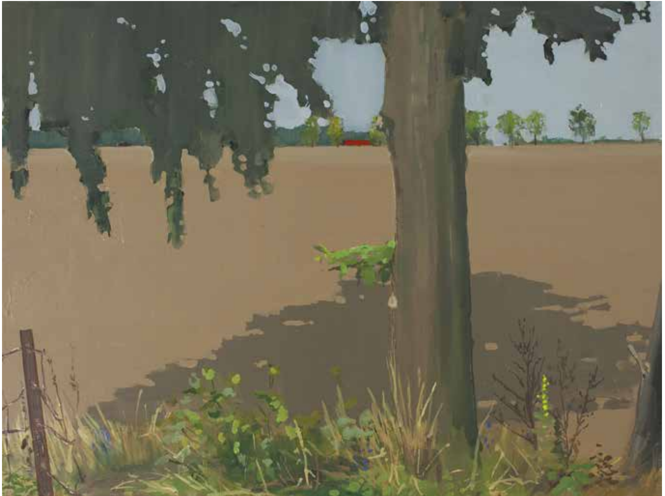
BROWN FIELD 2020 oil on canvas 24 x 32 inches