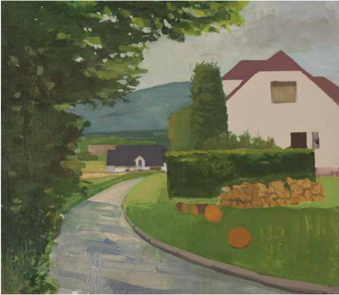
BILESKO 2020 oil on canvas 16 x 18 inches