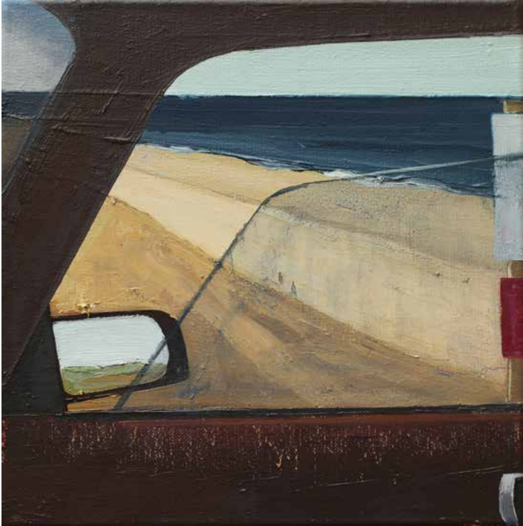
CAR 2021 oil on linen 11 3/4 x 11 3/4 inches