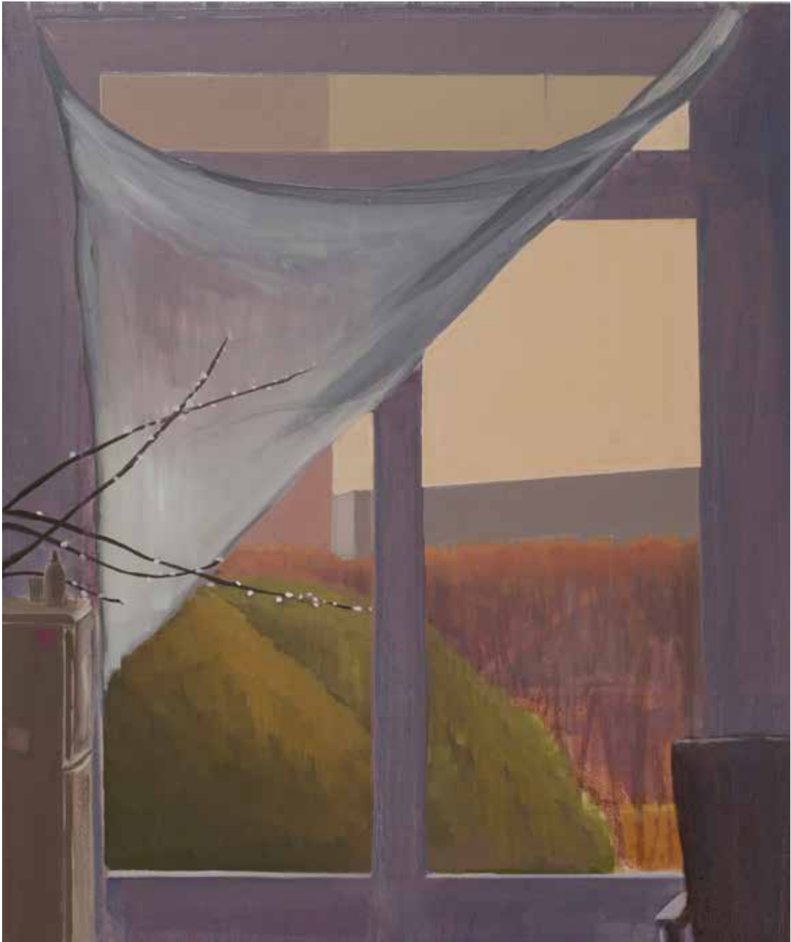
SPRING WAITING 2020 oil on canvas 24 x 20 inches