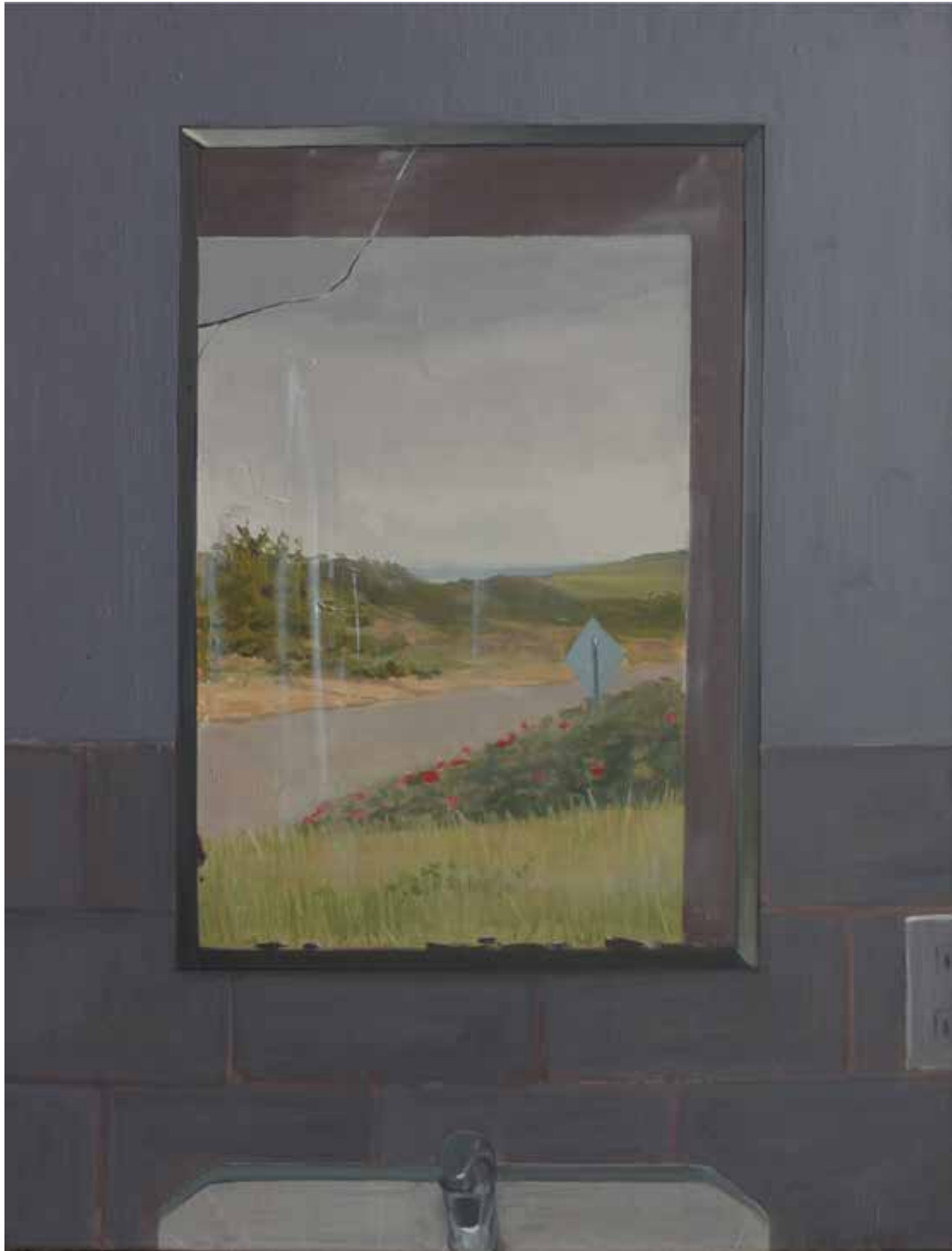
CRACKED MIRROR 2021 oil on canvas 35 x 27 inches