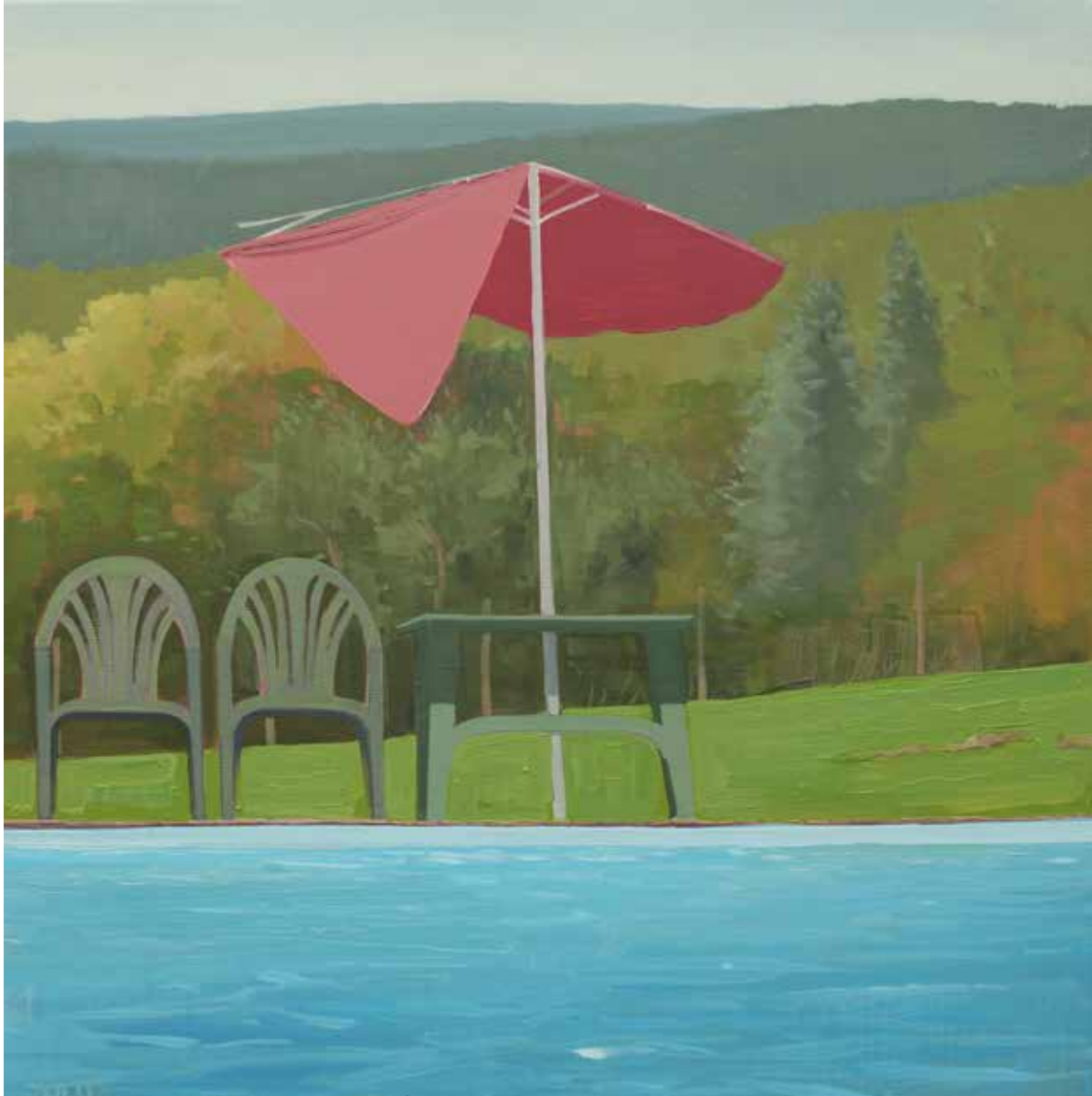
BROKEN UMBRELLA 2021 oil on canvas 35 x 35 inches