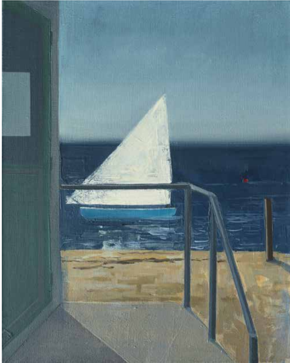
WHITE SAIL 2021 oil on linen 19 1/2 x 15 3/4 inches