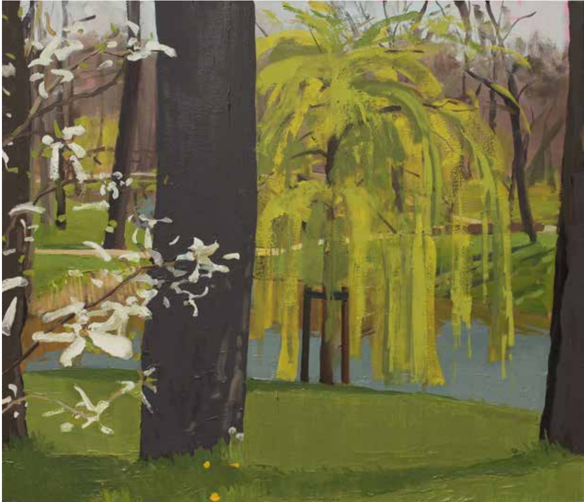
WEEPING WILLOW 2021 oil on canvas 25 1/2 x 29 1/2 inches