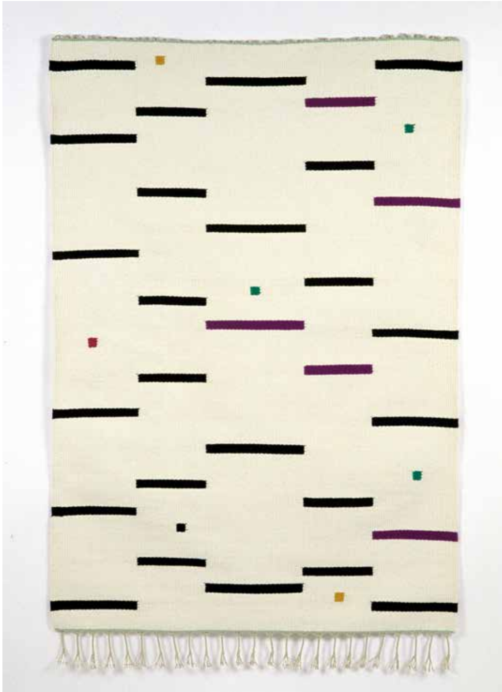
Tapestry 102 DOMINO IV 2006 weft wool, warp linen 66 x 46 inches