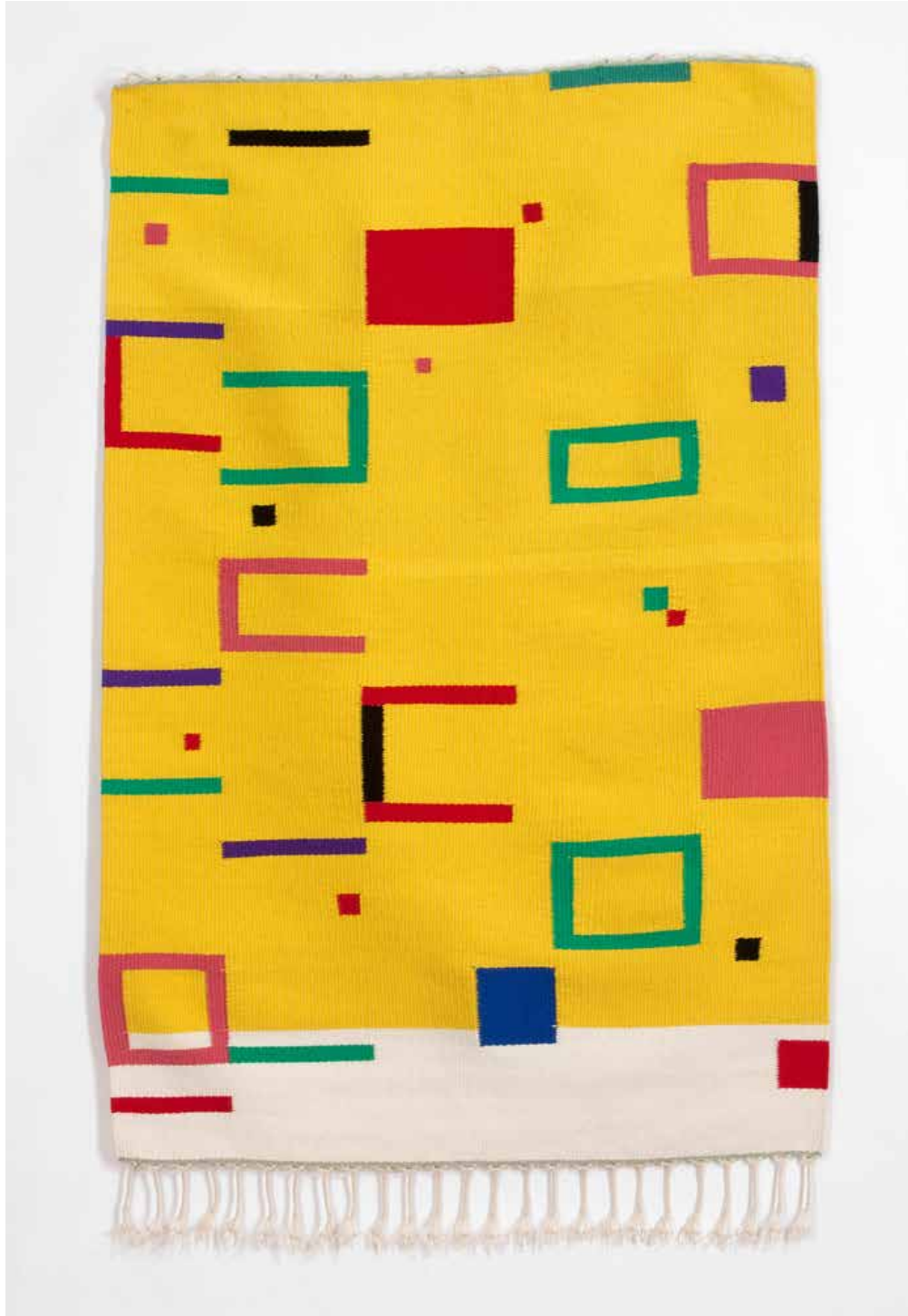
Tapestry 113 THE CENTER RING I 2010 weft wool, warp linen 69 x 45 1/2 inches