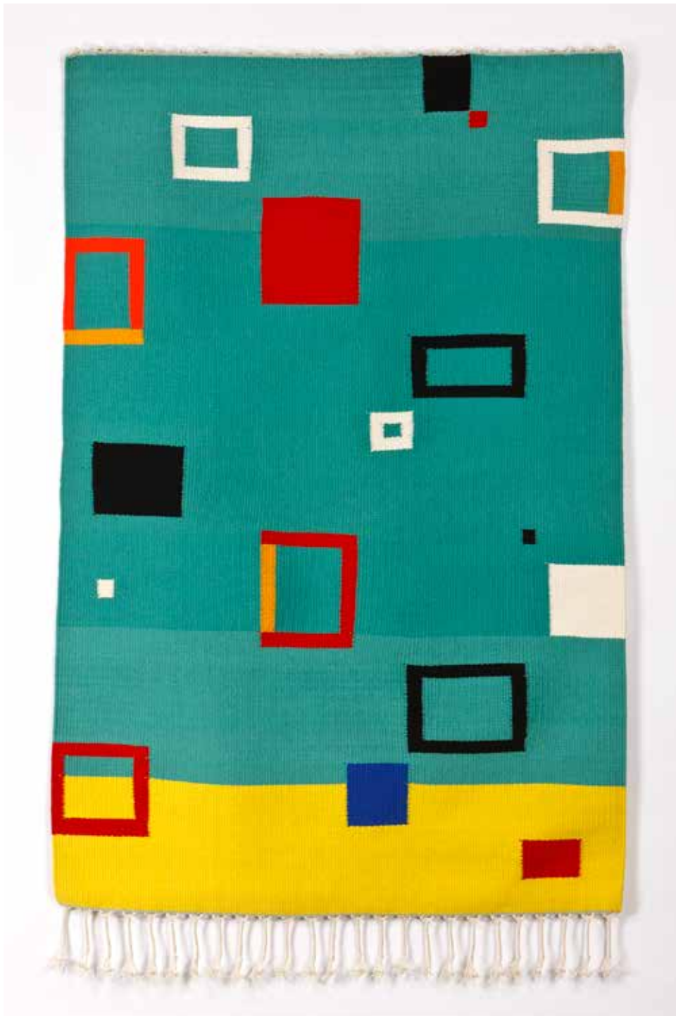
Tapestry 114 THE CENTER RING II 2010 weft wool, warp linen 68 x 46 inches