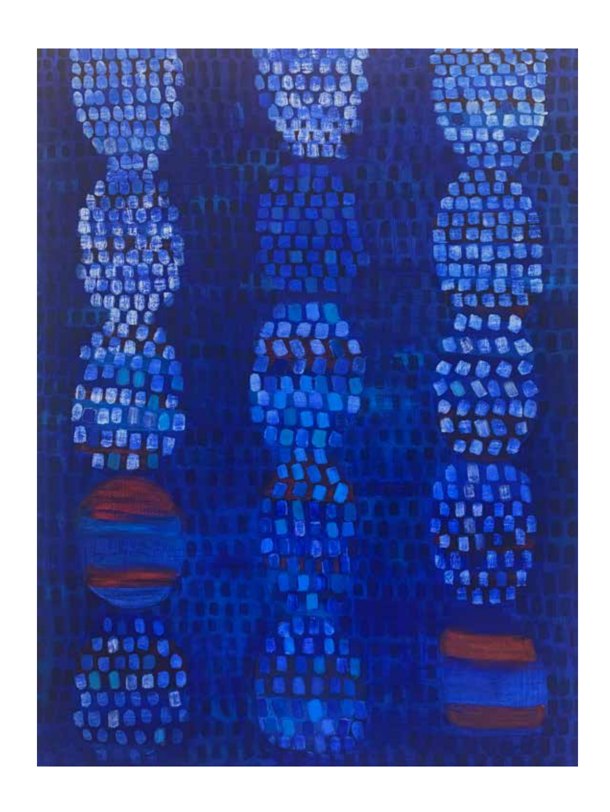
FLOAT LINES 2022 acrylic on canvas 59 x 45 inches