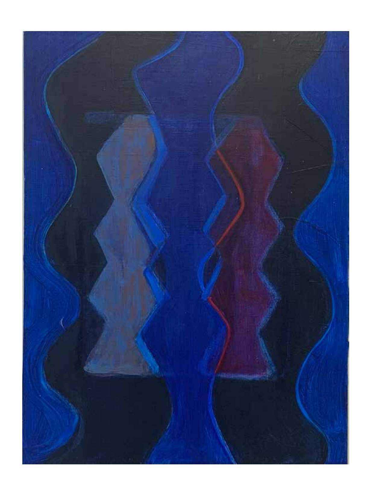
COLUMNS IN BLACK AND BLUE 2021 acrylic on canvas 24 x 18 inches