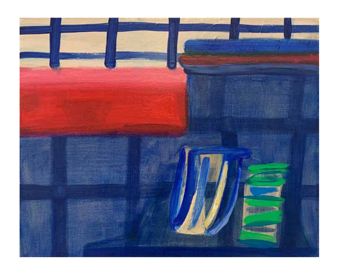
GRID 5 2019 acrylic on canvas 16 x 20 inches