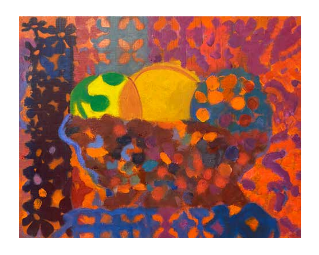
FRUITBOWL 2022 oil on panel 11 x 14 inches