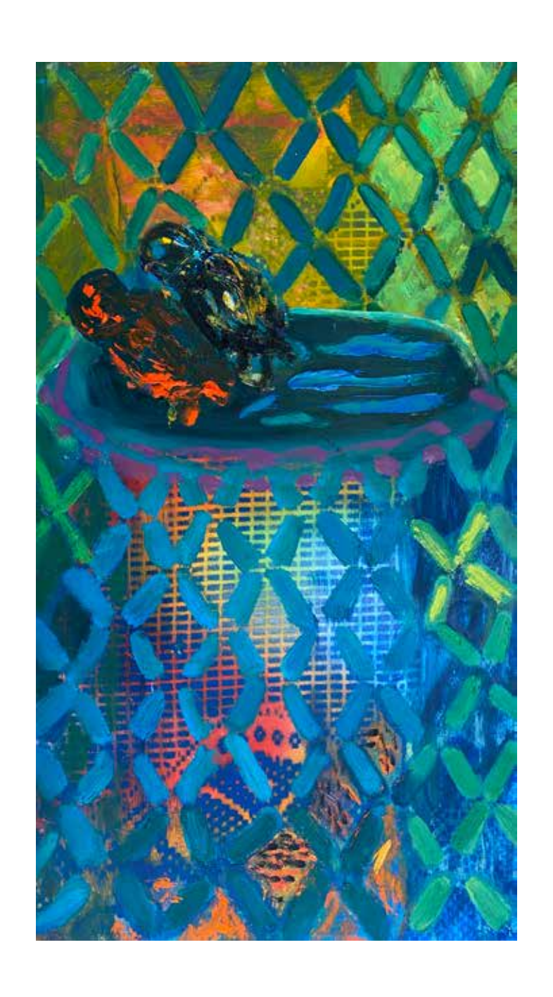
BIRDBATH #2 2022 oil on PVC 20 x 11 inches