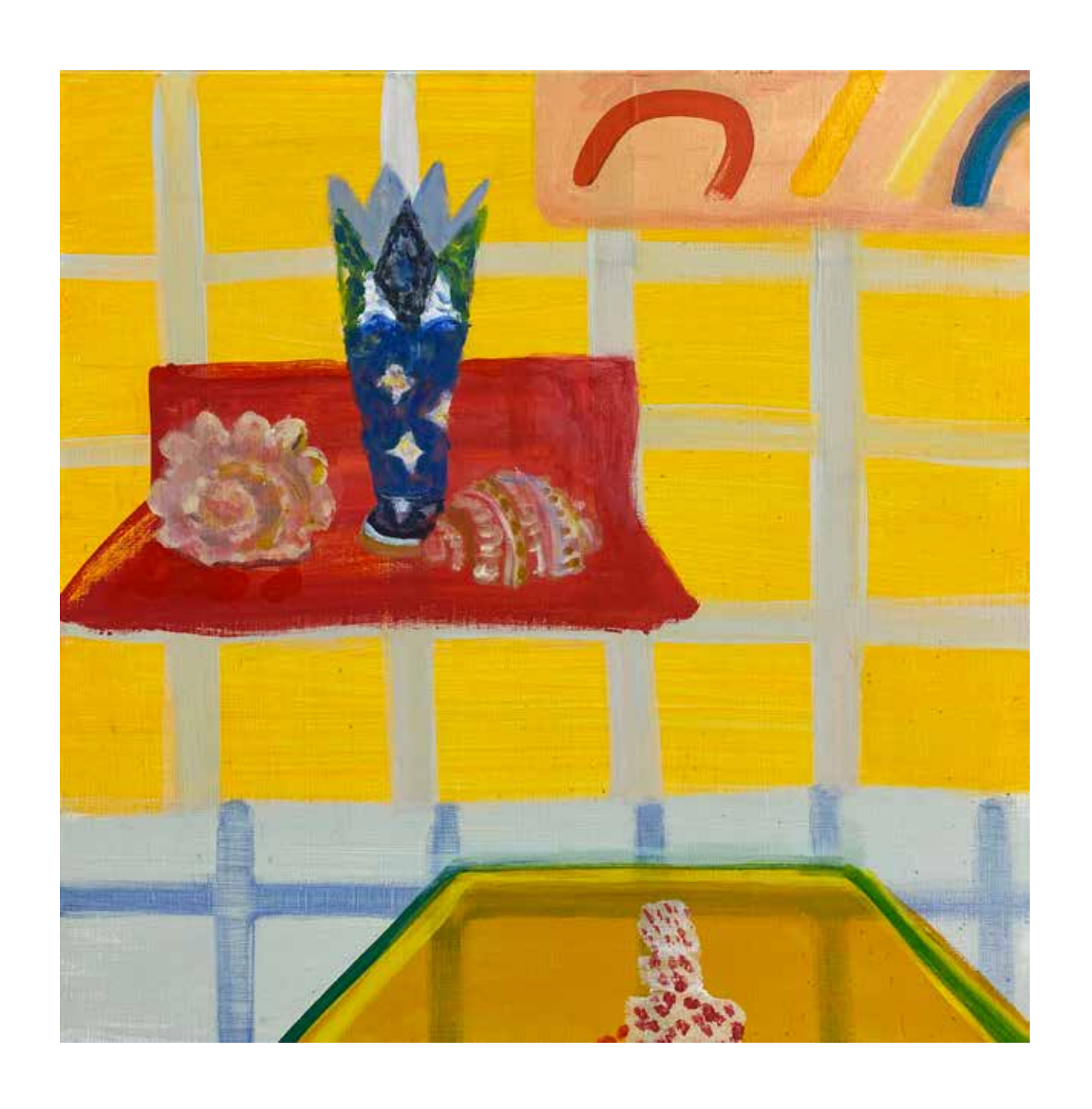
GRID #3 2019 acrylic on canvas 24 x 24 inches