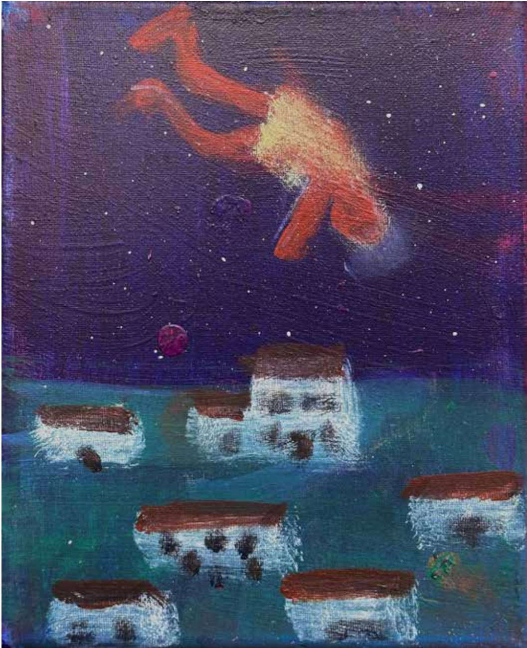
TUMBLE OVER VILLAGE 2022 acrylic on canvas 10 x 8 inches (sold)