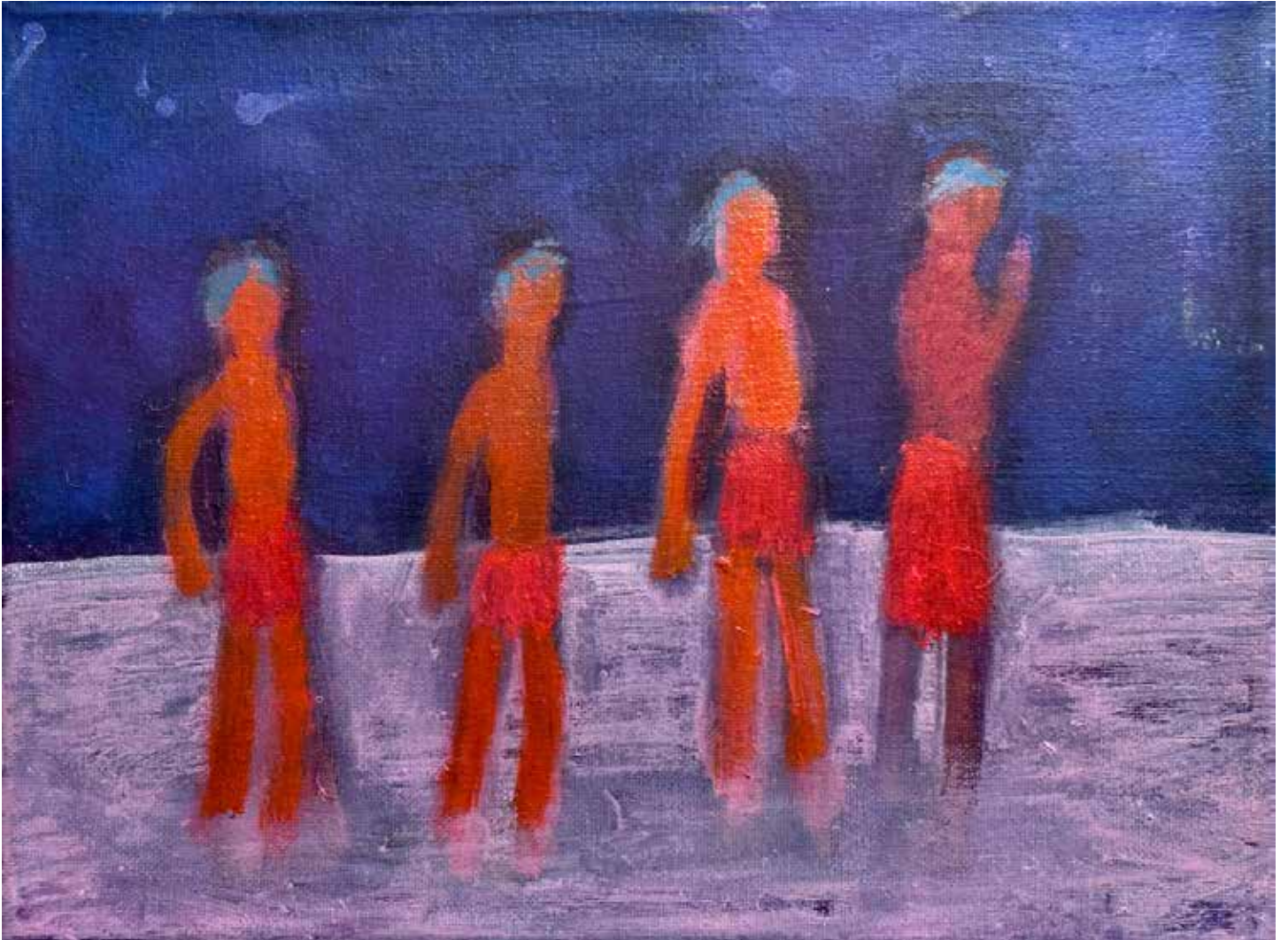
FOUR SWIMMERS IN RED 2023 acrylic on canvas 9 x 12 inches (sold)