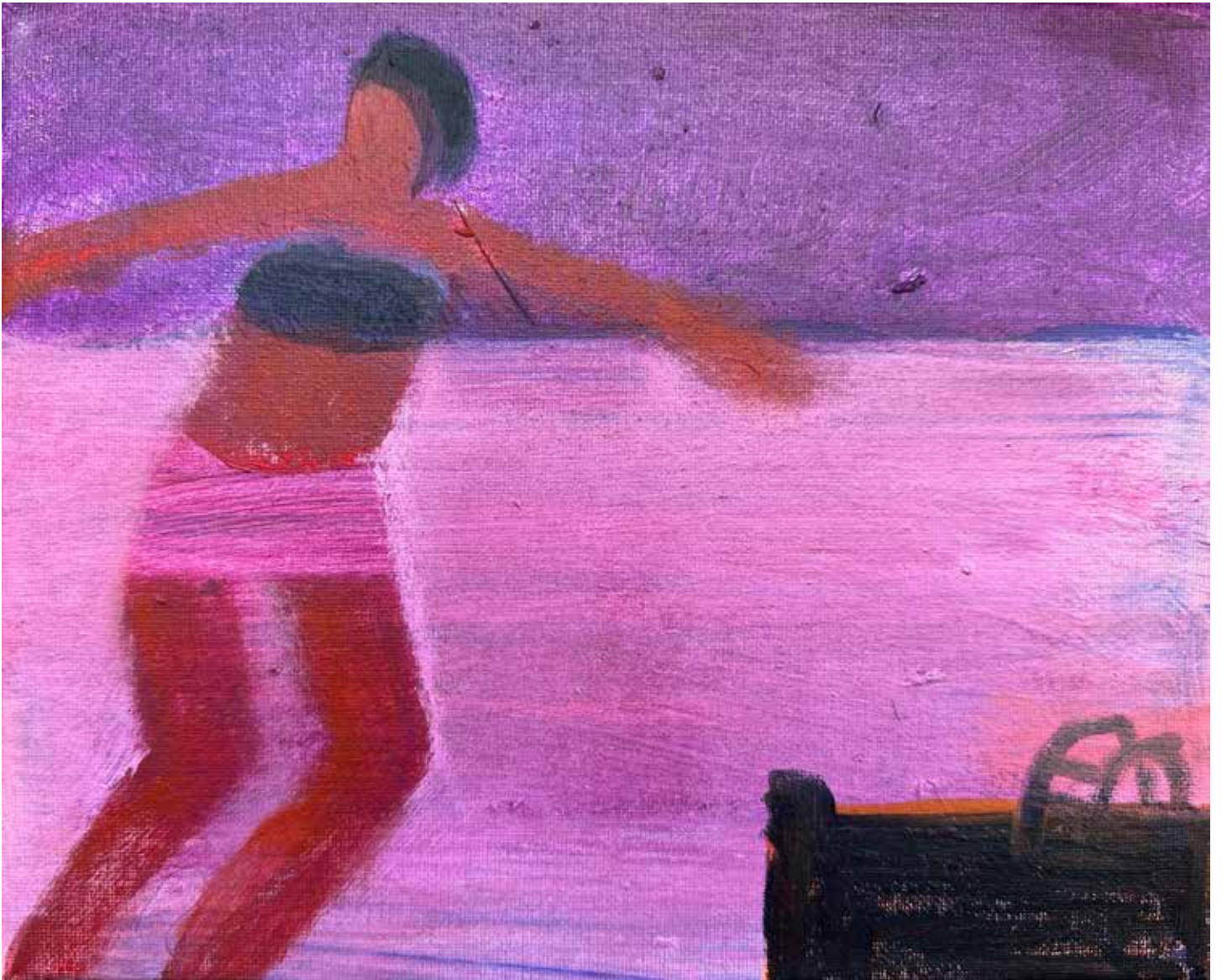
PINK SEA 2022 acrylic on canvas 8 x 10 inches (sold)