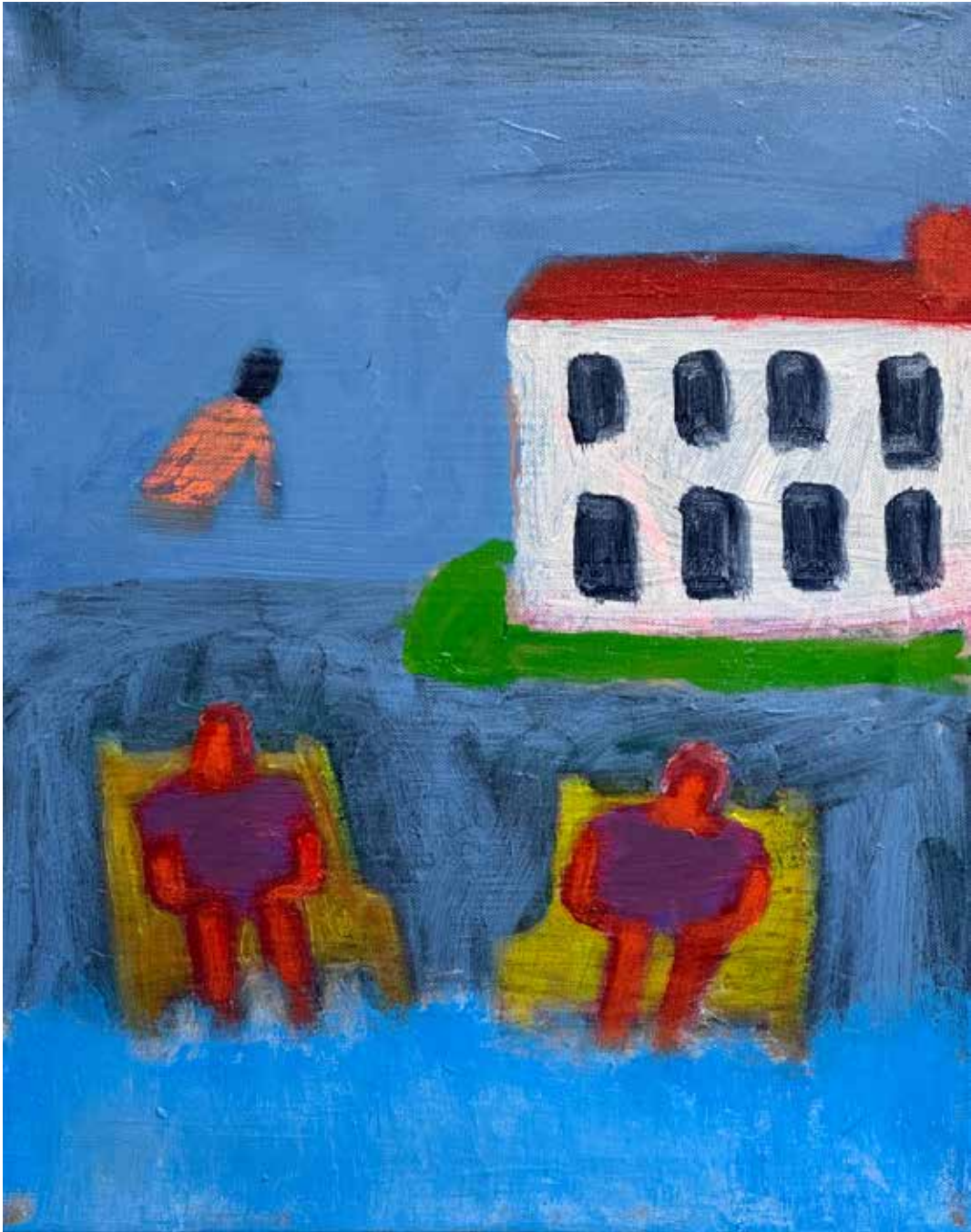
SITTING WITH THE NEARBY SEA 2022 acrylic on canvas 20 x 16 inches