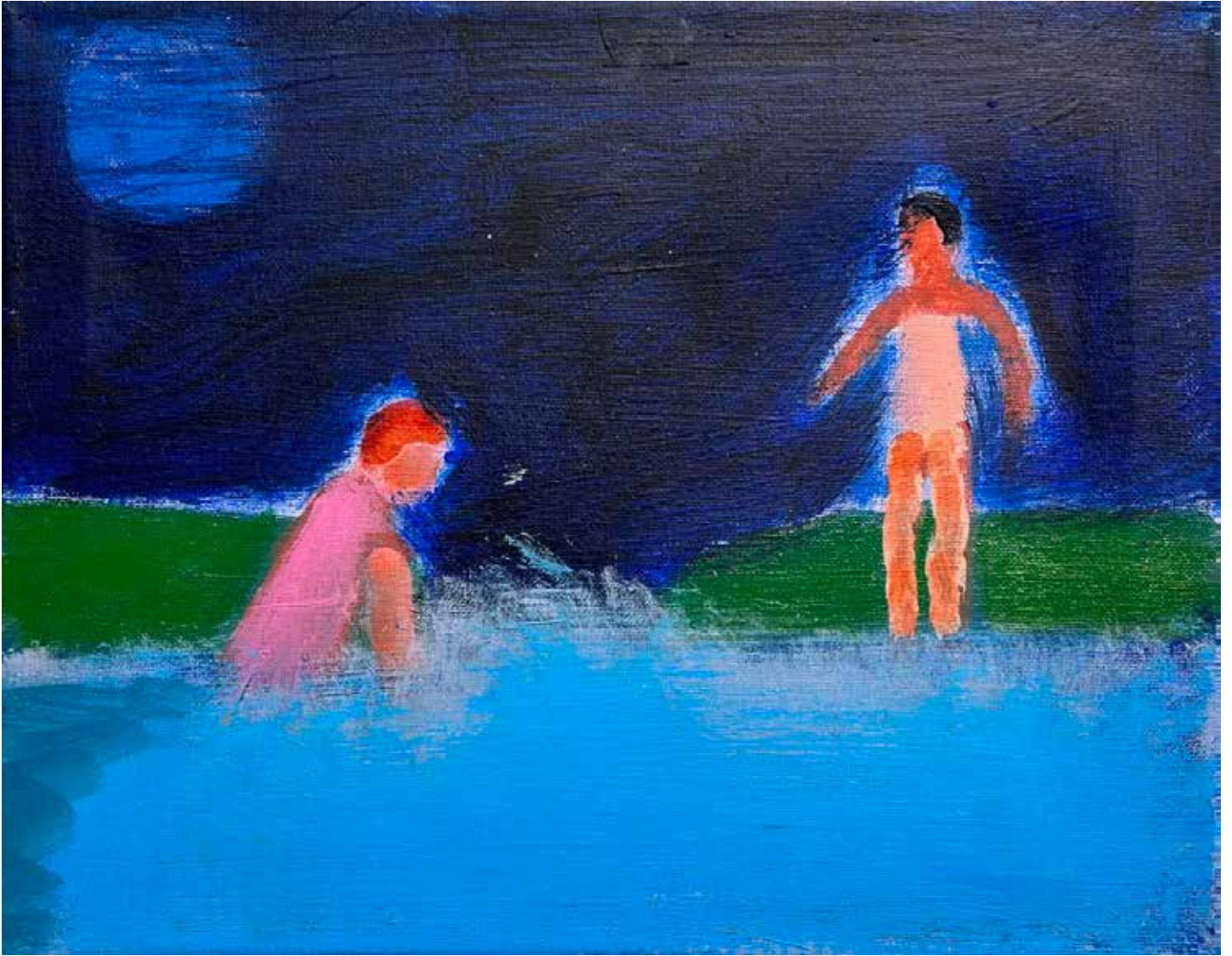
RIVER SWIMMERS AT NIGHT 2023 acrylic on canvas 11 x 14 inches (sold)