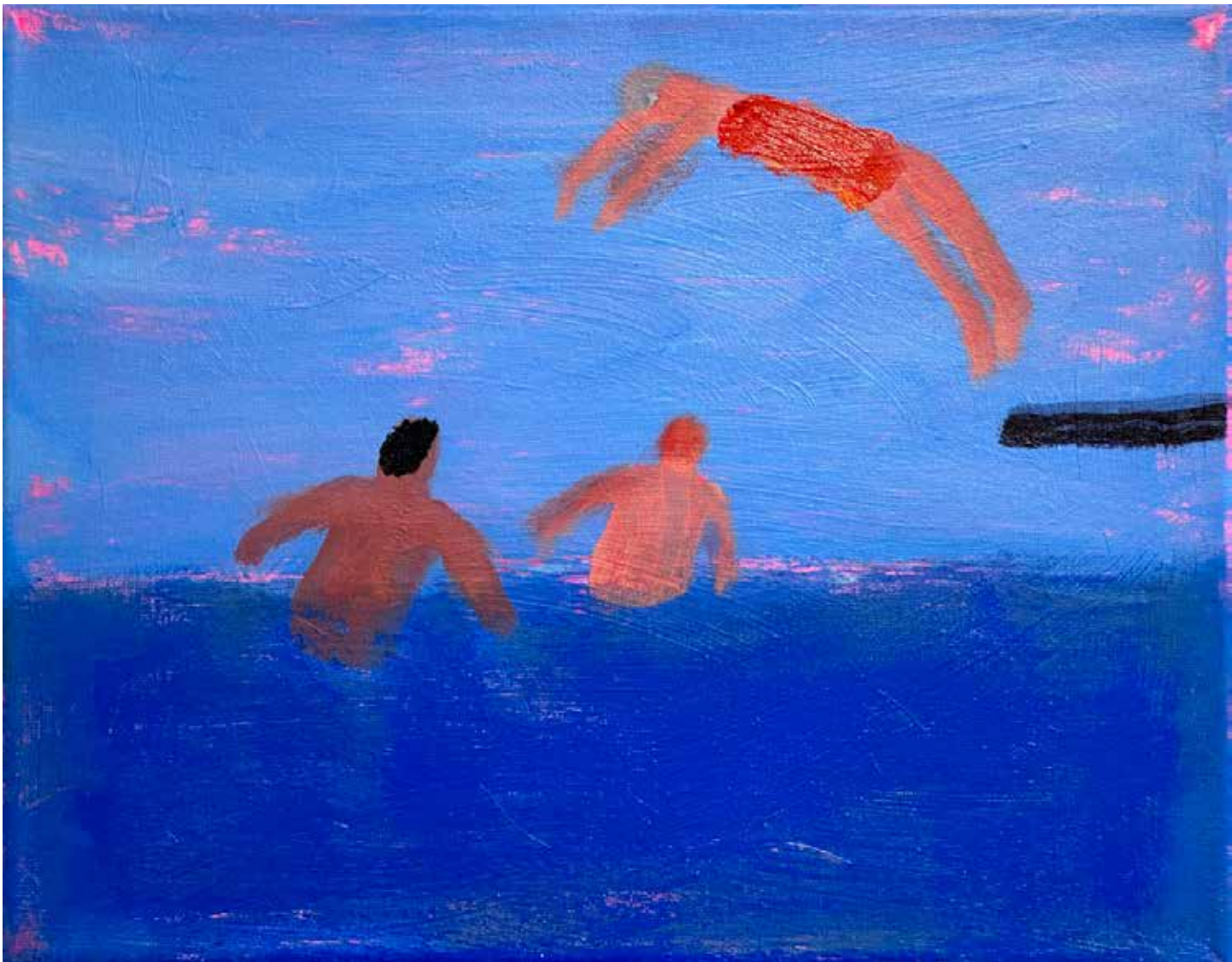
DIVER OVER NUDE SWIMMERS 2023 acrylic on canvas 11 x 14 inches (sold)