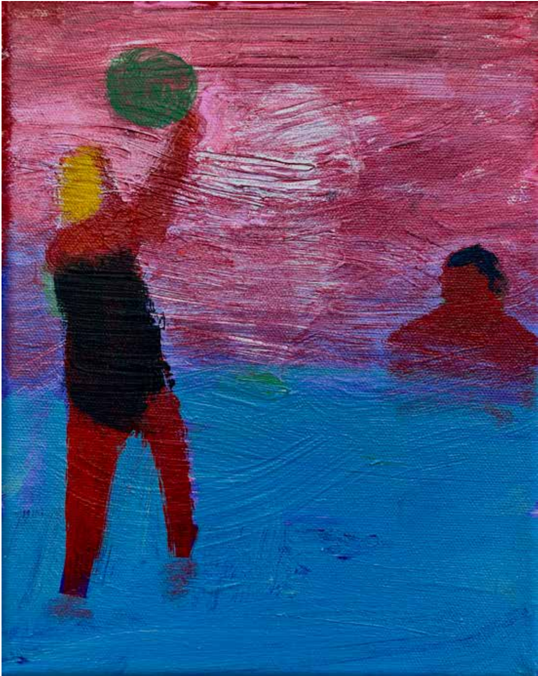
BEACH BALL 2022 acrylic on canvas 10 x 8 inches (sold)