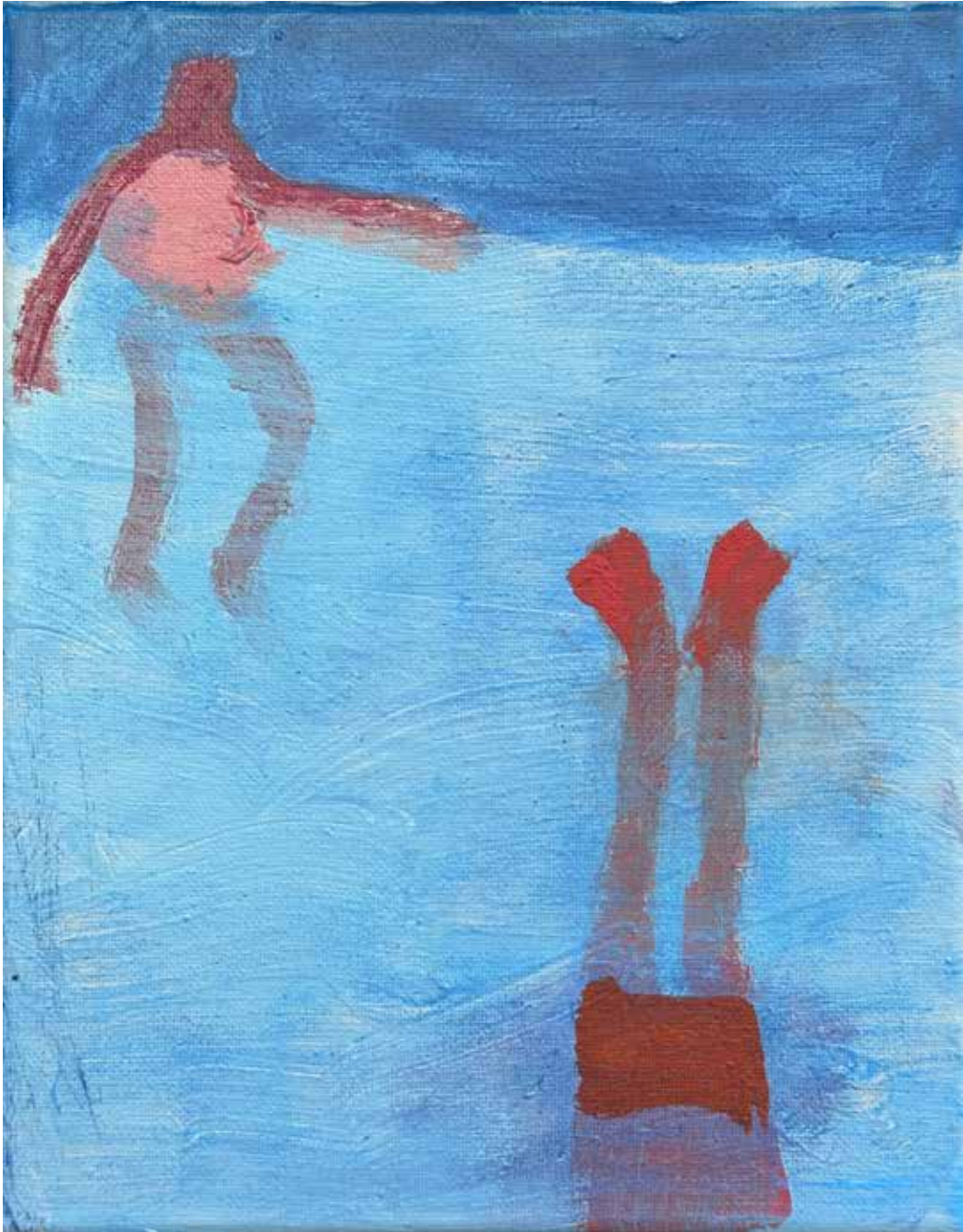
RED FLIPPERS 2022 acrylic on canvas 10 x 8 inches (sold)