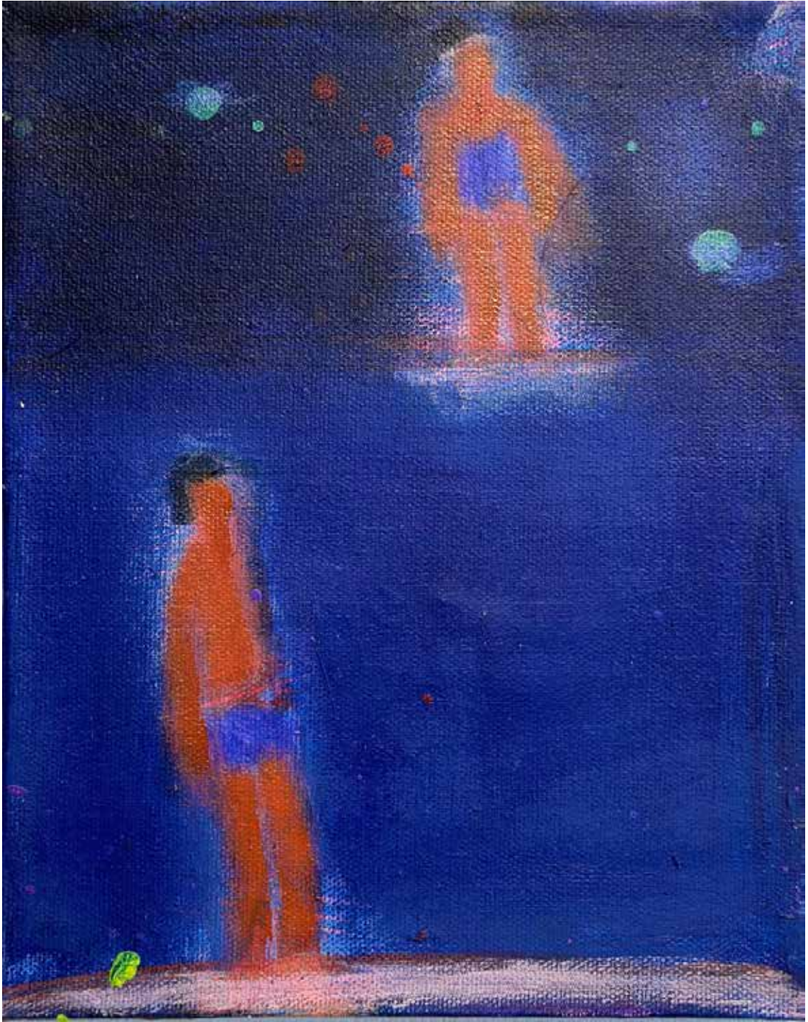
NIGHT SWIMMERS ABOVE AND BELOW 2023 acrylic on canvas 10 x 8 inches (sold)