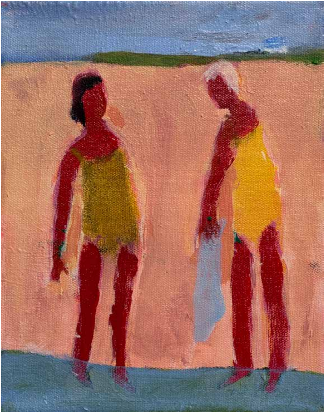
SWIMMERS WITH TOWEL 2023 acrylic on canvas 10 x 8 inches (sold)