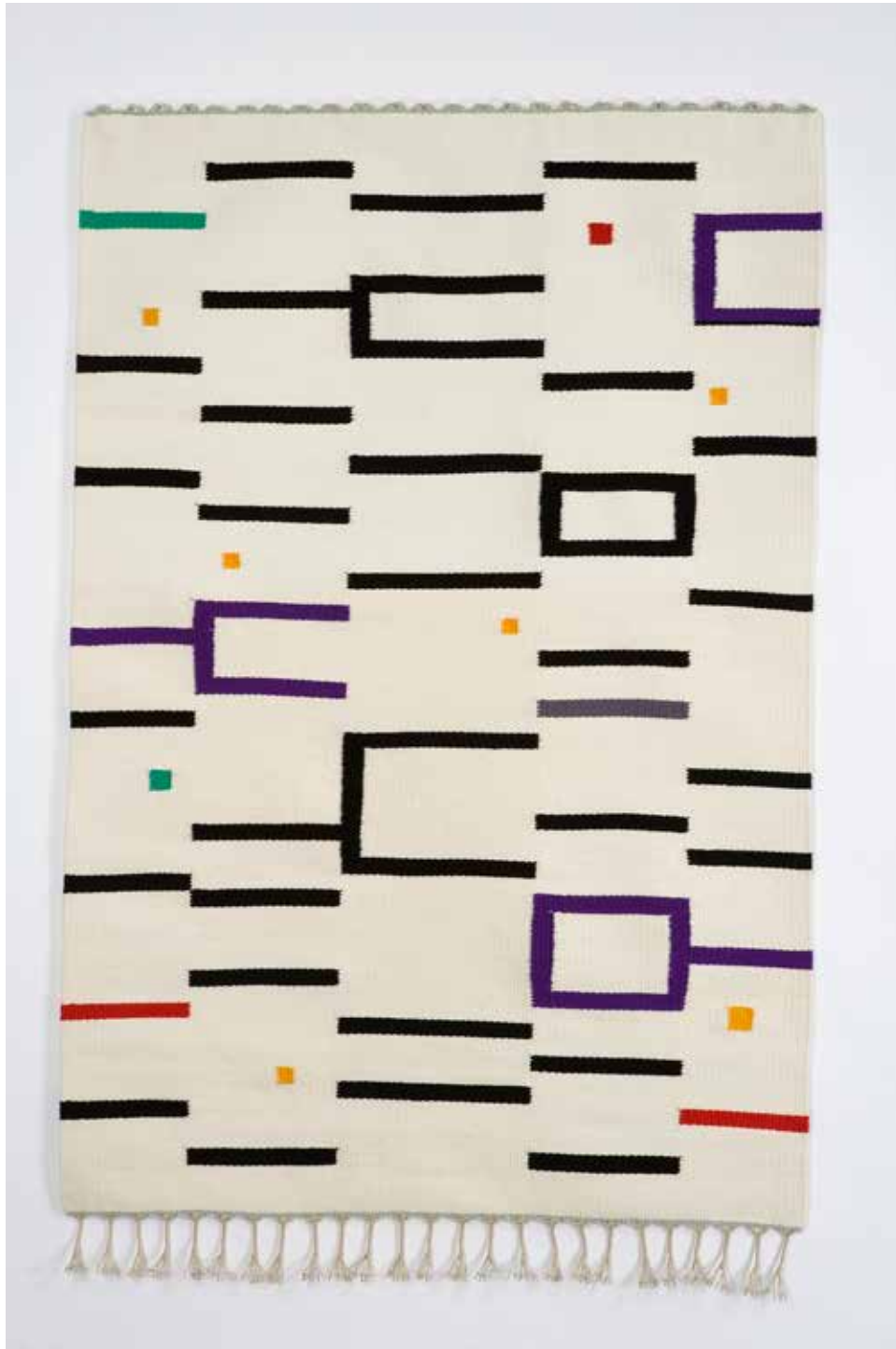
Tapestry 106: DOMINO SERIES VIII 2007 wool weft, linen warp 68 1/2 x 46 1/2 inches