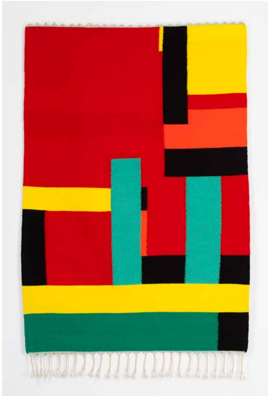
Tapestry 140: B.D. I REMEMBER EVERYTHING 2019 wool weft, linen warp 68 x 47 inches