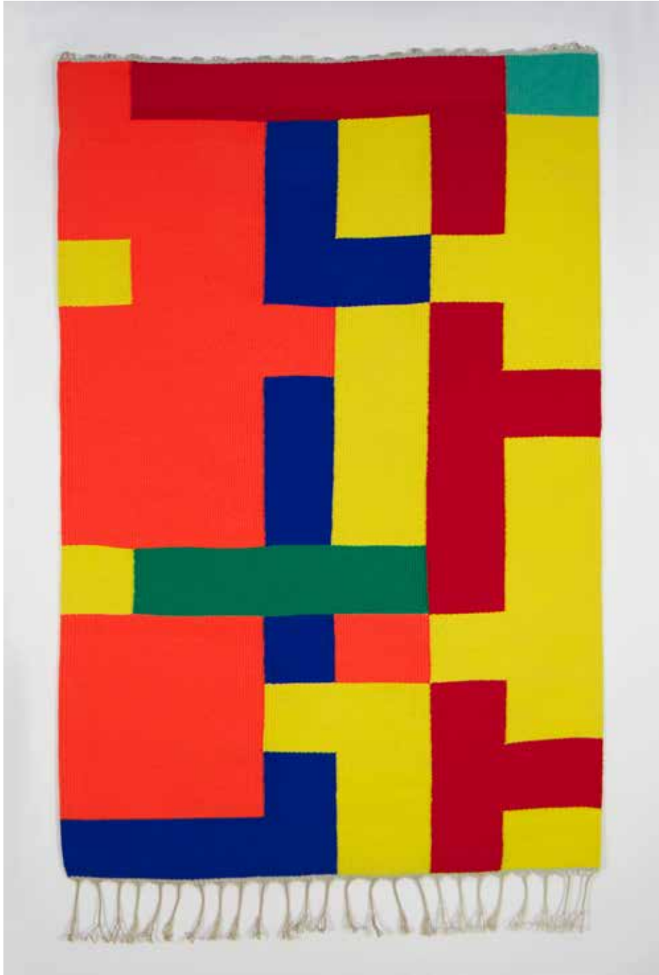
Tapestry 125: HUNTER VARIATIONS 2014 wool weft, linen warp 70 x 46 inches