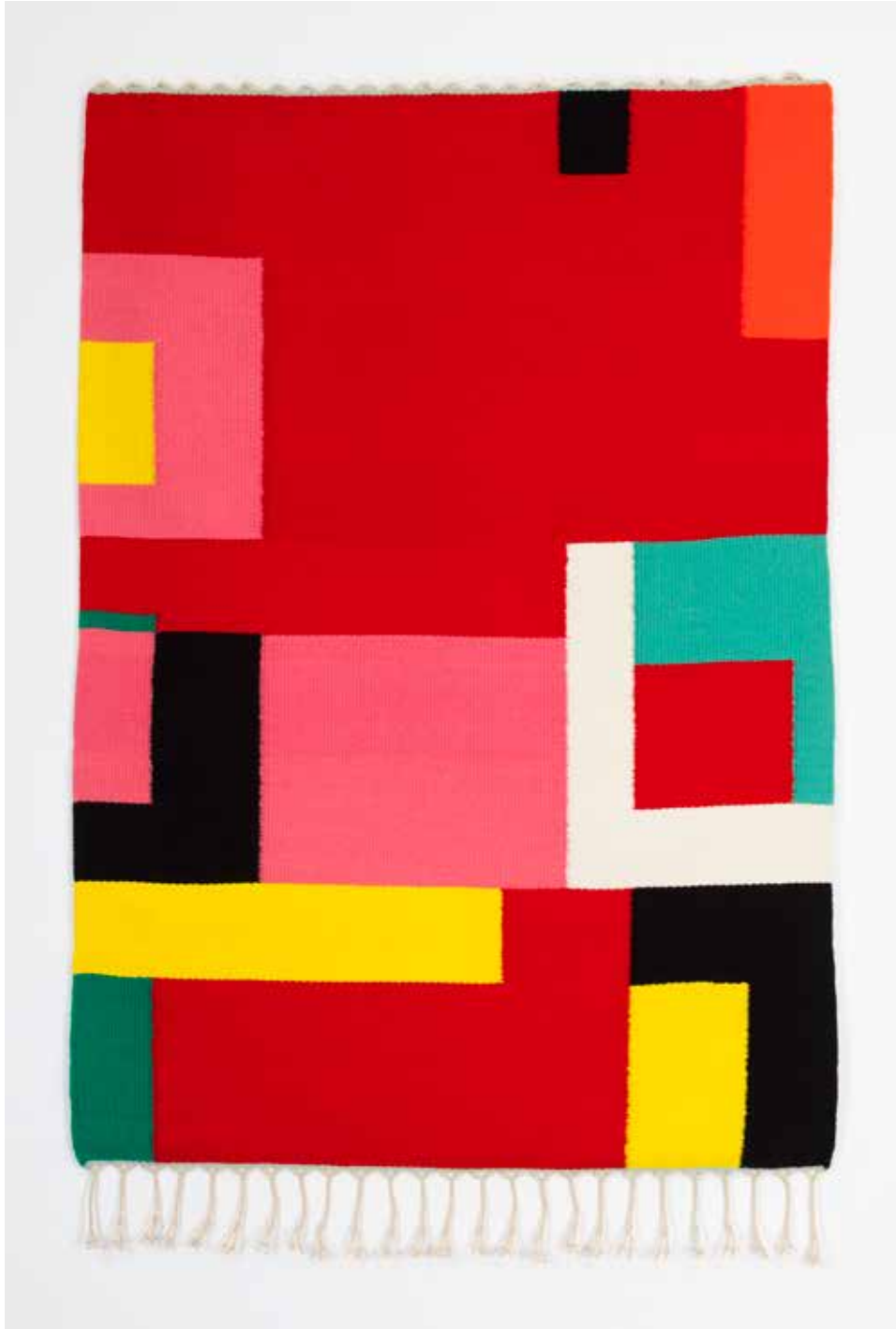
Tapestry 139: B.D. I REMEMBER EVERYTHING 2018 wool weft, linen warp 68 x 47 inches