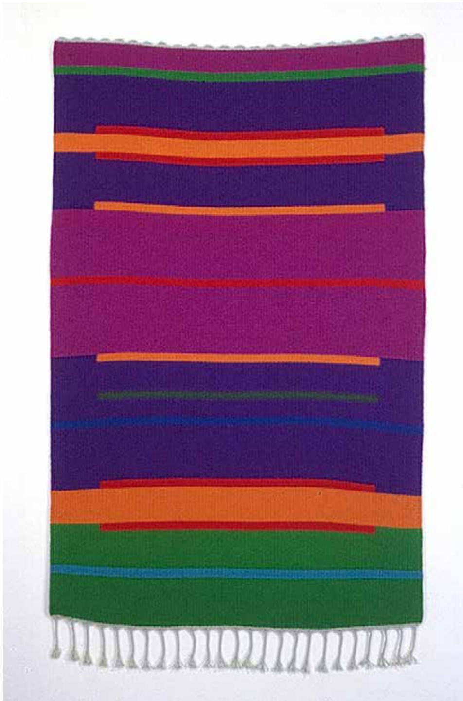
Tapestry 81: LILAC WINE 1996 wool weft, linen warp 68 x 45 inches