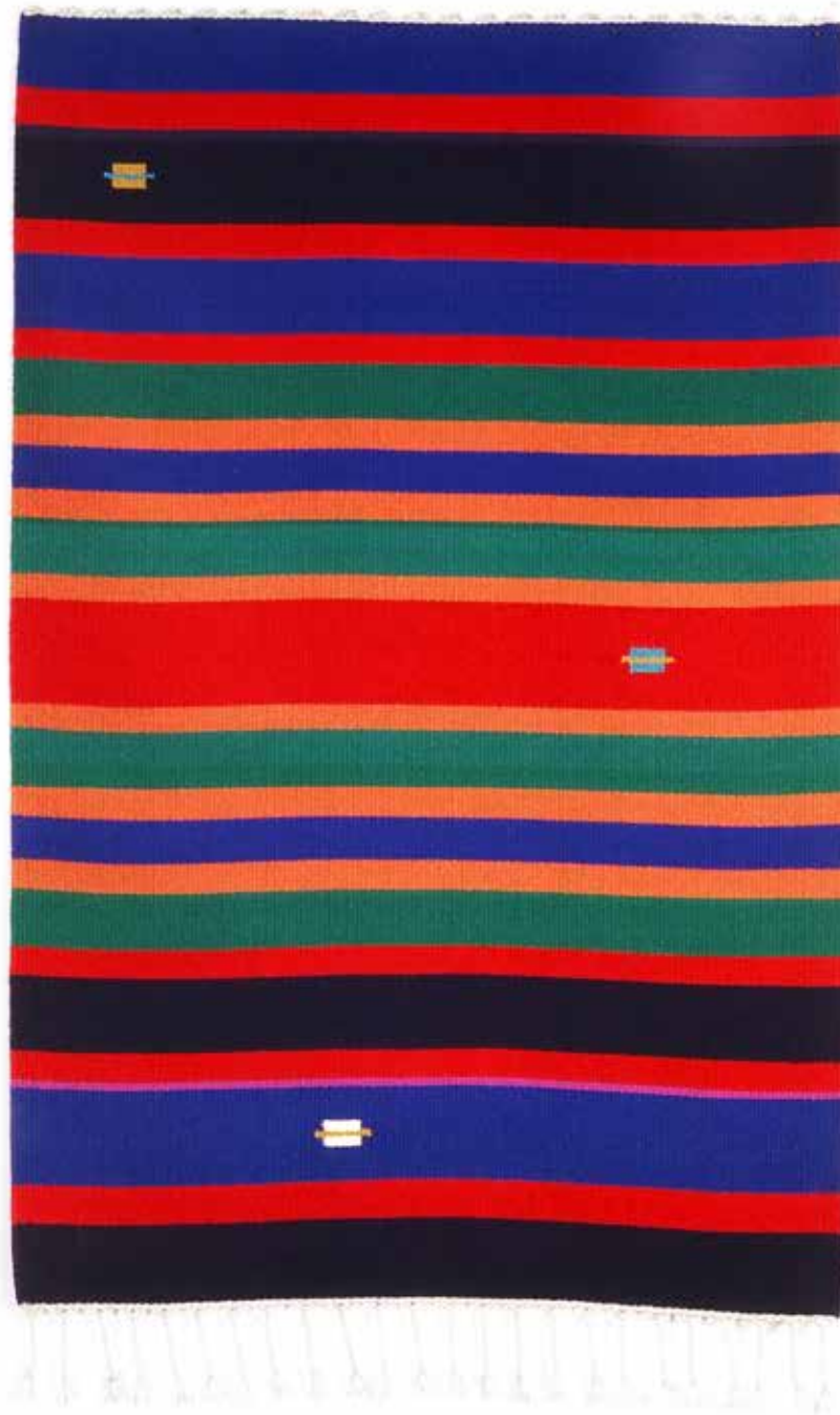
Tapestry 72: TRIAD 1993 wool weft, linen warp 69 x 45 inches