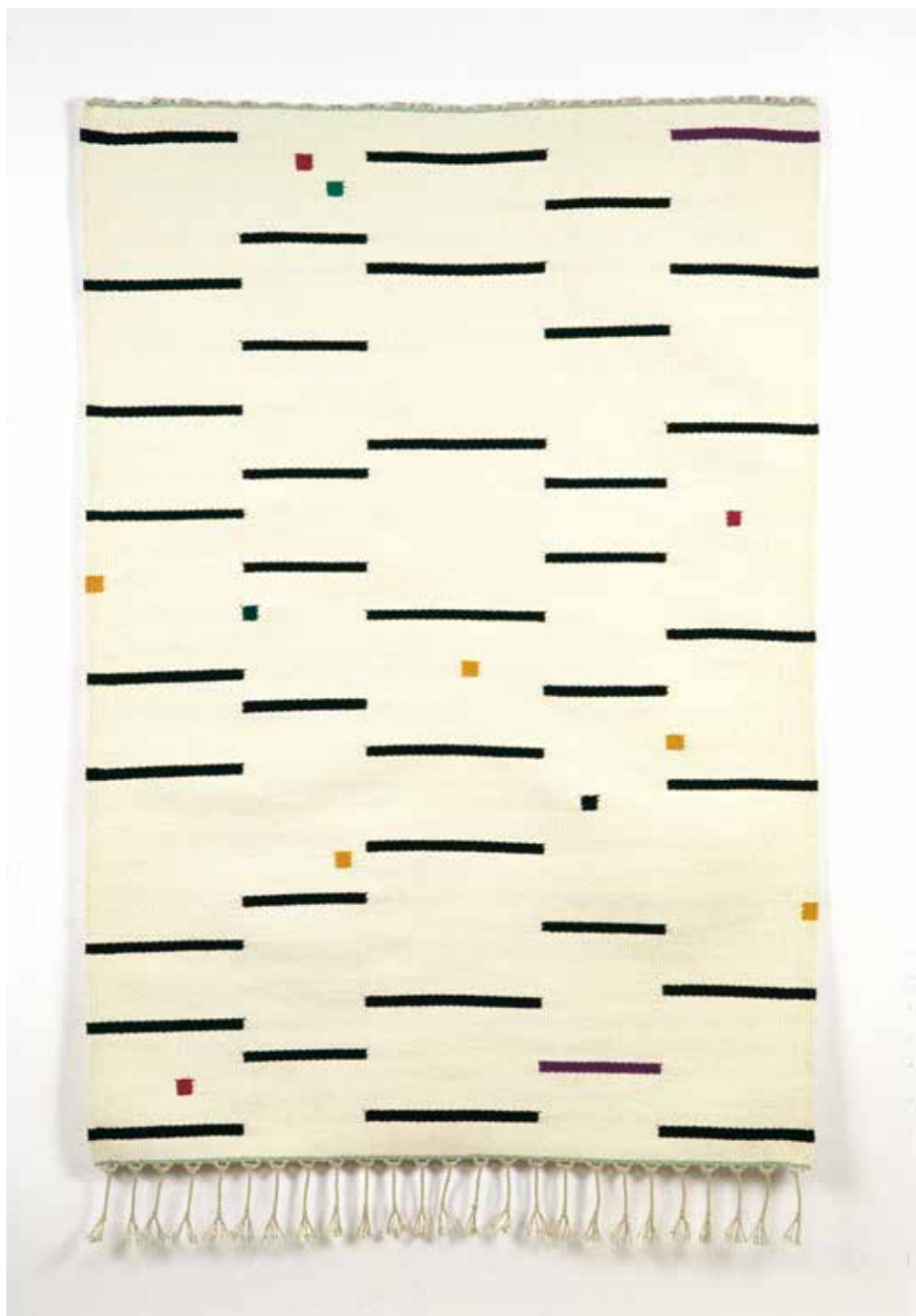
Tapestry 101: DOMINO III 2006 wool weft, linen warp 66 x 46 inches