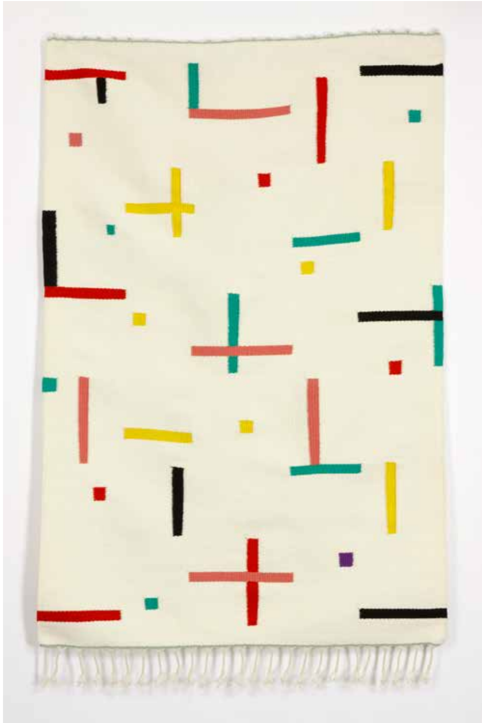
Tapestry 110: IMPROVISATION III 2008 wool weft, linen warp 68 1/2 x 46 inches