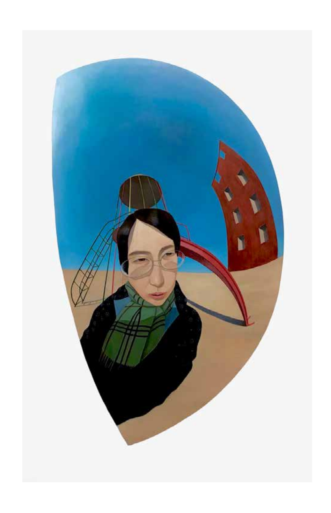
SELF PORTRAIT 1996 oil on plywood 41 x 24 inches