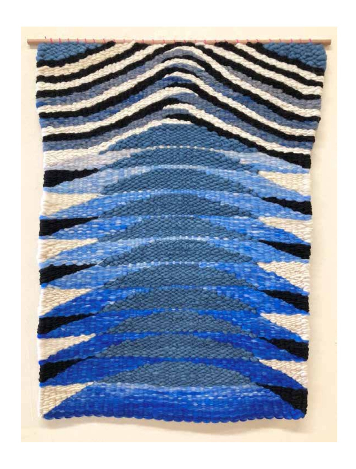
APRIL IN PARIS 2023 hand dyed wool weft, recycled wool warp 46 x 31 1/2 inches