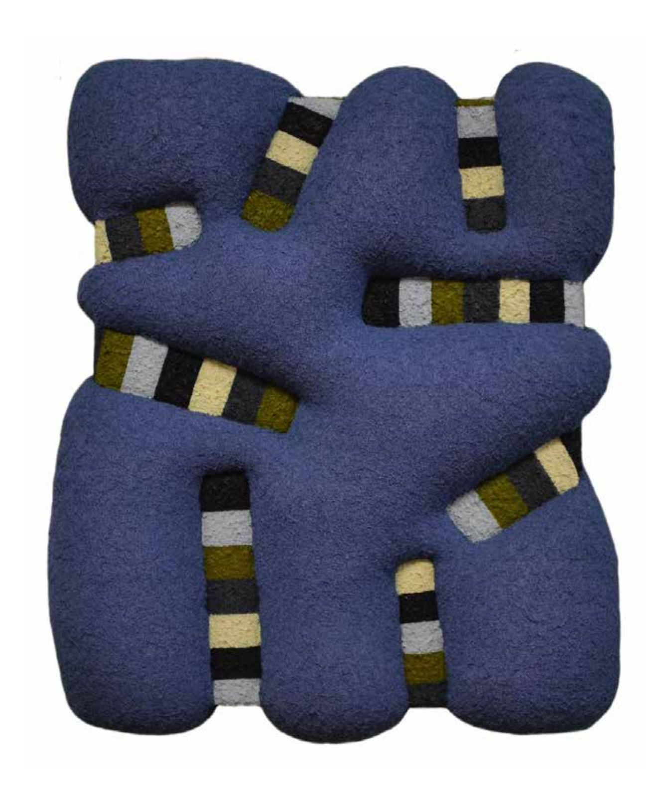
KEEP ON 2013 acrylic, felt, staples on panel 12 \times 10 \times 3 inches