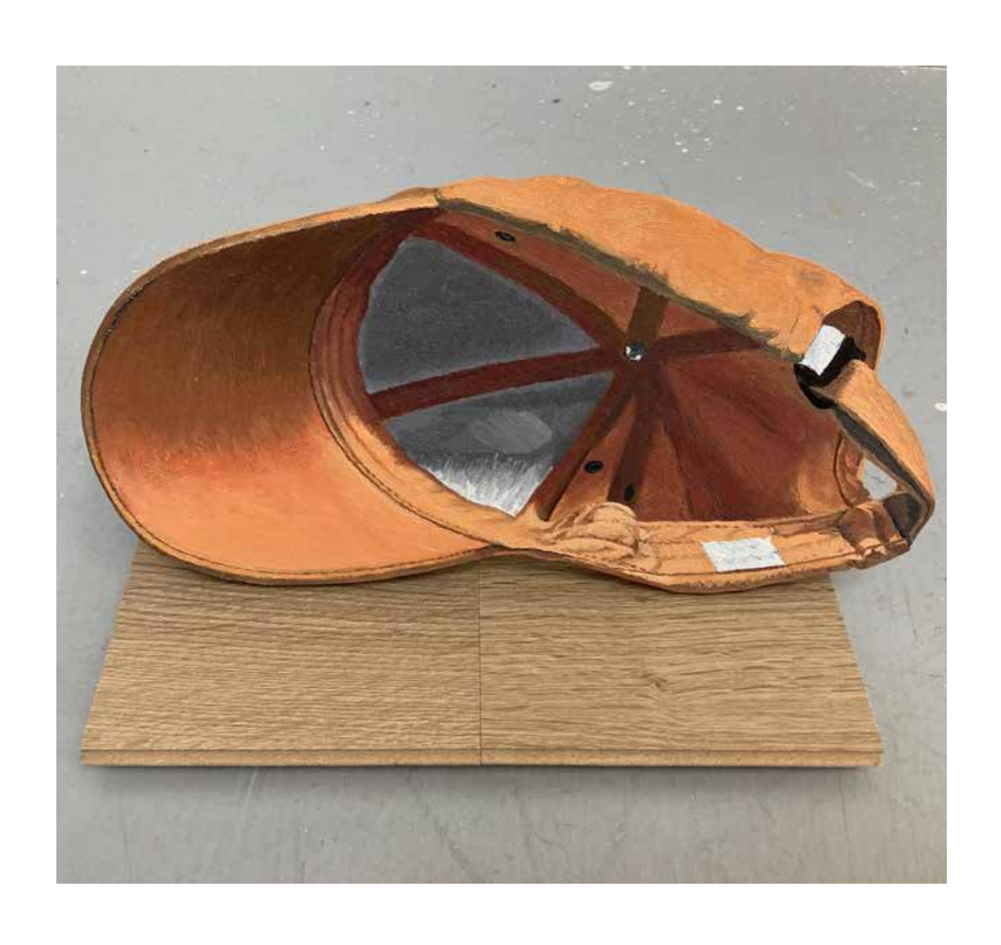
HAT ON THE FLOOR 2022 cut out oil on canvas mounted on wood 5 1/2 x 11 inches {\rm Sam\ Cady}