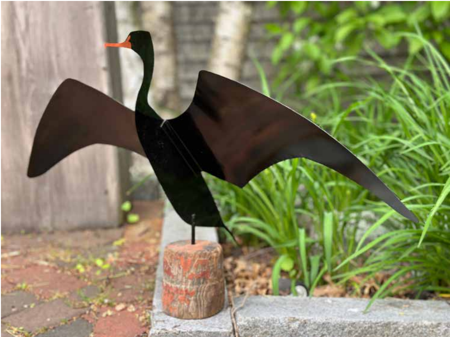
CORMORANT DRYING WINGS painted sheet metal, cork base 17 x 29 x 15 inches