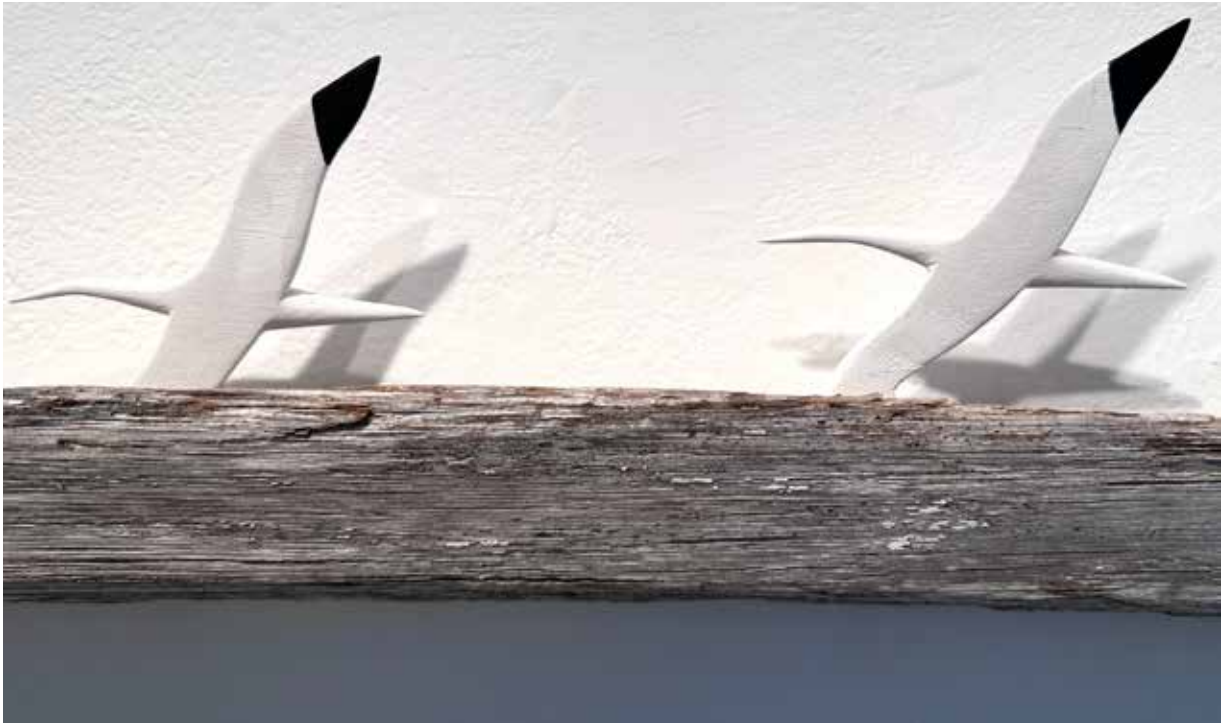
GROUNDSWELL II GROUNDSWELL II (detail) driftwood, painted wood 7 x 58 x 2 inches