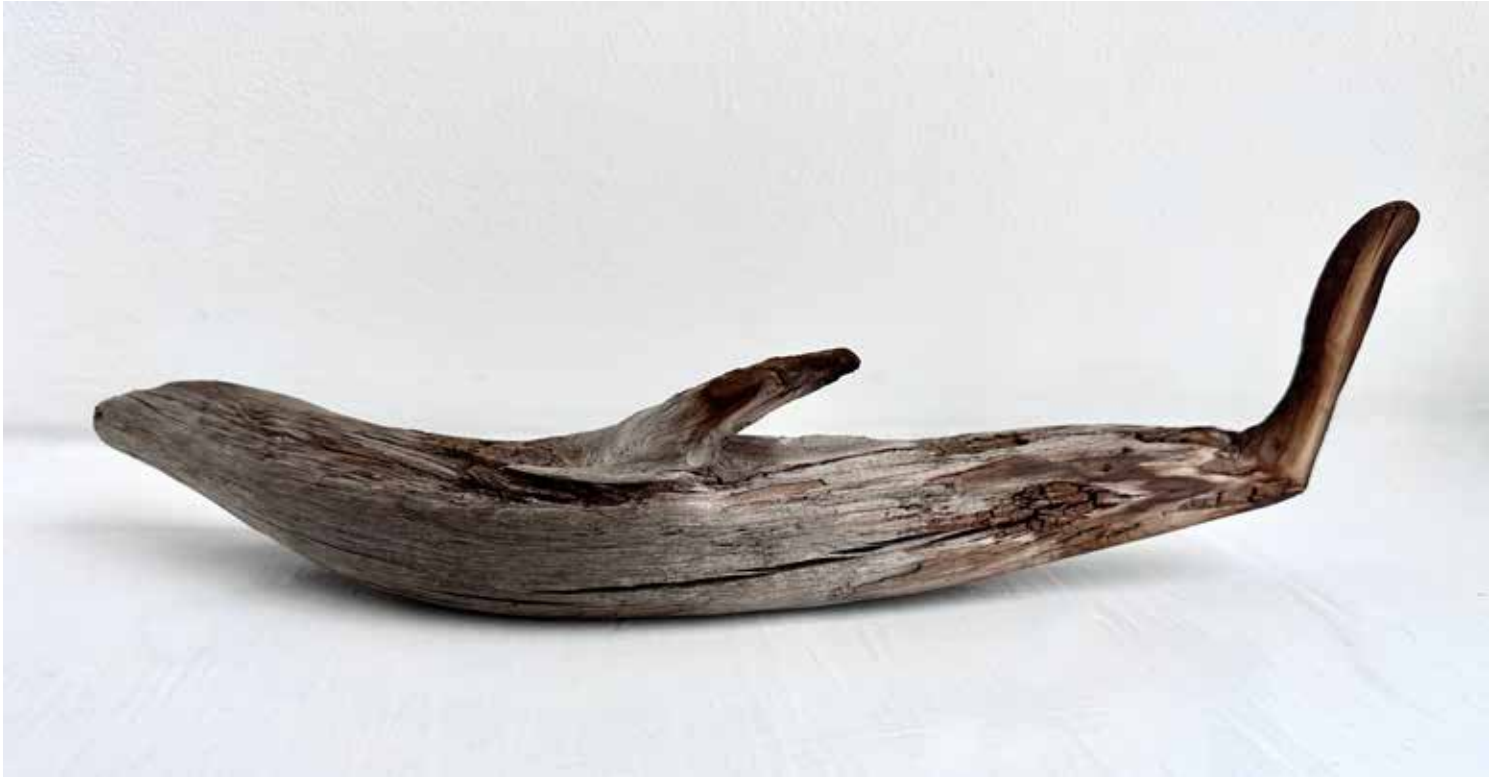
HUMPBACK WHALE driftwood 2 1/2 x 12 3/4 x 3 inches