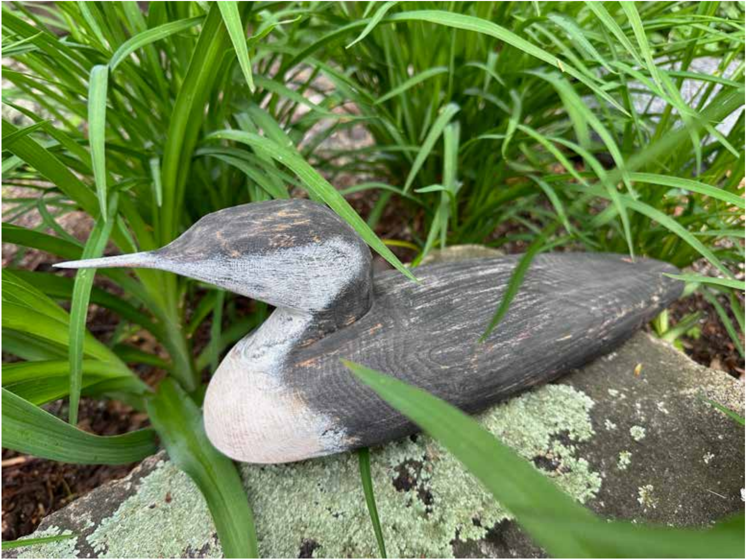
BUOY WINTER LOON 2014 wooden buoy, paint 4 1/2 x 17 1/2 x 4 1/2 inches