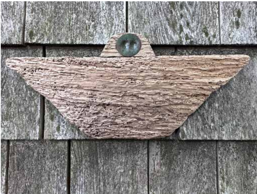
DRIFTWOOD NATURAL EAGLE 2018 driftwood 5 x 19 x 3 1/2 inches