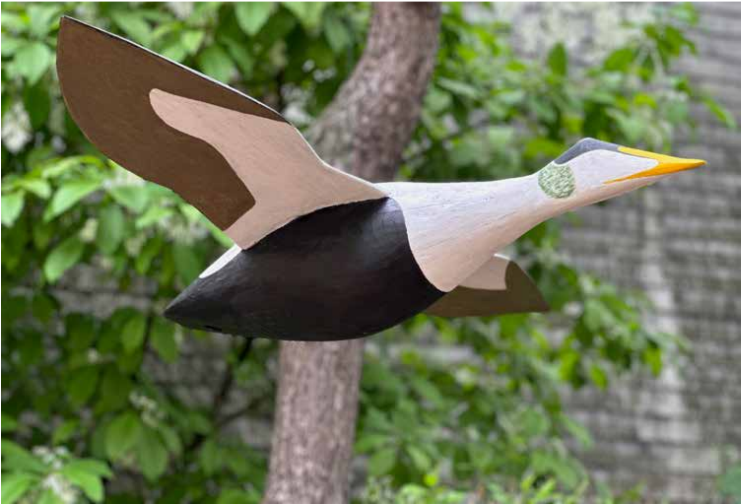
EIDER IN FLIGHT buoy, paint 7 x 31 x 47 1/2 inches