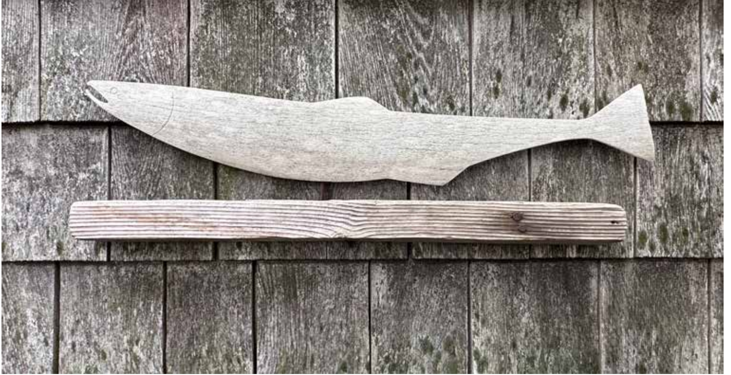
SALMON SWIMMING antler, wood 6 1/2 x 22 x 7 3/8 inches