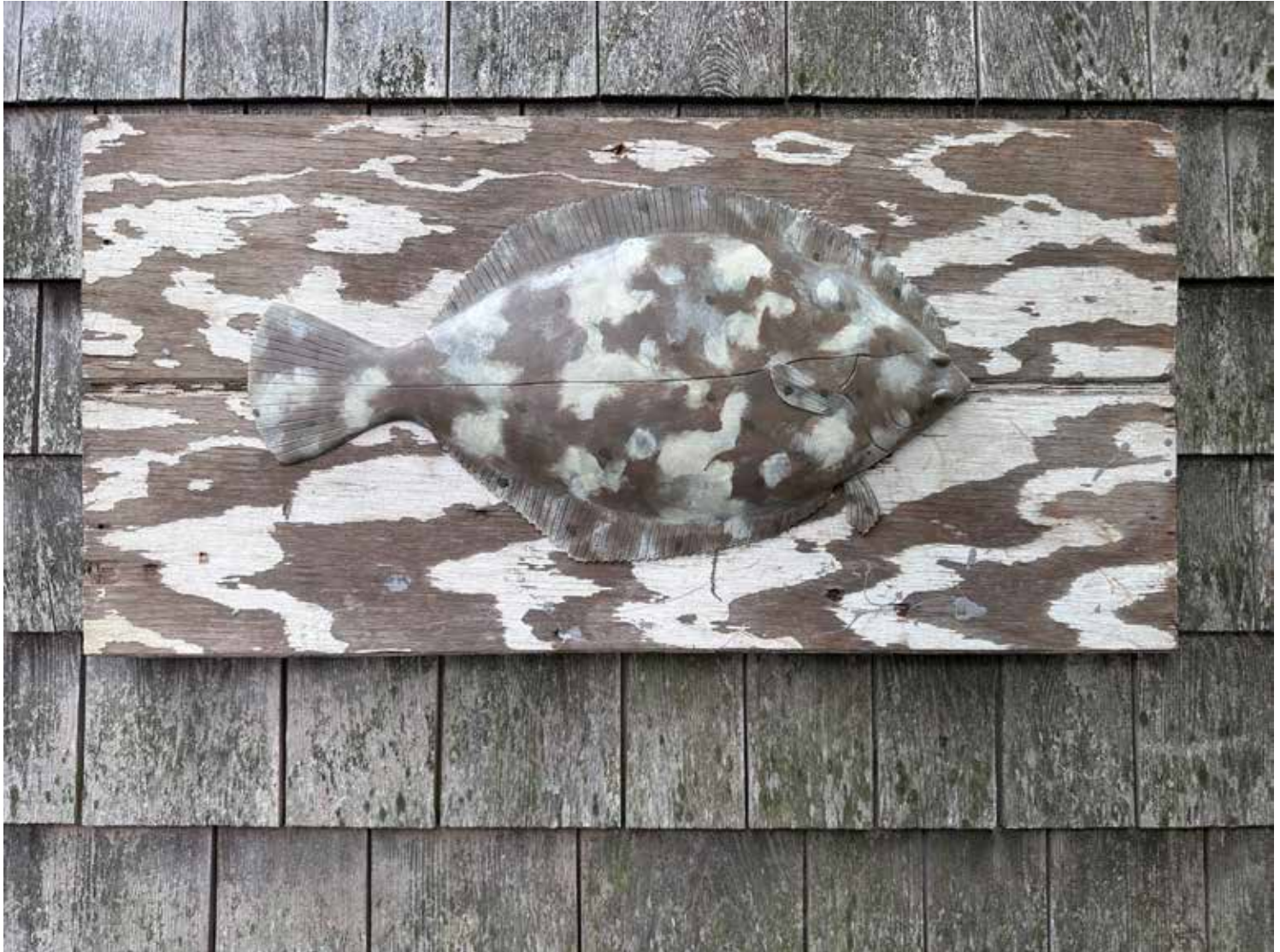
FLOUNDER ON THE BOTTOM 2018 found plywood, carved fish painted by Marnie Sinclair 16 x 32 x 1 5/8 inches