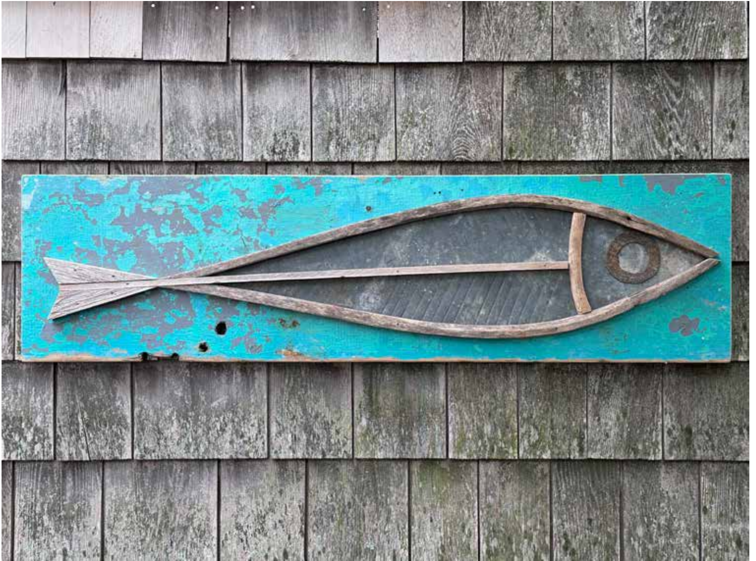
SNOWSHOE HERRING 2015 found wood, zinc 10 x 37 1/4 x 1 1/2 inches