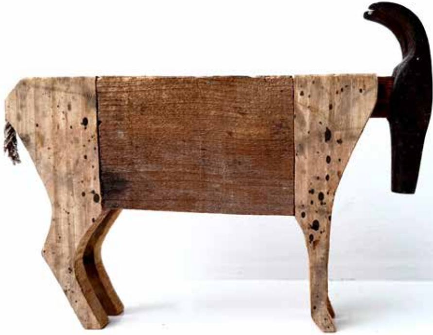
GOAT 2022 wood and hammer 7 x 9 1/2 x 1 1/2 inches