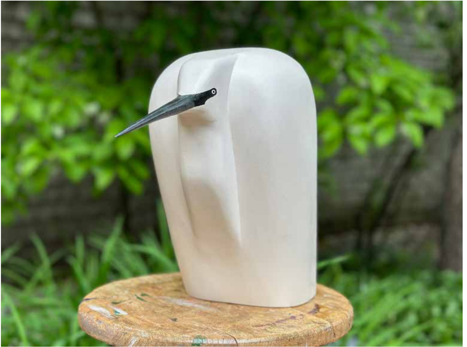
HUNKERED SNOWY EGRET 2017 painted wood 11 1/2 x 13 1/2 x 6 1/2 inches