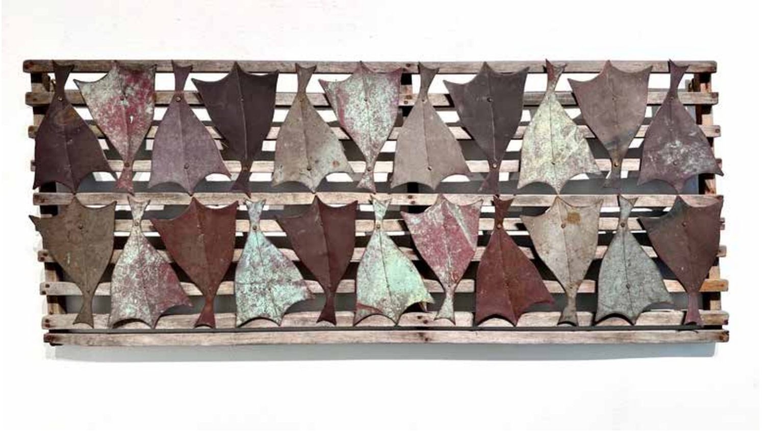
FISH DRYNG RACK copper, found wood crate 12 3/4 x 31 x 1 1/4 inches