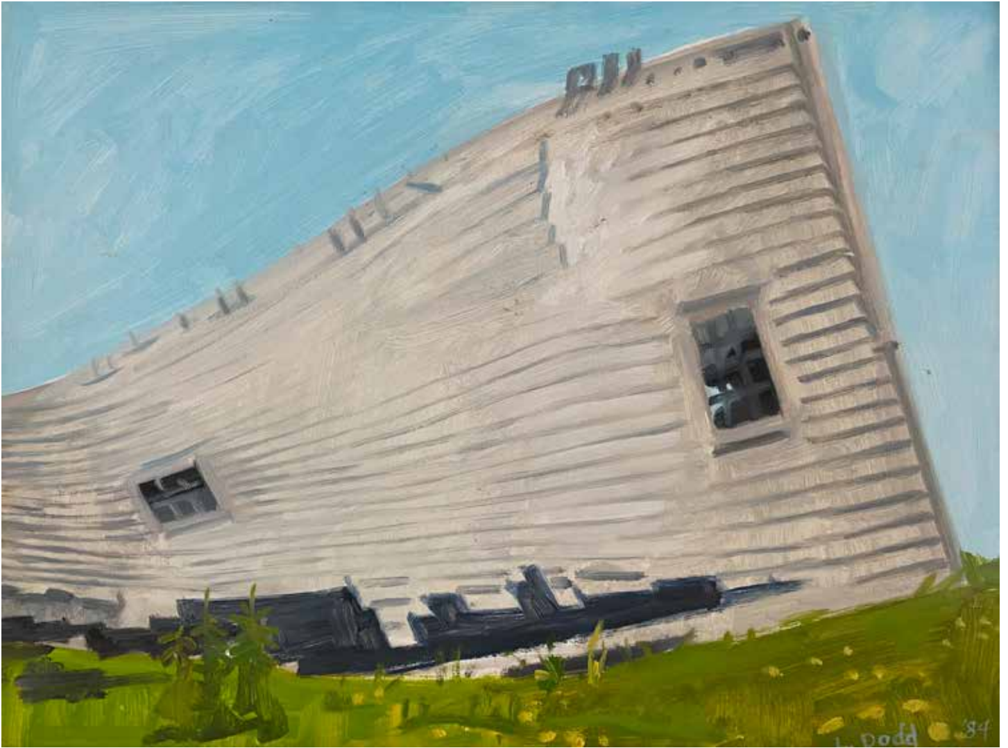
COLLAPSED BARN 1984 oil on panel 12 x 15 inches private collection