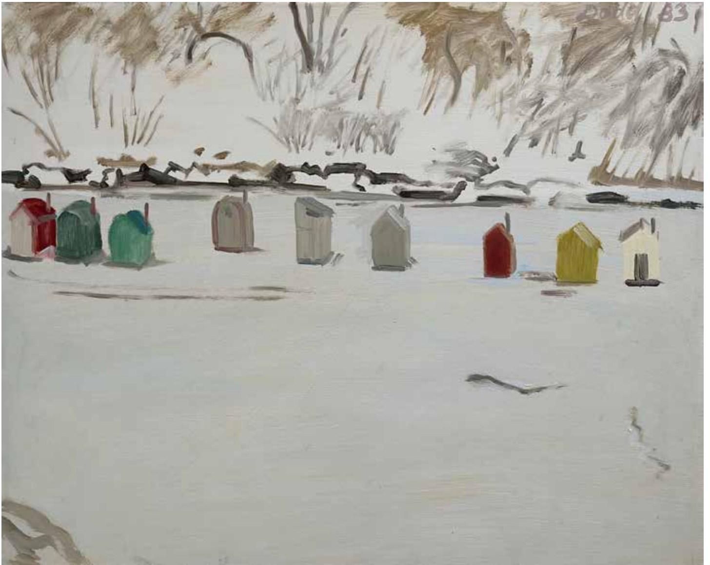
FISHING HUTS 1983 oil on panel 12 x 15 inches