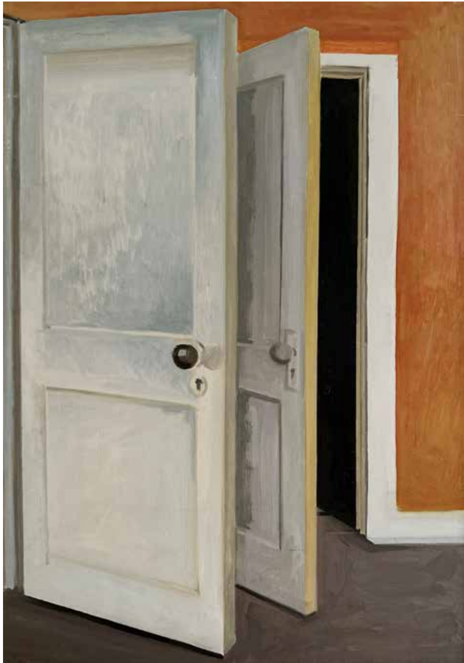
DOUBLE DOOR 1976 oil on panel 20 x 14 inches private collection