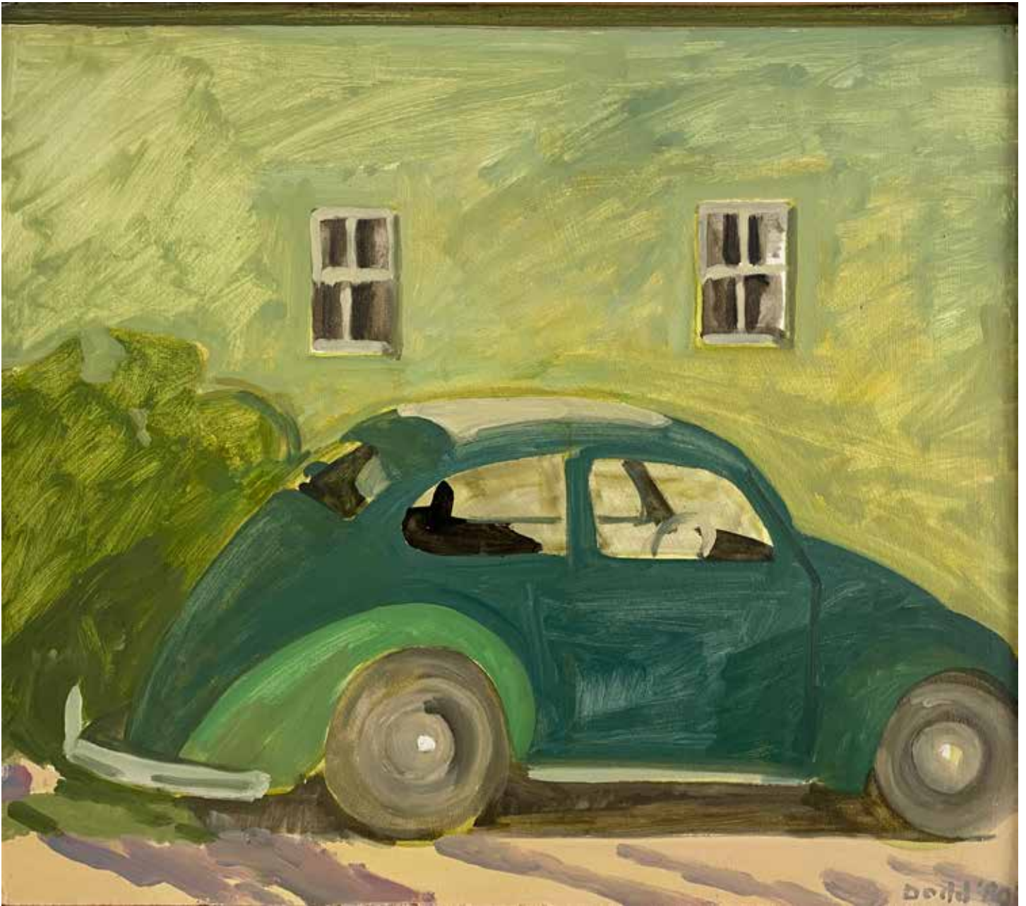
VW AND TWO WINDOWS 1980 oil on panel 16 x 18 inches private collection