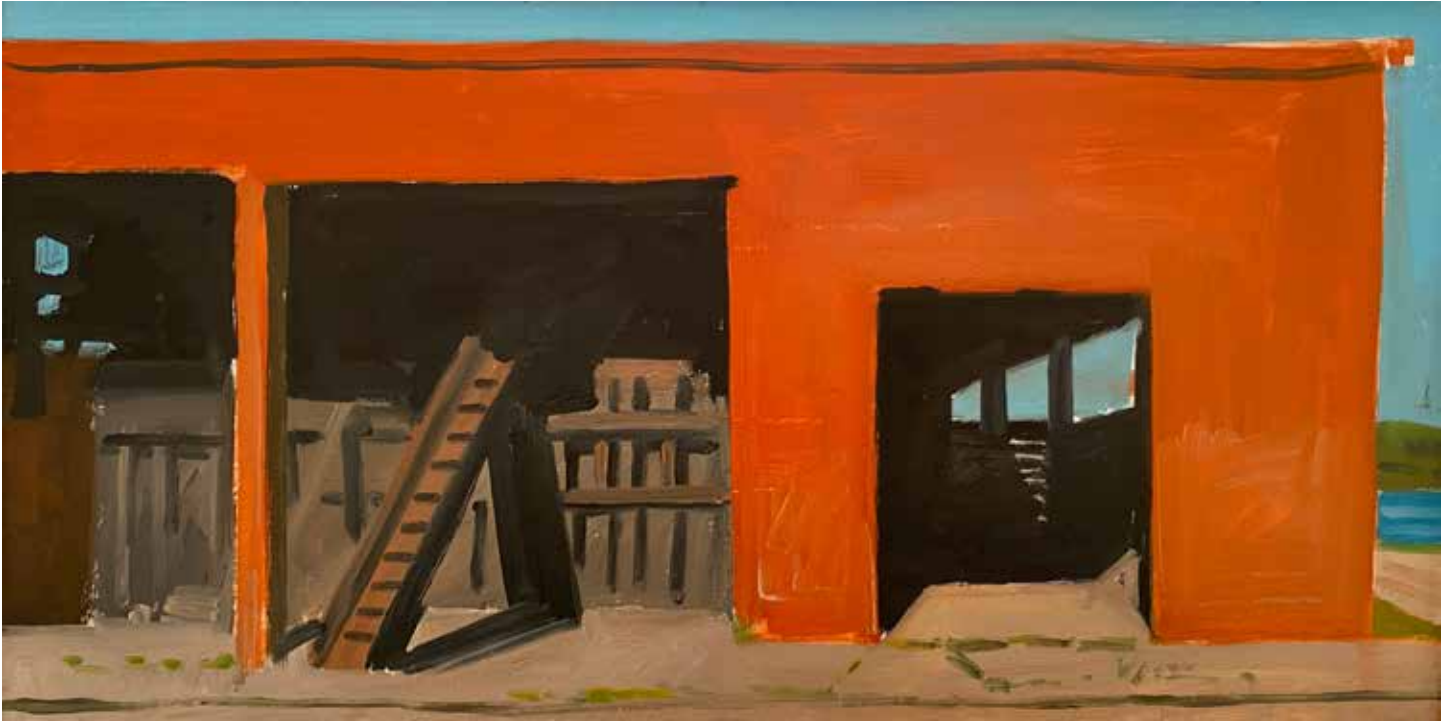
COAL BARN, BELFAST 1994 oil on panel 8 1/2 x 17 inches private collection