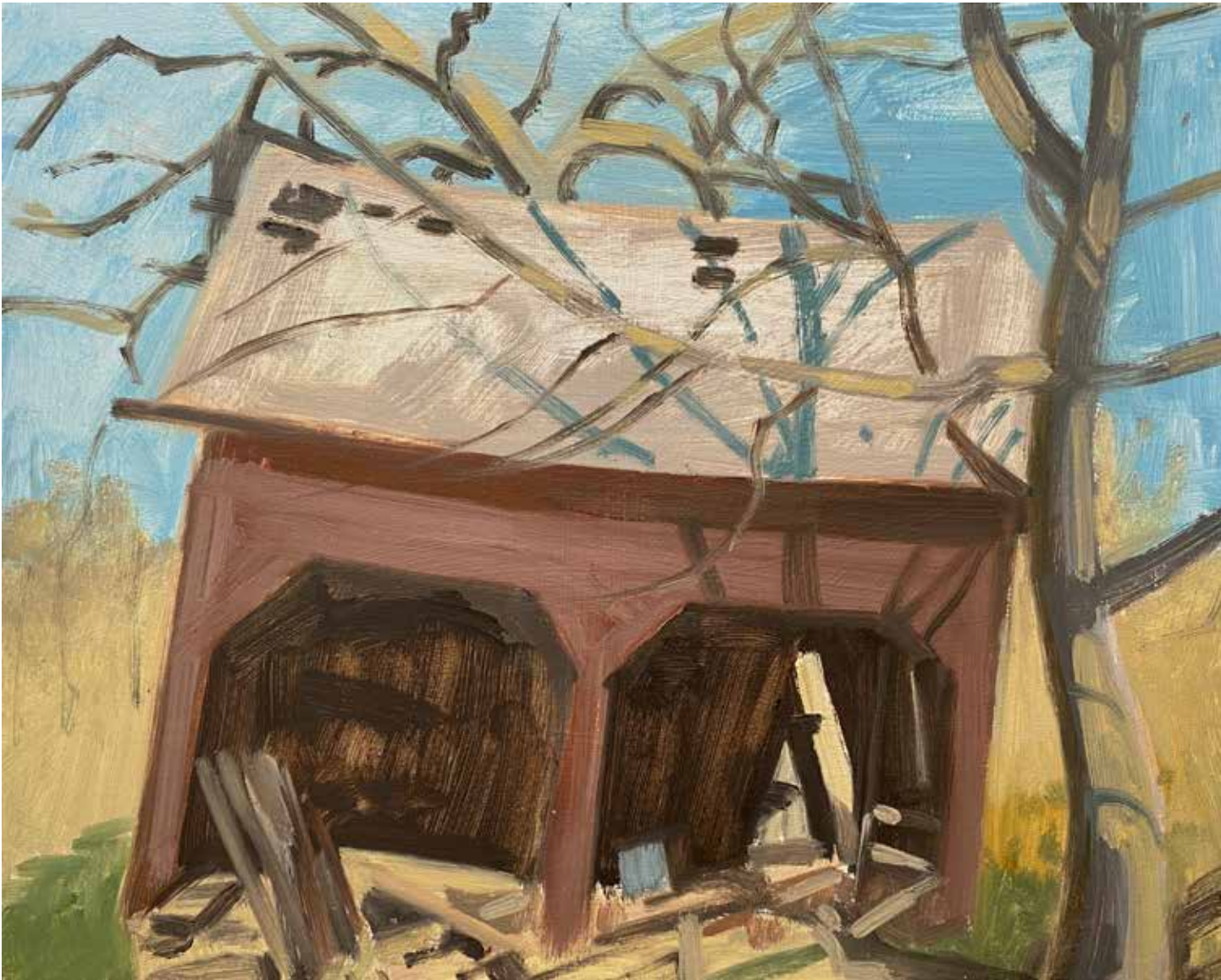
SHED 2000 oil on panel 8 x 9 3/4 inches