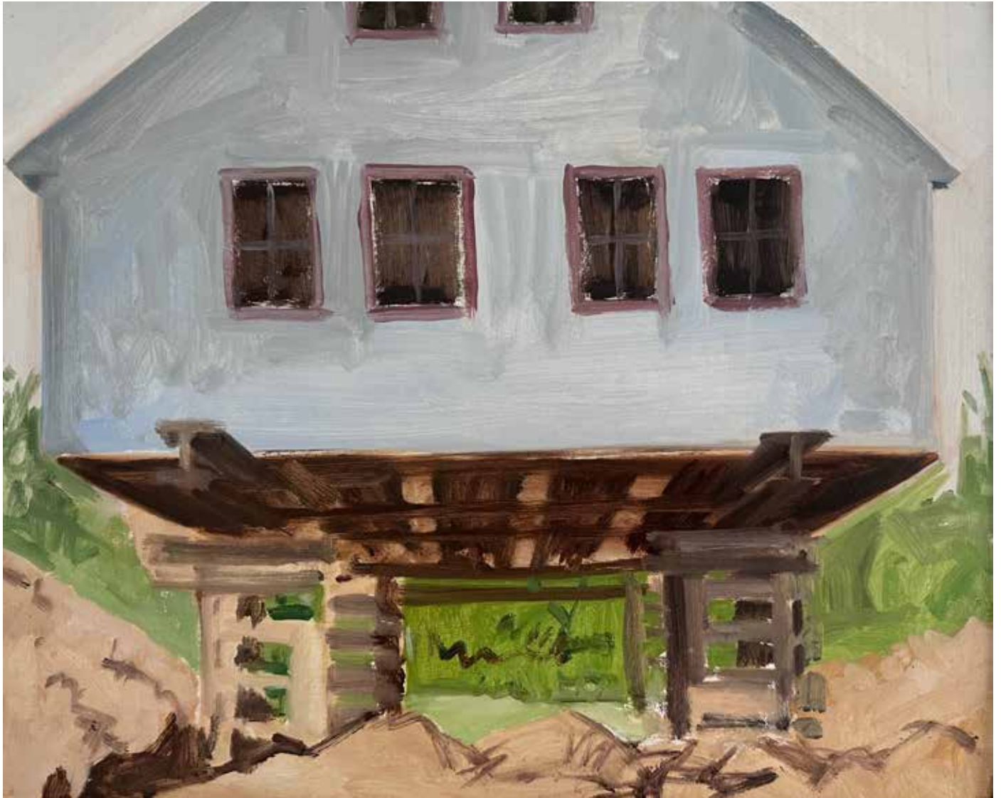
CAPE ELEVATED 1985 oil on panel 12 x 15 inches