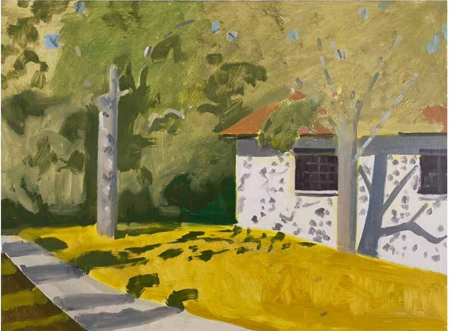
WILL'S CABIN AT ROCK GARDEN INN 2011 oil on panel 12 x 16 inches private collection