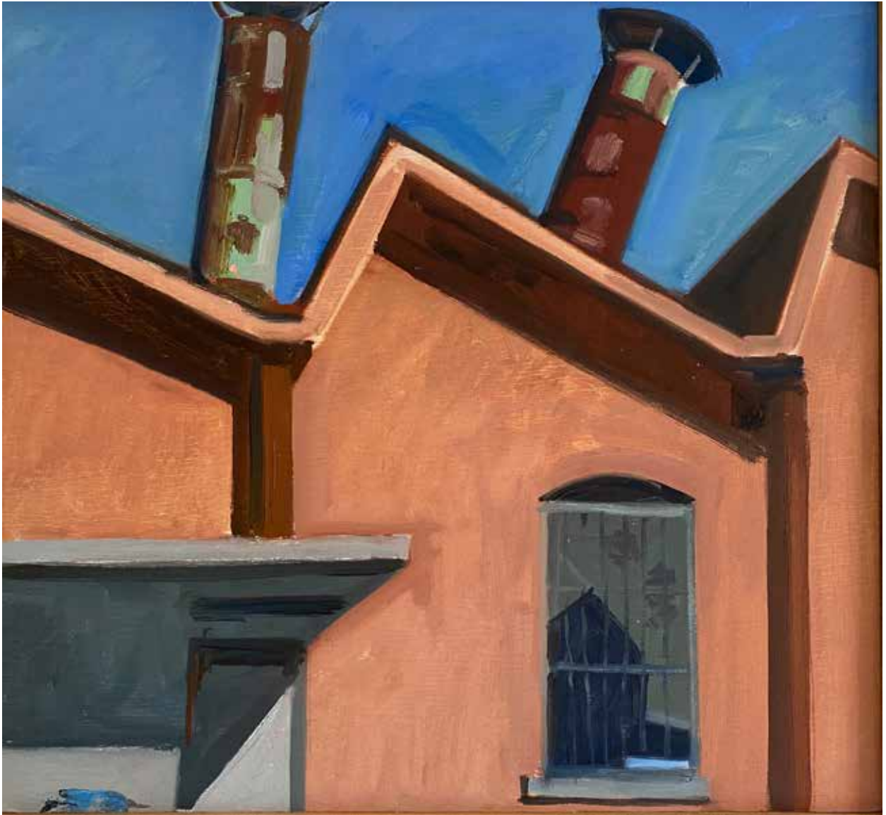
PASSAIC, NJ 1996 oil on panel 13 3/4 x 15 inches