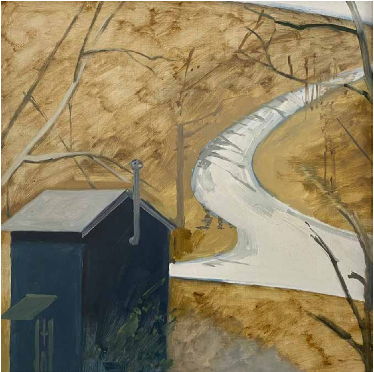
BLUE HOUSE AND ROAD 1975 oil on panel 15 1/2 x 16 1/2 inches