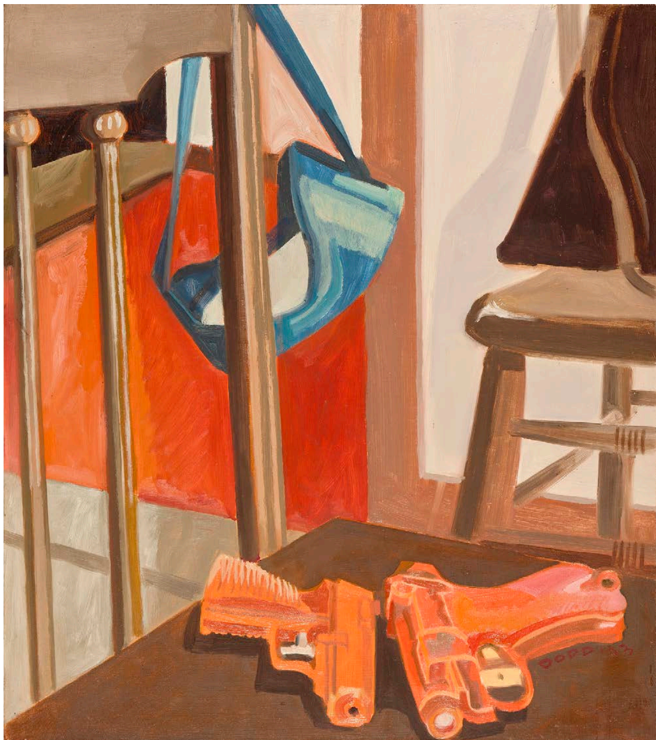
SUMMER PARAPHERNALIA 1973 oil on panel 16 x 14 inches