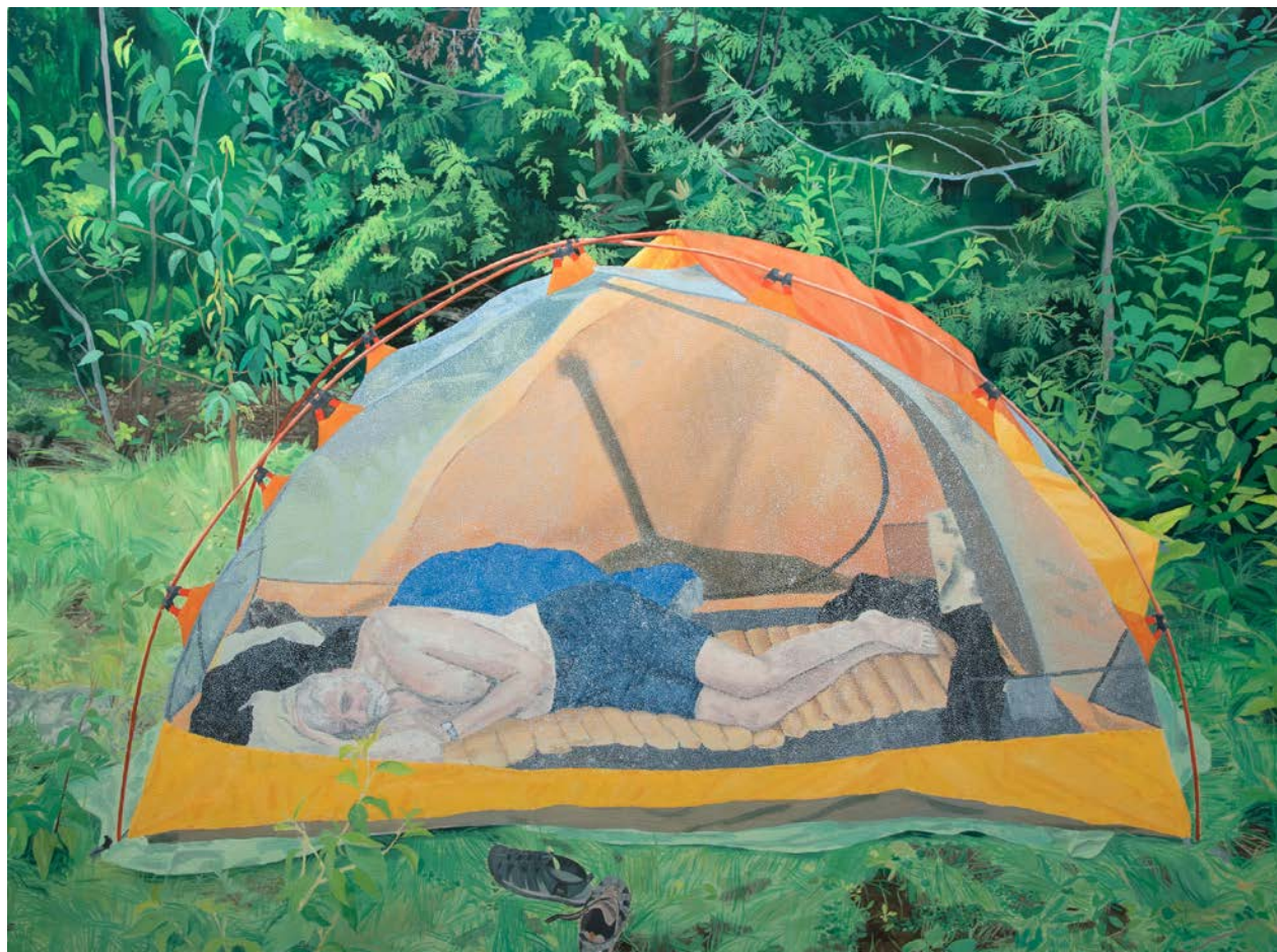
RESTING AT CAMP 2015 oil on canvas 38 x 50 inches