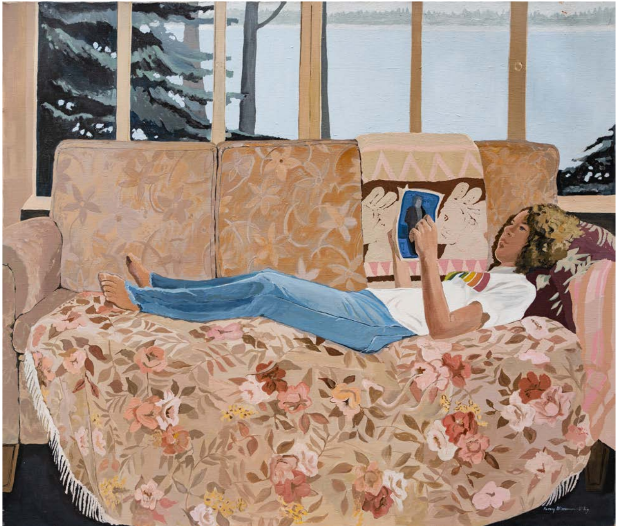
SUMMER READING 1972 acrylic on canvas 42 x 50 inches