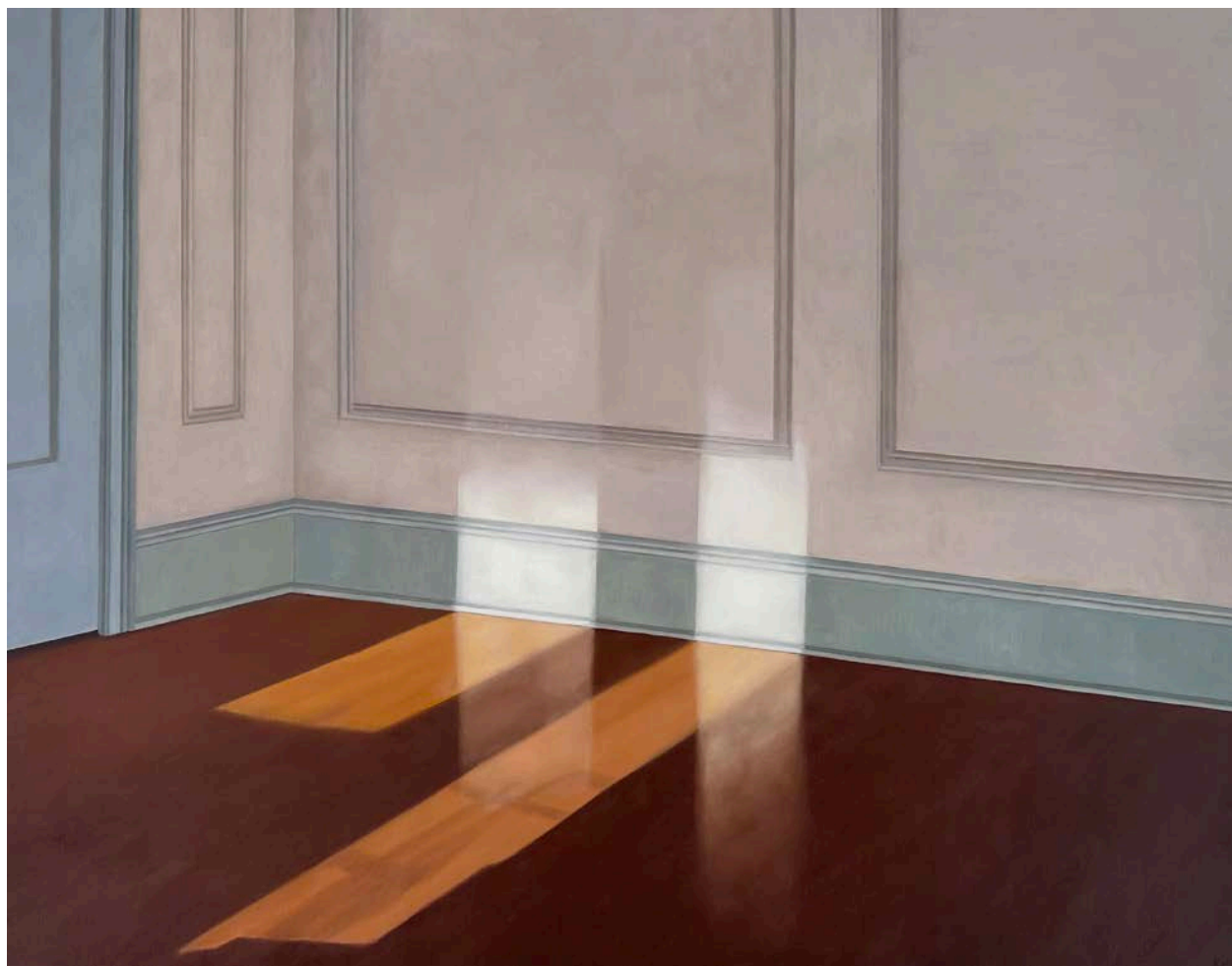
NEW YORK STORY - MORNING 2022 oil on canvas 36 x 46 inches