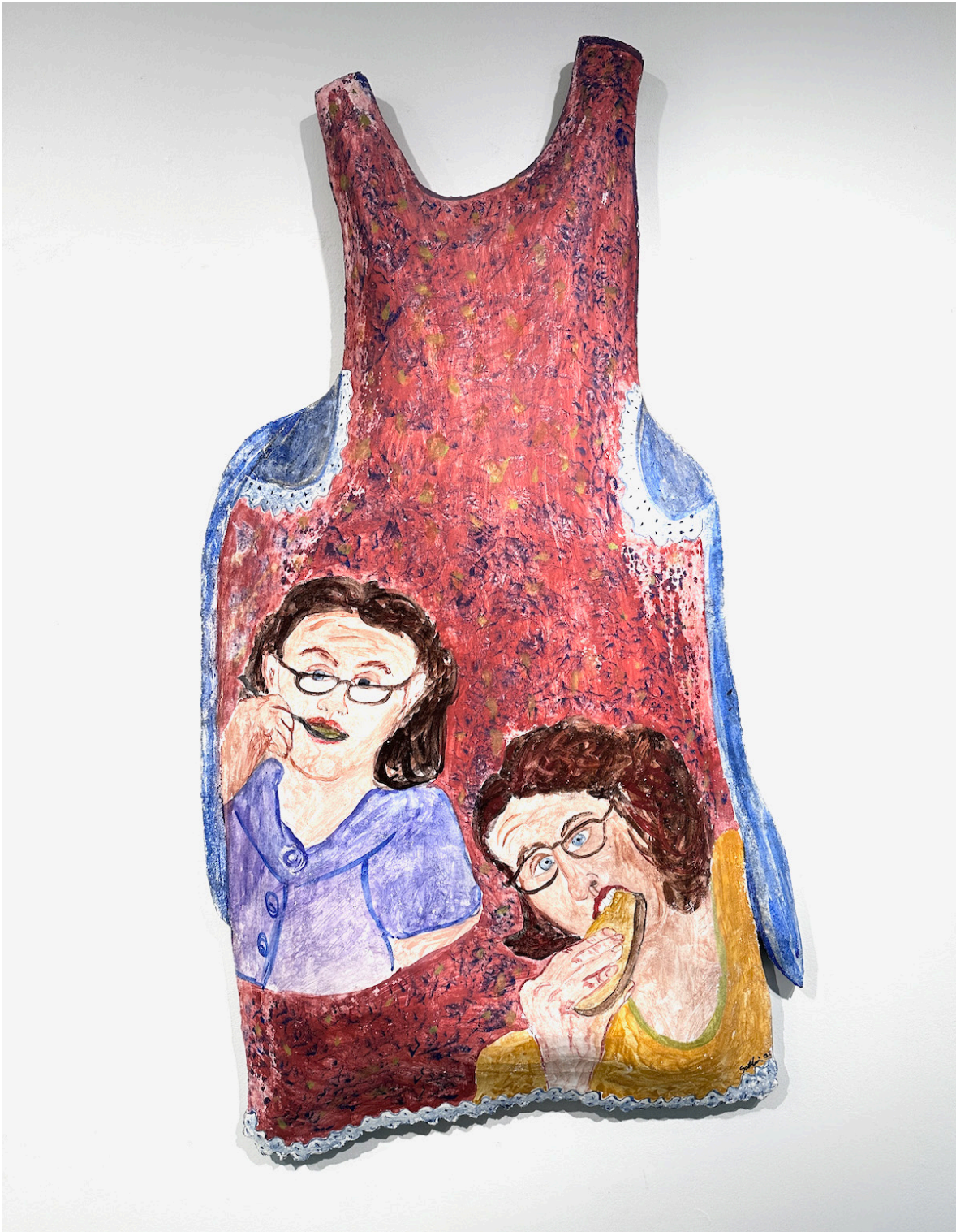
FEED THEM ALL 2002 shaped fresco 39 1/2 x 21 x 3 inches