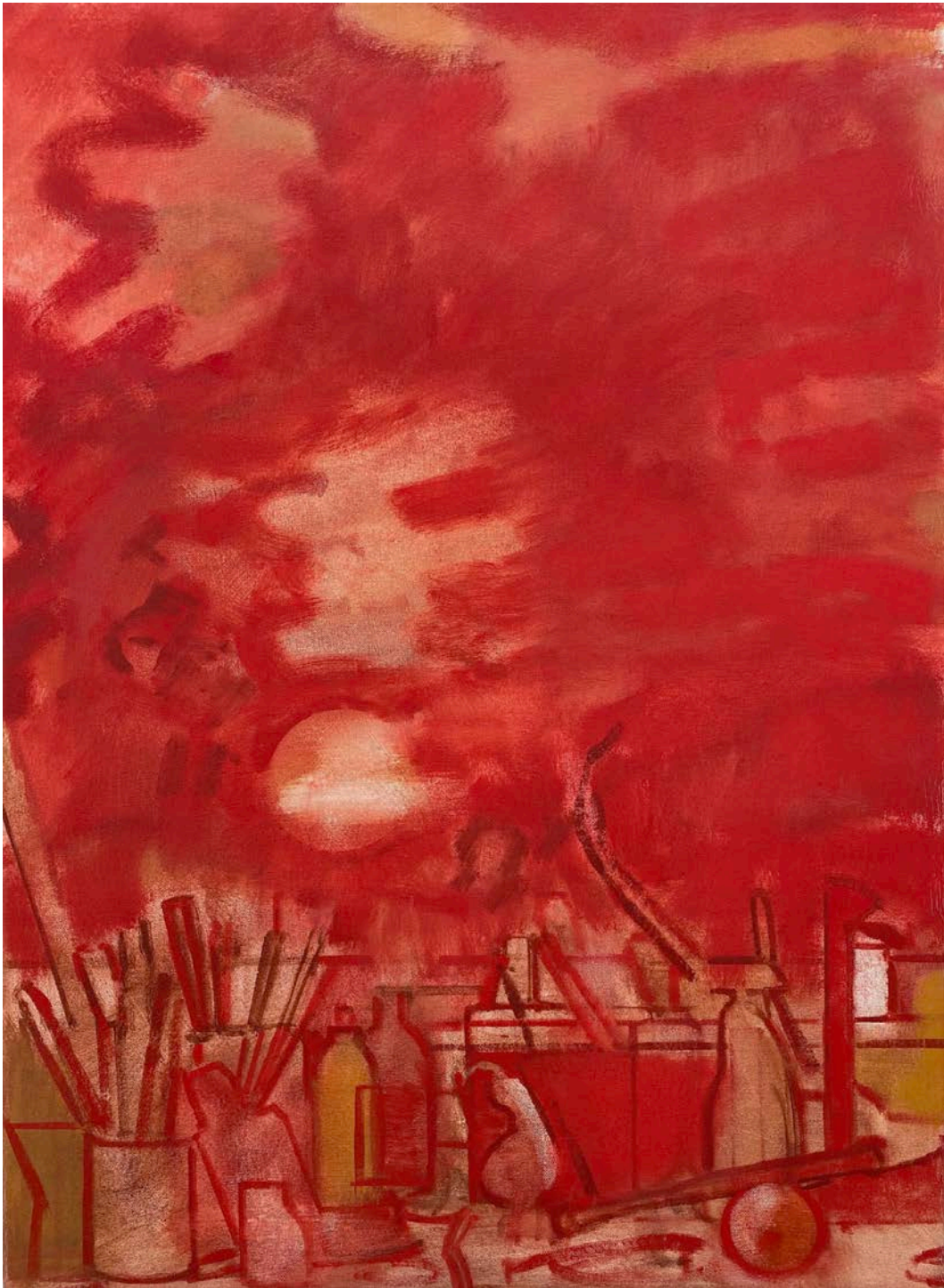
STUDIO CLUTTER (Lockdown) #2 2020 oil on canvas 30 x 22 inches