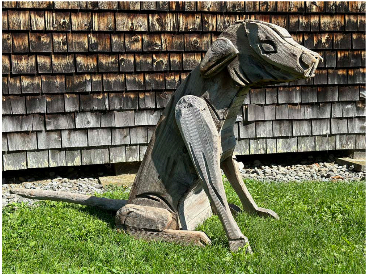
SITTING DOG 1970's Wood 36 1/2 x 54 1/2 x 18 1/2 inches (nfs)