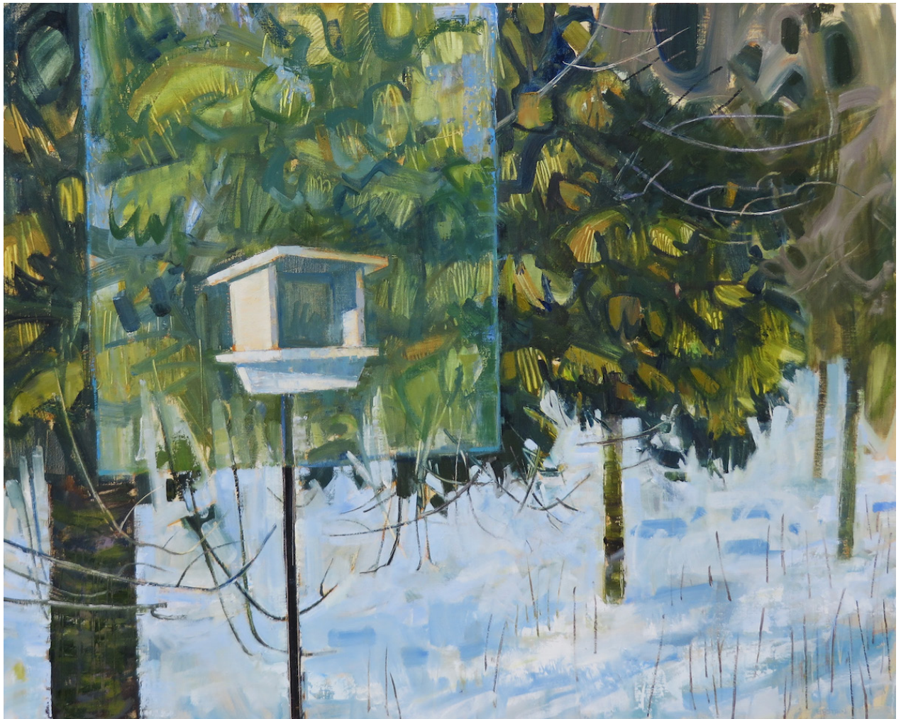
BIRD FEEDER WITH REFLECTION, 2022 oil on linen 40 x 50 inches