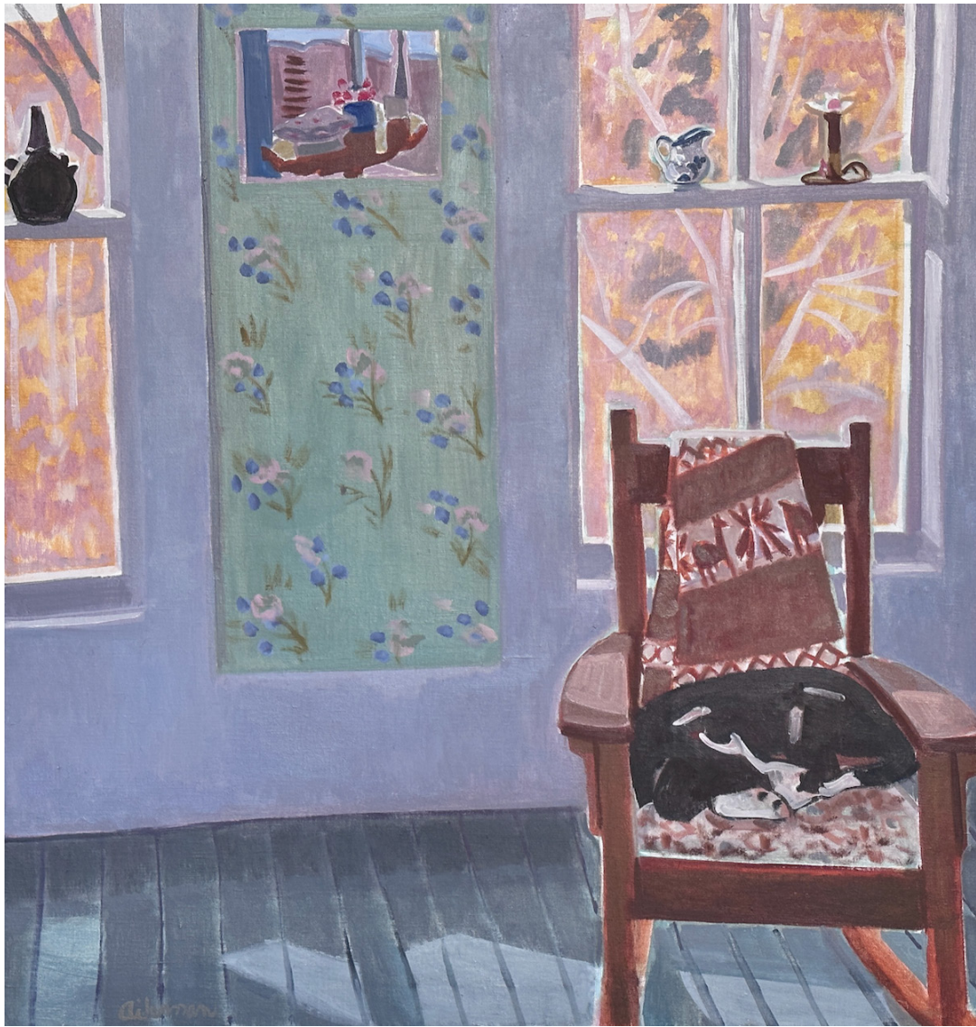
AFTERNOON NAP OF LADYBUG 1974 oil on linen, 32 x 32 inches