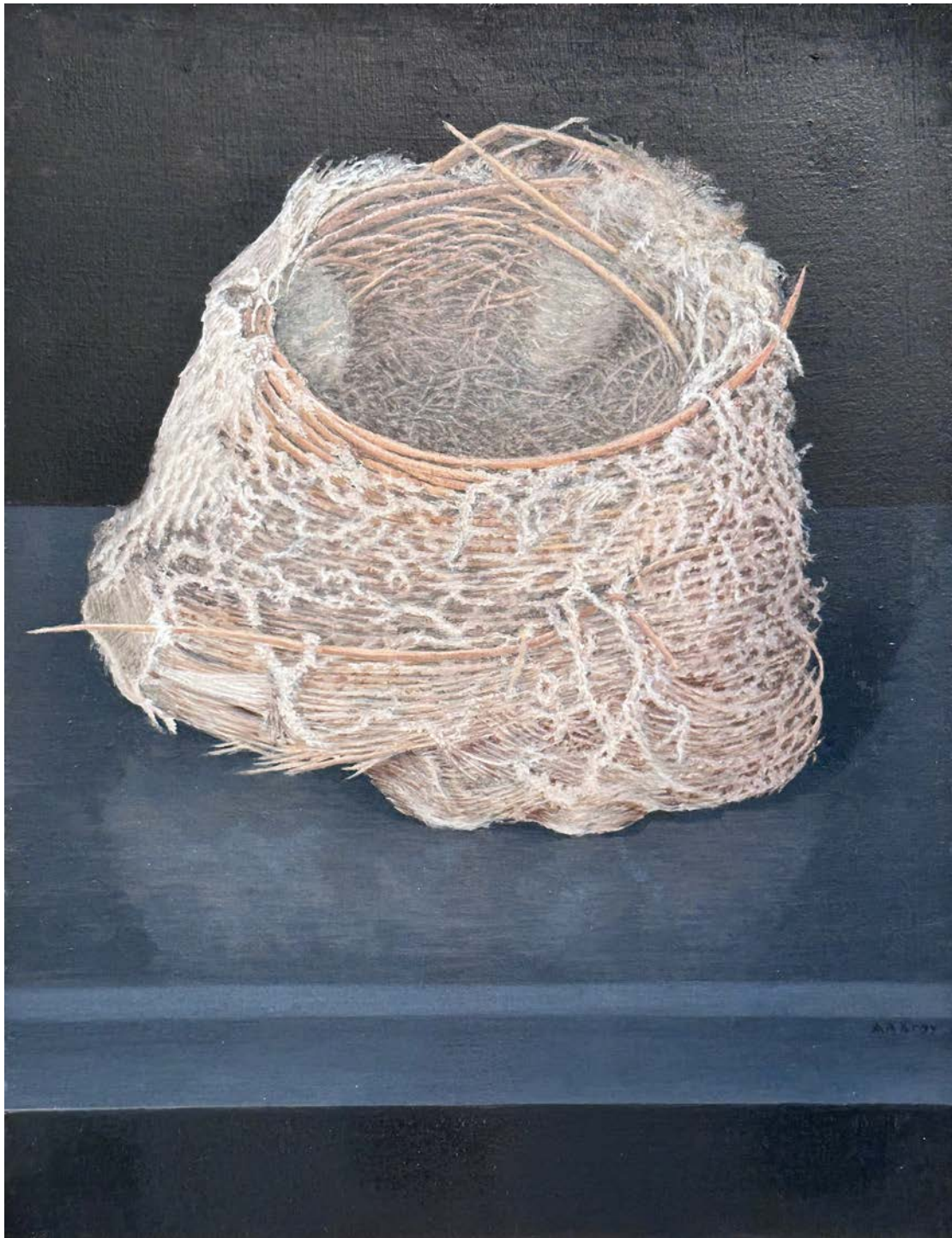
REBUILT NEST 2023 casein on panel 11 1/2 x 9 inches