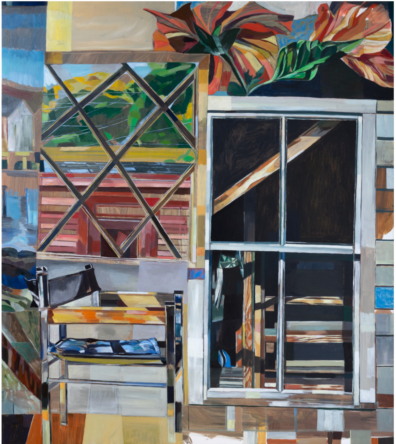
BETWEEN TWO WINDOWS, VINALHAVEN 2023 oil on canvas 45 x 40 inches