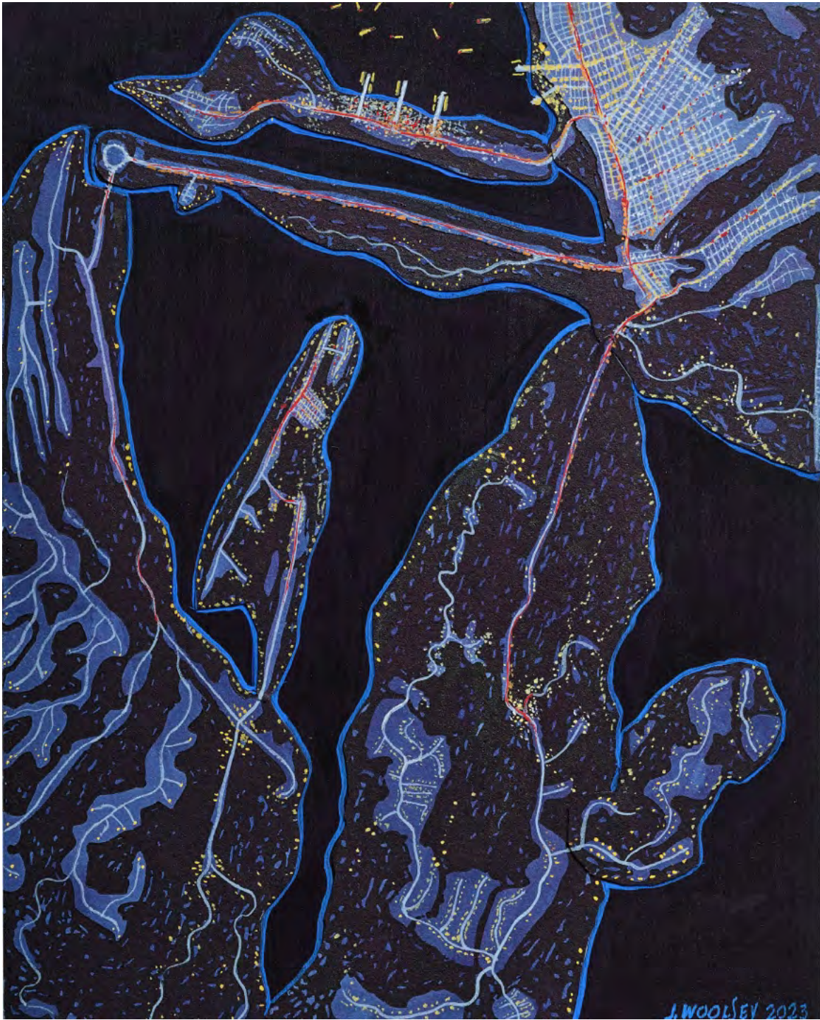
PORT 2023 watercolor, gouache and acrylic on woodcut collage mounted on panel 10 x 8 inches