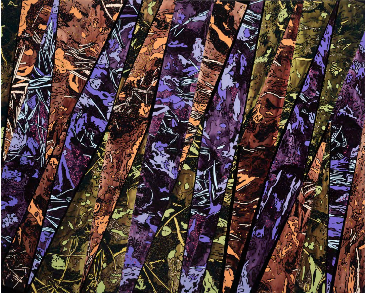
FAULTS #1 2022 watercolor, gouache and acrylic on woodcut collage mounted on panel 28 x 35 inches