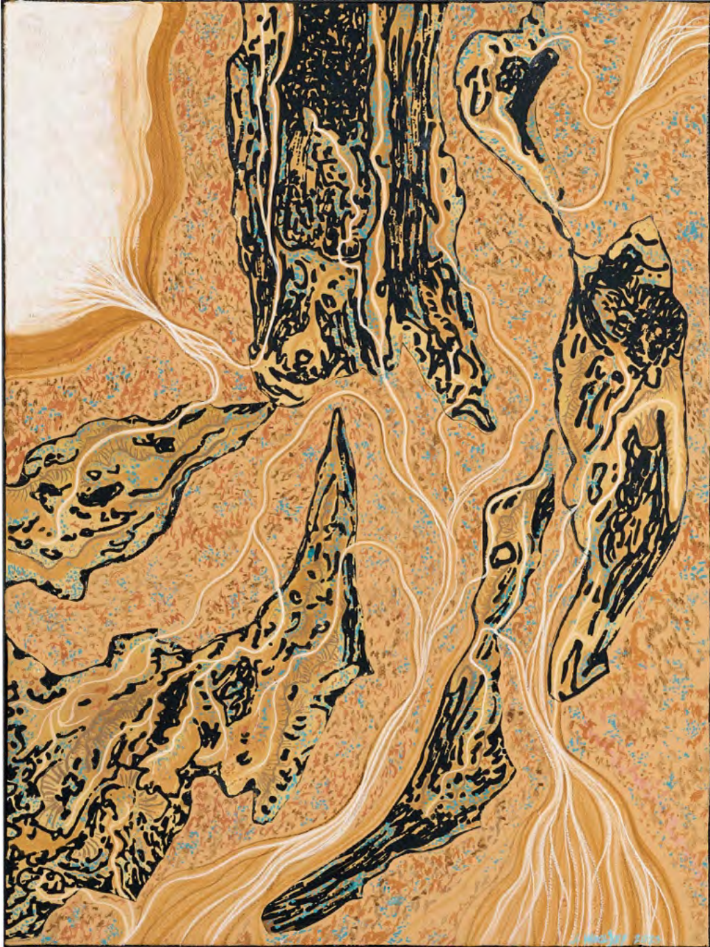
ARROYOS AND SALT PAN 2023 watercolor and gouache on woodcut collage mounted on canvas 16 x 12 inches