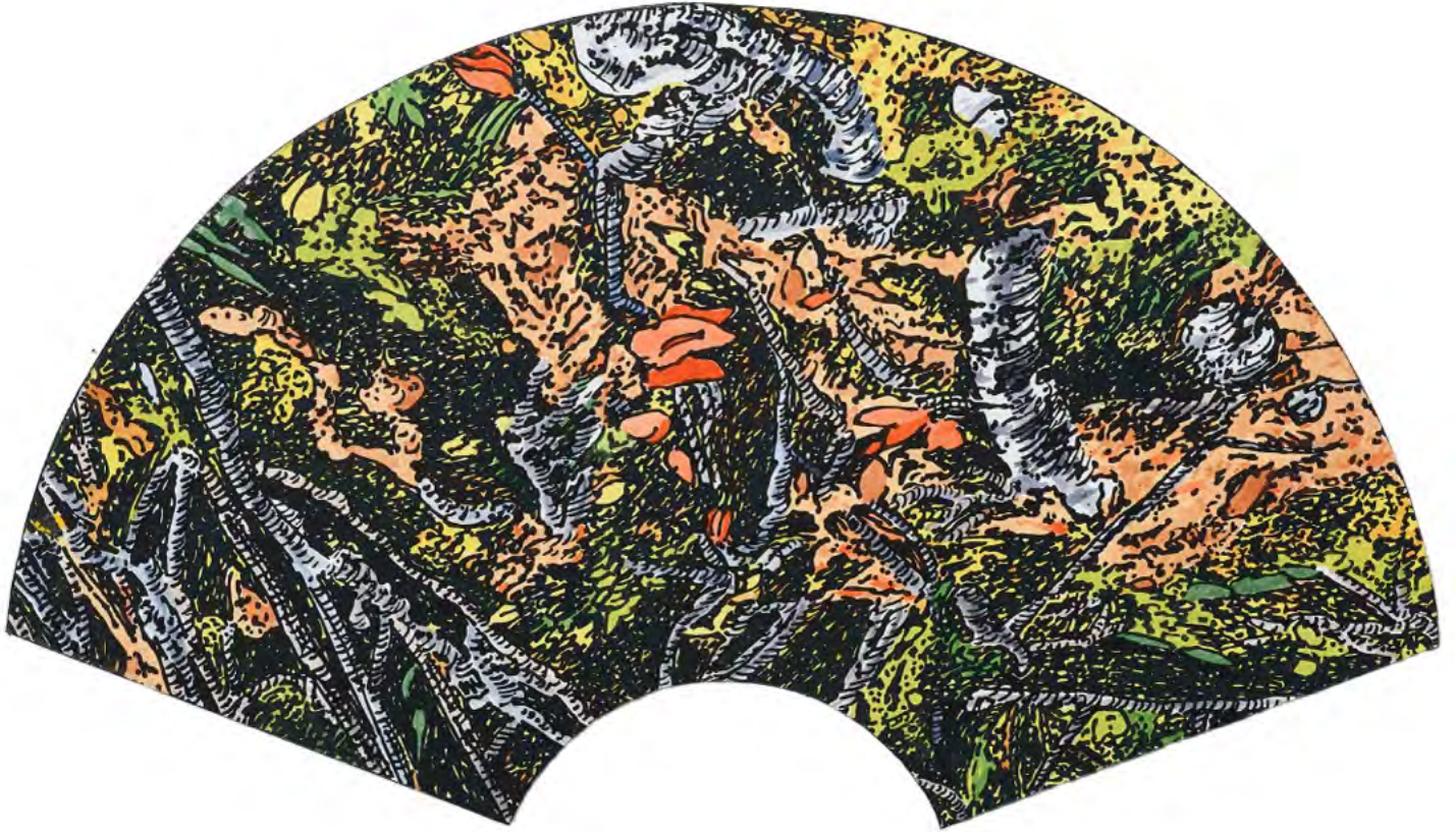
SMALL FAN #14 2023 watercolor on woodcut print 16 3/4 x 9 1/2 inches