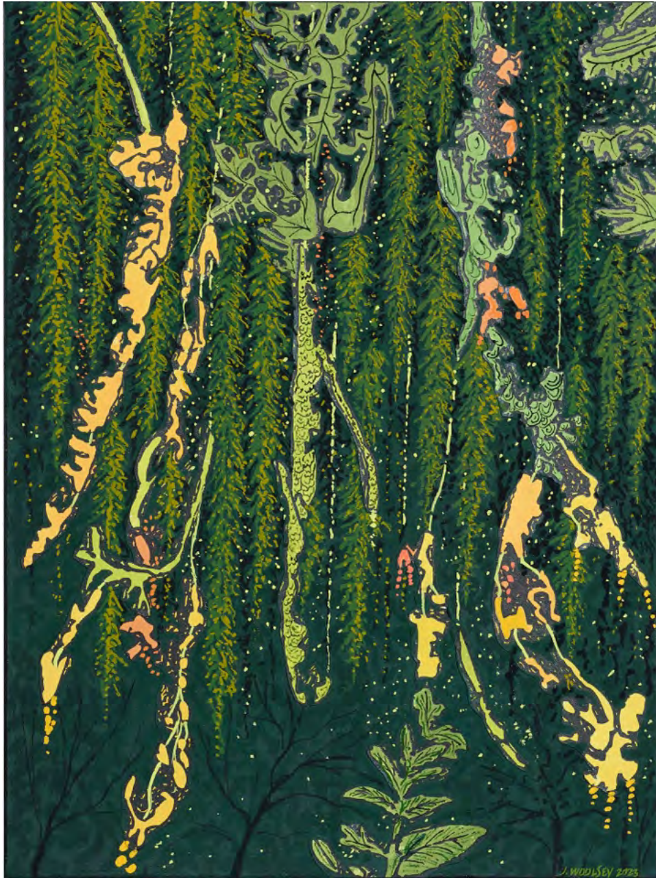
HANGING GARDEN 2023 watercolor and gouache on woodcut collage mounted on canvas 16 x 12 inches