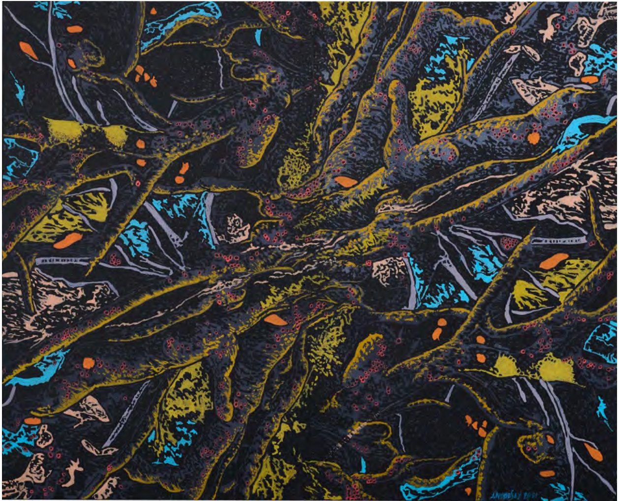
HOMAGE TO SAMUEL PALMER 2021 watercolor and gouache on woodcut collage mounted on panel 18 x 18 inches