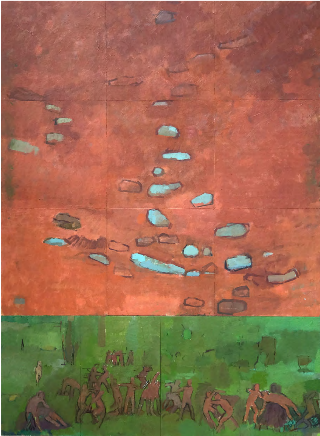
FIELD/SKY/FIGURES #25 2018 oil on panel 66 x 48 inches