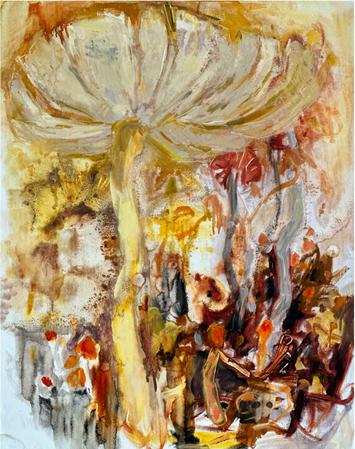
BIG YELLOW 2010 oil on canvas 30 x 24 inches