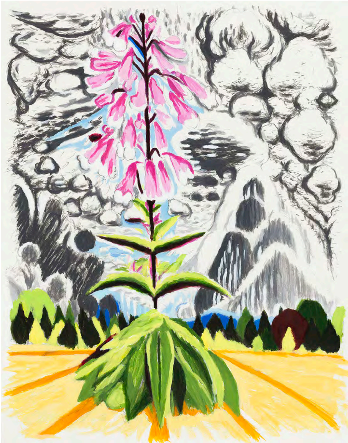
HAIRY PENSTEMON AND STORMCLOUDS 2023 acrylic on paper 14 x 11 inches