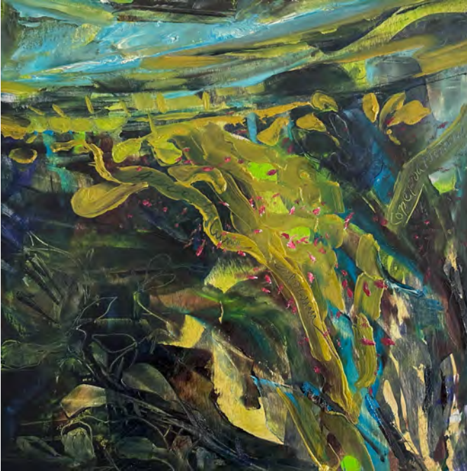
ASCOPHYLUM NODOSUM & COPEPODS 2023 oil on panel 12 x 12 inches