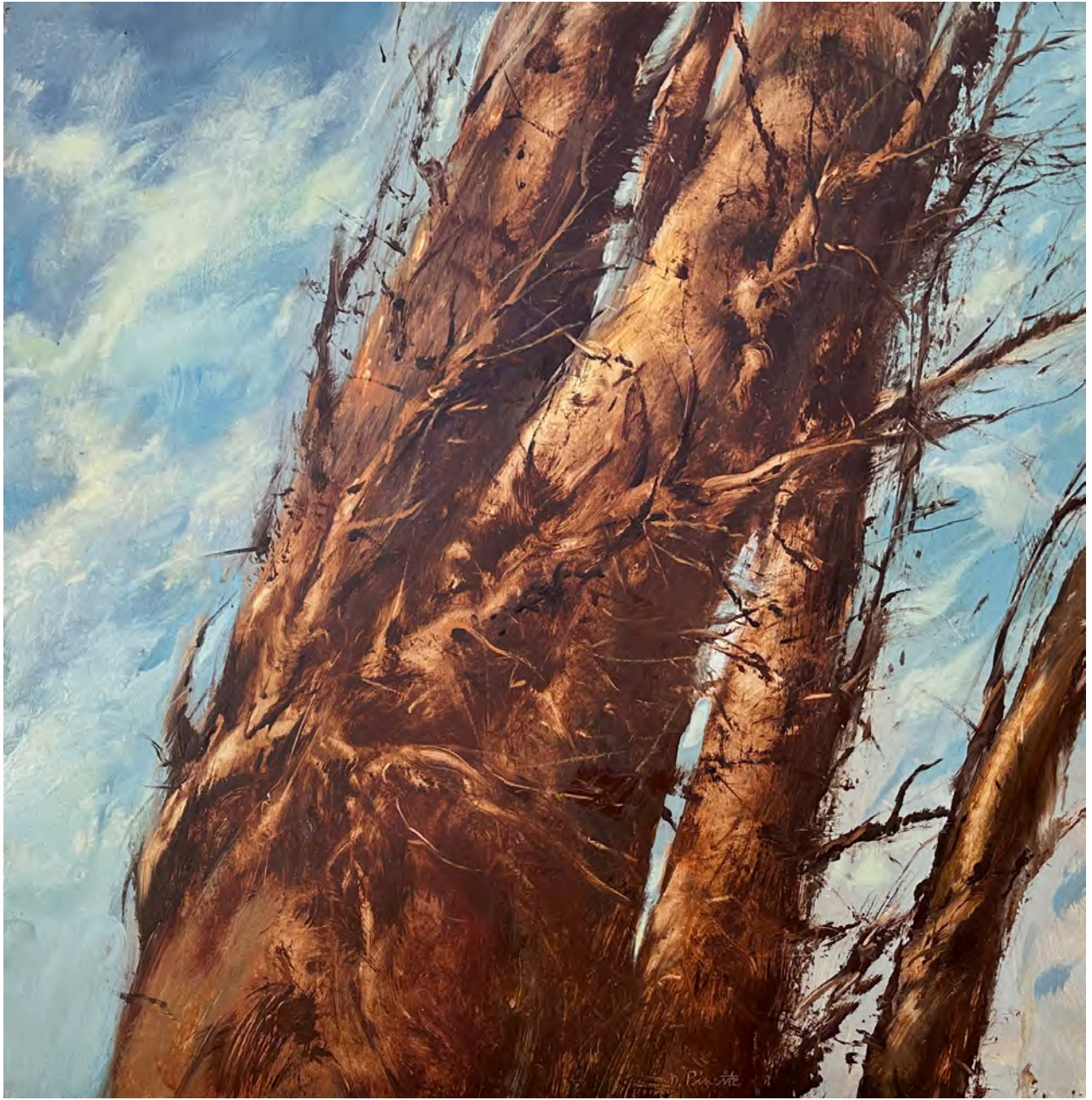
NOVEMBER WIND #3 2000 oil on rag mounted on canvas 20 x 30 inches