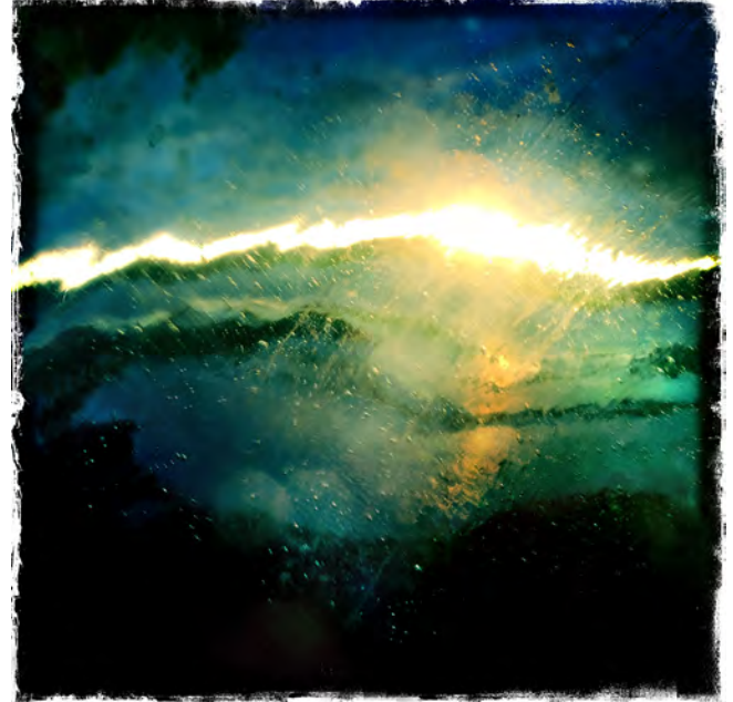
STELLAR PERFORMANCE archival pigment print 7 1/2 x 7 1/2 inches