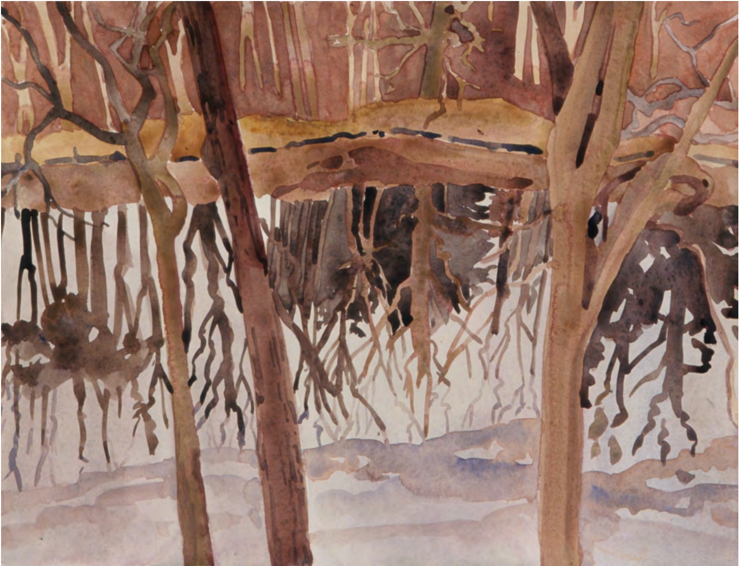
WINTER TREES REFLECTED 2013 watercolor 12 x 16 inches