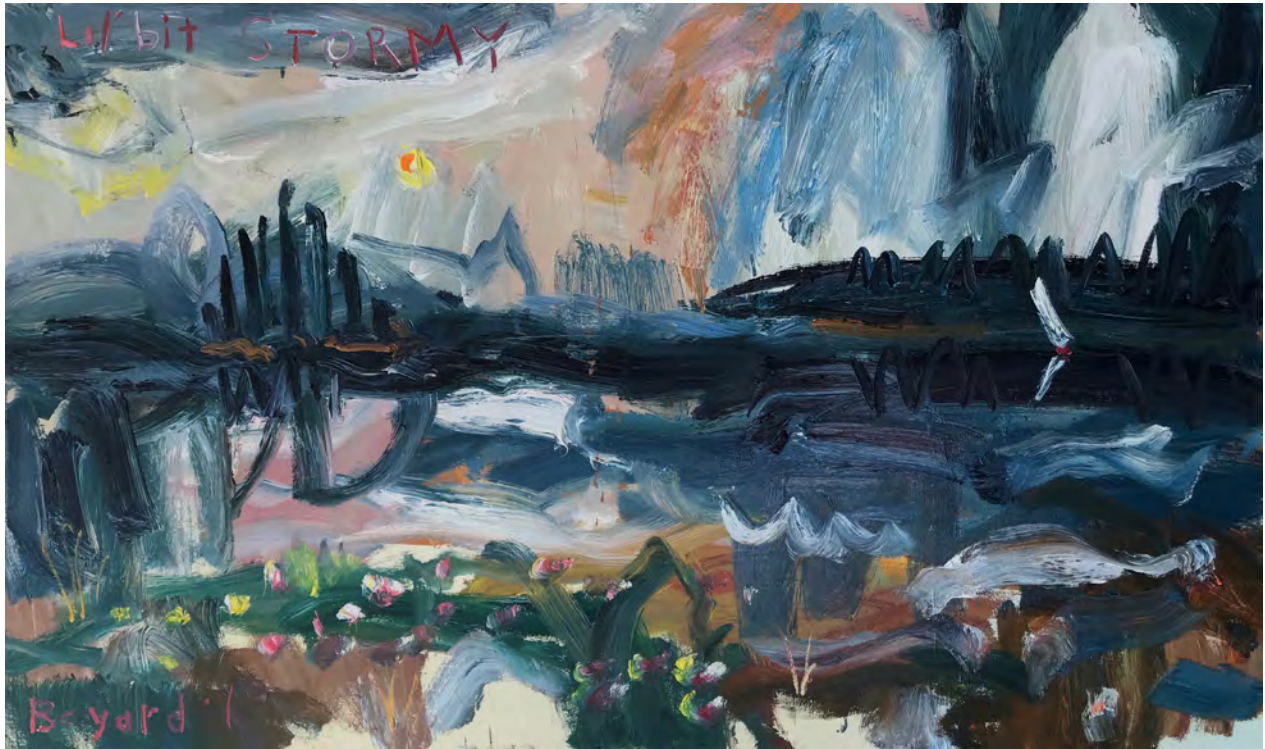
LIL' BIT STORMY 2019 oil on canvas 36 x 60 inches