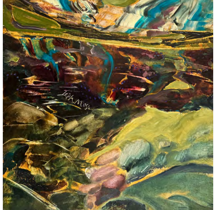
IRISH MOSS INTERTIDAL 2023 oil on panel 12 x 12 inches