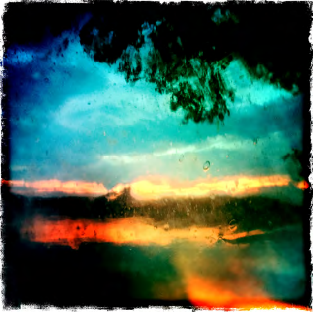
AFTERGLOW archival pigment print 7 1/2 x 7 1/2 inches