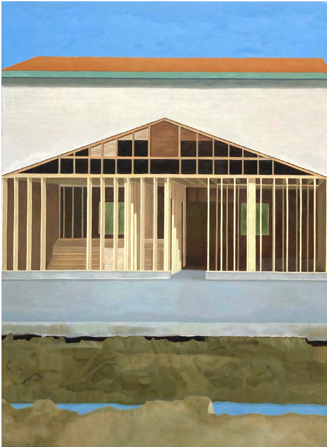
RENOVATION IN WOOLWICH #2 2024 oil on canvas 36 x 26 1/2 inches