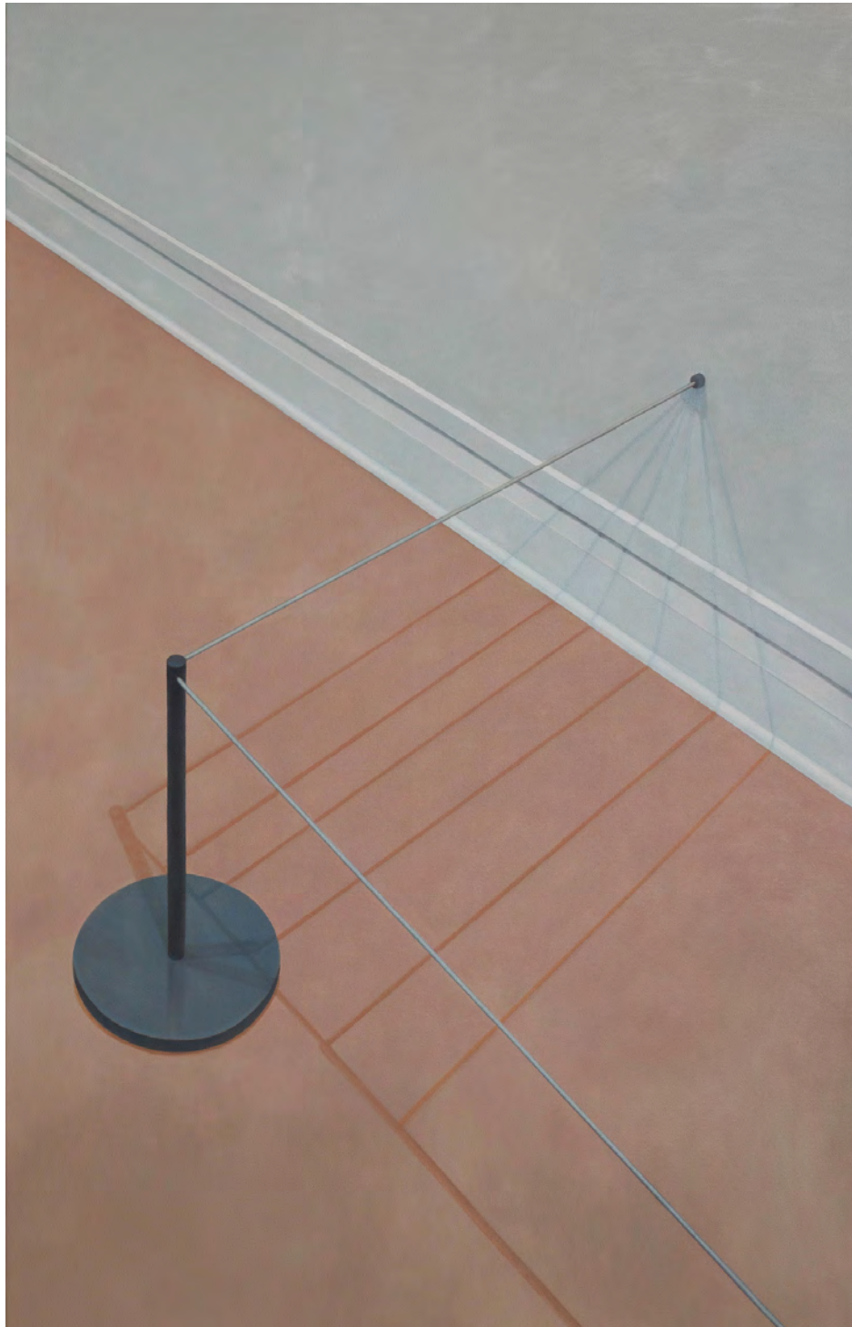
WITHOUT FRED SANDBACK 2022 oil on canvas 44 x 28 inches