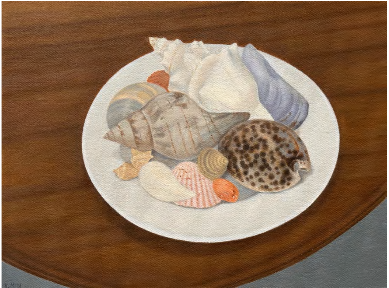
SHELL DISH 2023 oil on panel 9 x 12 inches