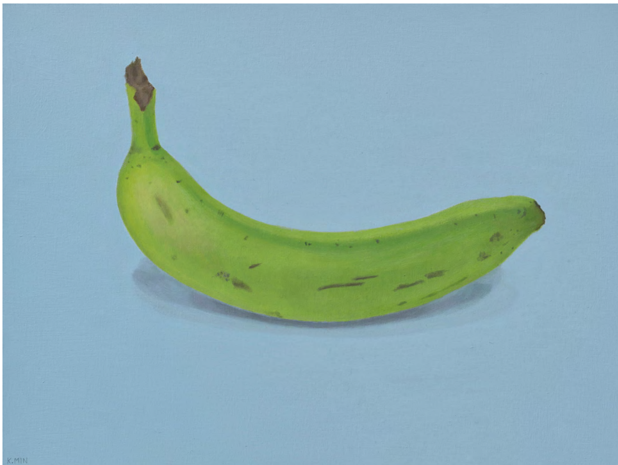
MATURING #6 (Youth) 2023 oil on panel 9 x 12 inches