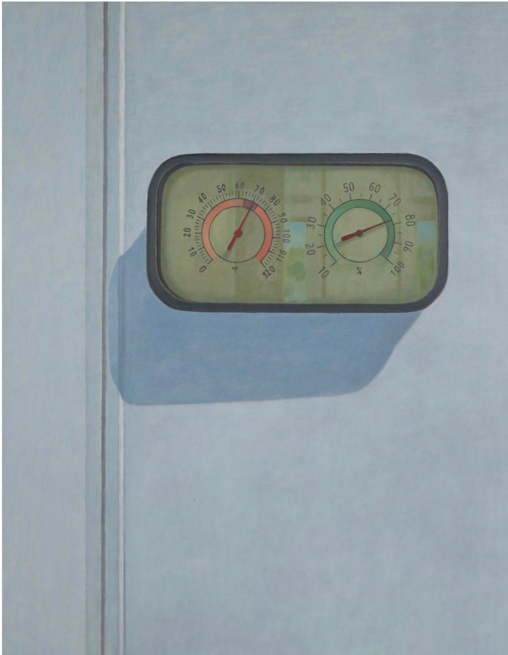
PERFECT CONDITION 2022 oil on panel 18 x 14 inches