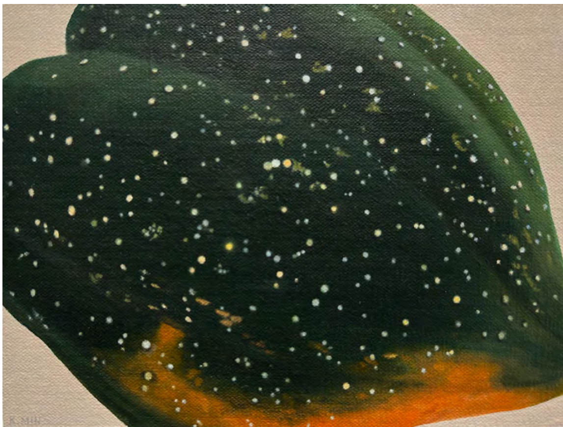
EDIBLE UNIVERSE #1 2024 oil on canvas mounted on panel 6 x 8 inches