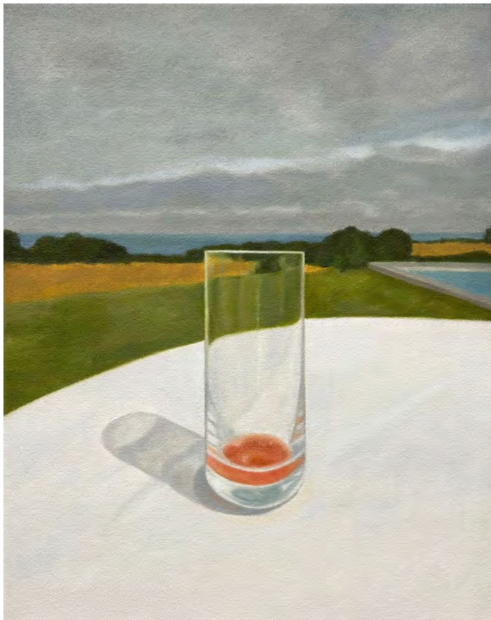
AFTER THE WEDDING 2024 oil on canvas 14 x 11 inches