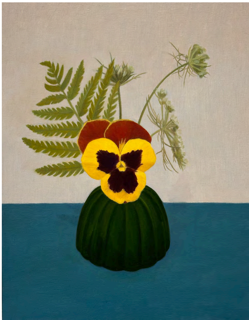
ROUSSEAU 2024 oil on panel 12 x 9 inches