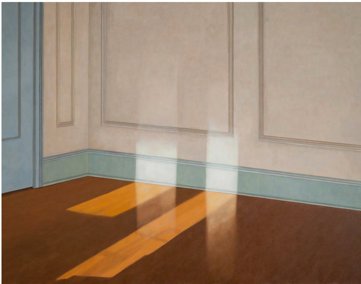
NEW YORK MORNING 2022 oil on canvas 36 x 46 inches