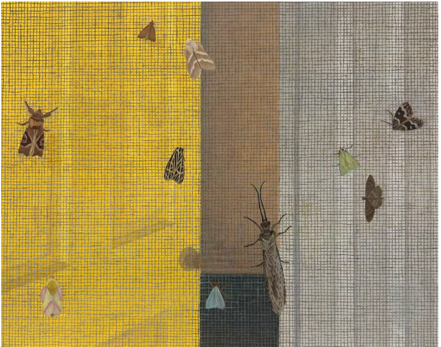
SUMMER #70 (Nap) 2024 oil on panel 11 x 14 inches