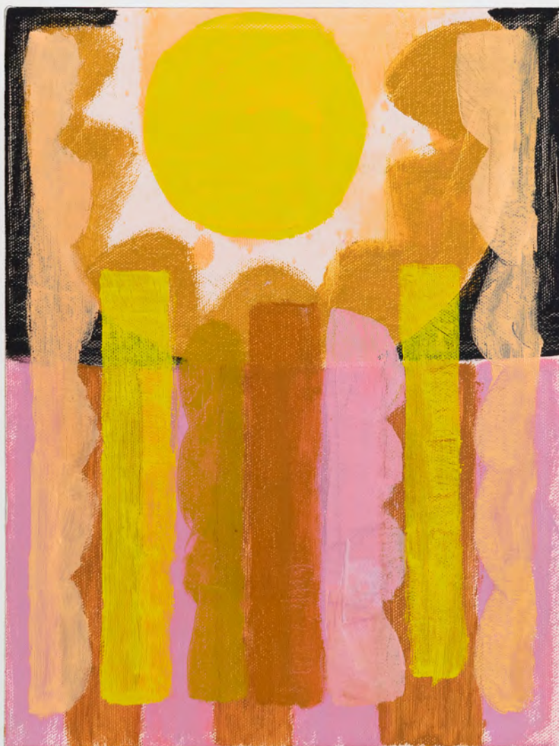
WHAT WE KNOW 2025 oil and acrylic on canvas 12 x 9 inches