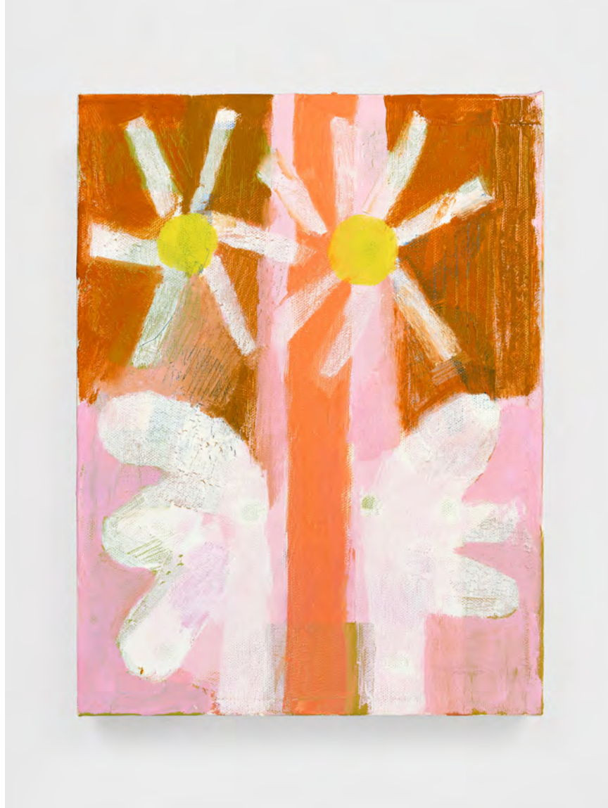
EYE TO EYE 2025 oil and acrylic on canvas 12 x 9 inches