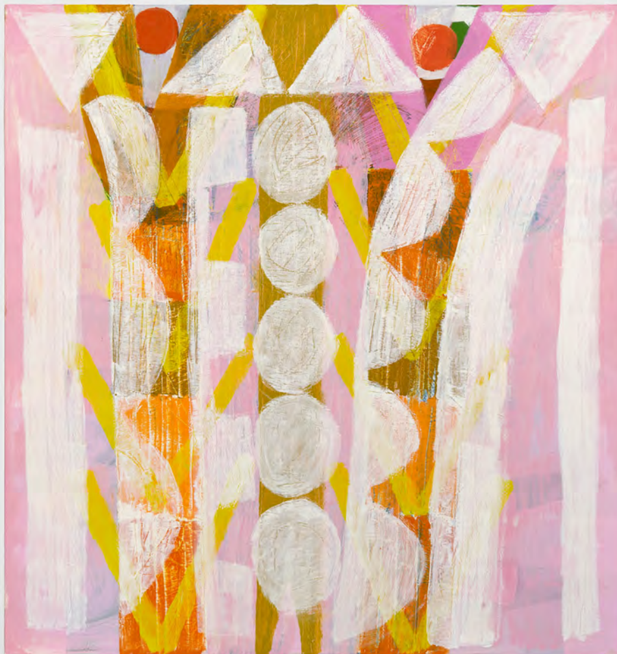
NEW CITIZEN 2025 oil and acrylic on canvas 40 x 38 inches