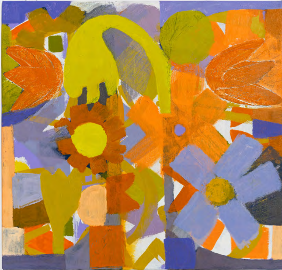
I REMEMBER MORNINGS 2025 oil and acrylic on canvas 20 x 21 inches