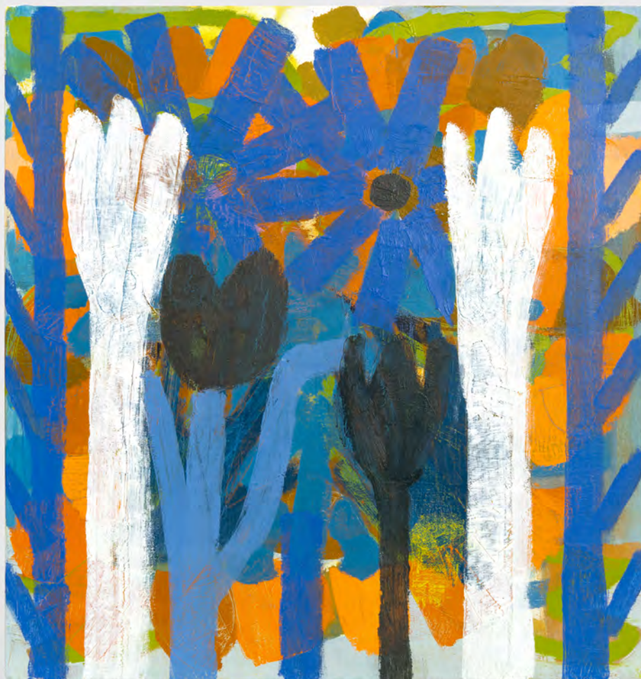
THE RENTERS 2025 oil and acrylic on canvas 21 x 20 inches