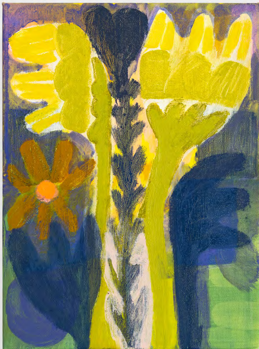
JUST HATCHING 2025 oil and acrylic on canvas 12 x 9 inches