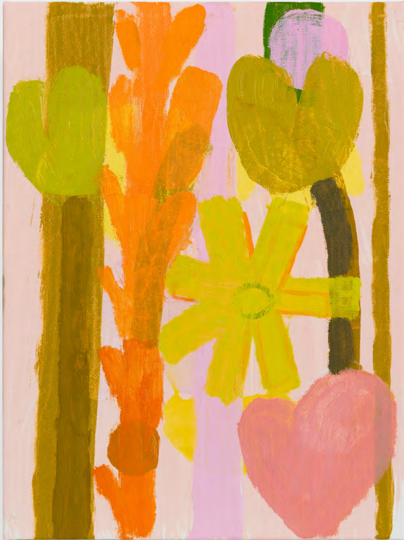
IDLE 2025 oil and acrylic on canvas 12 x 19 inches