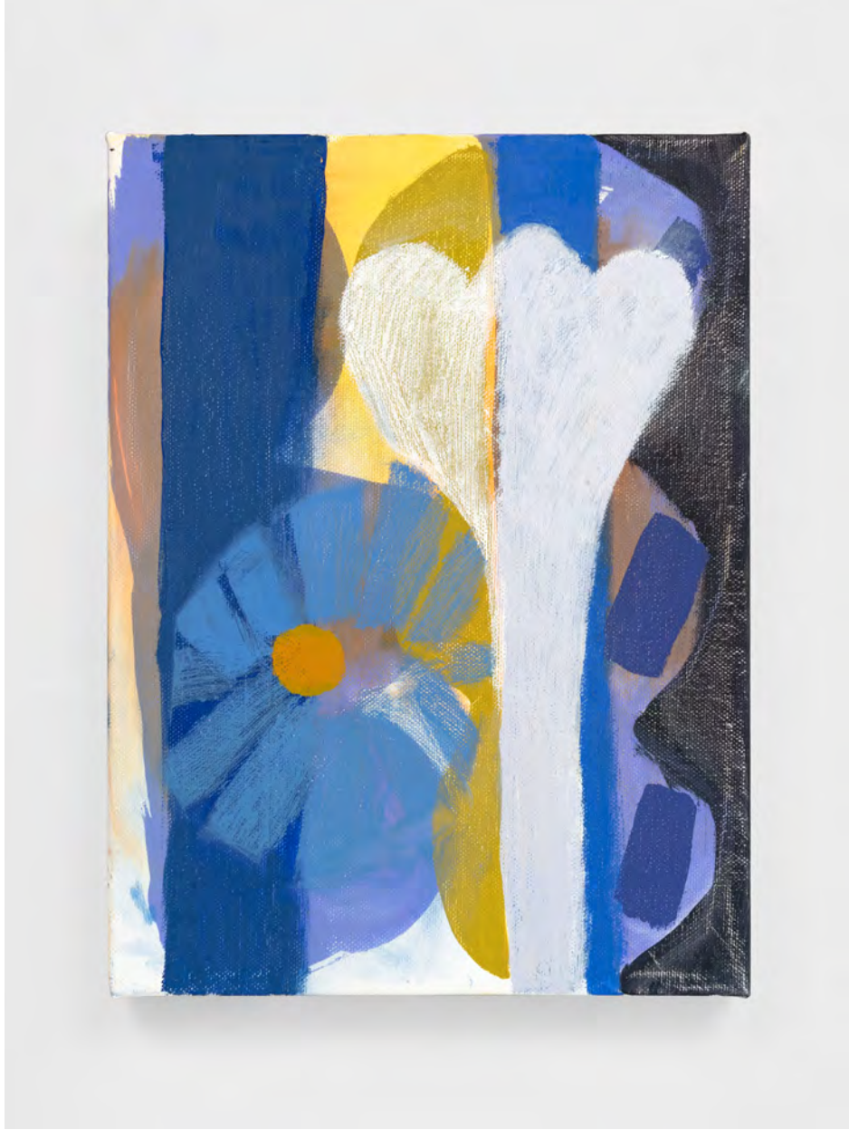
WINTER COAT 2025 oil and acrylic on canvas 12 x 9 inches