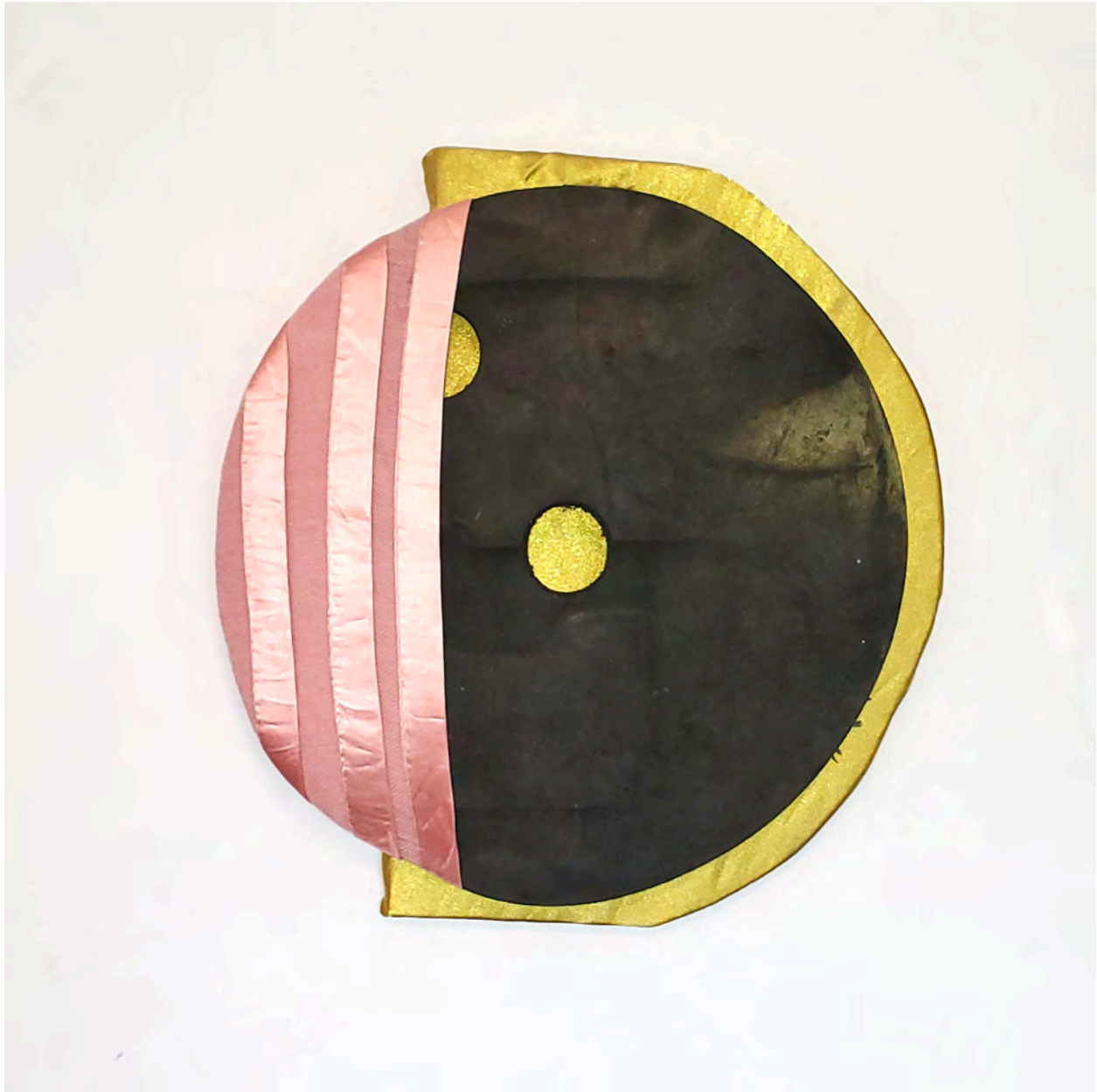
MATERIAL CLASSIFICATION-DECO SET-FORWARD MOTION 2025 rock hopper, wool blanket, silk on board 16 x 15 x 3 inches