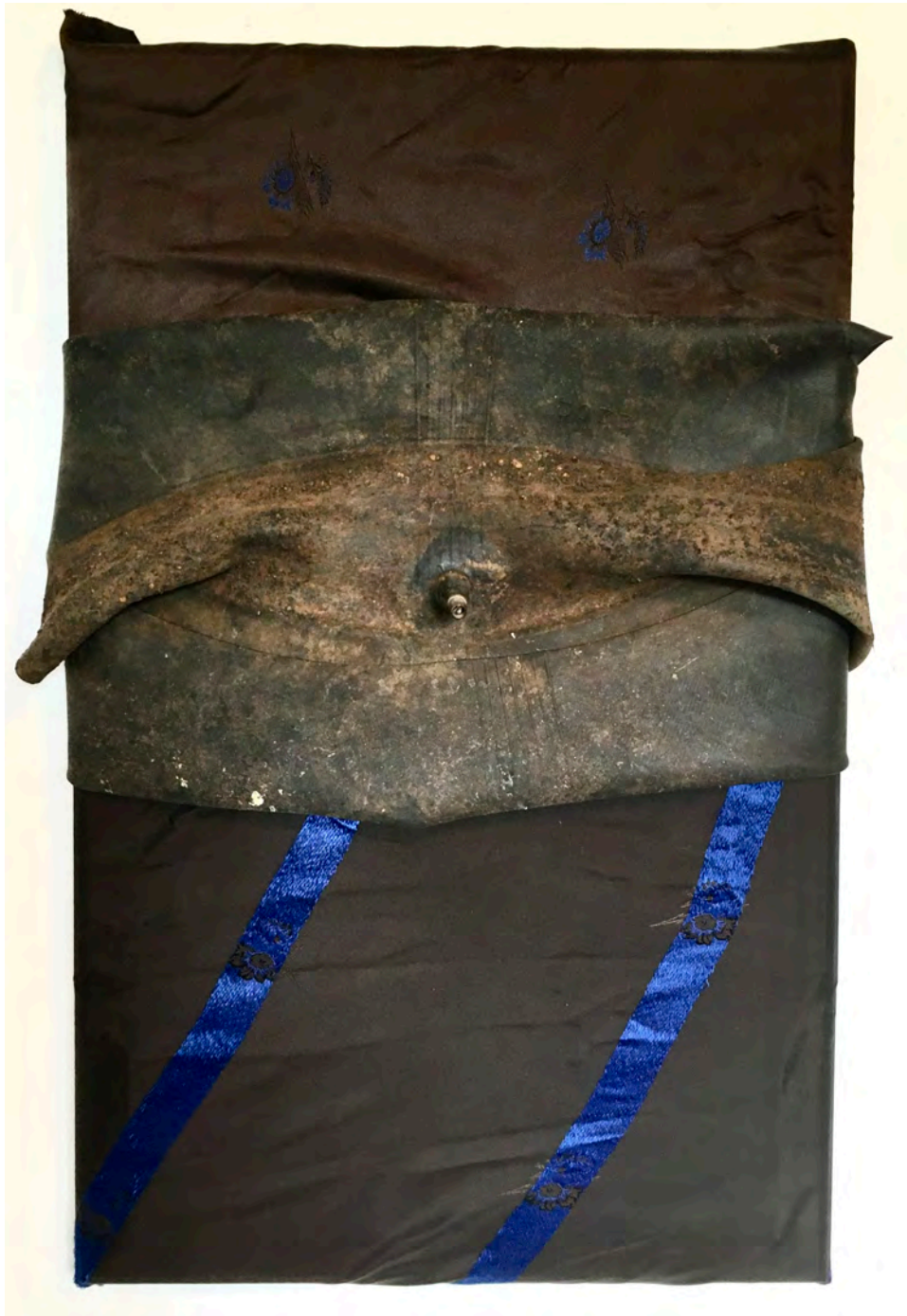
CLASS SERIES-THE UNSEEN 2025 found fur coat, found truck tire inner tube on board 24 x 16 x 3 inches