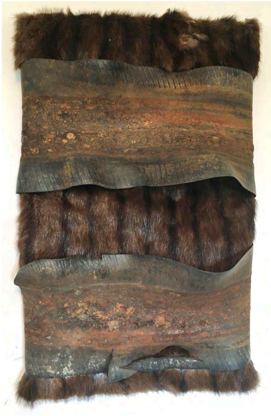
CLASS SERIES-UPPER LOWER UPTOWN DOWNTOWN 2025 found fur, found rubber on board 25 x 16 x 2 inches