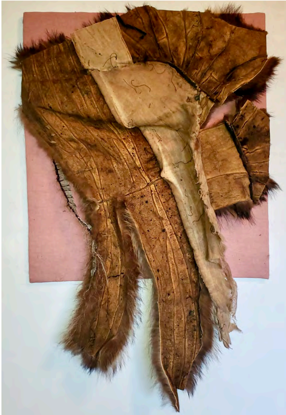
MARIA VON TRAPPED 2025 found fur coat, found wool blanket on board 32 x 21 x 3 inches