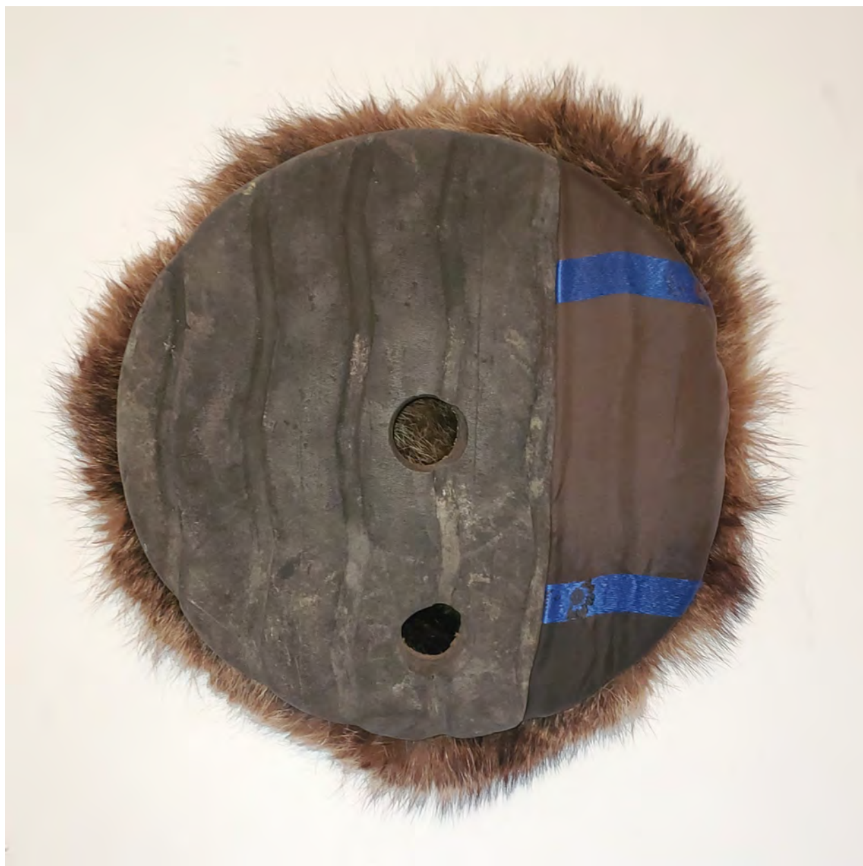
MATERIAL CLASSIFICATION-ABOVE/BELOW 2025 rock hopper, fur, lining 18 x 18 x 4 inches