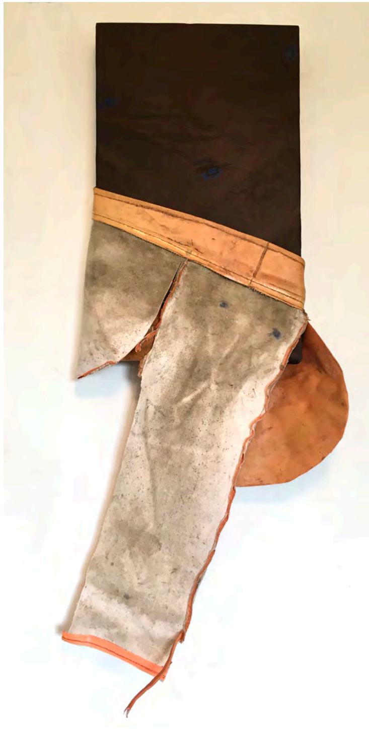
CLASS SERIES-CLASS I.D./INTERIOR DESIGN 2025 found fur coat lining, rain jacket on board 29 x 13 x 3 inches