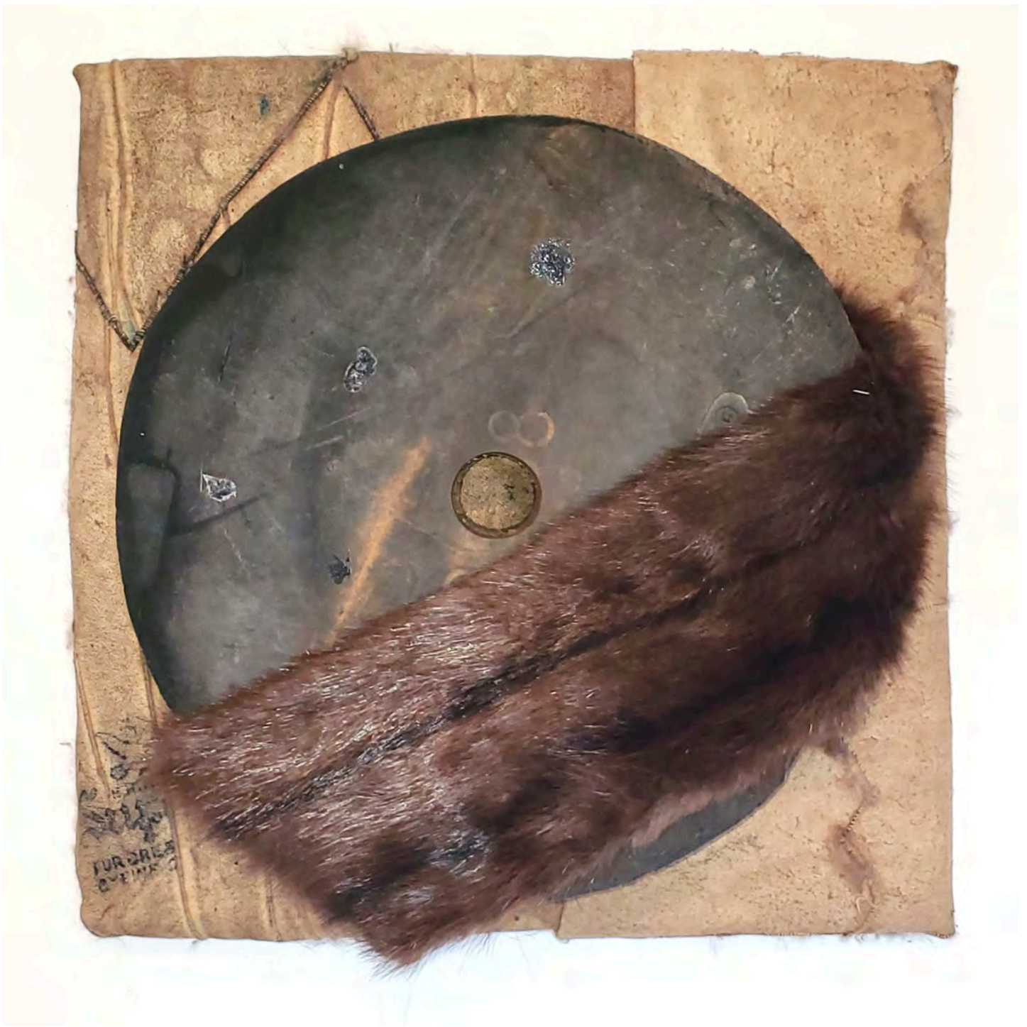
MATERIAL CLASSIFICATION-DEFENDER 2025 rock hopper, fur on board 15 x 15 x 3 inches