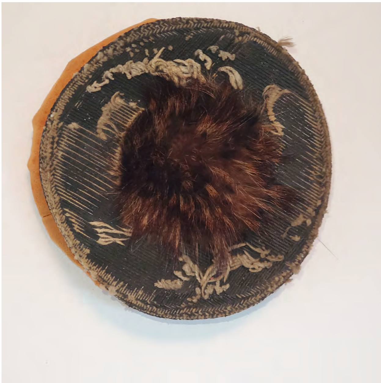
MATERIAL CLASSIFICATION-SEA ANENOME 2025 rock hopper, found fur, found suede 6 x 6 x 3 inches