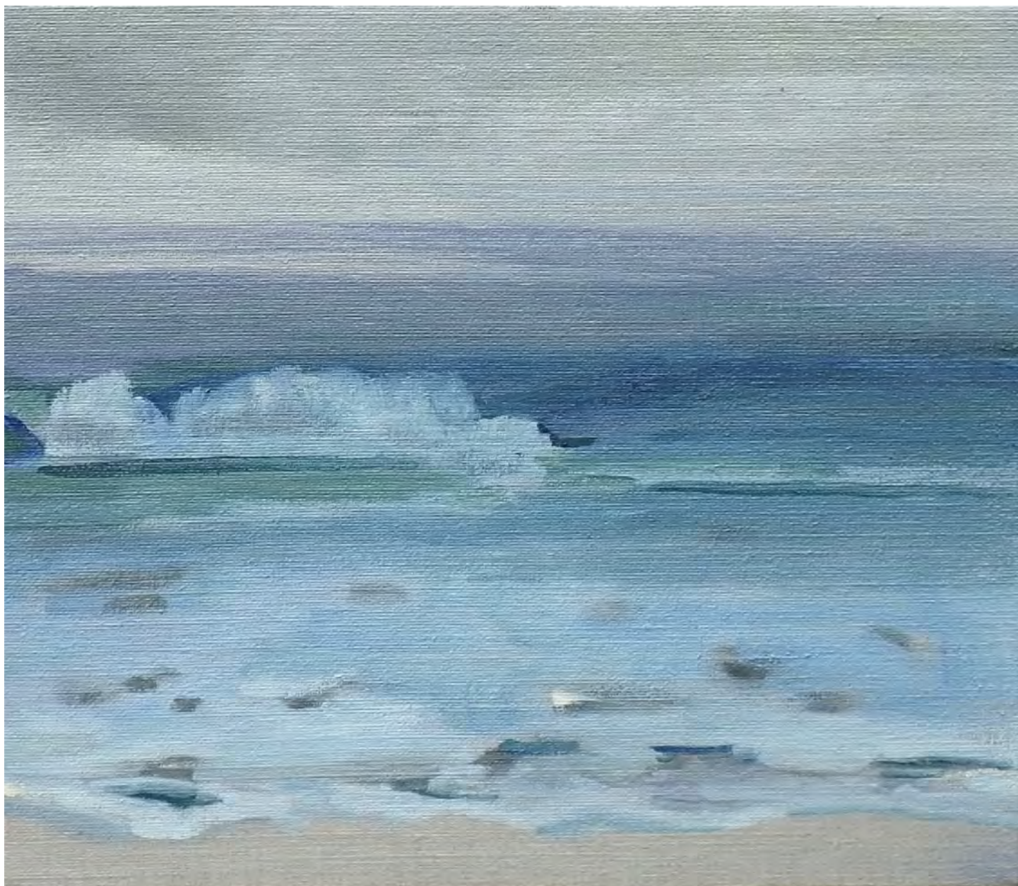
WAVE 2, AZORES 2025 oil on linen 12 x 14 inches