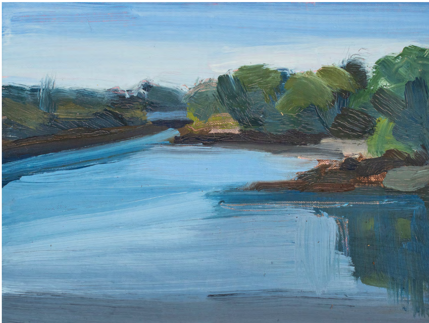
ELI'S COVE 2024 oil on linen panel 6 x 8 inches