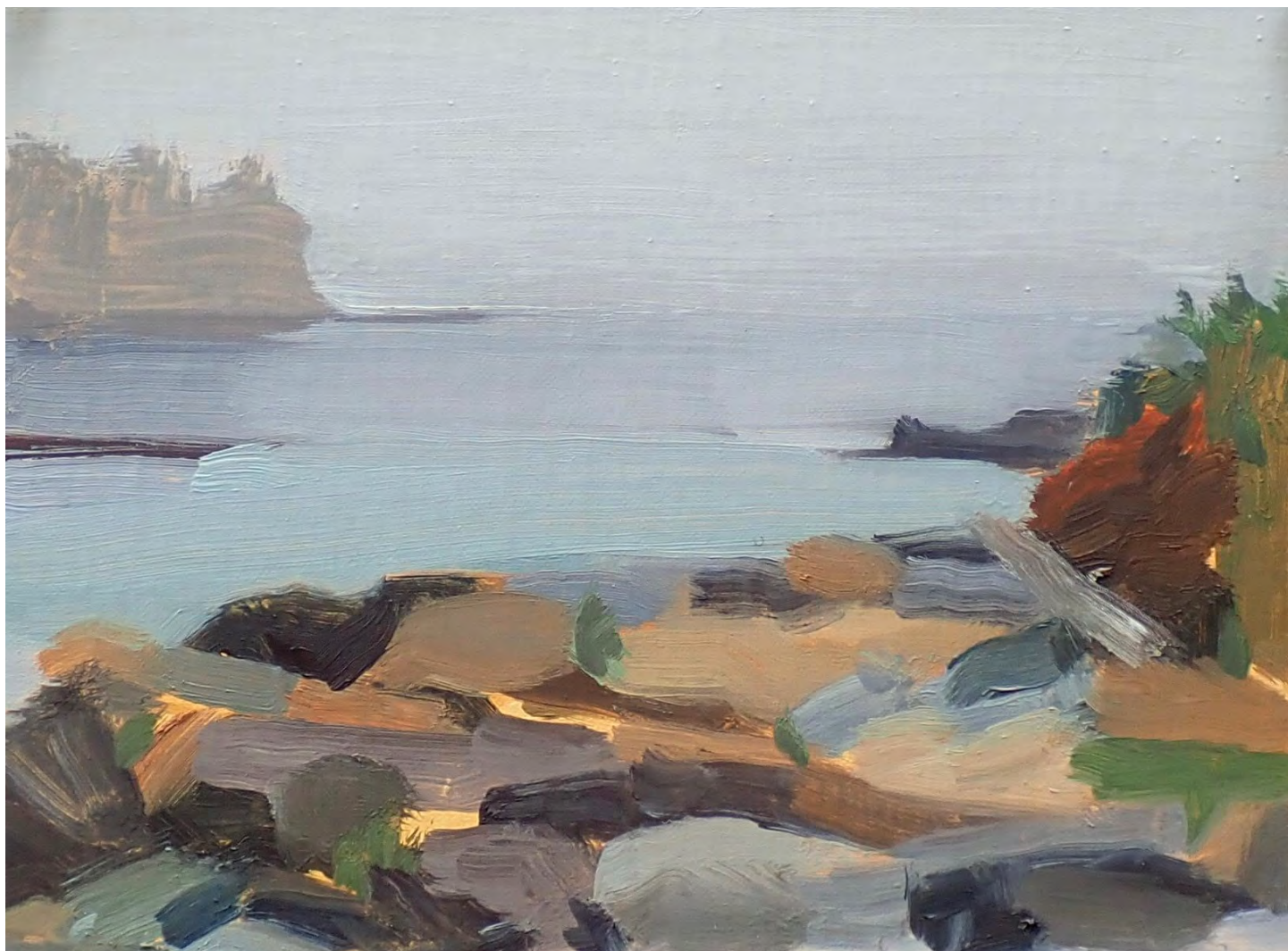
FOG, GREAT SPRUCE HEAD ISLAND 2025 oil on linen panel 6 x 8 inches