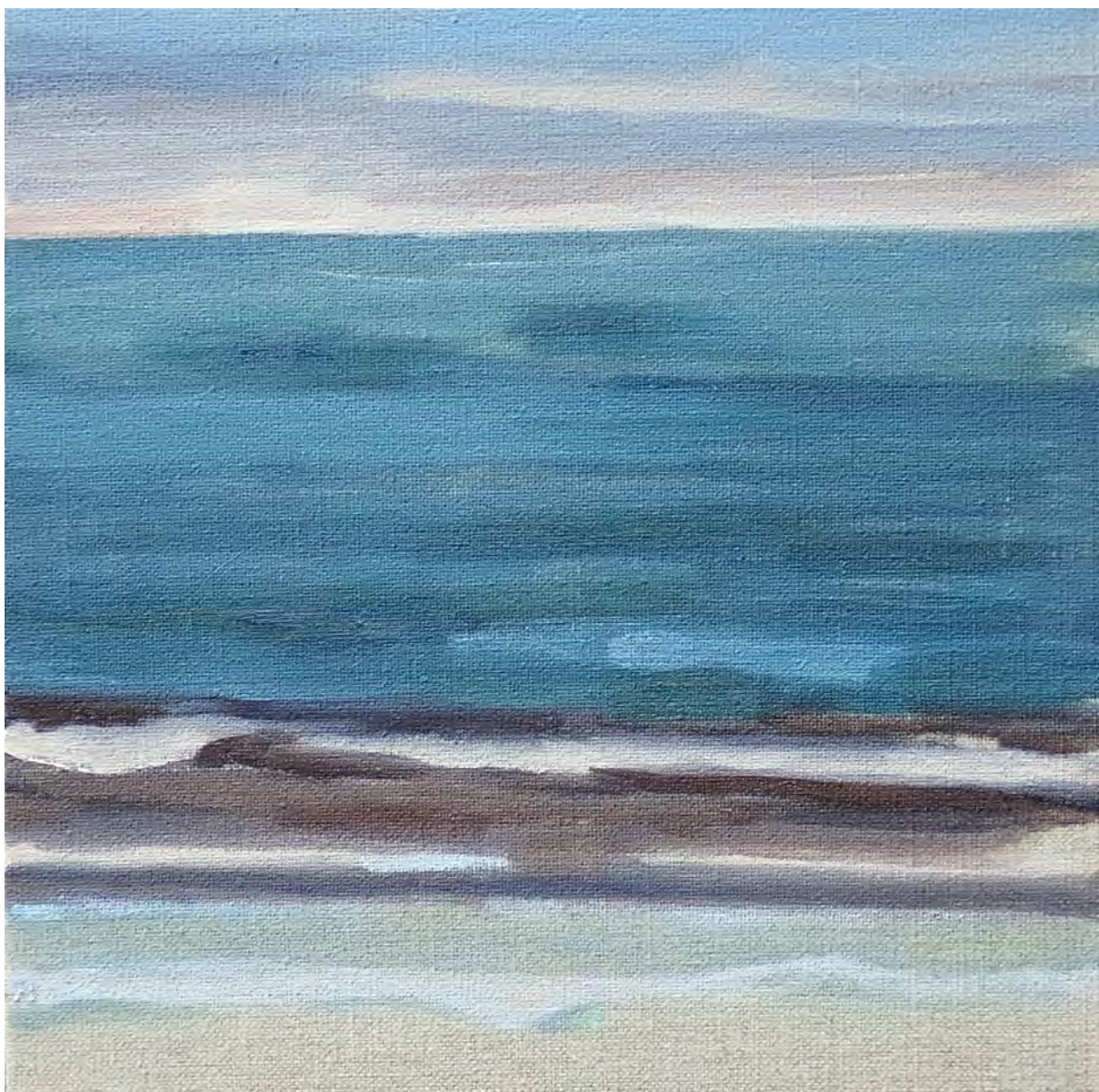
WAVE I, AZORES oil on linen 12 x 12 inches