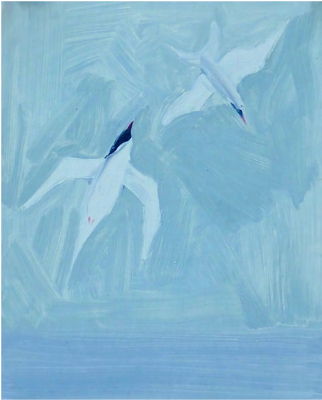
ARCTIC TERNS, GREAT SPRUCE HEAD ISLAND 2024 oil on linen panel 10 x 8 inches