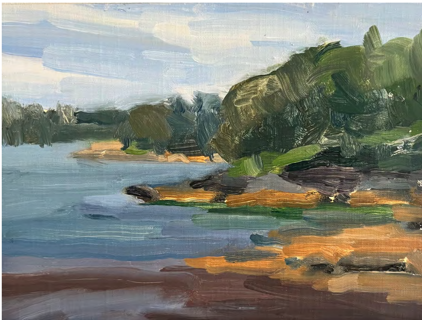
NANCY'S COVE 2 oil on linen panel 6 x 8 inches